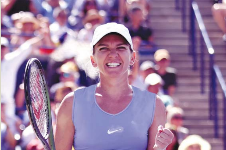
Romania's Simona Halep celebrates winning the National Bank Open in Toronto, Canada, in August 2022.

Florida resident Coco Gauff, who reached the Indian Wells semi-finals, will enjoy plenty of crowd support as she returns to Miami for the first time since her triumph at last year's US Open. On the men's side, Carlos Alcaraz will also chase the final piece of the Sunshine Double after a successful title defence at Indian Wells where he beat reigning Miami Open champion Daniil Medvedev in a rematch of the 2023 California final. While the Miami men's draw is stacked, one notable absence will be world number one and six-times champion Novak Djokovic, who expressed a desire to limit the number of events he plays at this stage of his decorated career. The 36-year-old Djokovic is still without a trophy this year having represented Serbia at the United Cup before reaching the Australian Open semi-finals and suffering a shock third round exit at Indian Wells.