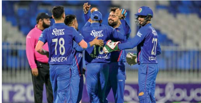
Afghanistan's players celebrate winning the third Twenty20 International against Ireland at the Sharjah Cricket Stadium in Sharjah yesterday.