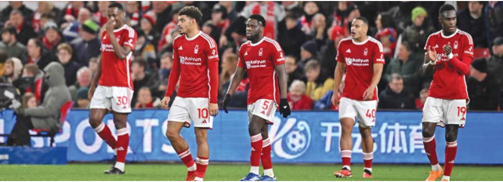
Nottingham Forest had admitted breaching the profitability and sustainability rules.