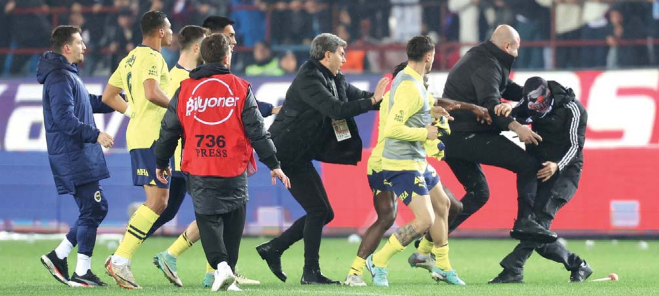
A Trabzonspor fan invades the pitch and clashes with Fenerbahce players and security staff after the Super Lig match.

Turkish police detained 12 fans following the incident, Interior Minister Ali