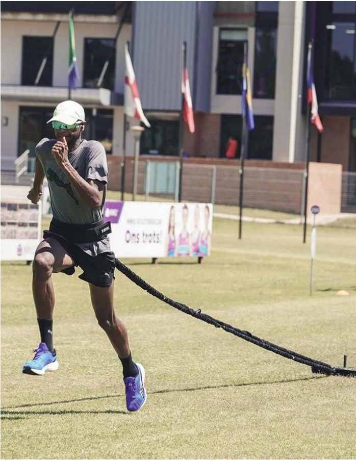
Mutaz Barshim has prioritised training in the build-up to his Olympic defence later this year, not competing since winning his third Asian Games title last October.

up his first Diamond League win last season in Stockholm. Yet the Oceania record holder is quickly amassing an impressive title collection of his own. In 2022 the 27-year-old backed up World indoor bronze with Commonwealth Games gold that summer and World Indoor gold in March.