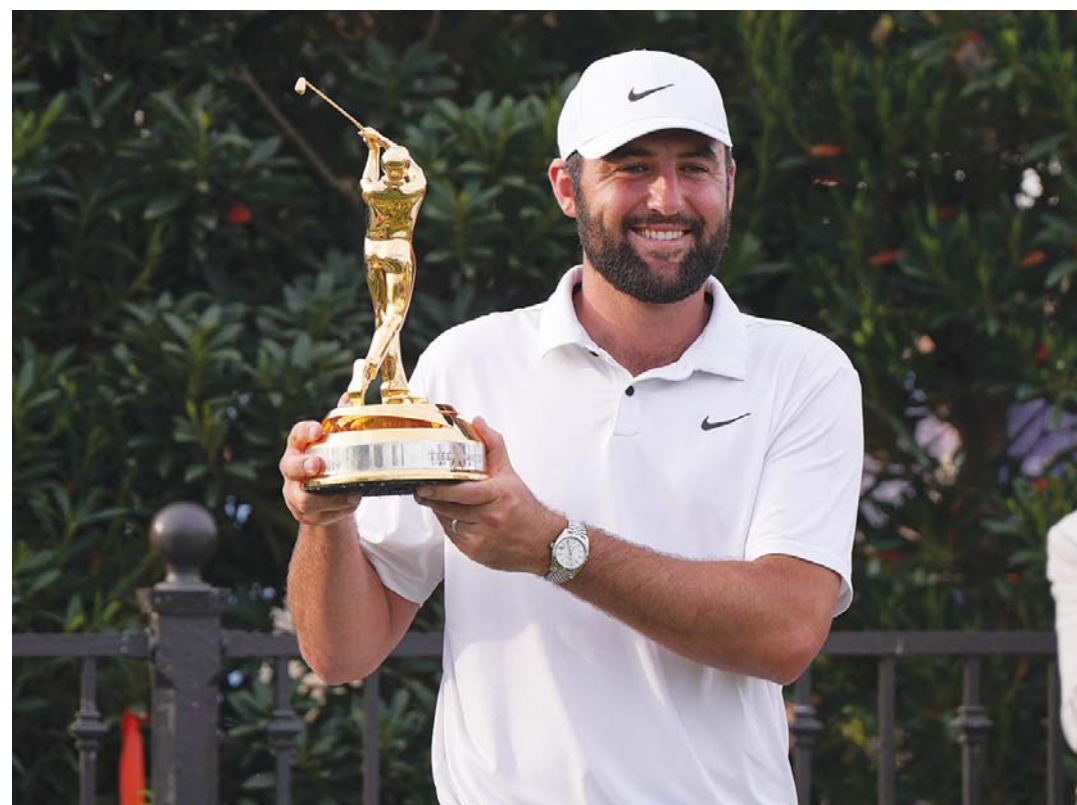
Scottie Scheffler poses with the trophy after winning The Players Championship.

"It was kind of right centre with like a foot to go, and I knew it was going to keep breaking, but it had speed and I thought it was going to good inside left, and even when it kind of lipped, I thought it would lip in.