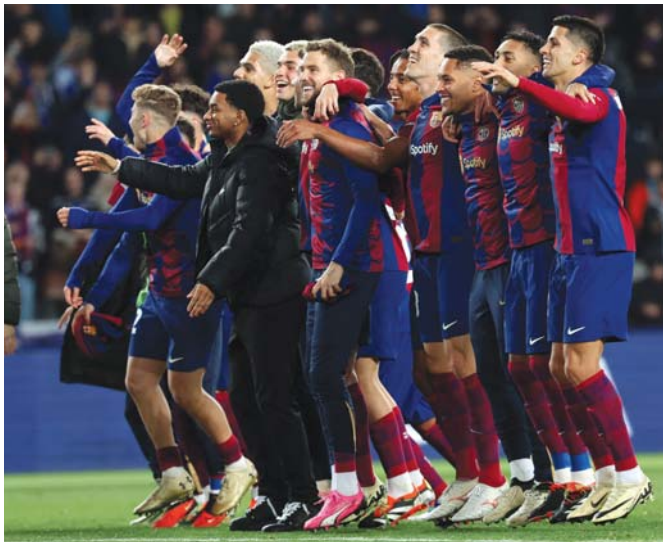
Barcelona players celebrate their win in the Champions League last 16 second leg match against Napoli in Barcelona.