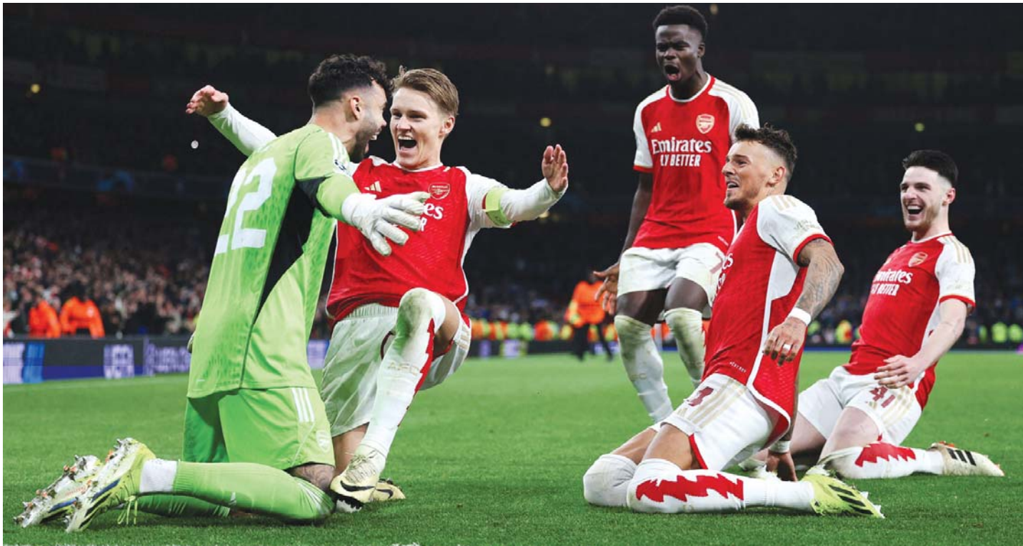
FROM LEFT: Arsenal's goalkeeper David Raya, Martin Odegaard, Bukayo Saka, Ben White and Declan Rice celebrate after winning the penalty shoot-out during the UEFA Champions League last 16 second leg match against Porto FC at the Arsenal Stadium in London.

‘THIS RESULT GIVES US A LOT OF MOMENTUM, A LOT OF BELIEF’