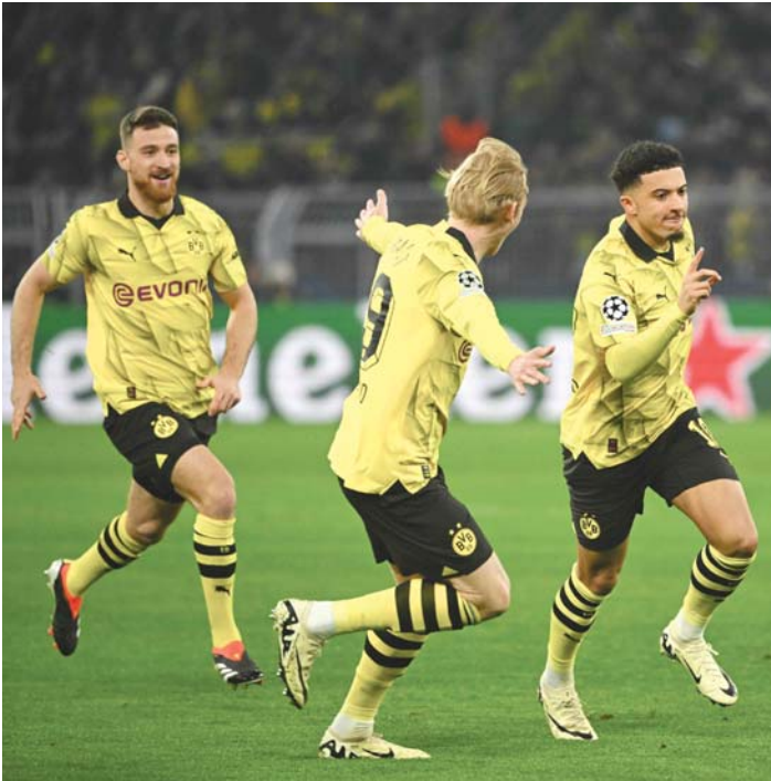
Dortmund's Jadon Sancho (right) celebrates with teammates after scoring the opening 1-0 goal during the UEFA Champions League last 16, second-leg match against PSV Eindhoven in Dortmund yesterday.

A third-minute goal from Jadon Sancho and Marco Reus' late strike sent Borussia Dortmund through to the Champions League last eight with a 2-0 win yesterday, sealing a 3-1 aggregate victory. Level at 1-1 after the last-16 first leg in the Netherlands, Sancho wasted no time in putting Dortmund ahead at the Westfalenstadion with a low shot from outside the area - his first Champions League goal since November 2021. Dortmund were shaky despite the early lead and needed a fair share of luck and some poor PSV finishing to progress, with Hirving Lozano's 53rd-minute effort hitting the post. PSV pushed forwards in stoppage time looking for an equaliser but instead gave away another goal, as Isaac Babadi's unfortunate slip allowed Reus to seal the win. The 1997 winners did enough against an outclassed PSV but will face stiffer challenges as they return to the quarter-final draw, to be held on Friday, for the first time since 2021. Dortmund, 20 points behind Xabi Alonso's unbeaten leaders Bayer Leverkusen in the Bundesliga and out of the German Cup, came into the game knowing the Champions League was their only