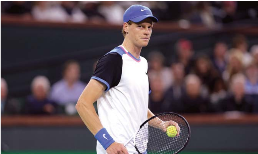
Jannik Sinner of Italy gestures to his corner while playing Ben Shelton of the United States during the BNP Paribas Open at Indian Wells Tennis Garden in Indian Wells, California. Right: Iga Swiatek of Poland plays a backhand against Yulia Putintseva of Kazakhstan in their fourth round match.

D efending champion Carlos Alcaraz and Italian rival Jannik Sinner remained on course for a semi-final showdown after cruising into the last eight of the ATP-WTA Indian Wells Masters. Alcaraz sailed into the last eight as he took revenge on Hungary's Fabian Marozsan with a 6-3, 6-3 victory. In-form Sinner meanwhile booked his last eight berth with a 7-6 (7/4), 6-1 defeat of Ben Shelton. Sinner's win was his 18th straight victory dating to late last season, leaving him three wins away from his third title of the season after winning the Australian Open and Rotterdam. "I played really well in the tight moments," the 22-year-old world number three said as he lines up against Czech Jiri Lehecka in the quarters. "I knew I would not get much rhythm from him. I can be proud of how I played. The wind didn't make it easier but I tried to stay positive and it worked out." Sinner could face Spain's reigning Wimbledon champion Alcaraz in the semi-finals in California in what would be the latest instalment of a burgeoning rivalry. The duo fought an epic US Open quarter-final in 2022 and met in the semi-finals at Indian Wells and Miami Masters events last season. Alcaraz must navigate a quarter-final against sixth seed Alexander