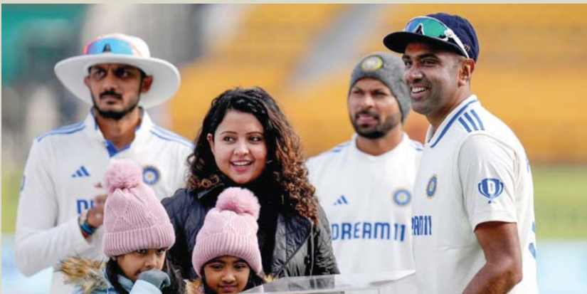
India's Ravichandran Ashwin with his family after receiving his 100th Test cap in Dharamsala on March 7.

Dubai: India's Ravichandran Ashwin reclaimed the top spot in the Test bowler's rankings yesterday following his nine-wicket haul in the fifth and final Test against England last week. It was a memorable 100th Test match in Dharamsala for India's spin spearhead, who finished as the leading wicket-taker of the series with 26 dismissals. Ashwin, who claimed his 500th Test wicket in the third test in Rajkot, replaced team mate Jasprit Bumrah at the top of the test rankings. Bumrah slipped to third place behind Australia's Josh Hazlewood, who moved up two rungs after claiming six wickets in the second test against New Zealand. It was the sixth time in his career that Ashwin rose to the top spot in ranking and it was an eventful series against England for the 37-year-old. The off-spinner temporarily withdrew