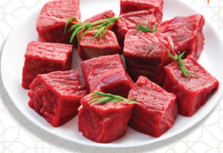
قطع لحم بقري جنوب افريقي ا كيلو QAR 39.75 Beef Cubes