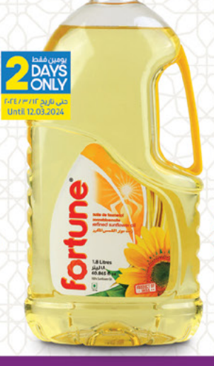
QAR 14.00 فورتشن زيت دوار الشمس ۱،۸ لتر Fortune Sunflower Oil 1.8ltr