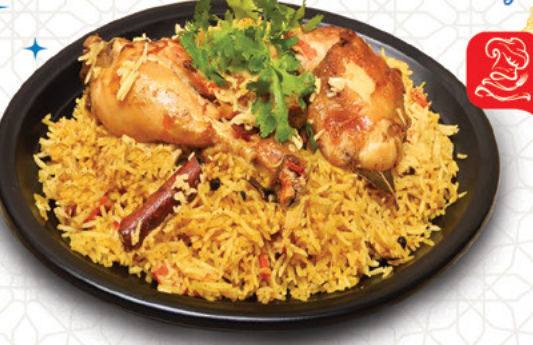
Chicken 75 Chicken Majboos 500gm