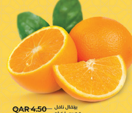
برتقال نافل مصري اکيلو Navel Orange Egypt 1kg