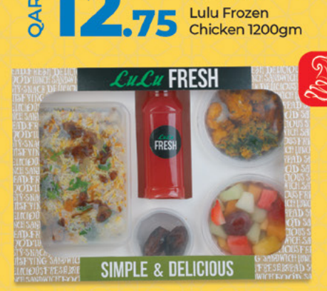
كومبو وجبة دجاج للإفطار Iftar Chicken Meal Box