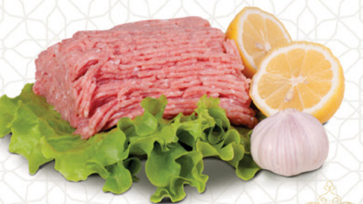
لحم خروف عربي مفروم ا کیلو QAR 59.75 Arabic Lamb Mince