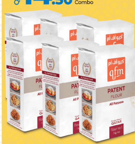
QAR 27.00 كيو أف أم دقيق رقم ١ QFM Flour No.1 1kg X 6pcs