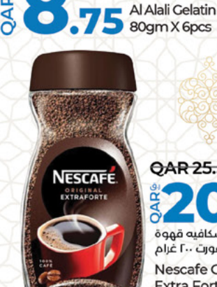
QAR 25.50 نيسكافيه قهوة إكستراً فورت ٢٠٠ غرام Nescafe Original Extra Forte 200gm