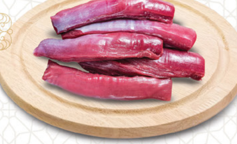
لحم ماعز تندرلوین استرالي ا کیلو QAR 89.75 Mutton Tenderloin Australia 1kg