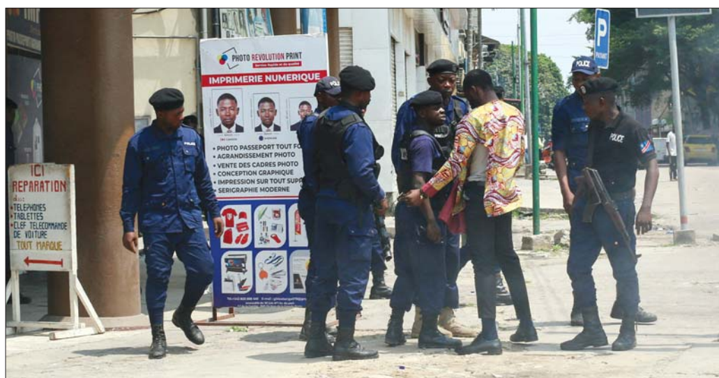
A man argues with a police officer during a protest against Western partners near the United Nations' Monusco mission headquarters in downtown Kinshasa, DR Congo, yesterday.

Communications Minister and government spokesman Patrick Muyaya took to X, formerly Twitter to accuse the Rwandan army