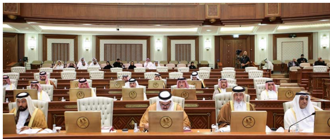
The Shura Council in session.

These axes included forming a committee for co-ordination and co-operation among the concerned authorities to reduce divorce; holding mandatory training courses for those about to get