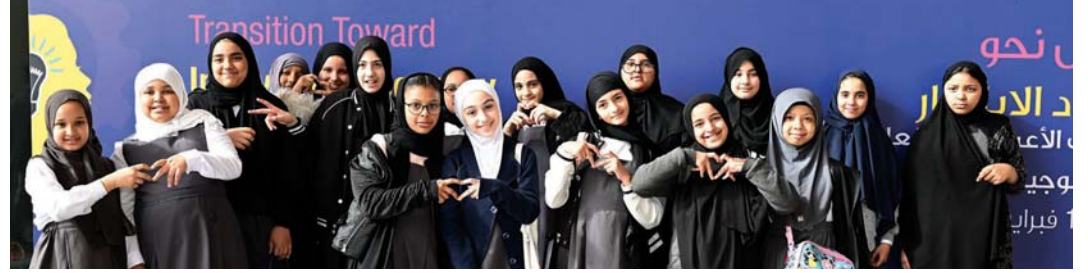
Local schoolgirls who took part in the event.

"Many faculty members today yearn to revisit and witness these images that remind them of an essential period in their academic and professional lives," she said. "The exhibition serves as a vital means to revive the collective memory of an entire generation."