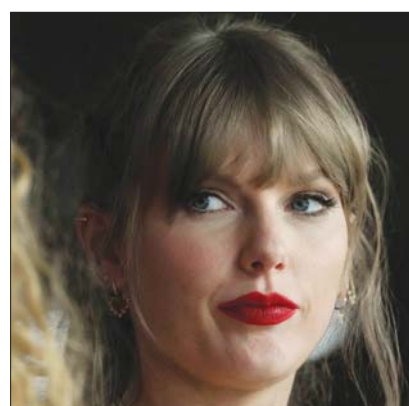
academics believe the beats of her songs could also help in the resuscitation of hearts.

Swift's role as poet, feminist icon and canny businesswoman will also be discussed. The Melbourne symposium echoes a course at Belgium's Ghent University last year that examined whether Swift is "a literary genius". One of the quirkier elements to emerge from the Melbourne conference is that