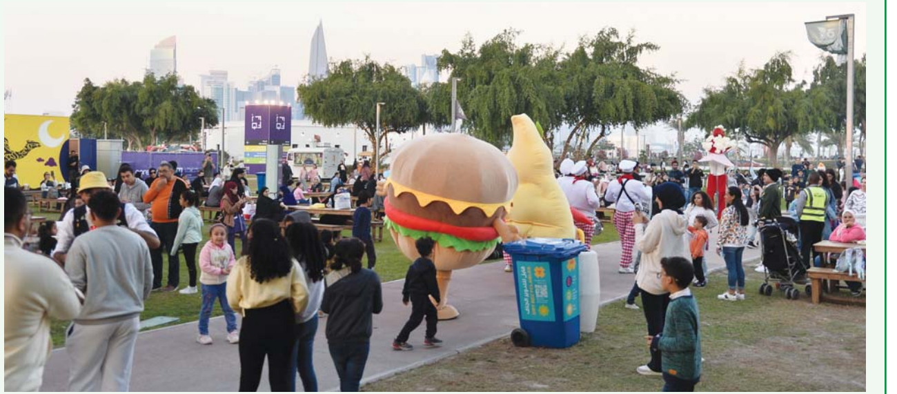
The QIFF proved to be a crowd-puller event with its array of culinary offerings and shows that cater to different age groups.

foods, promoting a community-centric atmosphere with fresh, organic produce and handcrafted goods, the organisers stated. Beyond culinary delights, the QIFF offers entertainment for all ages: from film screenings that provide a relaxing evening activity to fireworks displays in the evening. According to the QT, the festival presents nine distinct zones, each tailored to satisfy diverse palates and offer an immersive culinary journey. They are The Lounge, Dinner in the Sky, Cafes, Main Street, Garden, The Stage, Heenat Salma Bazaar, Torba Market, and Cooking Studio.