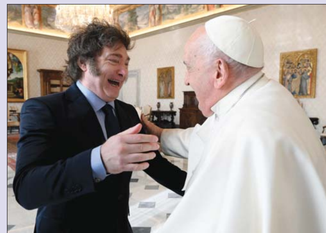
Pope Francis during a private audience with Argentinian President Javier Milei in The Vatican yesterday.

Francis had brushed off Milei's earlier criticism as rhetoric in the heat of a campaign, and called the newly elected president in November to congratulate him on his win. The president asked Francis to visit Argentina, a trip the 87-year-old pope has said he would like to make. But no date has yet been set