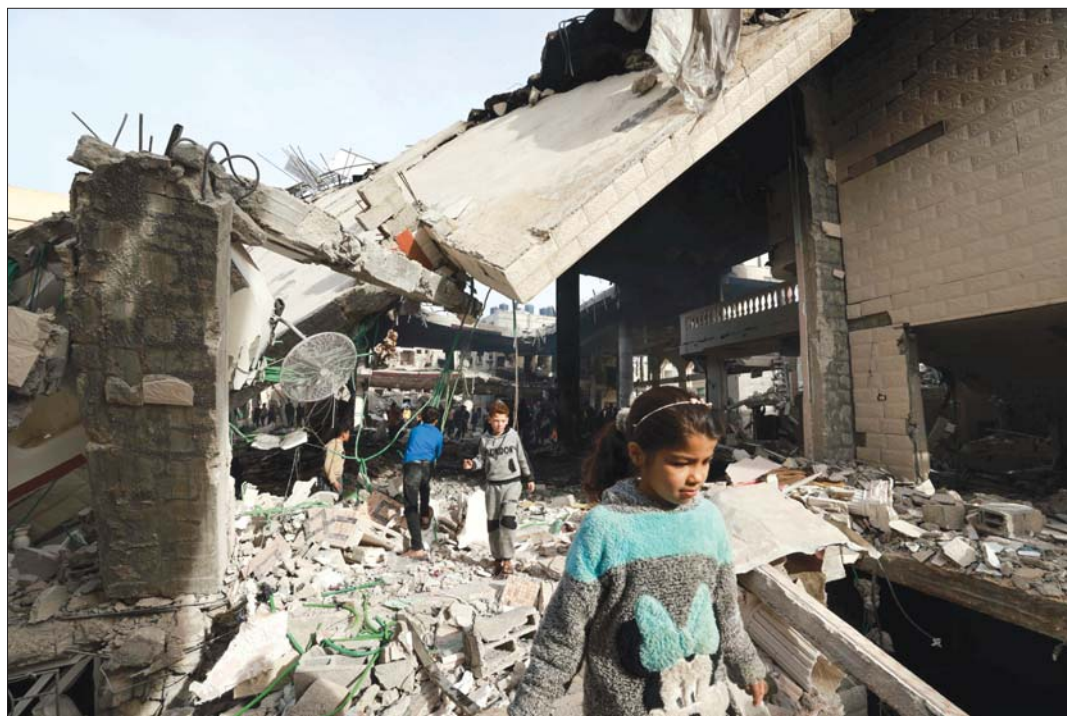
People inspect the damage in the rubble of a mosque following Israeli bombardment, in Rafah, on the southern Gaza Strip, yesterday.