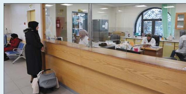
A Palestinian gets medicine in a UNRWA health centre in the Aida refugee camp in Bethlehem in the occupied West Bank.

what 75 years ago was British-ruled Palestine, fled or were expelled, many spilling into neighbouring Arab countries where their descendants remain. The tent camps they lived in after 1948 evolved into built-up townships.