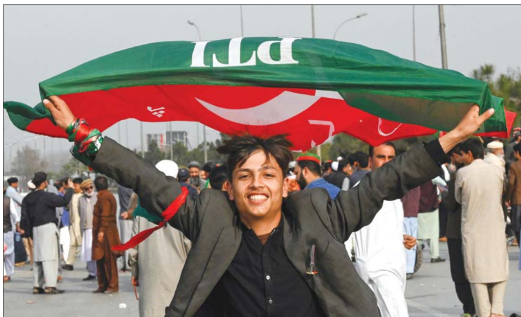
Supporters of Khan's Pakistan Tehreek-e-Insaf party block Peshawar to Islamabad Highway as they protest yesterday against the alleged skewing in Pakistan's national election results.

Earlier this month he was sentenced to lengthy jail terms after being found guilty of "treason," "graft" and having an "un-Islamic marriage" — all three sentences handed in five days flat without