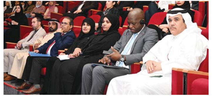
Officials at the event.