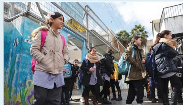
Palestinian students leave school in the Dheisheh refugee camp in Bethlehem in the occupied West Bank.

Some 700,000 Palestinians, half the Arab population of