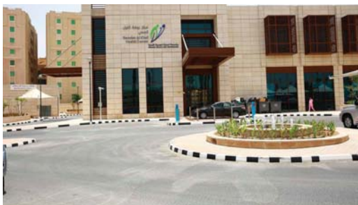
Nine health centres to remain closed today.

In the 22 other health centres, family medicine services and allied services will operate continuously from 7am-11pm, while dental services will operate continuously from 7am-10pm.