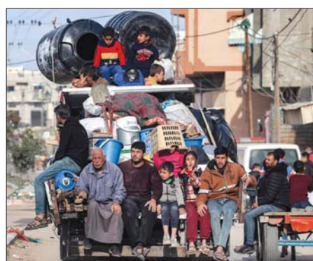
Members of a Palestinian family ride in the back of a truck with belongings as they flee Rafah, taking the coastal road north towards the central Gaza Strip yesterday.