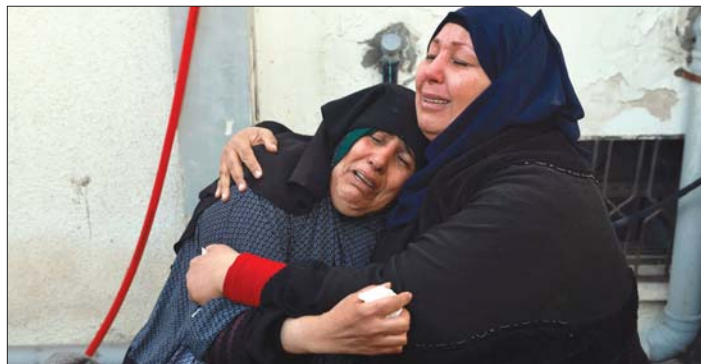
Women mourn loved ones killed during Israeli bombardment at Al-Najar hospital in Rafah, on the southern Gaza Strip, yesterday.

Israel has responded with a relentless offensive in Gaza that the Hamas-run health ministry says has killed at least 28,340 people,