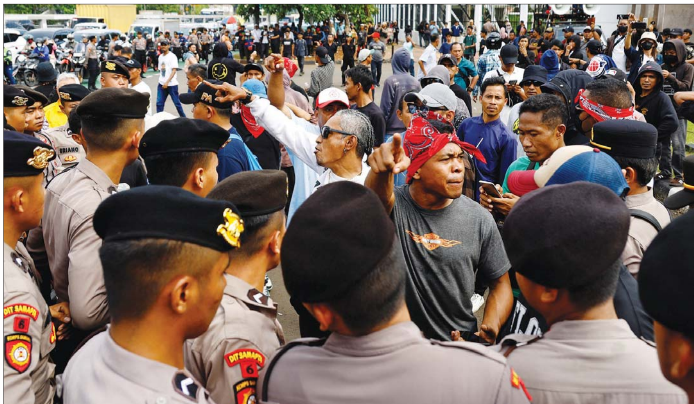
Police officers block pro-government protesters as they approach anti-government protesters holding a rally demanding a fair election, outside the Indonesian parliament in Jakarta, Indonesia, yesterday.

In November 2021, a year after protests began, Modi pushed through parliament the repeal of three contentious laws that farmers claimed would let private companies control the country's agriculture sector.