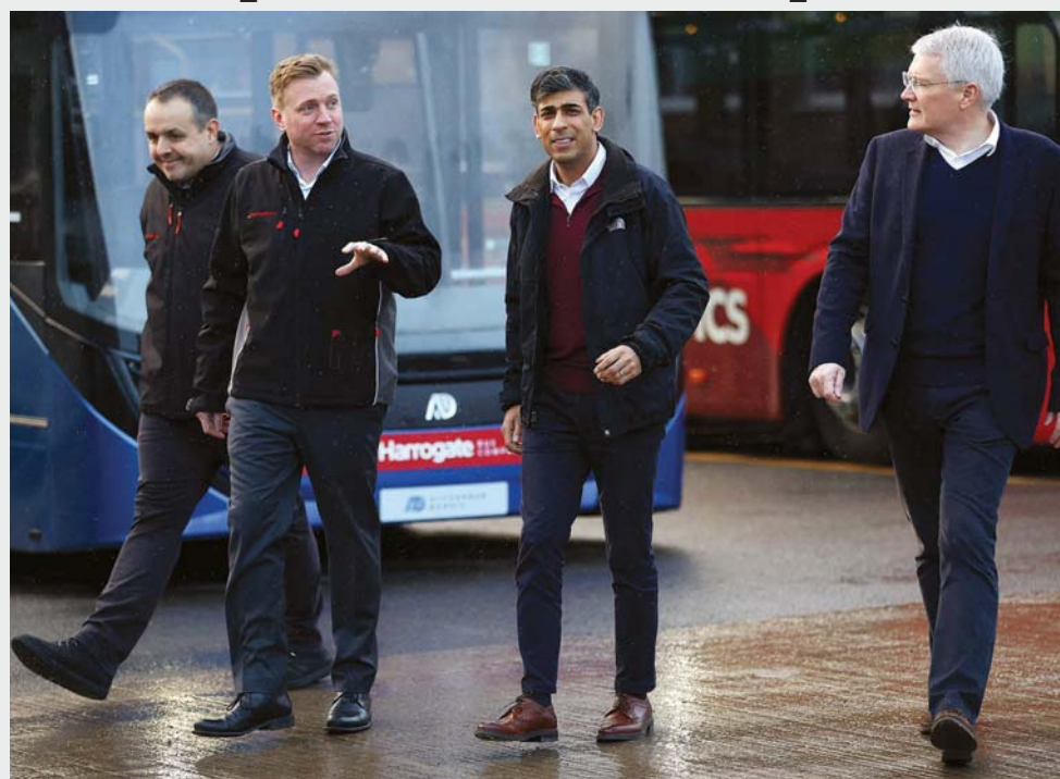
Britain's Prime Minister Rishi Sunak (second right) reacts during a visit to a bus depot in Harrogate, northern England, yesterday.