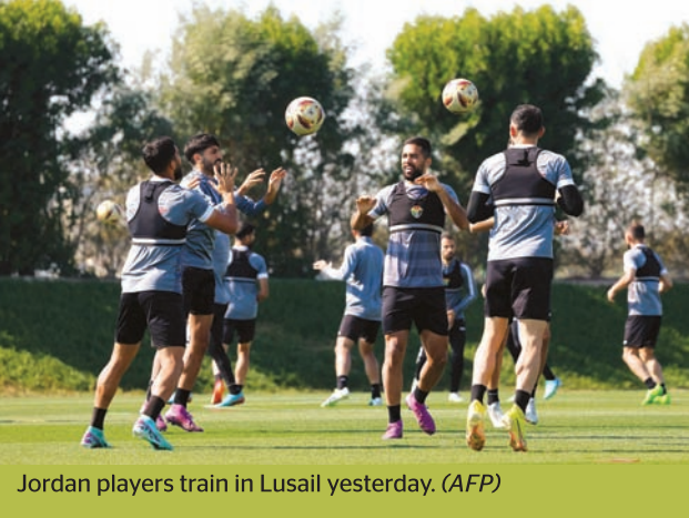
Jordan players train in Lusail yesterday.