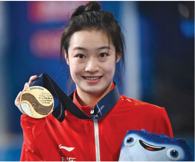
Gold medalist China's Chang Yani poses on the women's 3m springboard diving podium during the 2024 World Aquatics Championships at Hamad Aquatics Centre in Doha yesterday.

Japan and the United States of America both earned their sec-ond medals of the World Cham-pionships, sealing silver and bronze respectively.