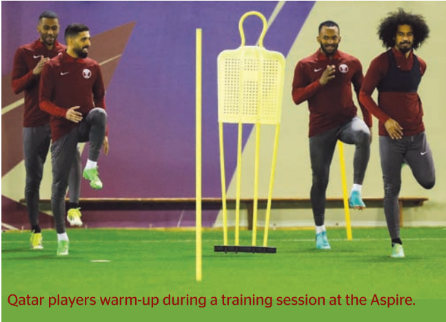
Qatar players warm-up during a training session at the Aspire.