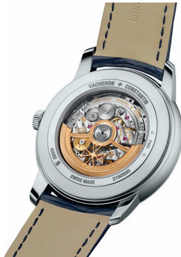
Vacheron Constantin Patrimony retrograde day-date