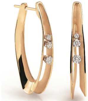
From one of the Annamaria Cammilli collections on show at the DJWE 2024.

"Aetherna" is the exclusive gold finishing method that has always distinguished Cam-