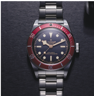
One of the timepieces from the TUDOR Black Bay Collections.

exciting dial variants joining the range.