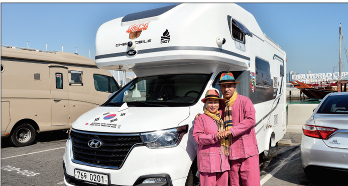
The travellers pose for Gulf Times next to their van on Doha Corniche yesterday.

What makes the trip special is the camping van equipped with bedroom, bathroom, kitchen and