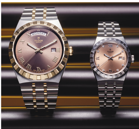
The TUDOR Royal.

With its integrated metal bracelet, notched or diamond-set bezel and automatic movement, the TUDOR Royal range is the epitome of versatile and affordable sport-chic, and now there are two more