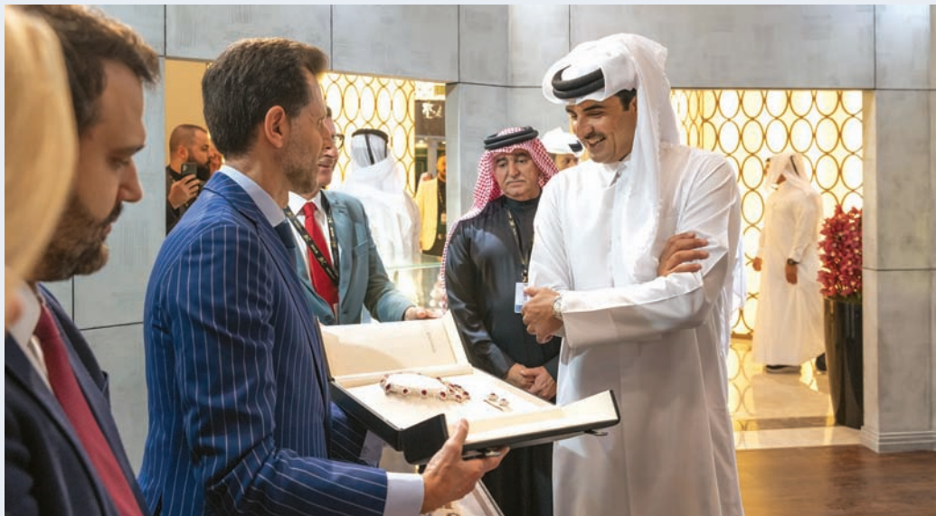
His Highness the Amir Sheikh Tamim bin Hamad al-Thani visited yesterday the 20th Doha Jewellery & Watches Exhibition at Doha Exhibition and Convention Centre. During his tour of the pavilions, the Amir was briefed on the latest products from jewellery and watch companies. He also listened to an explanation about the highlights of the exhibition in its current edition and its local economic and cultural contributions.