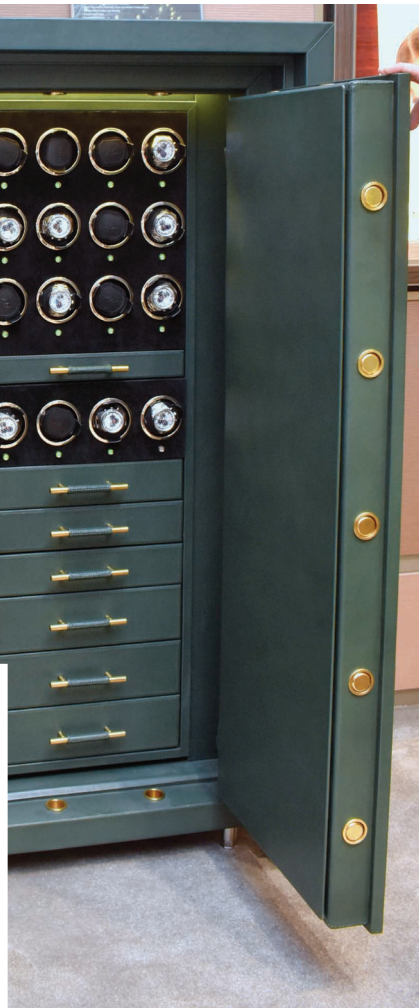
A WOLF storage facility on show at the DJWE 2024.