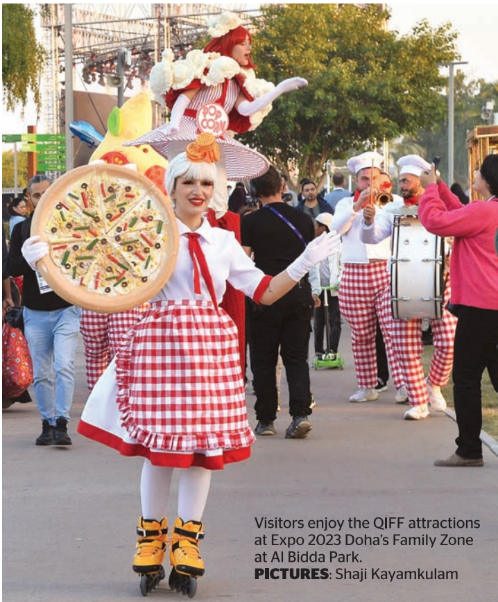
Visitors enjoy the QIFF attractions at Expo 2023 Doha’s Family Zone at Al Bidda Park.

One of the festival’s attractions is the Cooking Studio that caters to different age groups. Titled ‘Desert Oasis: Blissful Bites in the Sweet Haven’ engaged young visitors with a series of workshops and