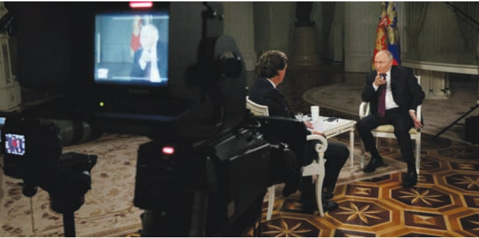
Putin is seen with Carlson in Moscow during the interview.

to White House candidate and former president Donald Trump, asked few tough questions and largely listened while the Kremlin leader lectured him on his views of Russian history, portraying the country as a victim of Western betrayals.