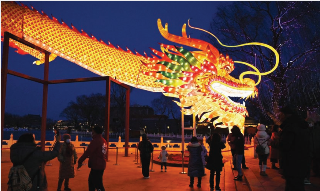
People gather to look at a giant dragon figure at a park in Beijing yesterday, the eve of the Lunar New Year of the Dragon.