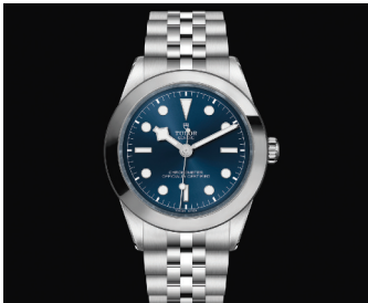
Another TUDOR Black Bay piece.

TUDOR has introduced the newest Black Bay, the latest technical and aesthetic evolution of the