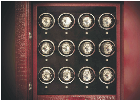
The WOLF Churchill safe.