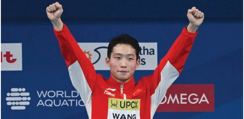
China's Wang Zongyuan celebrates after winning the men's 3m springboard diving gold.