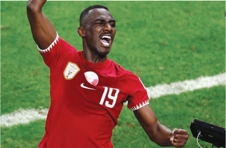
Qatar's forward Almoez Ali celebrates scoring his team's third goal during the AFC Asian Cup 2023 semi-final against Iran.