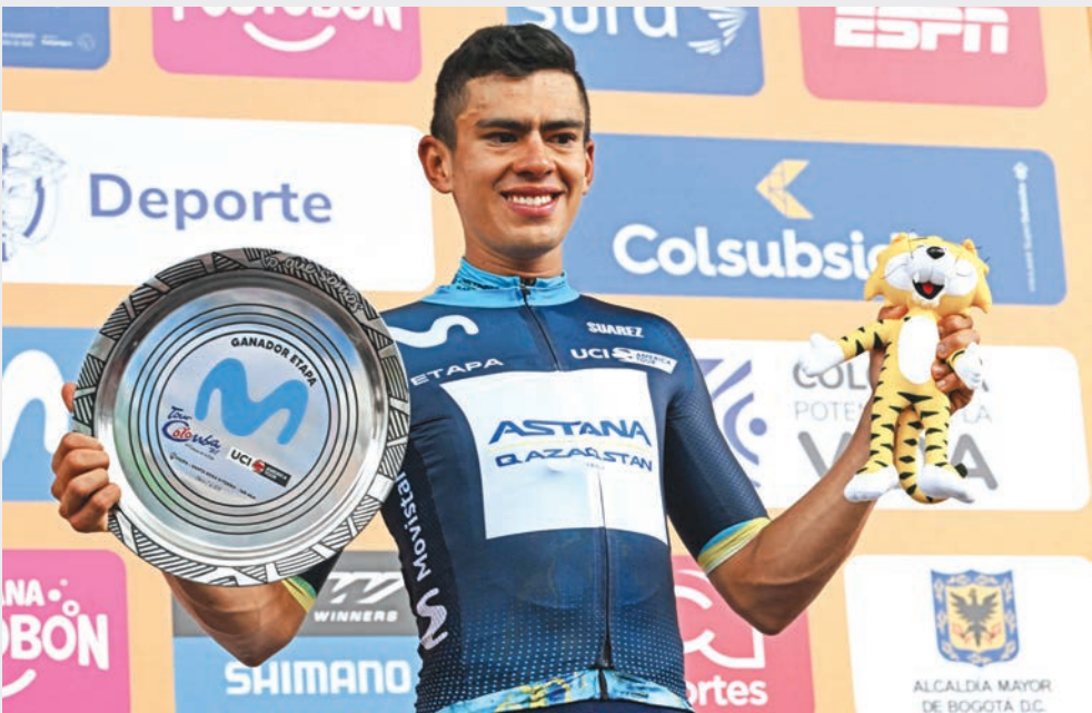
Colombia's cyclist Harold Tejada of the Astana Qazaqstan team celebrates after winning the second stage of the Tour Colombia UCI 2024 from Paipa to Santa Rosa de Viterbo, Colombia, yesterday.