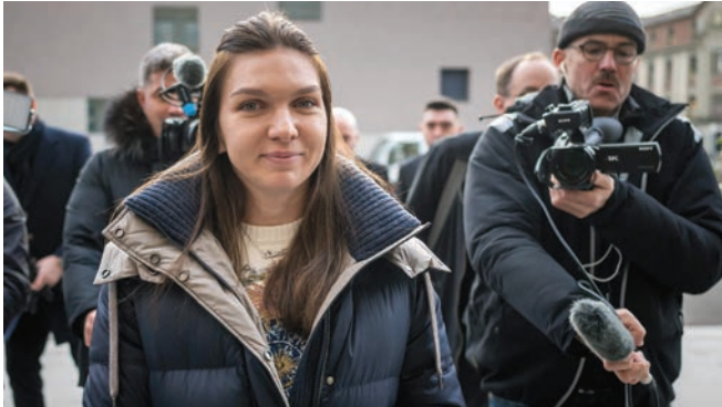
Former World No 1 tennis player Romania's Simona Halep arrives at the Court of Arbitration for Sport in Lausanne yesterday, for her appeal against a four-year doping ban.