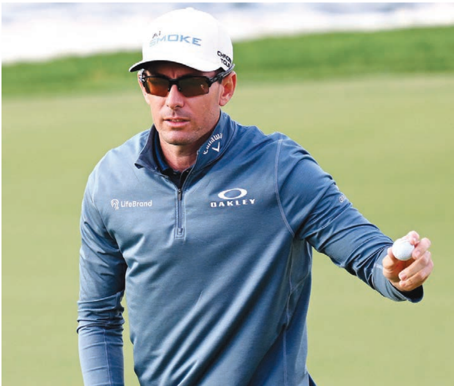
Dylan Frittelli ended a six-year wait for his third European Tour title with a two-shot victory at last week's Bahrain Championship.

Frittelli sits eighth on the Race to Dubai Rankings. And ahead of the final event in the Middle East on the International Swing, he is now reaping the rewards for his perseverance. "Last year in the States I didn't even have my C game mentally," he reflected. "I was really struggling on that side of things so I had to put in a lot of hard work there. Obviously that dovetails with the golf game; the swing, the putting with all the technical stuff too. I knew in my head going into that final nine holes that if I could be close with five or six holes I could definitely use my experience and mental toughness to see me to the end." The Qatar Masters, won towards the end of last season by Sami Valimaki as he went on to earn a PGA TOUR card, has a prize fund of $2.5mn with $450,000 500 Race to Dubai ranking points on offer for the winner. While