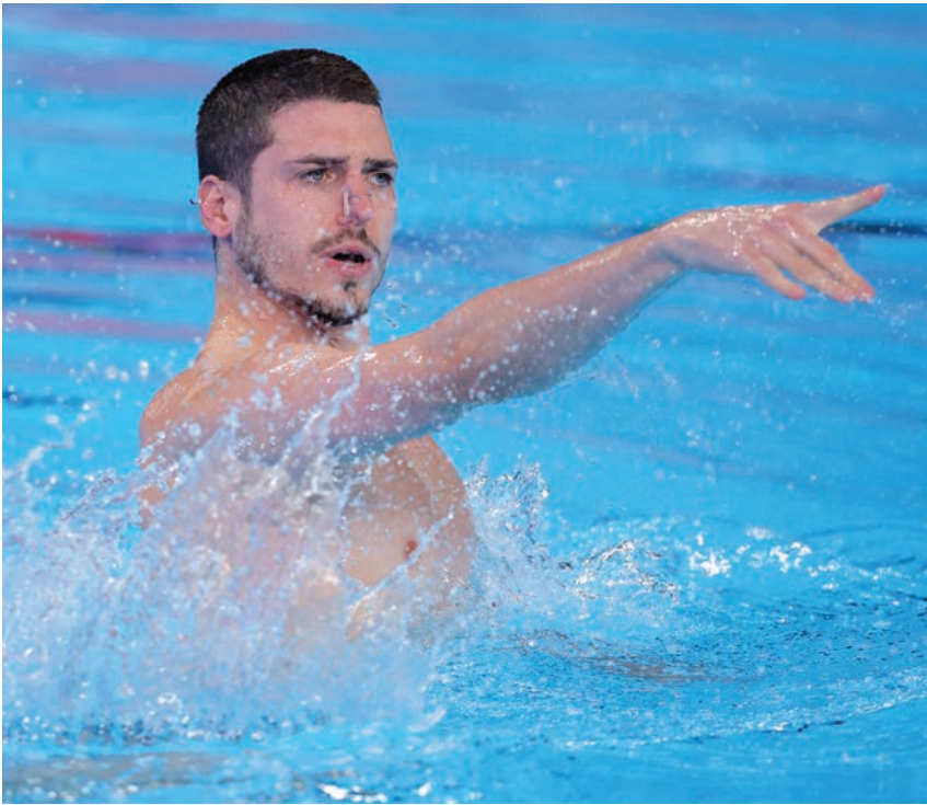
Italy's Giorgio Minisini performs during the men's solo free artistic swimming final during the World Aquatics Championships at Aspire Dome yesterday.

"In Fukuoka, I saw this event from my couch and I was dreaming about this moment since I had my knee injury," said Minisini. "So this is the conclusion of one chapter and we can start all over again. This competition really showed me how much I need to work on both - athletic side and mental side, mental management of the competition. Also, it was difficult to not have my coach on the pool deck so I needed to adapt. Now, my favorite part starts - I can cheer for my team from the