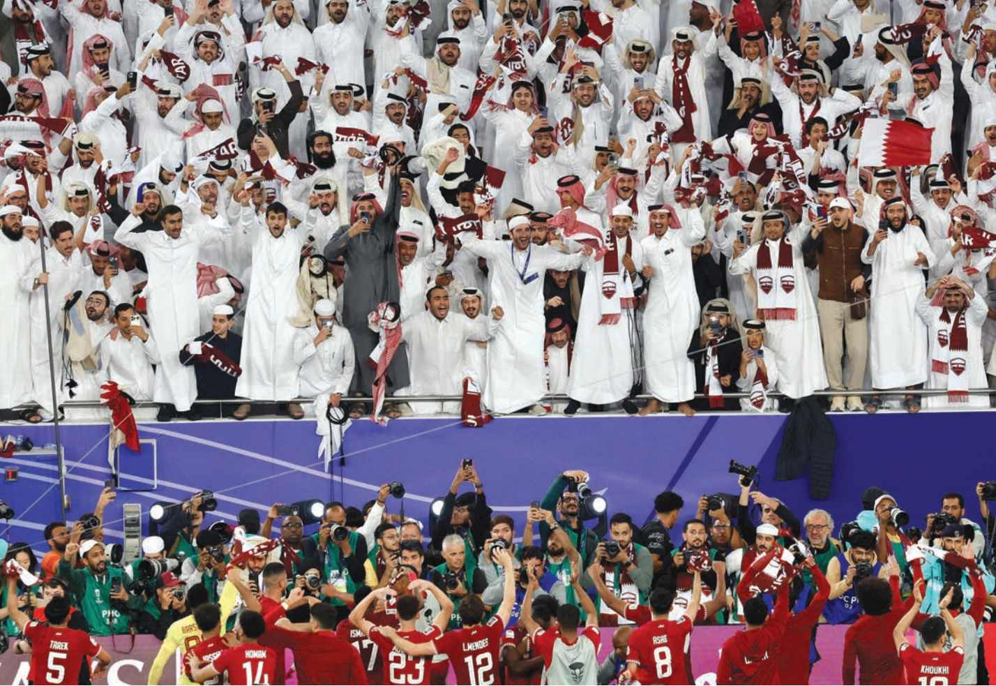
Qatar's players greet their fans at the end of the AFC Asian Cup 2023 semi-final against Iran at Al Thumama Stadium in Doha yesterday.