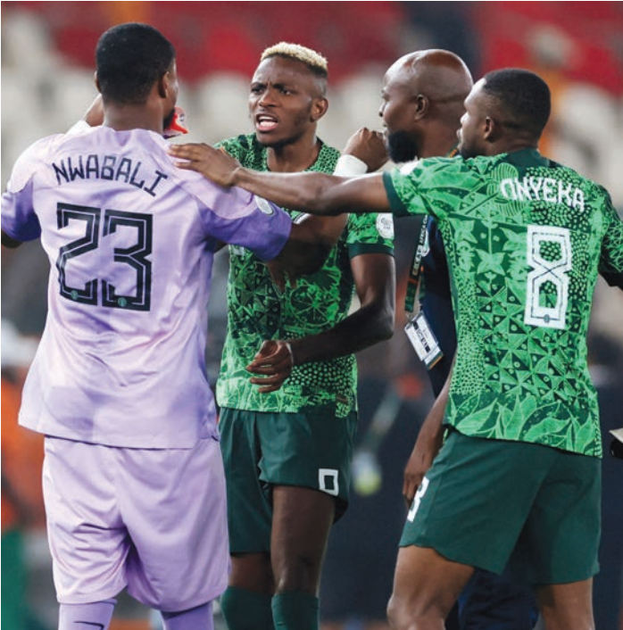
Nigeria's players celebrate after their win over South Africa in the Africa Cup of Nations semi-final in Bouake, Ivory Coast.

Star Napoli forward Osimhen started for the three-time champions after recovering from an ab-