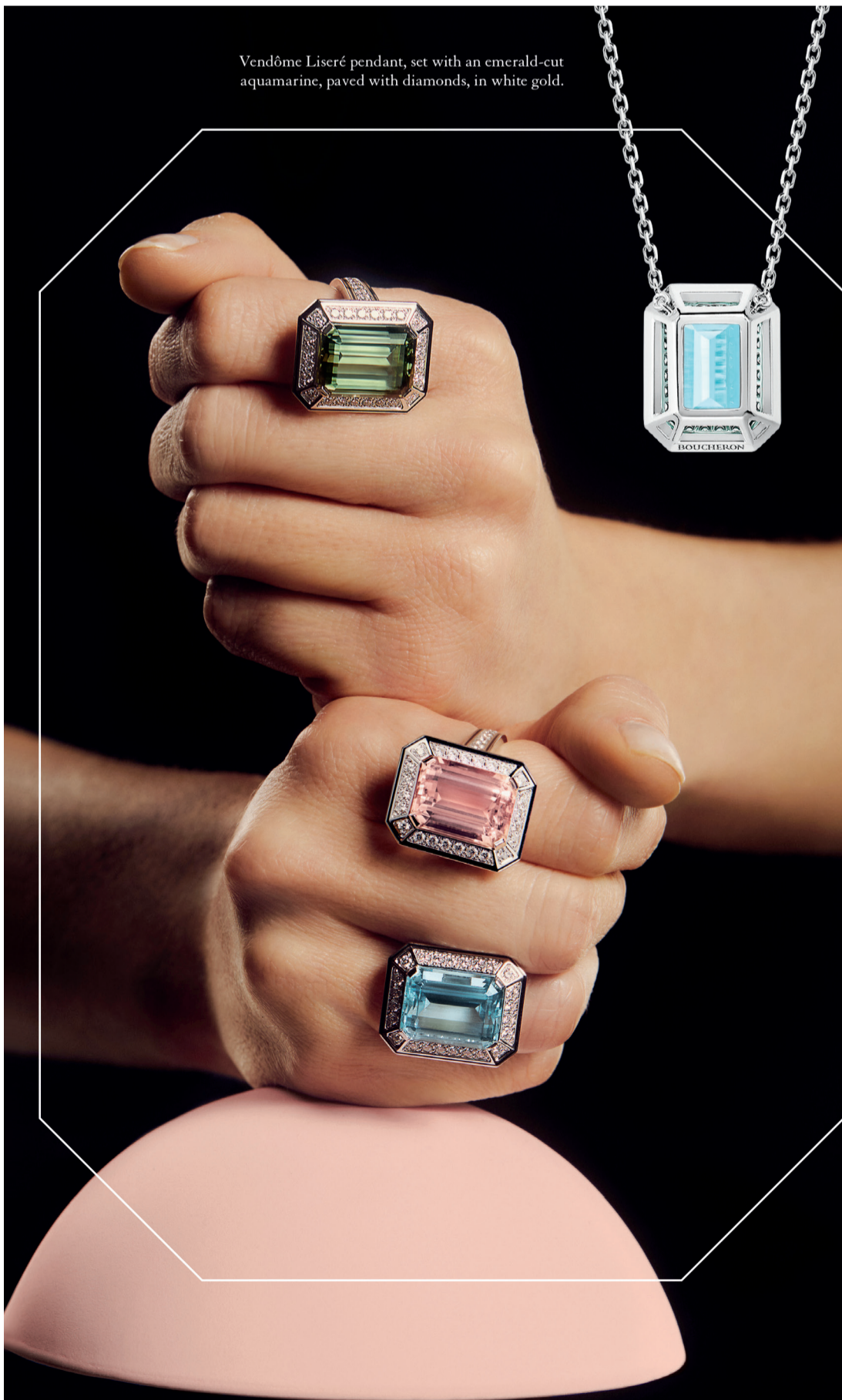
Vendôme Liseré pendant, set with an emerald-cut aquamarine, paved with diamonds, in white gold.