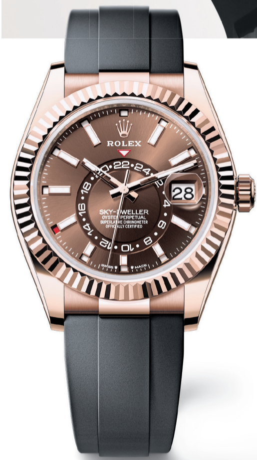
OYSTER PERPETUAL SKY-DWELLER