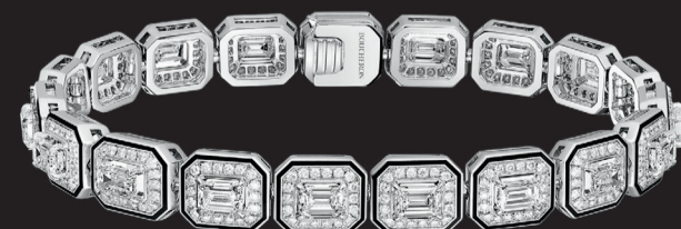
Vendôme Liseré bracelet, set with emerald-cut diamonds, diamond-pavé in white gold.

Inspired by the shape of Place Vendôme, the beating heart of the Maison, this beautiful necklace is a style statement. Its forty-two Art Deco-inspired motifs echo Boucheron's emblematic edging and its emerald-cut diamond. Graphic elegance and Parisian spirit - the very essence of the Maison Boucheron.