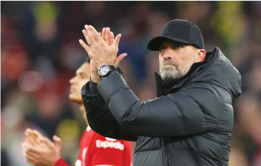
Liverpool manager Juergen Klopp celebrates after the FA Cup - Fourth Round - match against Norwich City at Anfield, Liverpool, Britain, on Sunday.

Liverpool manager Jurgen Klopp has called for calm surrounding speculation over a number of the club's star players following the news he will leave Anfield at the end of the season. Virgil van Dijk, Mohamed Salah and Trent Alexander-Arnold have 18 months left to run on their contracts and captain Van Dijk raised alarm bells when the Dutchman said he was “curious which direction the club will go” once Klopp leaves. “It’s completely normal,” said Klopp at his pre-match press conference ahead of today’s Premier League clash against Chelsea. “A week ago no one knew about my situation. There was still 18 months on their contracts and no one asked, so give us a break. No one has to worry. “Write what you want, the club is stable. Everything will be fine, I’m 100 percent sure. I would recommend to stay calm. Very often the fans’ concerns are not as big as you might think. You underestimate the intelligence of our supporters.” Klopp revealed on Friday that he had told the club two months ago of his plans to leave but that it would have been a show of bad