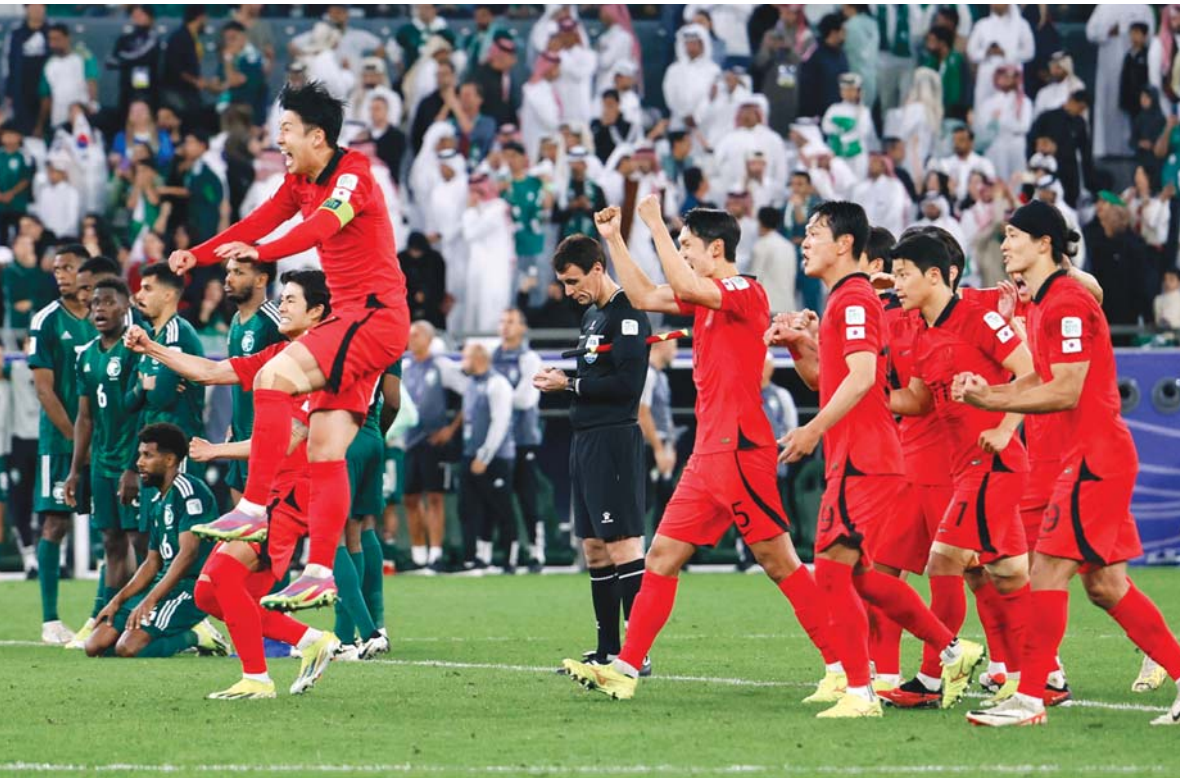
South Korea players react during the penalty shootout.

bench and started with Son at the point of South Korea's attack. Chances were at a premium in a cagey opening period, with the Saudi defence quick to snuff out the threat when Son got his first chance to stretch his legs. Ahmed al-Kassar made a comfortable save when the Spurs striker threatened again, before Saleh al-Shehri pulled a shot wide at the other end after South Korea had given possession away cheaply. The Saudis had the best chance of the first half when they came agonisingly close to hitting the target with three headers in quick succession. Al-Shehri hit the crossbar and Ali Lajami did the same with the rebound, before Salem al-Dawsari finally nodded the ball just wide of the post. The second half had barely kicked off when substitute Radif made his mark. Al-Dawsari redirected a pass into the path of Radif and the substitute lashed the ball past Jo. Klinsmann brought on Wolverhampton Wanderers forward Hwang in the 54th minute as South Korea looked for a response. Klinsmann's side threw everything at the Saudis in a frantic end to the 90 minutes and Cho hit the bar with an injury-time header. The striker got his reward in the 99th minute, nodding home to send the game into extra time. South Korea dominated both periods of extra time but were guilty of over-elaborating and could not put the ball in the net.