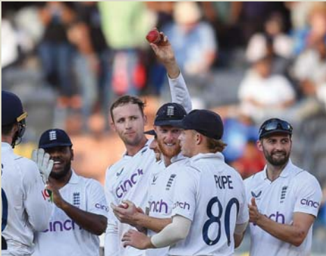
Mark Wood (right) claps as England’s Tom Hartley (third left) celebrates after taking a five-wicket haul during the fourth day of the first Test against India at the Rajiv Gandhi International Stadium in Hyderabad on Sunday.

Hyderabad: England quick Mark Wood said he has no complaints about his limited role in their thrilling win over India in the first Test in Hyderabad despite bowling just eight overs in the second innings. Ollie Pope’s knock of 196 and a seven-wicket haul from debutant Tom Hartley inspired England to a 28-run victory on Sunday in the opener of a five-match series. Captain Ben Stokes opted to go for four spinners, with Wood being the sole seamer in the starting line-up, and the move paid off as they handed India just their fourth defeat in their last 48 home tests. “When we were at the ground, he (Stokes) said probably one or two,” Wood told ESPNcricinfo. “I mean, I thought I may not even open the bowling second innings. But it was like, ‘one over; that’s it’. “Very rarely would you think you’d bowl one over and then be off. But weirdly, I trust what he says. One over? Right, okay, I’ll give it everything for this over. “And then he said ‘rest’ and I’m not annoyed. Like, I get it, we’re going to spin now. So it’s just a bit different.” India quick Jasprit Bumrah picked up six wickets in the Test, including four for 41 runs in the second innings. Wood went wicket-less after bowling 25 overs in the match. “Bumrah didn’t do me any favours by bowling like a genius,” Wood said. “I’m disappointed that I didn’t get any wickets