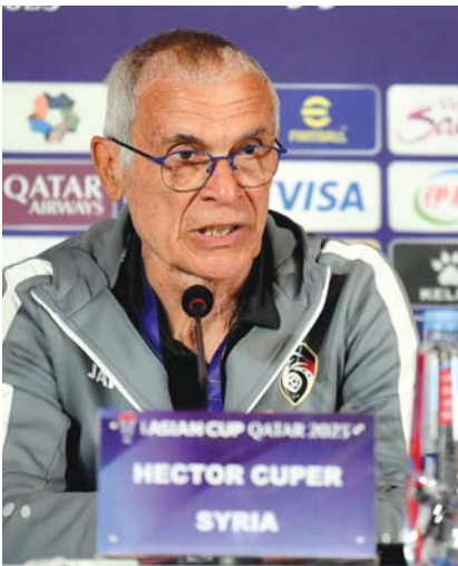
Syria’s coach Hector Cuper called Iran one of the strongest teams at the tournament.

key defenders for today’s clash, but Ghalenoei remained confident in his squad’s ability to deliver, urging them to show their quality against a team that is difficult to break down. “At this moment we don’t have Sadegh Moharrami and Morteza Pouraliganji, but not much else. All of the players we have and the squad we have now can be with us until the next World Cup, so we are not planning on making any generational shifts. Any changes will be gradual.” “I think today football is all about lines and the structure of the team. Hector Cuper had the same style of football in Valencia and all his other teams. We changed the philosophy of the team from defensive to attacking and the stats in the group stage back this up. I hope the players can show their quality from a technical point of view. I always tell them that you always have to follow the tactical instructions from the coaching staff, but it is important that you show your individual technical abilities too.” Cuper called Iran one of the strongest