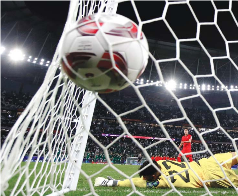
South Korea's Kim Young-gwon scores a penalty during the shootout against Saudi Arabia in their AFC Asian Cup Round of 16 clash at Education City Stadium in Doha yesterday. Right: South Korea's midfielder Hwang Hee-chan celebrates after scoring the winning penalty.