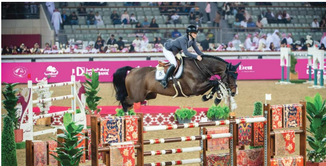
The 2024 Doha Tour saw a high percentage of public attendance with more than 15,000 tickets sold.