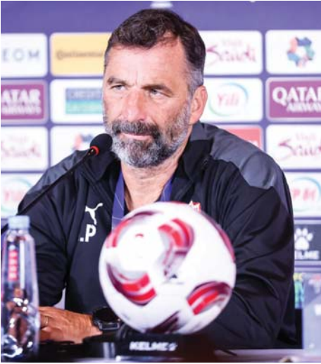
Bahrain coach Juan Antonio Pizzi has vowed to exploit Japan’s weaknesses.

Juan Antonio Pizzi said Japan being labelled favourites “could play into our hands” and vowed to exploit their weaknesses.