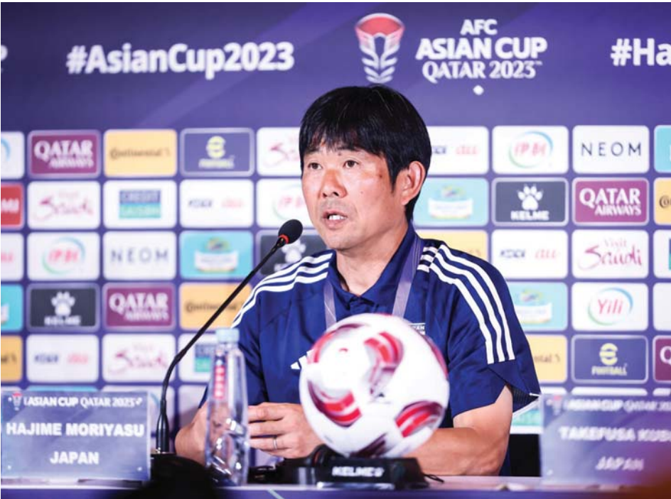
Japan coach Hajime Moriyasu speaks during a press conference in Doha yesterday.