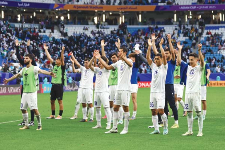
Uzbekistan players celebrate after the AFC Asian Cup, Round of 16, match against Thailand at Al Janoub Stadium, Al Wakra, yesterday.