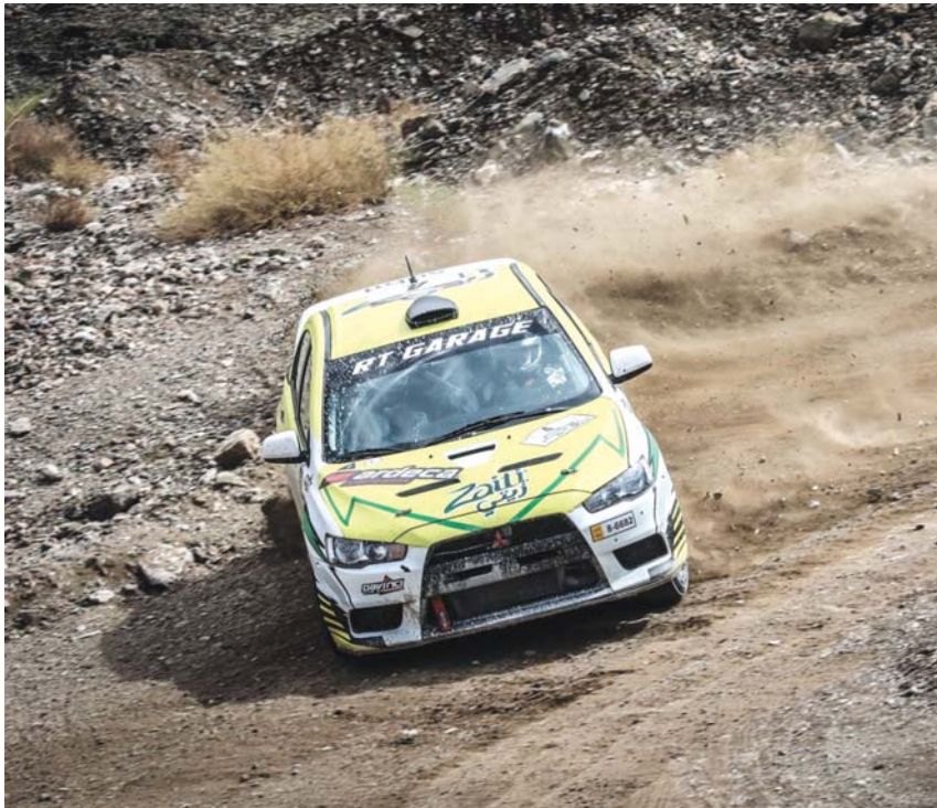
Eleven crews are aiming for glory in the 'production class' category for Group NR4 cars such as the Mitsubishi Lancer Evolution IX and X and the Subaru WRX-STi.