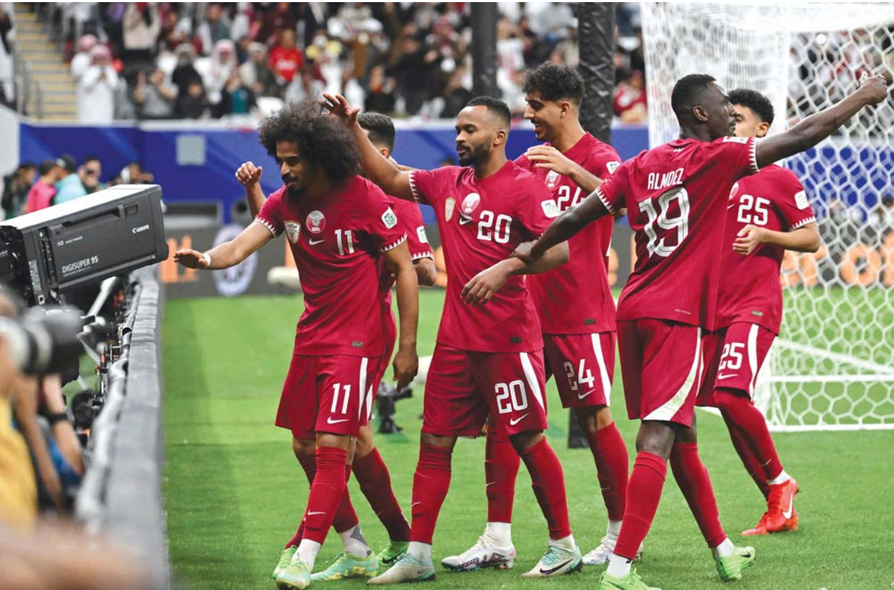
Qatar’s forward Akram Afif (left) celebrates with teammates after scoring a penalty during the AFC Asian Cup round of 16 match against Palestine at Al Bayt Stadium in Al Khor yesterday.

Following a cagey start, Qatar keeper Meshaal – younger sibling of global track and field star Mutaz Barshim – managed a diving stop on a long-range missile from Palestine’s Amid Mahajna in the 19th minute.