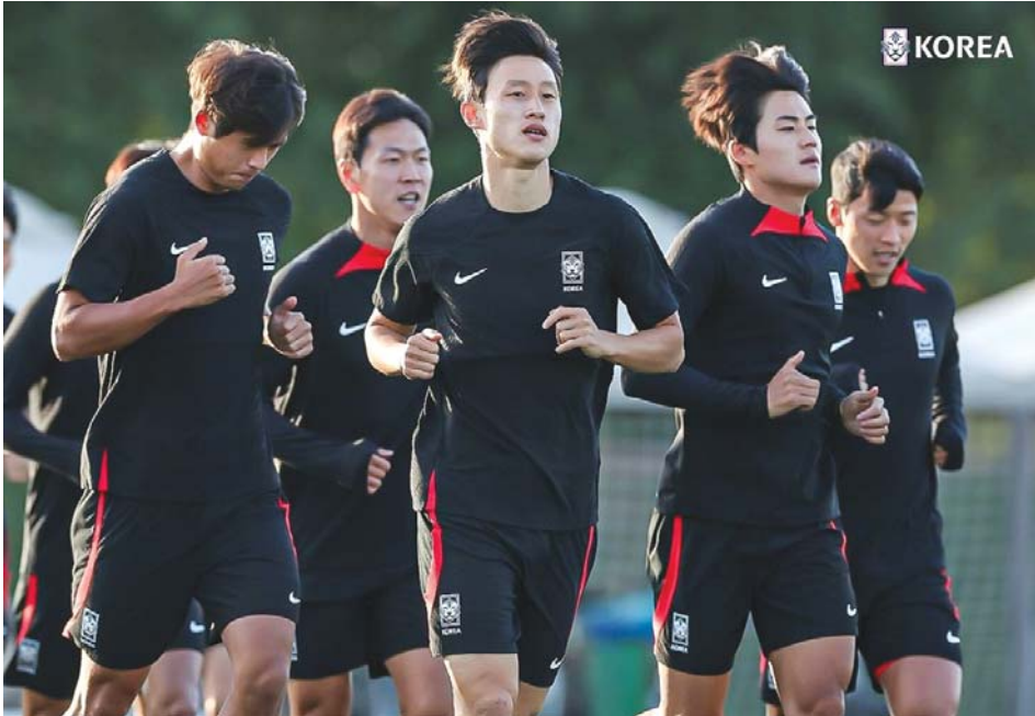
South Korean players train in Doha yesterday.

"I don't fear anybody. No fear but a lot of respect for every opponent," Klinsmann said. "Roberto is doing a fantastic job, it's a step-by-step process that he had to go through. It's obviously a new adventure for him and a new adventure for me being in Korea. We have a lot of respect for Saudi Arabia. I've played Mancini many times in my career...You can now see his handwriting on the team after 10 games. We have the belief that we can beat Saudi Arabia but it will be a lot of work. It will be a nail-biter. It might go into a penalty shoot-out."