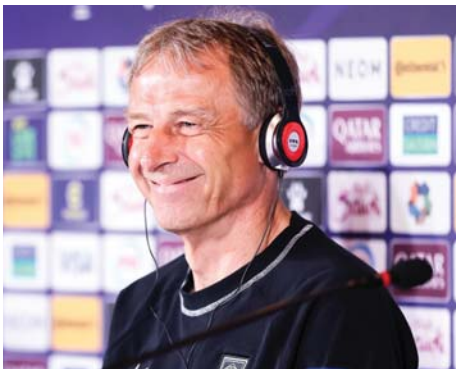
South Korea's coach Jurgen Klinsmann (left) and Saudi Arabia's Roberto Mancini at a press conference.

Saudi Arabia won Group F but came from a goal down to beat Oman 2-1 with an injury-time winner in their opening game. They also struggled in front of goal in a 2-0 victory over a Kyrgyzstan side that played almost half the game with nine men. They rounded off their group with a 0-0 draw with Thailand. Mancini shrugged off his team's lack of bite in front of goal and said they could profit from South Korea's defensive woes. "If they conceded six goals in the group stage it doesn't change their strength because they have very