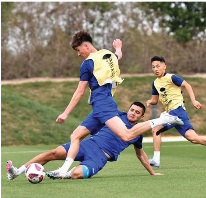
Uzbekistan players train in Doha yesterday, on the eve of their Asian Cup round of 16 match against Thailand.