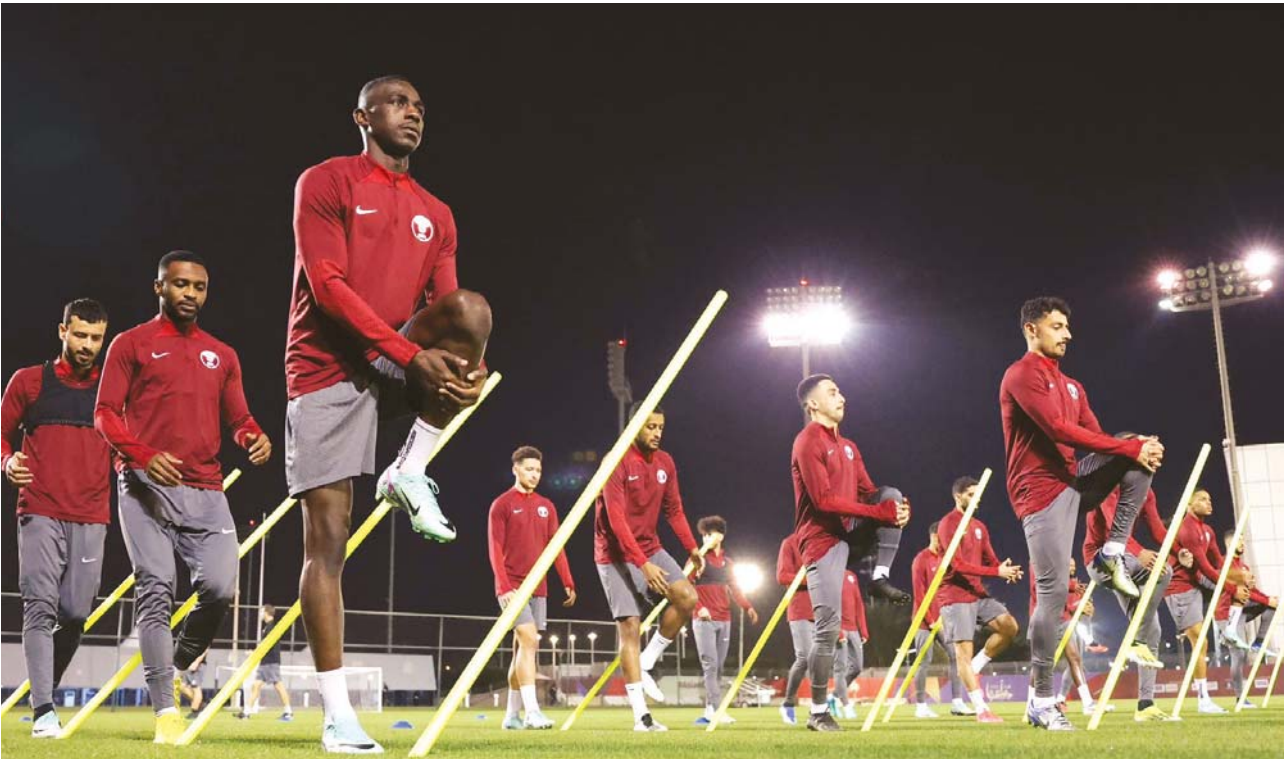
Qatar squad during a training session.

“I trust my players, not 100%, but 200%. I trust the work they do in training. It will be a difficult match, but we want to