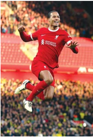
Liverpool's Virgil van Dijk celebrates after scoring against Norwich City.

Bruno Fernandes, 18-year-old Kobbie Mainoo and Rasmus Hojlund also scored for United, who conceded two goals in an FA Cup match against a fourth-tier side for the first time since 1970 (against Northampton Town).