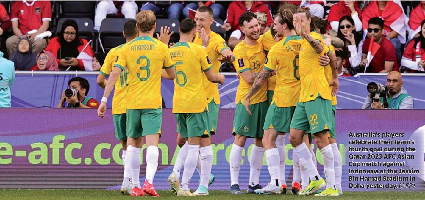
Australia’s players celebrate their team’s fourth goal during the Qatar 2023 AFC Asian Cup match against Indonesia at the Jassim Bin Hamad Stadium in Doha yesterday.

The Indonesian fans in red and white tried their best to spur on their team but Australia remained composed, although they nearly found themselves in trouble when Jones deliberately tripped Rafael