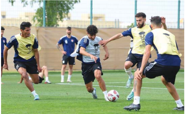
Iraq players train at Al Gharrafa yesterday, ahead of their round of 16 match against Jordan at the Asian Cup.