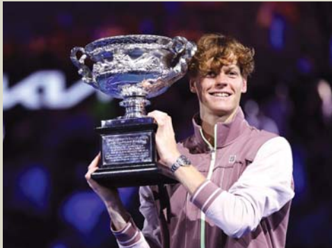
Italy's Jannik Sinner celebrates after defeating Russia's Daniil Medvedev in the men's singles final of the Australian Open in Melbourne.

It was only the third and fourth times that Sinner had dropped his serve in the tournament and he appeared to be troubled by the flat trajectory of his opponent's shots early in the encounter. Medvedev's only previous loss in 51 Grand Slam matches on hardcourts after winning the opening set came at Melbourne Park against Nadal in the 2022 final and the 27-year-old nicknamed the "Ocotopus" soon got one tentacle on the trophy. After wasting four chances to break in the second game that had five deuces and lasted nearly 12 minutes, Medvedev got his nose in front 3-1 on his way to wrapping up the second set as Sinner's hopes of responding faded with the setting sun. But Sinner grabbed a break back and nearly got another late in the second set as Medvedev showed signs of frailty after more than 20 hours on the court before yesterday but the Russian pushed himself on with plenty of backing from the crowd. The fourth seed missed a forehand pass at the net after a 31-shot rally in the 10th game of the third set but shrugged it off to break Medvedev and take the set, beginning his comeback in the clash which suddenly had a different feel to it. "I like to dance in the pressure storm," Sinner said. "I like it because that's where most of the time I bring out my best tennis. I'm also quite relaxed on this occasion, because I always try to enjoy on the court. "So I think pressure is a privilege, to be honest."