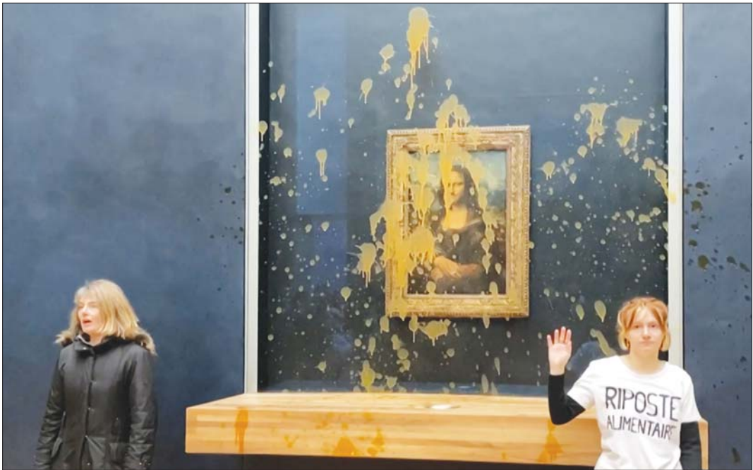
Two environmental activists from the collective dubbed "Riposte Alimentaire" (Food Retaliation) gesturing as they stand in front of Leonardo Da Vinci's "Mona Lisa" (La Joconde) painting after hurling soup at the artwork at the Louvre museum in Paris yesterday.