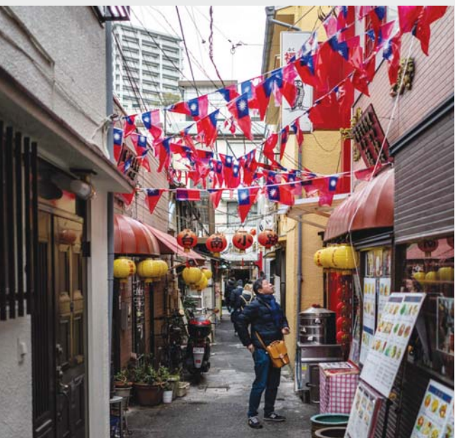
A man stands under Taiwanese flags on a street in the Chinatown section of Yokohama, south of Tokyo.