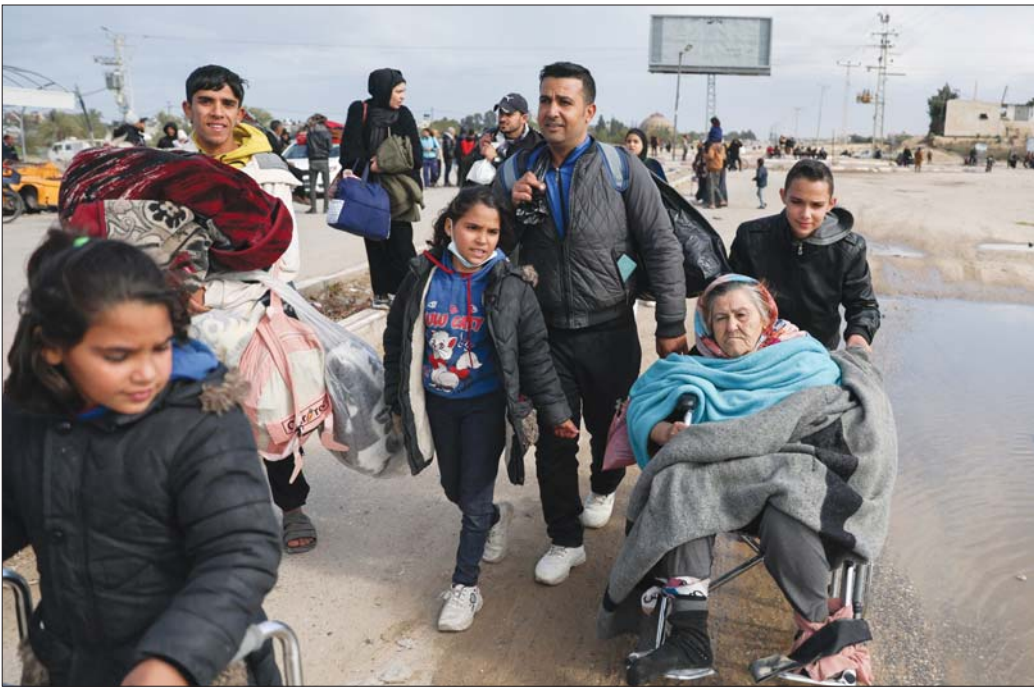
Palestinians fleeing Khan Younis, due to the Israeli ground operation, move towards Rafah, amid the ongoing conflict, in the southern Gaza Strip, yesterday.