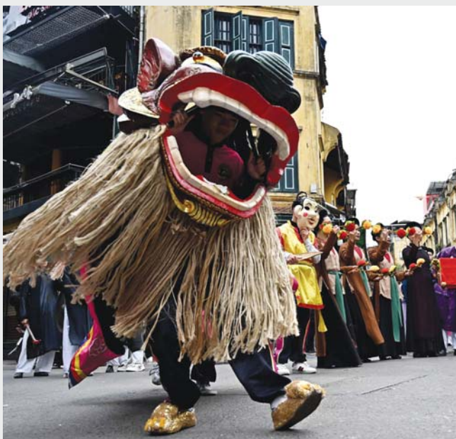
Lion dancers perform during a procession in Hanoi yesterday for the upcoming Lunar New Year.