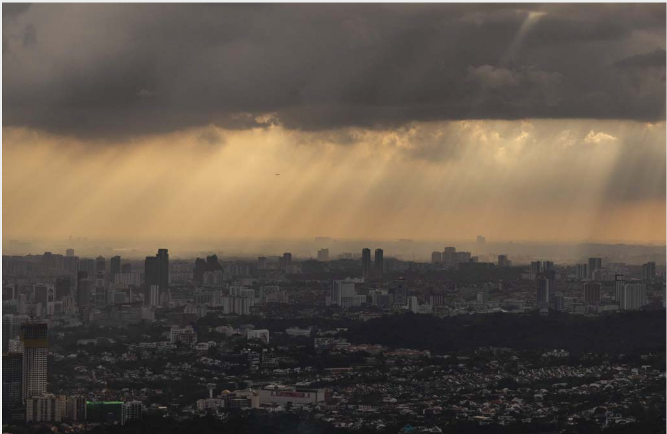
Dark clouds are seen over the Kuala Lumpur city skyline, as viewed from the KL Tower, yesterday.