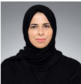
HE Lolwah bint Rashid AlKhater

HE the Minister of State for International Co-operation at the Ministry of Foreign Affairs Lolwah bint Rashid AlKhater has demanded an accelerated and obstacle-free humanitarian aid delivery and adequate levels of aid supplies into all Gaza Strip areas. Speaking to the BBC, HE AlKhater said that less than 100 daily trucks had entered the Gaza Strip, a stark decrease compared to the Strip's urgent aid supplies and the daily 400-500 aid trucks that used to flow into the Gaza Strip before the Oct 7 Israeli aggression. The arrival of aid to Egypt's Al Arish city is the easiest part of delivering aid from around the world into Gaza, she said, high-