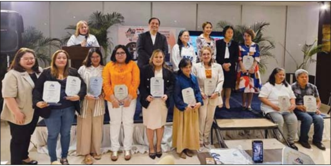
Filipino HSWs in Qatar were awarded.