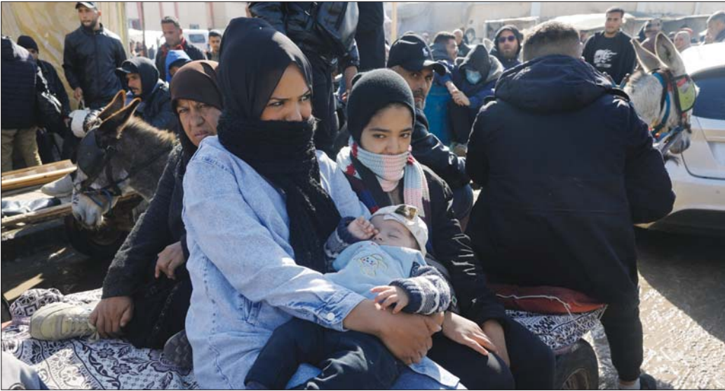
A woman holds a baby as displaced Palestinians, who fled their houses due to Israeli strikes, shelter at a tent camp, amid the ongoing conflict, in Rafah in the southern Gaza Strip, yesterday.