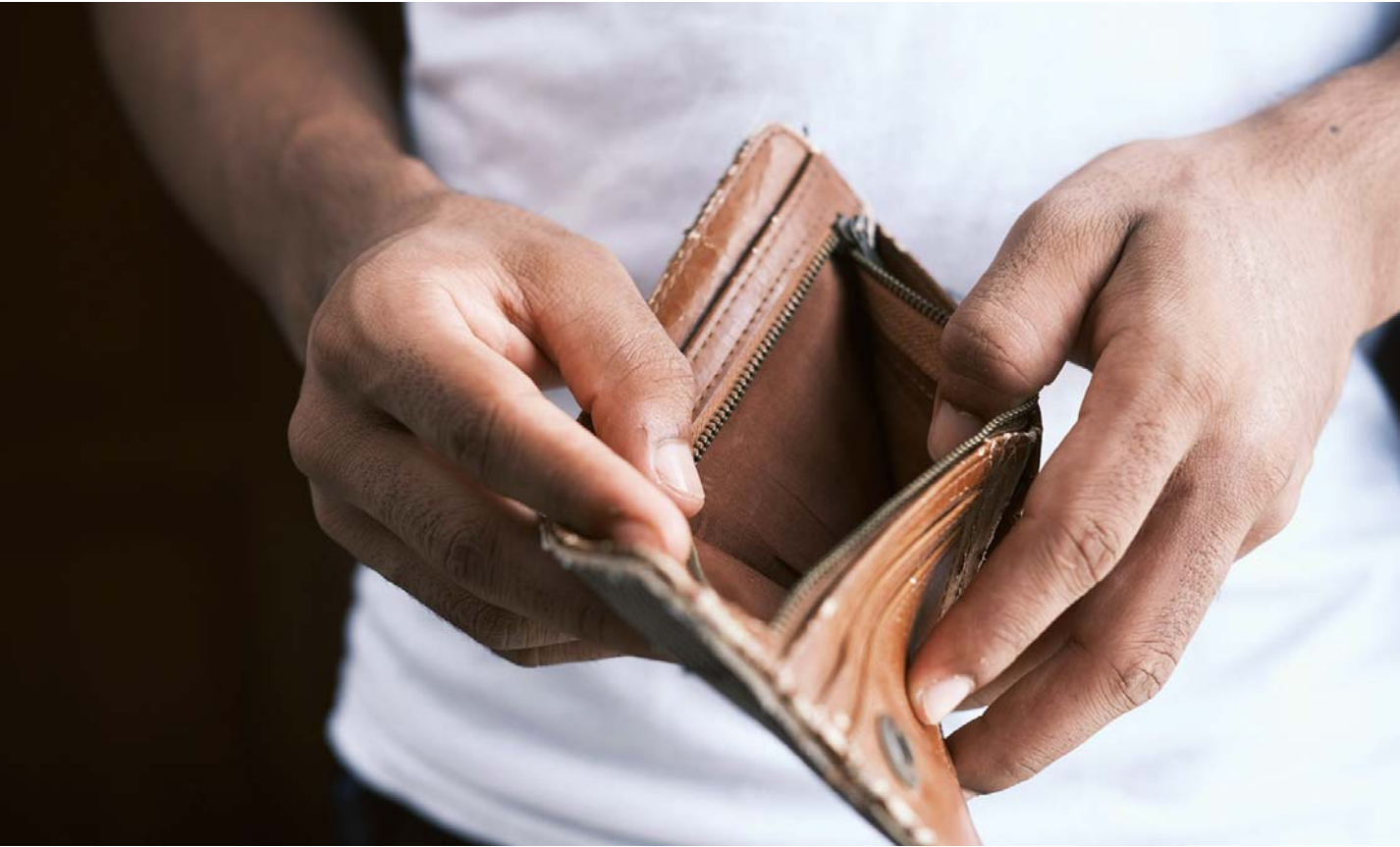
TOUGH GOING: If developing economies found it hard to manage their debts in 2023, they are likely to face even more formidable challenges this year.