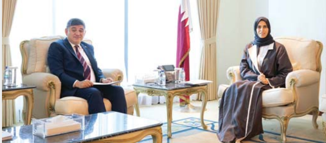
HE the Minister of State for International Co-operation at the Ministry of Foreign Affairs Lolwah bint Rashid AlKhater met yesterday with Turkish ambassador to Qatar Dr Mustafa Goksu. During the meeting, the two sides discussed the latest developments in Gaza Strip and the occupied Palestinian territories, in addition to discussing avenues for co-operation in humanitarian field to contribute to handling the cataclysmic situation in the Strip. (QNA)