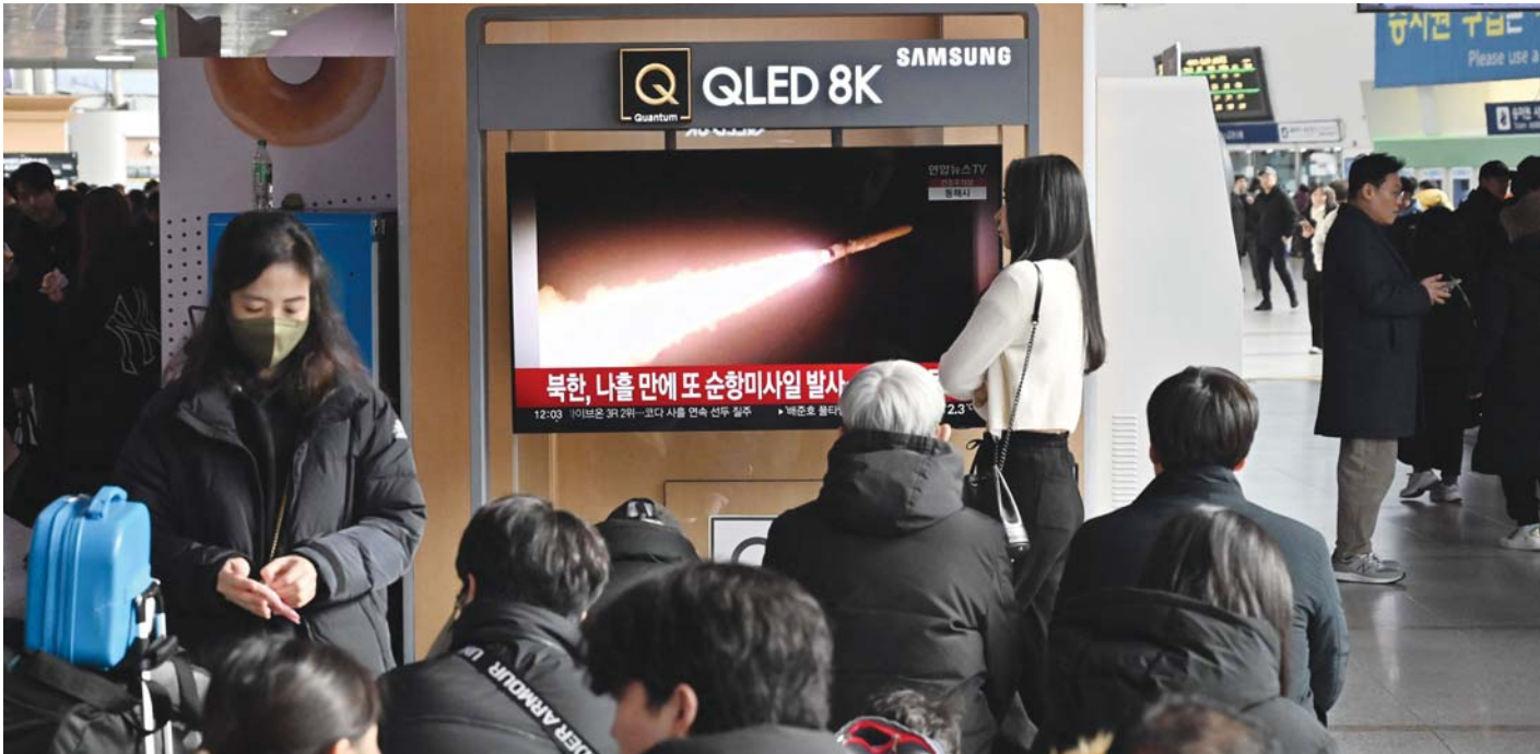
People watch a television screen showing a news broadcast yesterday with file footage of a North Korean missile test, at a railway station in Seoul.

North Korea fired multiple cruise missiles off its east coast yesterday, its second such launch in less than a week, South Korea’s Joint Chiefs of Staff (JCS) said. The missiles were launched around 8am (2300 GMT on Saturday) and were being analysed by South Korean and US intelligence authorities, the JCS said, without specifying how many missiles were fired or how far they travelled. “While strengthening surveillance and vigilance, our military is co-operating closely with the United States and monitoring additional signs and activities from North Korea,” it said in a statement. The latest launches came days after North Korea fired what it called a new strategic cruise missile called “Pulhwasal-3-31”, suggesting it is nuclear capable.