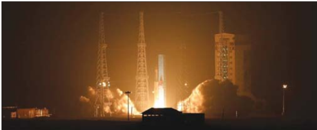
A handout picture provided by the Iranian Defence Ministry yesterday shows Iran's two-stage Simorgh (Phoenix) satellite carrier lifting off at an undisclosed location.

Iran yesterday said it simultaneously launched three satellites into orbit, nearly a week after the launch of a research satellite by the Revolutionary Guards drew Western criticism. "Three Iranian satellites have been successfully launched into orbit for the first time," state TV reported. The satellites were carried by the two-stage Simorgh (Phoenix) satellite carrier and were launched into a minimum orbit of 450 kilometres, it added. The Mahda satellite, which weighs around 32 kilogrammes and was developed by Iran's Space Agency, is designed to test advanced satellite subsystems, the official IRNA news