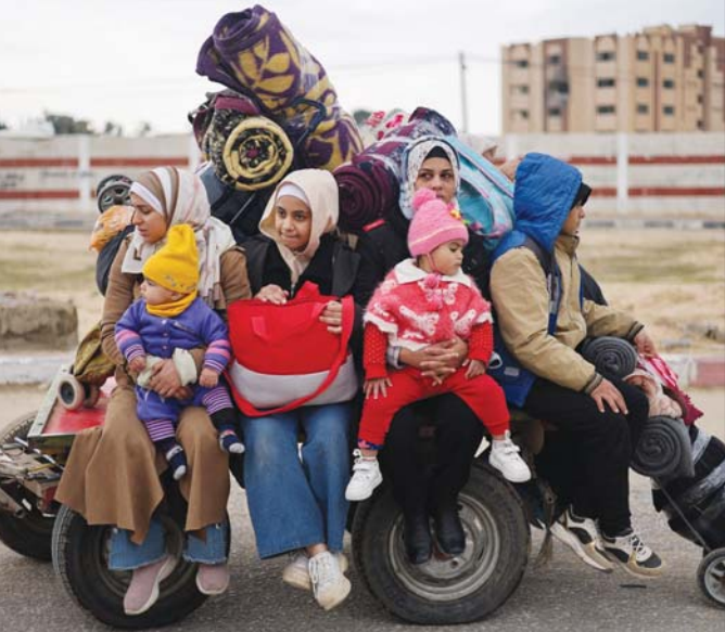
Palestinians fleeing Khan Younis, move towards Rafah, in the southern Gaza Strip, yesterday.

Israel's ensuing military offensive has killed at least 26,422