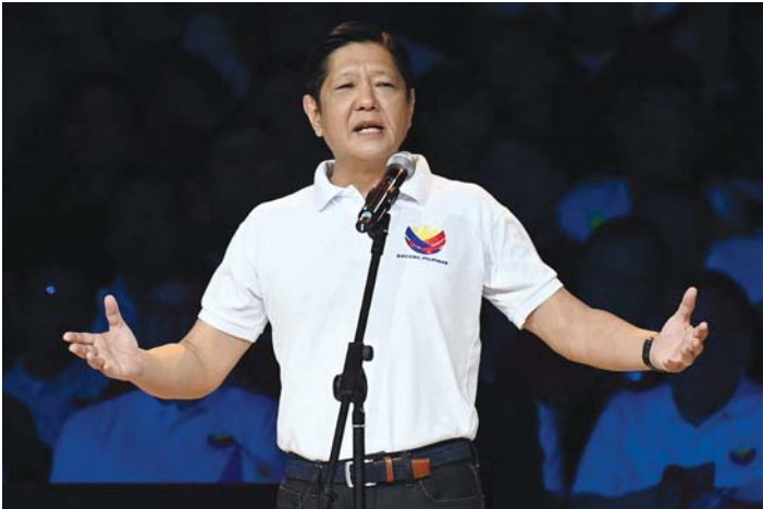
President Ferdinand Marcos Jr and Vice-President Sara Duterte deliver their speeches during the kick-off rally for the New Philippines movement at Quirino Grandstand in Manila yesterday.