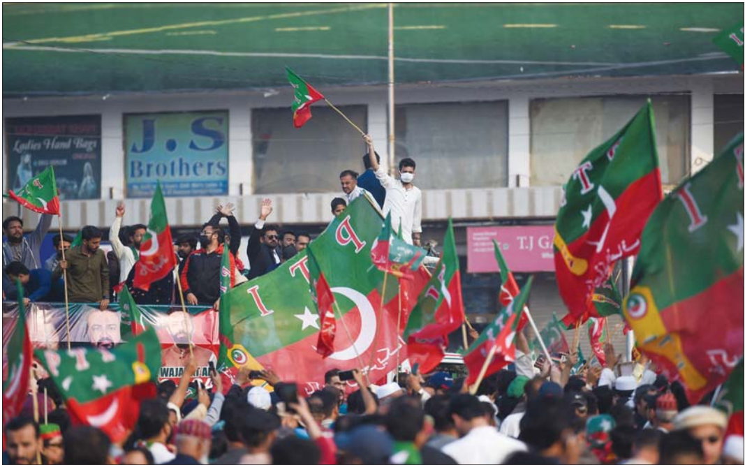
Supporters of Pakistan Tehreek-e-Insaf shout slogans and protest to demand the release of jailed former prime minister Imran Khan in Karachi yesterday.