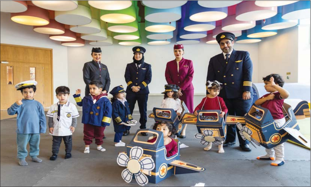
Qatar Airways crew with the students.