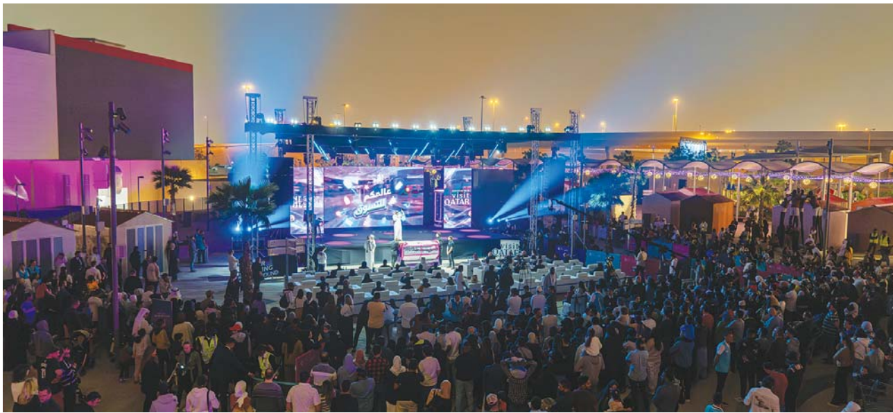
Snapshots from the event.