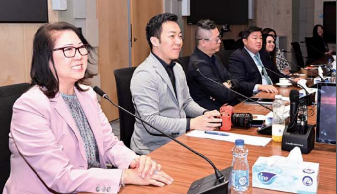
Students from University of Southern California Rossier School of Education.

Qatar University (QU) welcomed students from the University of Southern California's (USC) Rossier School of Education, who visited as part