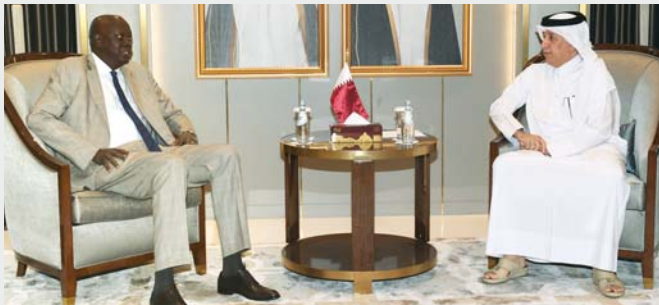
HE the Minister of State for Foreign Affairs Sultan bin Saad al-Muraikhi met yesterday with South Sudan's ambassador to Qatar Maw Maw Reng, on the occasion of the end of his tenure. HE al-Muraikhi thanked the ambassador for his efforts in supporting and strengthening the bilateral relations, wishing him success in his new duties. (QNA)