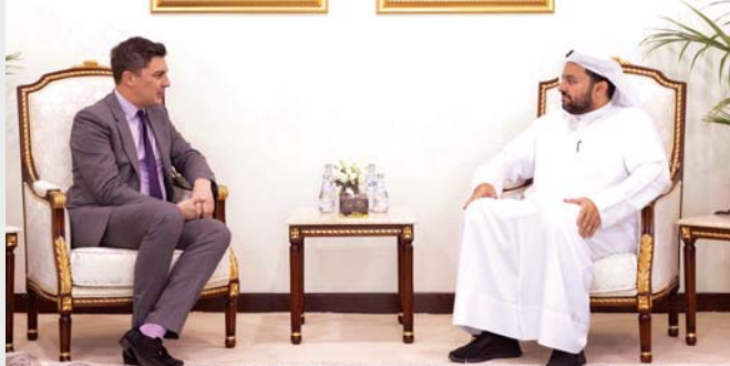
HE the Minister of State at the Ministry of Foreign Affairs Dr Mohamed bin Abdulaziz bin Saleh al-Khulaifi met in Doha yesterday with the visiting Chief of Staff of the US National Security Council, Curtis Ried. The meeting discussed bilateral relations and the latest developments in the Gaza Strip and the occupied Palestinian territories. HE Dr al-Khulaifi stressed the need to continue sustainable delivery of humanitarian aid into the Gaza Strip, and to bolster regional and international efforts aimed at an immediate ceasefire. Ried highlighted the solid strategic partnership between the two countries. (QNA)