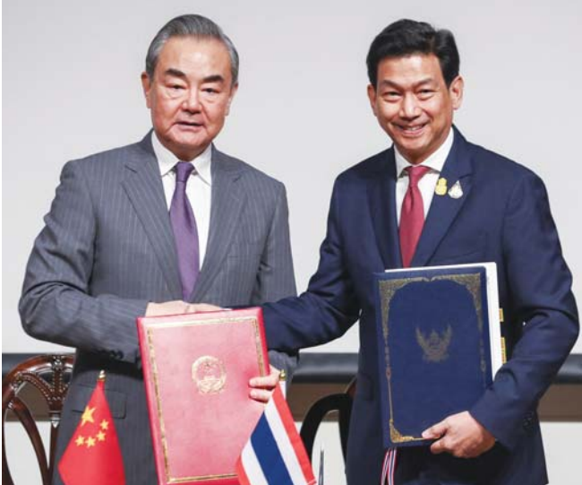
Chinese Foreign Minister Wang Yi and Thai Foreign Minister Parnpree Bahiddha-Nukara shake hands during a signing ceremony of the agreement on mutual visa exemption in Bangkok.

try in both countries,” Parnpree said. Wang welcomed the agreement, saying that Thai and Chinese people “are one family”. “This visa-free era will bring people-to-people exchanges to a new height,” Wang said. Precise details of the visa arrangements were not announced yesterday, but earlier this month Thai officials said the deal would allow stays of up to 30 days per visit. “There will be a big increase in the number of Chinese tourists visiting Thailand,” Wang said. The number of Chinese tourists to Thailand plunged to 3.5mn last year from 11mn in 2019 before the pandemic. Beijing and Bangkok also pledged to speed-up the construction of the China-Thailand railway and work together in combating transnational crimes, Wang said. Before his talks with Parn-