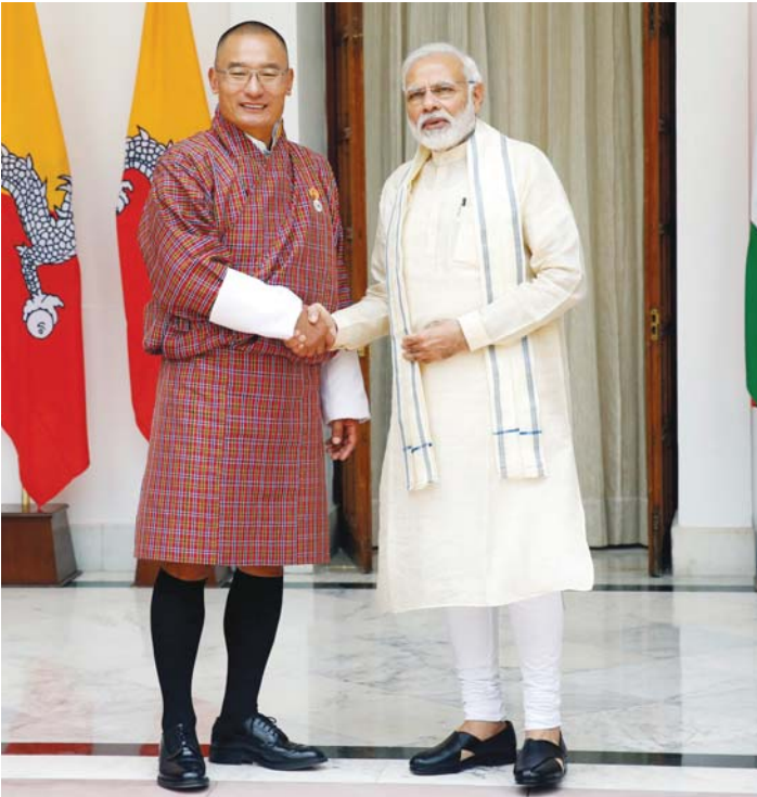
This picture taken in 2018 shows Prime Minister Tobgay with his Indian counterpart Narendra Modi.

However, Tobgay faces the challenge of revamping the $3bn economy following the coronavirus (Covid-19) pandemic and creating jobs to prevent young Bhutanese people from going abroad, mainly