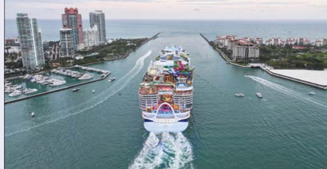
Royal Caribbean's Icon of the Seas sails from the Port of Miami in Miami, Florida, on its maiden cruise.

The world's largest cruise ship, Royal Caribbean's Icon of the Seas, set sail from Miami on its maiden voyage Saturday, carrying what amounted to the population of a small city. The ship, built over 900 days at a shipyard in Turku, Finland, is a monument to enormity, longer than the Eiffel Tower is tall, with 20 decks and room for more than 5,600 passengers (7,600 at maximum capacity) and a crew of 2,350. To ensure no one goes bored or hungry, the monster ship, registered in the Bahamas, has seven swimming pools including a 40,000-gallon "lake," six water slides, a carousel, what Royal Caribbean says is the largest ice arena at sea, and more than 40 dining venues and bars. Still bored? There will be 50 musicians and comedians as well as a 16-piece orchestra. The $2bn Icon — the first in Royal Caribbean's new Quantum Class of ships — is stuffed with the latest technology and, despite its mammoth size, claims to be more eco-friendly than some smaller cruise ships. The Icon is powered by what