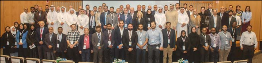
Participants at the Middle East Proton Therapy Summit.

Hamad Medical Corpo-ration has collaborated with the Penn Medicine Department of Radiation Oncology at University of Pennsylvania Health System for the Middle East Proton Therapy Summit, a pivotal event that took place recently for the first time in Qatar and the Middle East. This summit brought together global experts in proton therapy from United States and Qatar, with a primary focus on empha-sising the importance of proton therapy in cancer treatment and exploring the future directions of cancer care in the Middle East. Penn Medicine, affiliated with the University of Pennsylvania, is a renowned institution celebrated for its excellence in patient care,