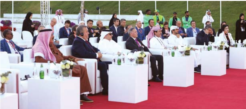
Snapshots from the event.