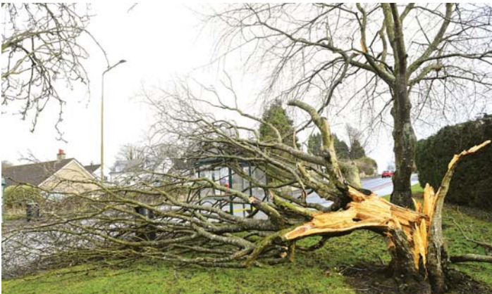
A fallen tree sits during Storm Isha in Linlithgow, West Lothian, Britain.

Several thousand properties went dark in northwest England and Wales, and several people had to be rescued from their cars in northern England when a swollen river broke its banks. Felled trees in