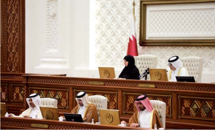
The Shura Council in session.

tional peace and security. During the session, the Shura Council reviewed the response of the General Secretariat of the Council of Ministers to the proposal submitted by the Council, related to the topic of inflation, high costs of living, and increasing financial burdens on citizens, and decided to refer it to the Financial and Economic Affairs Committee to study it and provide the Council with its conclusions. The Shura Council had discussed in previous sessions the aforementioned topic and concluded by submitting a proposal with the Council's views on the subject in question, at the request of the esteemed government. The proposal included a number of themes that would contribute to reducing the effects