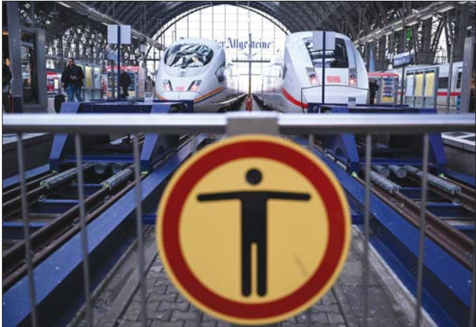
Two Inter City Express trains of German national railway operator Deutsche Bahn stand at a platform at the main station of Frankfurt am Main, western Germany, in this file photo.

German train drivers will stage their longest-ever walkout with a six-day strike this week, their union said yesterday, escalating a dispute with rail operator Deutsche Bahn over pay and working hours. The walkout called by the GDL union is to start at 2am tomorrow for passenger services and last until 1700 GMT on Monday. For cargo services, the stoppage will begin earlier, at 1700 GMT today. State-owned Deutsche Bahn accused the union of “acting absolutely irresponsibly.” It will be the fourth strike by GDL since November as the union pushes its demands for higher salaries to compensate for inflation, as well as a reduced working week from 38 to 35 hours with no loss in wages. A three-day walkout earlier this month already caused travel chaos for thousands of passengers, with 80 percent of long-distance trains not running. GDL said it had rejected Deutsche Bahn's “third and allegedly improved offer” and decided to call a fresh strike because bosses had shown “no sign of a willing-