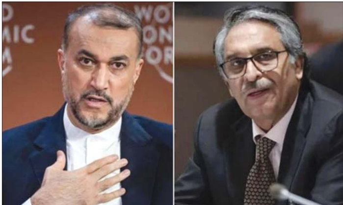
Iranian Foreign Minister Hossein Amir-Abdollahian (left) and his Pakistani counterpart Jalil Abbas Jilani.

Pakistan said yesterday Iran's foreign minister will visit the country next week, signalling efforts to mend relations after the neighbours exchanged missile strikes last week at what they said were militant targets. Ambassadors of both countries have also been asked to return to their posts by January 26, the Pakistani foreign ministry said in a statement. “It has been mutually agreed that the ambassadors of both countries may return to their respective posts by January 26,” said a joint statement by the foreign ministries in Tehran and Islamabad. Iran's Foreign Minister Hossein Amir-Abdollahian is also due to visit Pakistan on January 29 following an invitation from his Pakistani counterpart Jalil Abbas Jilani, the statement said. The decisions were announced following a phone call between Jilani and Amir-Abdollahian. Iran's foreign ministry confirmed that Foreign Minister Hossein Amir Abdollahian would visit on Monday, and said its am-