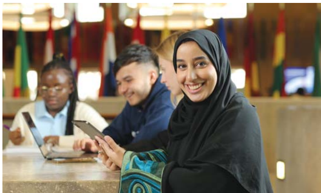
'A Day in the Life of a Georgetown Student' is taking place tomorrow.