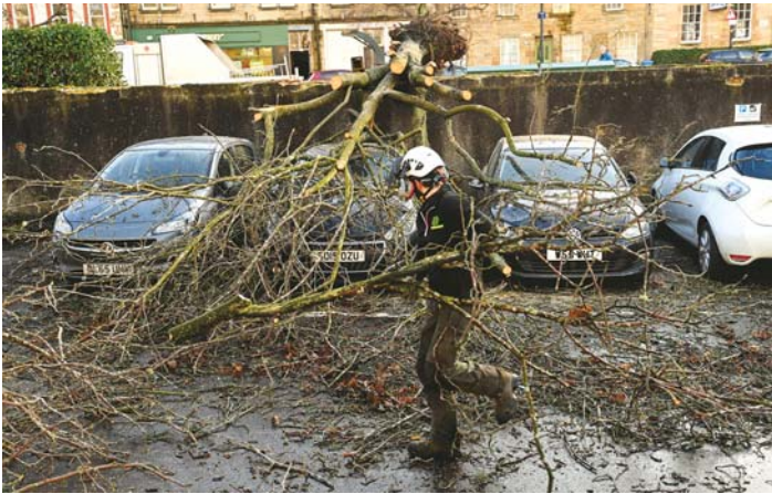
A tree surgeon removes a fallen tree from cars during Storm Isha in Linlithgow.

Scotland closed major roads, while debris and floods forced the cancellation of all Monday morning rush-hour trains in the country.