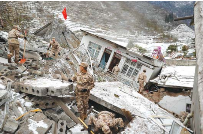
Chinese military personnel search for missing victims following a landslide in Liangshui village at Zhaootong, in southwestern China's Yunnan province.

Footage shared on social media by a local broadcaster showed emergency workers in orange jumpsuits and helmets forming ranks outside a fire station as snowflakes whirled through the air. Other images showed rescuers picking through towering piles of collapsed masonry in which a few personal belongings could be seen. Chinese President Xi Jinping ordered "all-out" rescue efforts, CCTV reported. Xi "demanded that rescue forces be organised quickly...and efforts made to reduce casualties as far as possible," the broadcaster reported him as saying.