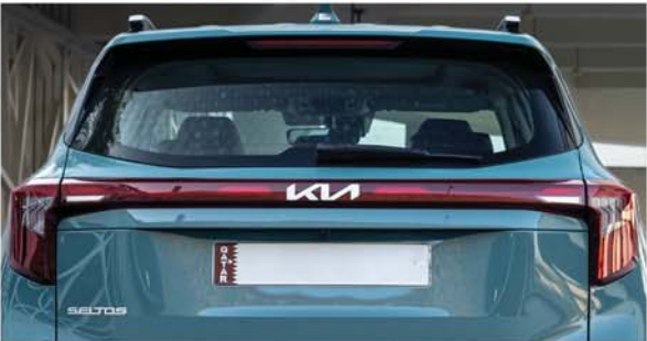
Connected Rear Combination Lamps