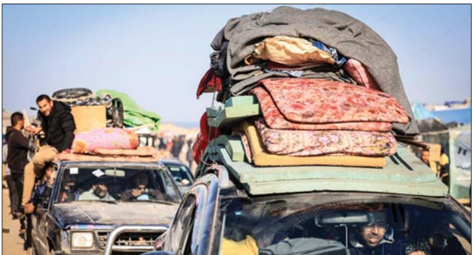
This photograph taken yesterday on the southern outskirts of Khan Yunis, in the southern Gaza Strip, shows Palestinian families fleeing the city on the coastal road leading to Rafah, amid ongoing battles.

"In the evening, gunfire started - shelling and air strikes from every direction. I couldn't move with my nine children at