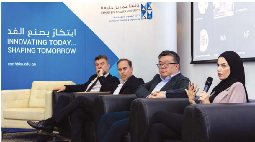
Some of the panellists during a discussion.

"The multidisciplinary nature of the healthcare sector holds incredible potential