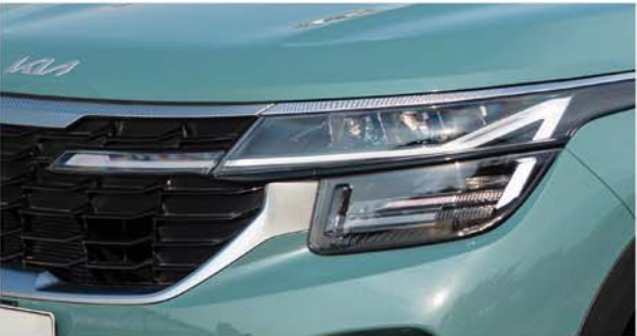
'Star-map' LED Lights