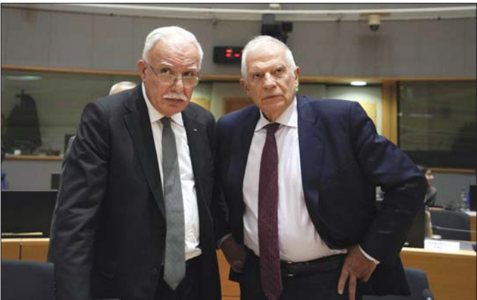
Palestinian Authority Foreign Minister Riyad al-Maliki (left) speaks with European Union High Representative for Foreign Affairs Josep Borrell ahead of a meeting of EU Foreign Ministers at the European Council building in Brussels, yesterday.

"It will not bring more security to Israel on the contrary." He in-