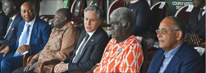
US Secretary of State Antony Blinken, Prime Minister of Ivory Coast Robert Beugre Mambe and President of the Confederation of African Football (CAF) Patrice Motsepe watch the Africa Cup of Nations (CAN) 2024 football match at the Alassane Ouattara Stadium in Ebimpe, Abidjan, Ivory Coast, yesterday.

Blinken is touring four democracies on the Atlantic Coast - Cape Verde, Ivory Coast, Nigeria and Angola - as security deteriorates in the Sahel and doubts grow about a key US base in coup-hit Niger. President Joe Biden welcomed African leaders in 2022 in a show of newfound US attention to the continent. But Biden failed to live up to a promise to visit last year and Blinken's trip is his first to sub-Saharan Africa in 10 months as he has been consumed since October with the Israel-Hamas war. Blinken nonetheless quoted Biden as he vowed "We are all in when it comes to Africa." "Our futures are linked, our prosperity is linked, and African voices increasingly are shaping, animating and leading the global conversation," Blinken said on his first stop, Cape Verde. "The US is committed