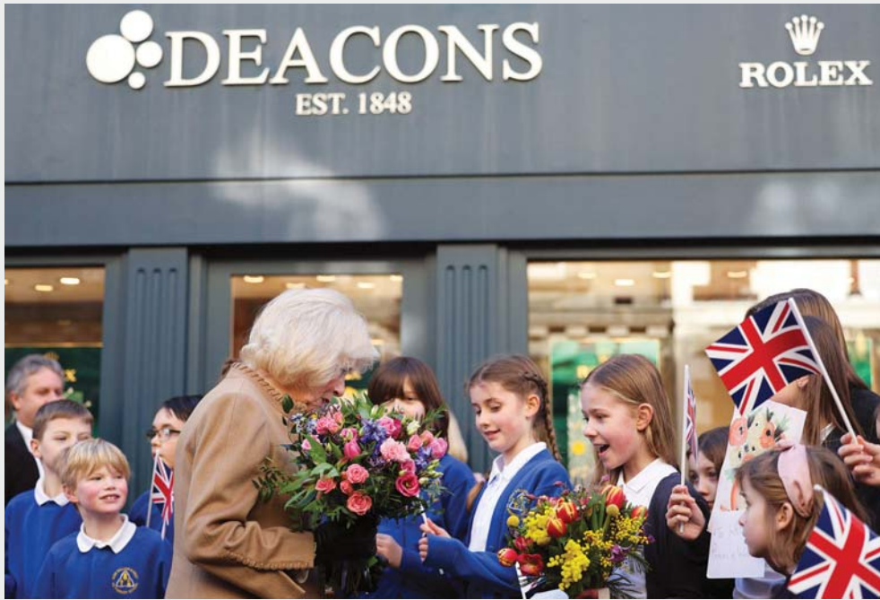
Britain's Queen Camilla receives get well cards for King Charles III during a visit to Deacon & Son Jewellers in Swindon, western England as the company celebrates 175 years of trading.