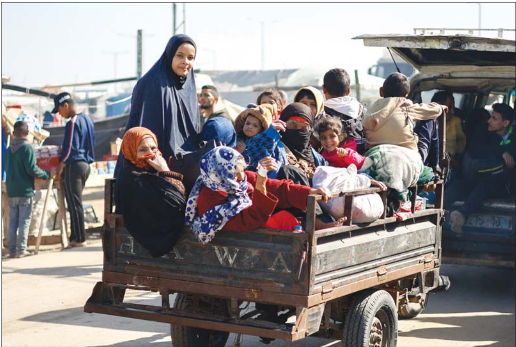
Palestinians fleeing Khan Yunis, due to the Israeli ground operation, amid the ongoing conflict, arrive in Rafah in the southern Gaza Strip, yesterday.

trade between Asia and Europe and alarmed world powers in an escalation of the war in Gaza. The Houthis, who control most of Yemen, say their attacks are an expression of their solidarity with Palestinians under attack from Israel in Gaza.