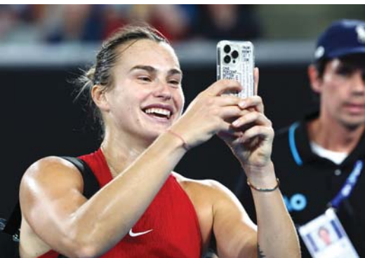
Belarus’ Aryna Sabalenka takes pictures of fans as she celebrates victory against USA’s Amanda Anisimova during their singles match at the Australian Open yesterday.

Defending women’s champion Sabalenka has also been in imperious form and was in complete charge against unseeded Amanda