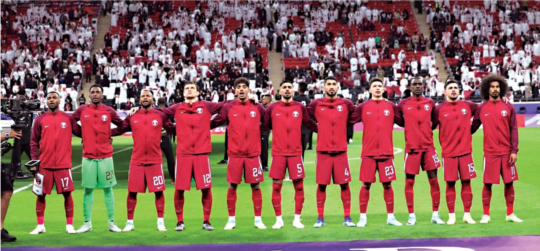
Qatar players line up before one of the two matches they have played at the AFC Asian Cup 2023. Qatar face China today.