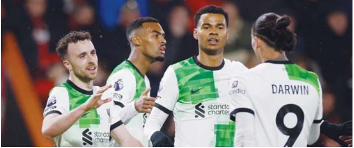
Liverpool's Diogo Jota celebrates scoring their third goal with Ryan Gravenberch, Cody Gakpo and Darwin Nunez.