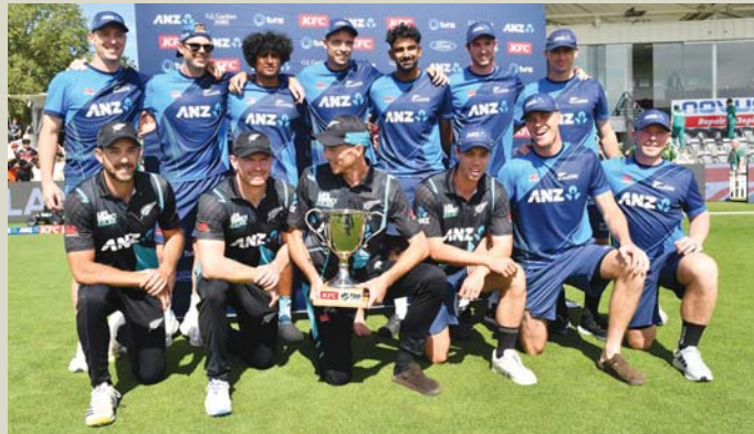
New Zealand’s players pose with the series trophy after the fifth T20 against Pakistan at Hagley Oval in Christchurch yesterday.