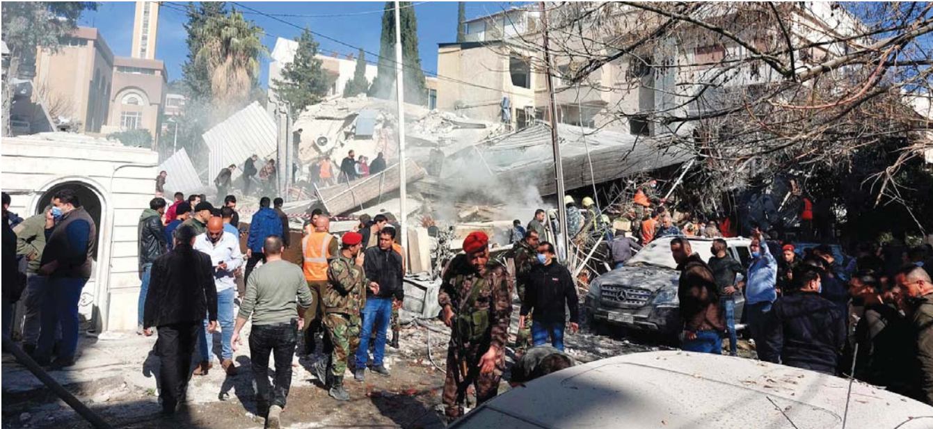
People and security forces gather in front of a building destroyed in a strike in Damascus.