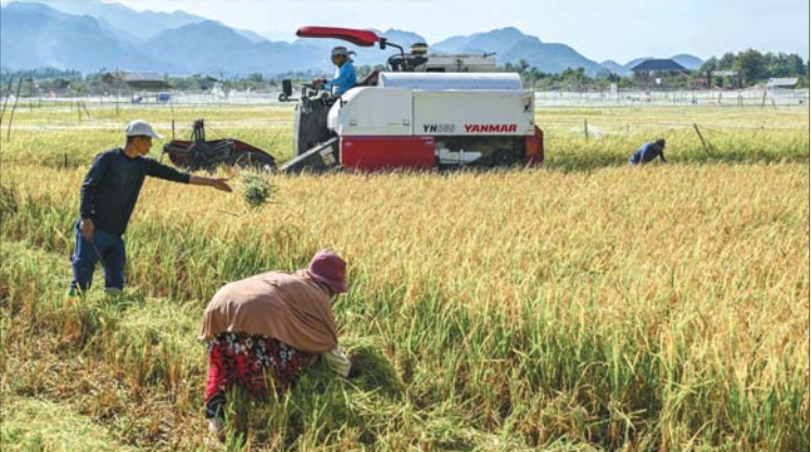
Farmers work during the harvest season at paddy fields in Lhoknga, Indonesia’s Aceh province, yesterday.