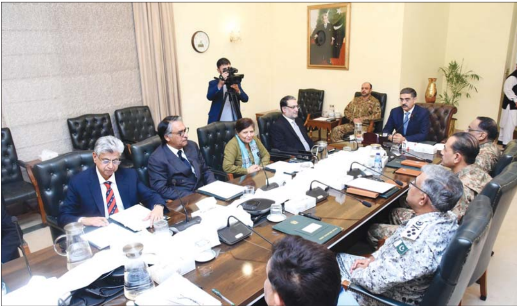
Pakistan's Prime Minister Anwar-ul-Haq Kakar chairs a National Security Committee meeting along with armed forces chiefs and other government officials in Islamabad. Pakistan and Iran "agreed to de-escalate" tensions yesterday, Islamabad said, after trading deadly airstrikes on militant targets in each other's territory this week.