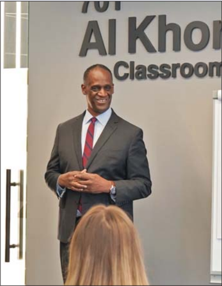
The US ambassador at QIASS.