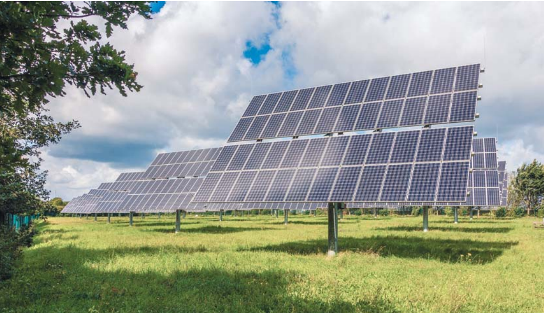
A study by the Dhaka-based Centre for Policy Dialogue last year estimated that renewable energy could add about 13,800 jobs by 2030 – and if Bangladesh pursued a highly aggressive energy transition, more than 37,000 new jobs could be created.