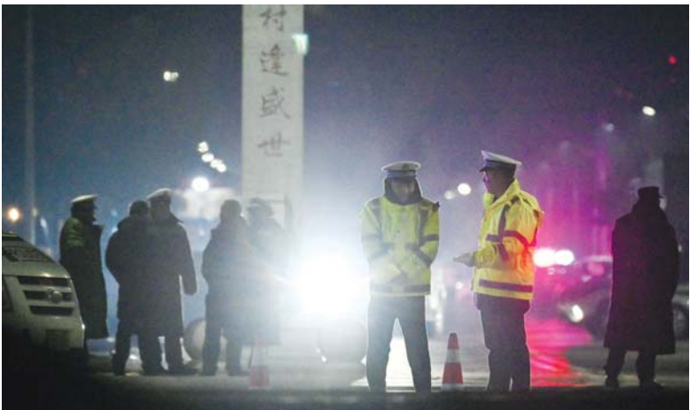
Police stand guard after a school was engulfed by fire in Yanshanpu in China’s Henan province yesterday.

school while they worked outside the area. Xinhua reported the flames had been extinguished by 11:40pm on Friday night. The injured survivor “is currently receiving treatment at the hospital and is in stable condition”, according to the country’s official news agency. Local authorities are investigating the fire’s cause, and at least one person linked to the school has been detained, Xinhua said. Yanshanpu village lies on the outskirts of Nanyang, a city of nearly 10mn. Little information about the boarding school is publicly available, though social media videos published earlier showed young children including kindergarteners wearing smocks with the school’s logo as well as older children learning calligraphy. Chinese social media users on Saturday expressed outrage about the fire and called for any safety lapses to be punished. “It’s too scary, 13 children from 13 families, all gone in an instant...if there is no severe punishment their souls will not rest in peace,” one