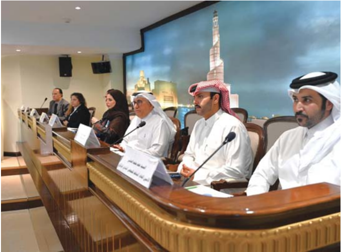
HMC team gives a presentation at Central Municipal Council session.

The president honoured the team from HMC by presenting a commemorative plaque as a token of appreciation for the centre's efforts in smoking control.