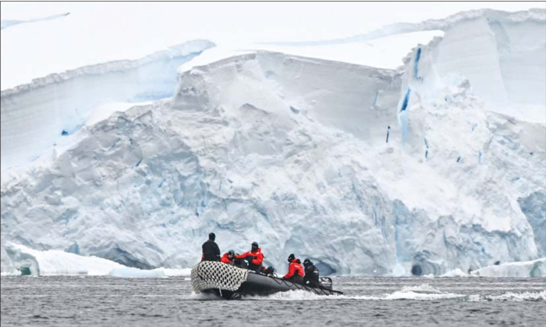
Crew members of the Colombian research vessel "ARC Simon Bolivar" ride a boat at the Gerlache Strait, which separates the Palmer Archipelago from the Antarctic Peninsula, in Antarctica.

"I will analyse these sediment samples for persistent organic pollutants, and we will look at the effects of humans, here, in this environment," he added. Page 11