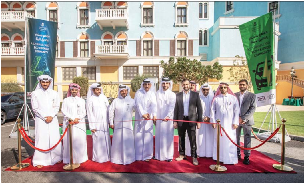
UDC officials during the launching of the state-of-the-art EV charges at The Pearl Island.

Among them, six can efficiently charge EVs with a capacity of up to 60kWh and 120kwh, while one stands out as Qatar's fastest charger, capable of charging EVs up to 180kWh. This impressive addition is the result of a collaborative effort with Kahramaa's Tarsheed programme, a strategic support part-