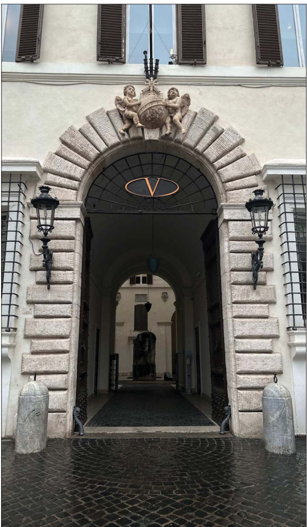
VCUarts Qatar students visited headquarters of Fendi and Valentino in Rome.