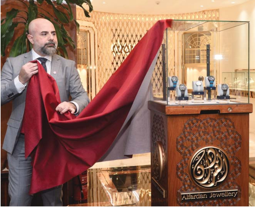
Biour unveiling the latest Ulysse Nardin collection.

“The club envisions itself as part of a collaborative landscape with other clubs, open to being part of the broader envi-