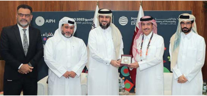
Officials at the signing ceremony.

He stated that, under the agreement, Qatar Charity has been given the opportunity to promote an