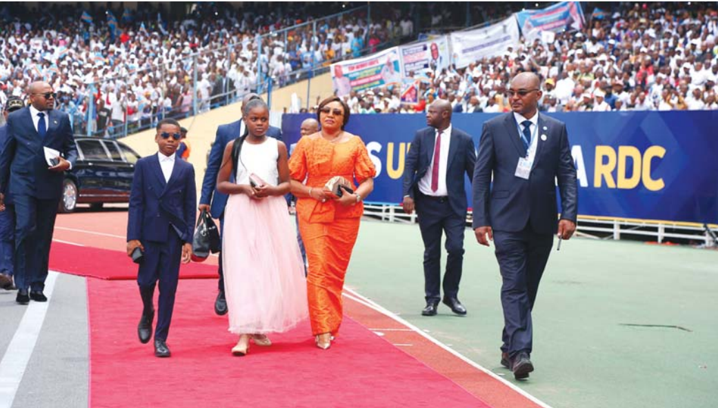
First Lady Denise Nyakeru Tshisekedi arrives with her children at the swearing-in ceremony of her husband at Kinshasa’s Martyrs stadium.

Constitutional reforms in 2018 removed a requirement that the presidency rotate among Comoros’ three main islands every five years, allowing Assoumani to seek re-election in 2019. - Reuters/AFP