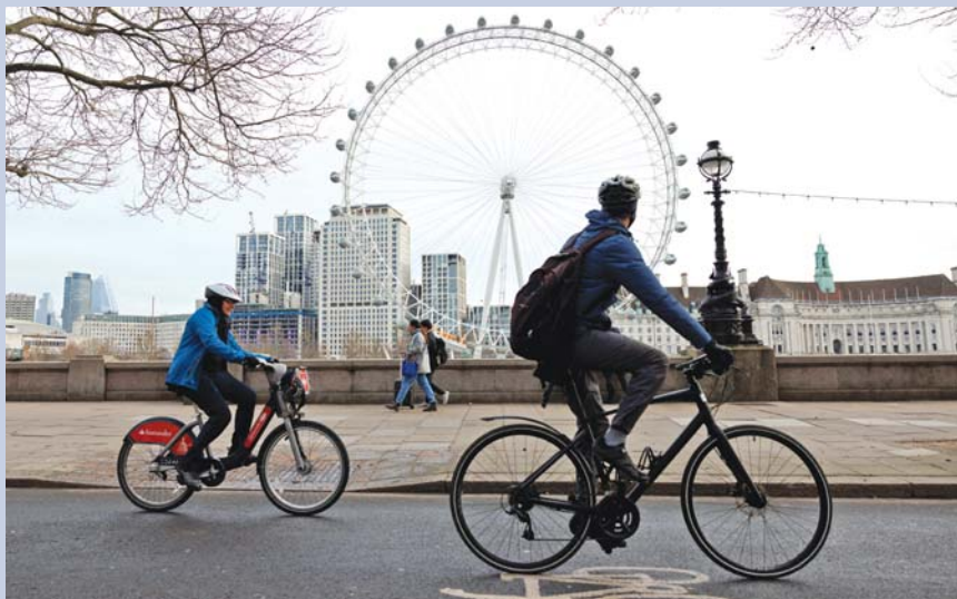
Two cyclists pedal past The London Eye in London, Britain.