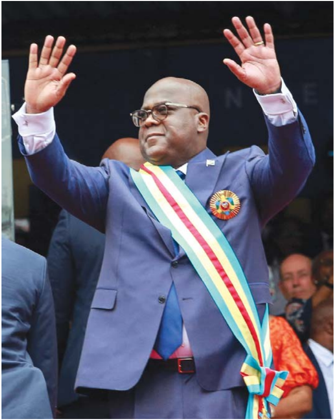
Tshisekedi waves as he arrives to be sworn in for a second term as president during the inauguration ceremony at Kinshasa’s Martyrs stadium.

Denis Mukwege, who won the Nobel Peace Prize for his work with rape victims, scored just 0.22%.