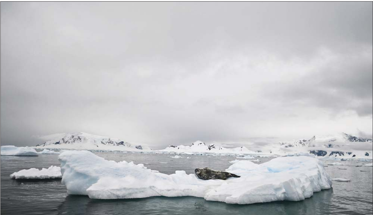
View of an iceberg at the Gerlache Strait, which separates the Palmer Archipelago from the Antarctic Peninsula, in Antarctica yesterday.

It was impossible to see through the snow and fog on the Antarctic seas but expedition leader Ian Strachan knew his ship was approaching a true behemoth: the world's biggest iceberg lay somewhere ahead. "Then the clouds lifted and we could see this expansive — almost abstract — white line that extended each way across the horizon," he told AFP. As the ship got closer during its visit on Sunday, huge gaping crevasses and beautiful blue arches sculpted into the edge of the iceberg came into focus. Waves up to 4m (13 feet) high "smashed" and "battered" its wall, breaking off small chunks and collapsing some arches, Strachan said. He compared sailing along the endless jagged edge to looking at sheet music. "All the cracks and arches were different notes as the song played." The tooth-shaped iceberg named A23a is nearly 4,000 square km (1,550 square miles) across, making it more than twice the size of Greater London. After three decades stuck to the Antarctic ocean floor, the iceberg is now heading north on what could be its final journey. It contains an estimated one trillion tonnes of fresh water that is likely to melt off into the ocean along the way. The iceberg, which is up to 400m thick in places, is currently drifting between Elephant Island and the South Orkney islands. Strachan was speaking to AFP as his ship, run by the expeditions firm EYOS, was wrapping up a private tour of the Antarctic Peninsula.