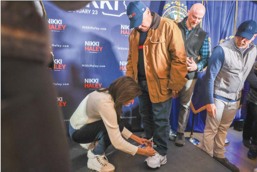
Republican presidential candidate, ex-UN ambassador Nikki Haley, ties a man's shoe after he arrives to greet her with an untied shoe during a campaign event held at Keene Country Club in Keene, New Hampshire.

"I have always said that. That is a game they play that I'm not going to play. I don't want to be vice-president," Haley added, according to the Post . Haley, who served as Trump's ambassador to the United Nations, is barnstorming New Hampshire ahead of its Tuesday contest and further distancing herself from Trump in a state known for a more moderate brand of Republicanism. Its semi-open primary can also draw more centrist voters, who may be turned off by Trump's criminal charges, increasingly authoritarian language and efforts to overturn his 2020 re-election loss. She must