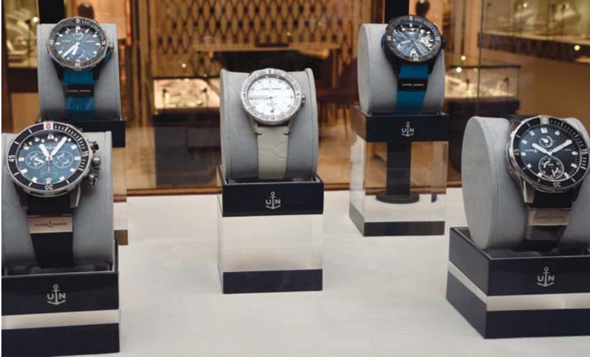
The latest Ulysse Nardin collection.

ronment of watches and horology in the country, and welcoming initiatives and collaborations,” he added.