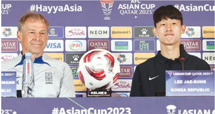
South Korea's coach Jurgen Klinsmann (left) and midfielder Lee Jae-sung at a press conference yesterday.