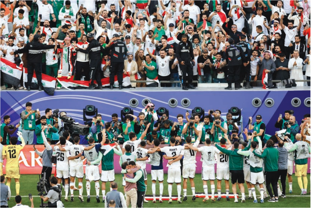
Iraq players celebrate in front of their fans after the match.

rai Blue struggled to test the Iraqi goalkeeper until the 94th minute when Endo finally scored with a header from a corner. The match's final moments were tense as Japan desperately sought an equaliser, but Iraq managed to hold on. "The atmosphere was like an away game and conceding early hurt us," said Moriyasu. "Conceding at the end of the first half hit us hard and made it a very difficult game. We need to learn from our mistakes. We analysed before the game and knew how Iraq would play at the start, they did play very aggressively. Unfortunately we couldn't handle it, I know we need to do more." While the result in its entirety is not disastrous for Japan. But a second-place finish in the group could set them on a potential collision course with South Korea in the last 16.