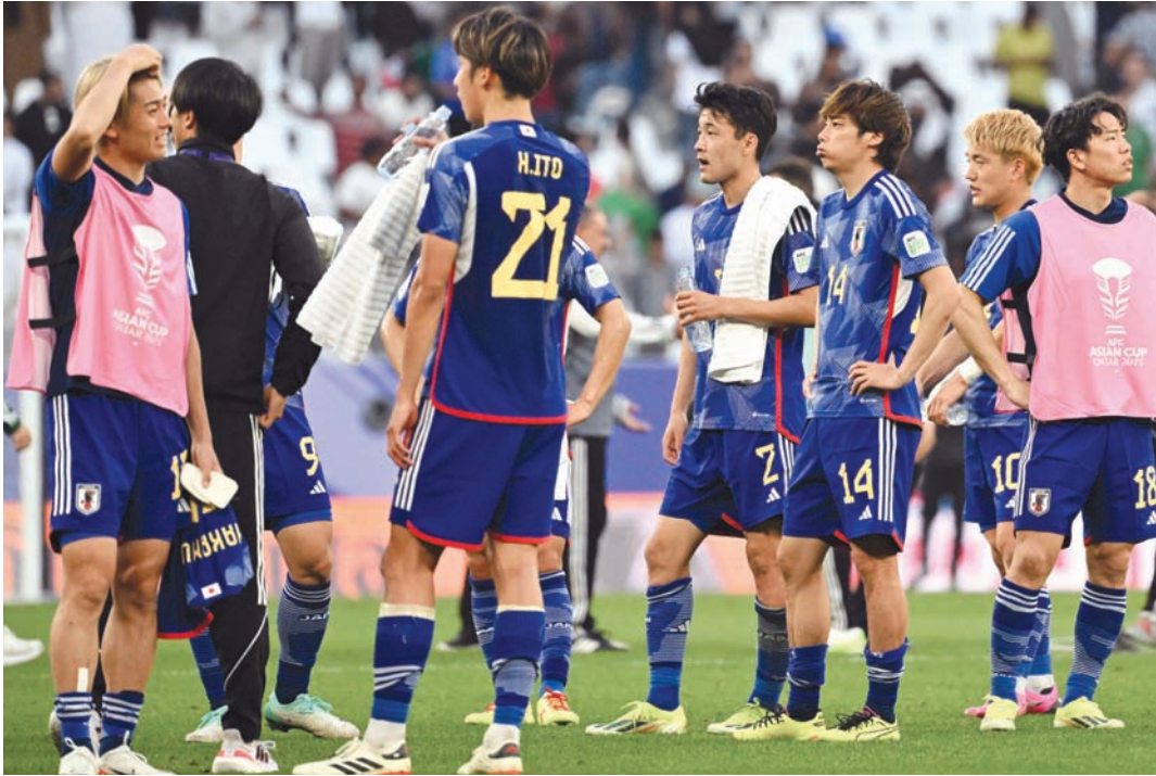
Dejected Japan's players at the end of the match yesterday.