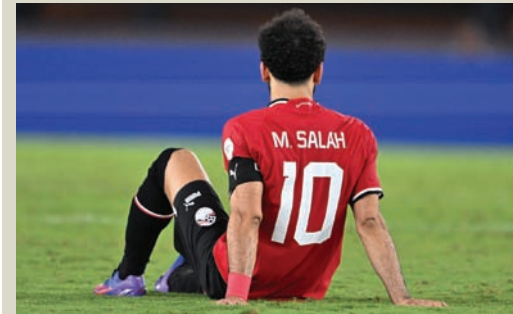
Egypt's forward Mohamed Salah reacts after being injured during the Africa Cup of Nations Group B match against Ghana at the Felix Houphouet-Boigny Stadium in Abidjan on Thursday.

ABIDJAN: Mohamed Salah was set to undergo tests yesterday on his left hamstring after coming off injured in Egypt's 2-2 draw with Ghana at the Africa Cup of Nations, the team's doctor said. The Liverpool superstar came off just before half-time in the AFCON Group B match at the Felix Houphouet Boigny Stadium in Abidjan on Thursday. The 31-year-old appeared to be walking normally at the Egyptian team hotel in Ivory Coast's economic capital. Egypt's final Group B match against Cape Verde on Monday is set to be decisive in their quest to reach the last 16 of the competition. They needed an injury-time penalty from Salah to salvage a 2-2 draw with Mozambique in their opening game at the tournament.