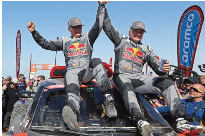
Team Audi Sport's Carlos Sainz and co-driver Lucas Cruz celebrate after winning in the car category at the Dakar Rally following the conclusion of Stage 12 - from Yanbu to Yanbu - Saudi Arabia, yesterday.