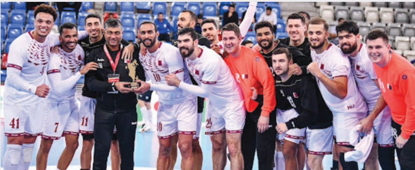
Qatar's handball team qualified for 2025 World Championship to be held in Croatia, Denmark and Norway. With its second victory over Iran 27-23 in their second main round match of the 21st Asian Men's Championship, which is currently being held in Bahrain, Al Annabi sealed their ticket to world championships. Qatar had earlier defeated UAE 25-21. They will face Japan tomorrow. In preliminary round, defending champions Qatar showcased dominance, securing the first position in Group A by defeating Kuwait, Oman, and Chinese Taipei.