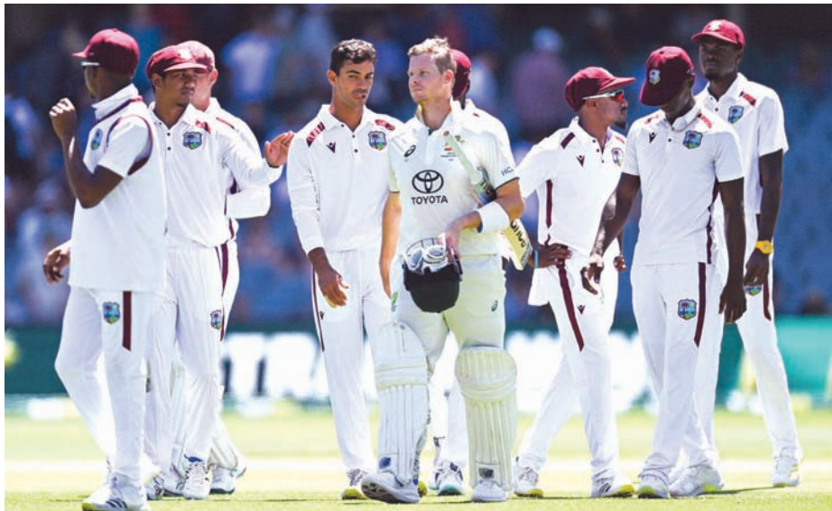
Australia's Steve Smith (centre) reacts after his team's victory in the first Test against the West Indies in Adelaide yesterday.

weakened squad. The Caribbean side fielded three debutants after their best all-rounders, Jason Holder and Kyle Mayers, skipped the series opting to play in lucrative Twenty20 leagues instead. Australia had no such concerns though and hometown hero Head once again proved his worth in the middle order by smashing a rapid 119 in the first innings that made all the difference. Thoroughly outplayed, West Indies may prefer to look at the silver lining having unearthed a future match-winner in Shamar Joseph, who dazzled in his Test debut. The 24-year-old fast bowler from Guyana smashed 36 at number 11, their second highest individual score in the first innings,