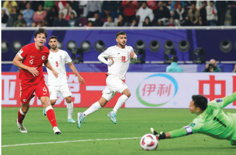
Iran's forward Mehdi Ghayedi (centre) looks on as he scores against Hong Kong during the Asian Cup Group C match at the Khalifa International Stadium in Doha.

The second half started with intensity from both sides, but with play centred around the