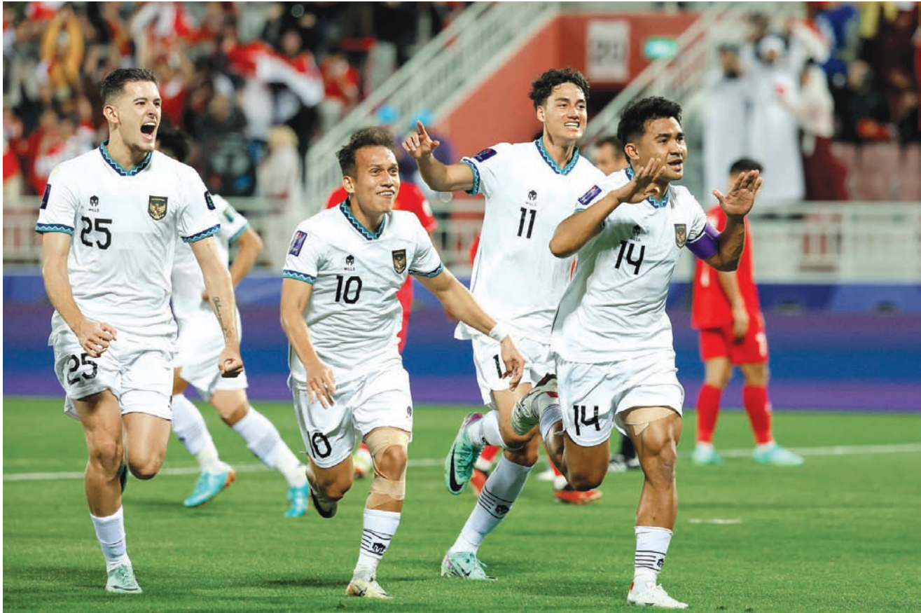
Indonesia's Asnawi Mangkualam (right) wheels away in celebration with his teammates after scoring from the penalty spot during the AFC Asian Cup Group D match against Vietnam at the Abdullah Bin Khalifa Stadium yesterday.