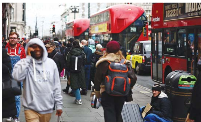
A beggar sits on the pavement as shoppers and red London buses pass by on Oxford Street in central London.