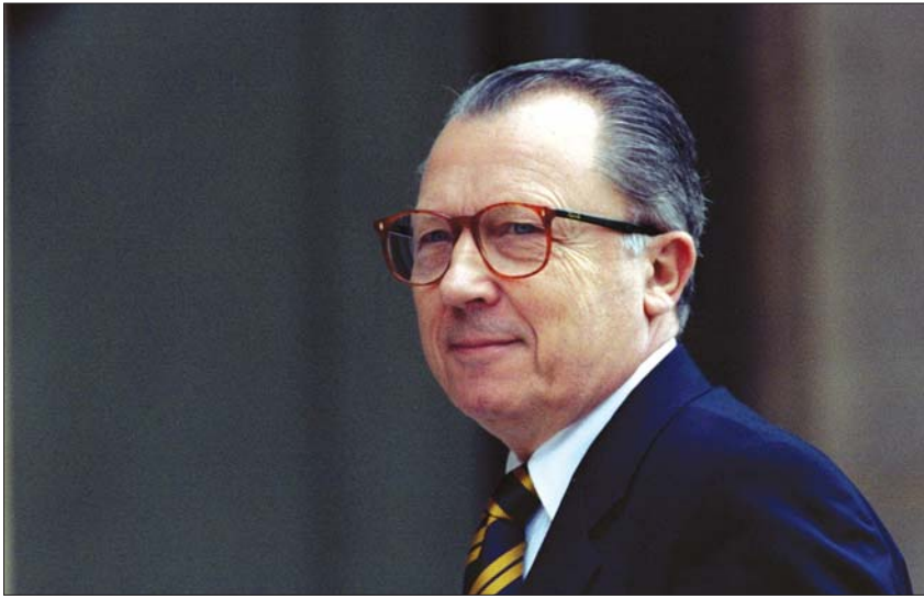
END OF AN ERA: Jacques Delors.

He oversaw a period of rapid enlargement, with the 10-member European Com-