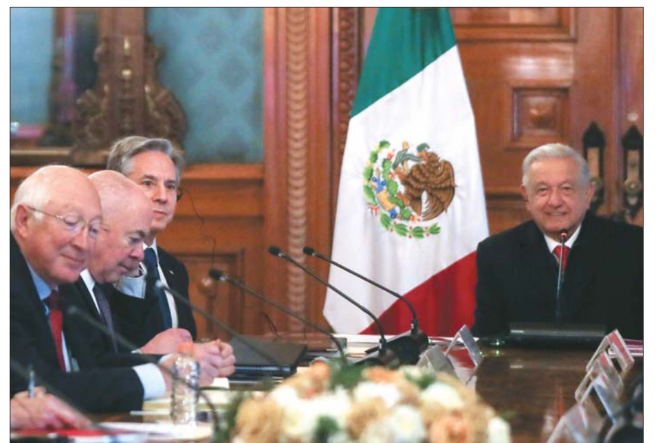
US Secretary of State Antony Blinken (third from left) attends a meeting with Mexican President Andres Manuel Lopez Obrador and US Secretary of Homeland Security Alejandro Mayorkas to discuss migration, in Mexico City yesterday.