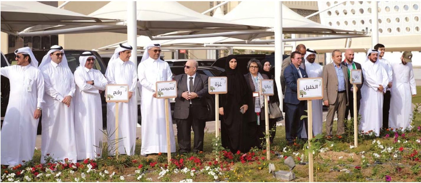
Environmental solidarity event held, showcasing the close ties between the QU community and the history and culture of Palestine.