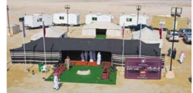
The activities of Mazhab Young Falconer aims to encourage young people to invest in leisure time through directing them towards respecting the authentic Arab traditions.

public tenets when they come across to handle hunting activities from Islamic and Shariah perspectives, as well as learning the etiquette of Majlis, hospitality and preparation of Arabic coffee, al-Qahtani pointed out.