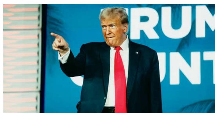
Trump arrives to speak to his supporters during the Florida Freedom Summit last month.

FEDERAL BUREAUCRACY - Trump would seek to decimate what he terms the "deep state" - career federal employees he says are clandestinely pursuing their own agendas - through an executive order that would reclassify thousands of workers to enable them to be fired. That would likely be challenged in court. He has vowed to fire what he terms "corrupt" actors in national security positions and "root out" his political opponents.