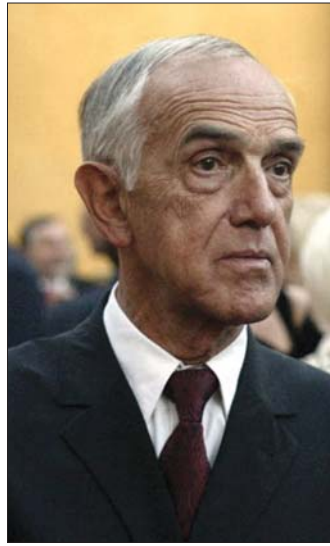
Austrian engineer Gaston Glock at an event in Velden, Carinthia, Austria. Right: A woman points at a Glock handgun during the annual National Rifle Association (NRA) convention in Dallas, Texas.

"At the end of the 1990s, Glock was the most mentioned brand"