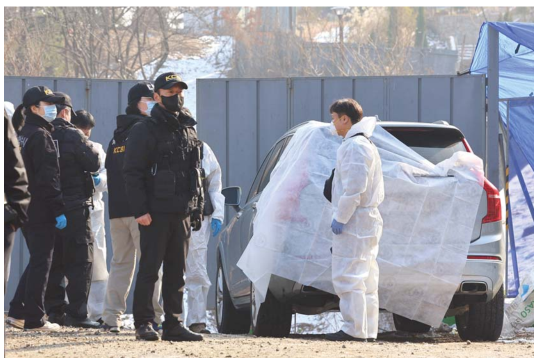
Police investigate a car in which the body of actor Lee Sun-kyun was found at a park in central Seoul.

of a hostess employed at a high-end bar in Seoul.