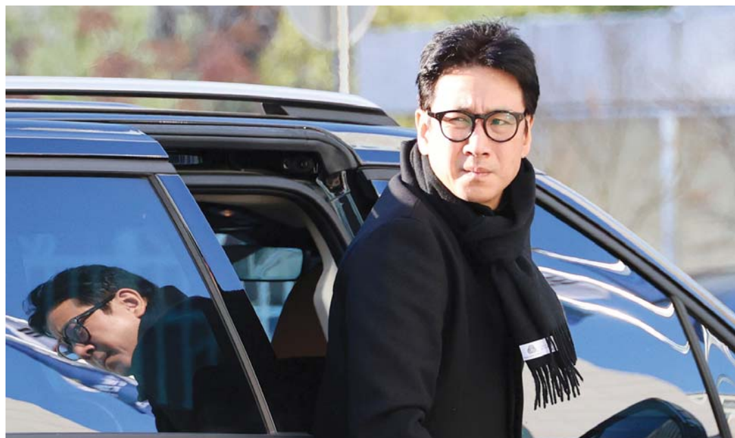
South Korean actor Lee Sun-kyun arriving at a police station in Incheon for his police questioning over his alleged use of marijuana and other psychoactive drugs earlier this week.

Lee's reputation suffered a significant blow when South Korean authorities launched an investigation into his alleged drug use in October. He had been suspected of using illicit drugs at the residence