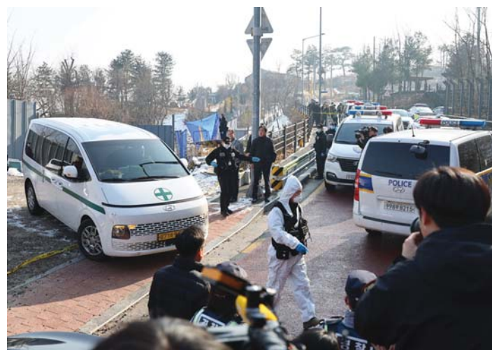
An ambulance carrying the body of actor Lee Sun-kyun leaves a park in central Seoul.

Once celebrated for his wholesome image, local news outlets reported that the actor was being dropped from television and commercial projects following the scandal. A graduate of South Korea's prestigious Korea National University of Arts, Lee made his acting debut in 2001 in