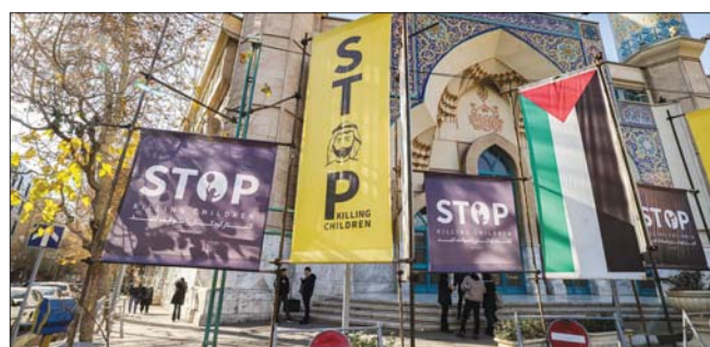
Banners condemning Israel and calling for an end to the conflict in the Gaza Strip hang outside a mosque along a street in Teheran, yesterday.

Iran, which supports Hamas financially and militarily, has hailed the deadly attacks as a "success" but denied any direct involvement. "Undoubtedly, part of the great historic victory...is due to the efforts