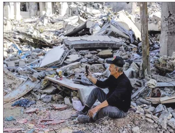
A Palestinian man uses his phone as he sits amid the rubble of destroyed buildings in Gaza City. Thanks to embedded SIM cards, Palestinians can still access the Internet and maintain a channel of communication with loved ones abroad.

Embedded directly into a device, they can be activated using a QR code, which Gaza residents receive from family members liv-