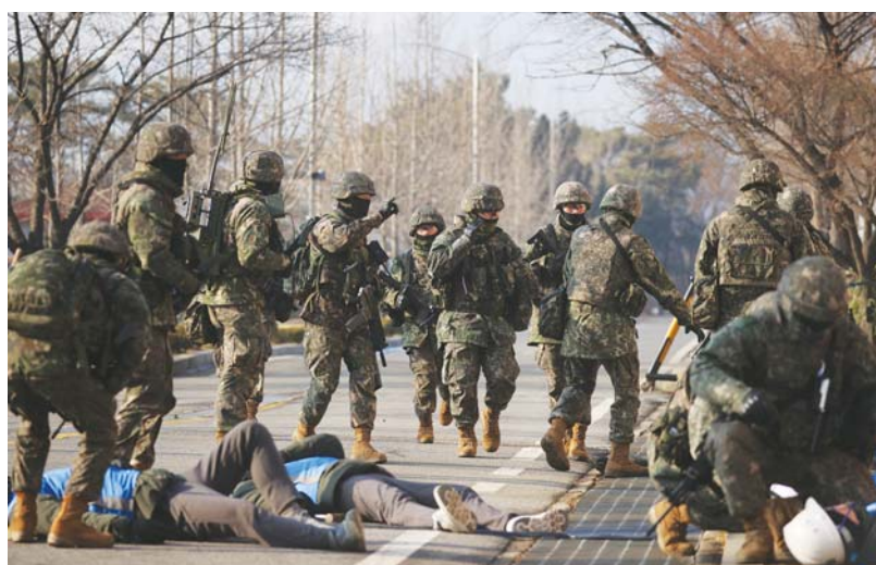
South Korean soldiers take part in an anti-terror drill against North Korea's possible provocations amid mounting tensions on the Korean peninsula, in Seoul.

In 2011, widespread flooding killed hundreds and damaged millions of homes around the country.