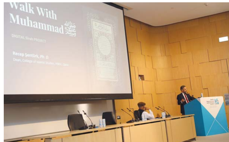
The lecture analysed the Sirah of the Prophet Muhammad (PBUH) and how it can provide guidance and inspiration to Muslims around the world.