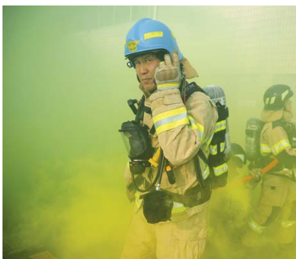
Firefighters take part in an anti-terror drill.