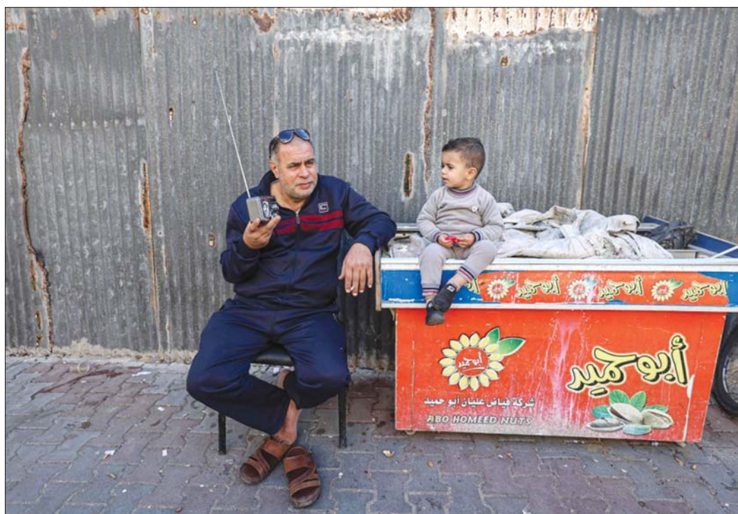
A Palestinian man listens to his radio in a refugee camp in Rafah in the southern Gaza Strip.

"We continuously assess the situation and plan a next review on Friday," the spokesperson said.