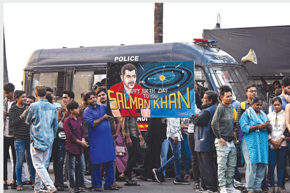
Fans of Bollywood actor Salman Khan display his portrait outside the artist's residence to celebrate his birthday in Mumbai yesterday.