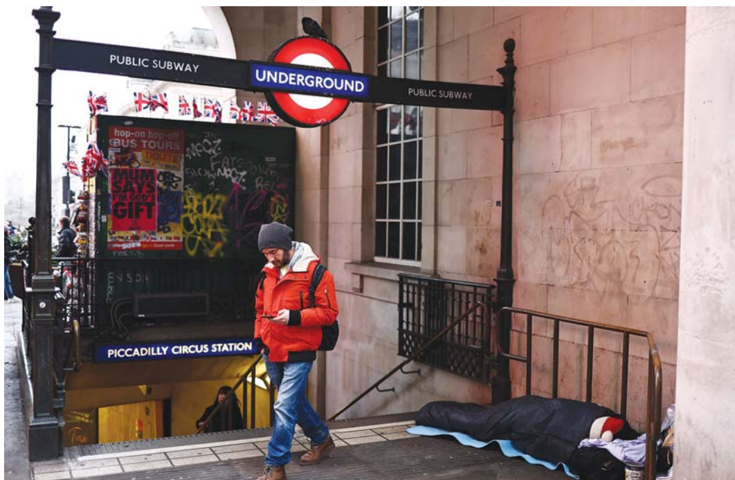
Boxing Day footfall from shoppers was up 4% across all UK retail, high streets enjoyed a nearly 10% increase in shoppers on last Boxing Day, while central London saw footfall up 10.6% compared with last year.

"Many people may be tightening their purse strings given the cost of living status, or may still be spending time with their families on Boxing Day and not be heading out to stores and destinations until