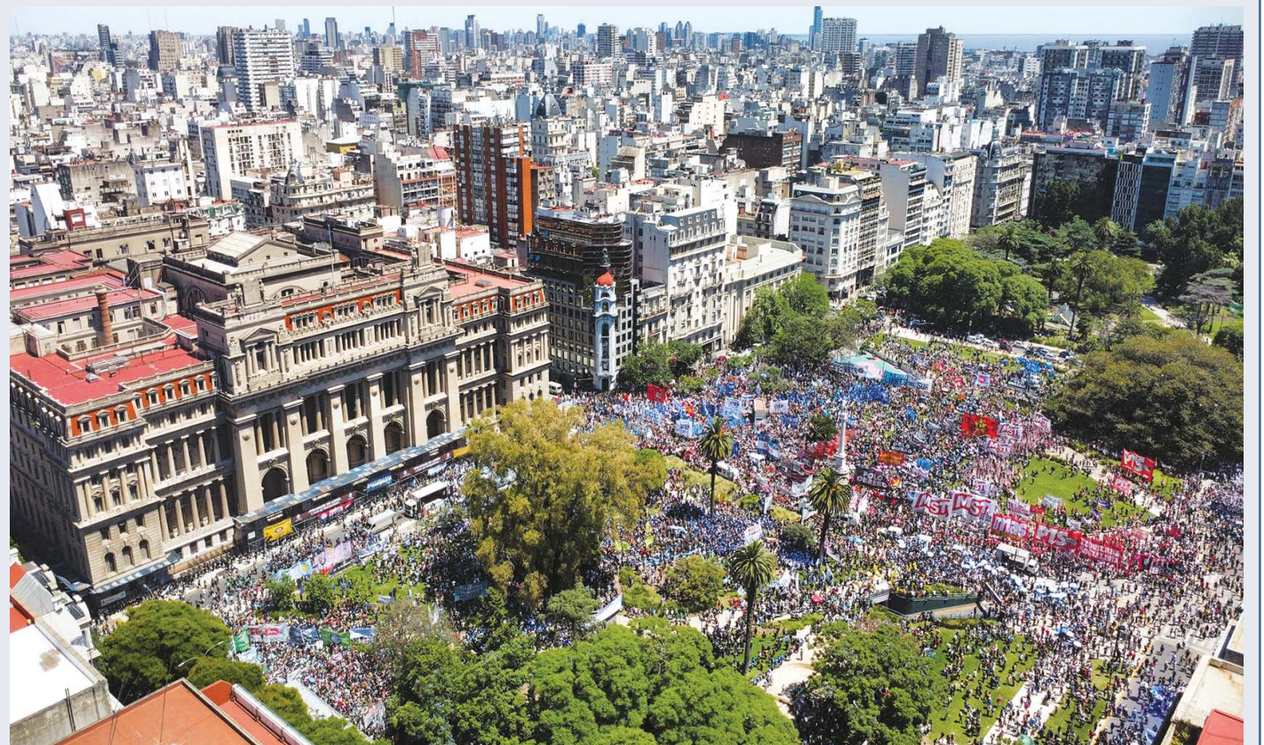
Members of the Argentine Workers' General Confederation and social organisations attend a protest against new Argentine President Javier Milei's economic reforms outside the Justice Palace in Buenos Aires yesterday.