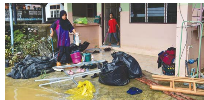
People clean up their home after flooding in the Ban Yakang area of Mueang district in Narathiwat.

This month's test of the North's latest ballistic missile followed November's successful launch of its first military spy satellite, while a constitutional revision in September enshrined use of nuclear weapons as a national defence policy.