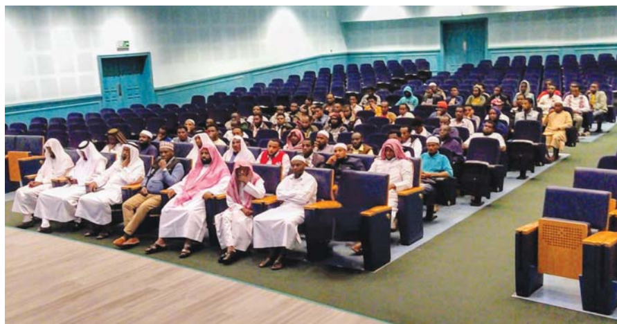
Various programmes were held to present an integrated and balanced image of Islam and its cultural and civilisational values.

Also, it helps the participants learn entertainment etiquette in Islam and the importance of sports in a person's healthy life.