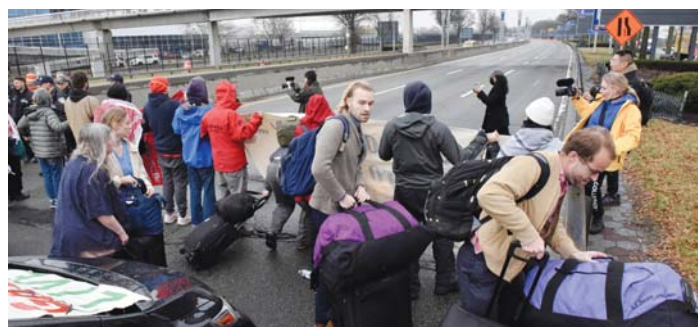
Airport travellers walk past pro-Palestinian demonstrators blocking traffic on the road that leads to John F Kennedy airport, in New York City, yesterday.

said an Israeli air strike killed 20 Palestinians near the Al-Amal Hospital in Khan Younis, in the southern Gaza Strip.