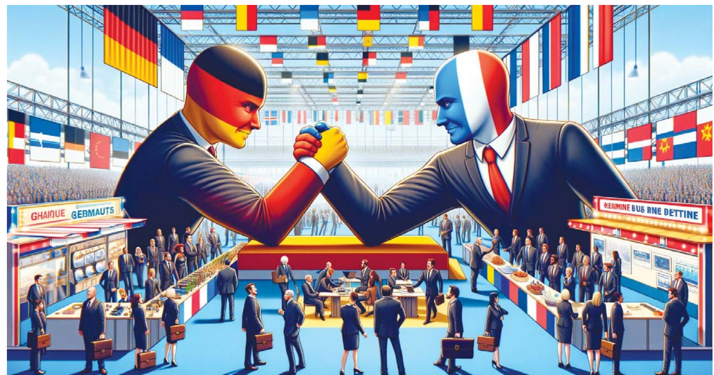
On their own, the French and German economies lack the necessary scale to compete effectively against the world's two largest economies, the US and China, especially in critical emerging sectors like artificial intelligence and digital services, says the author.