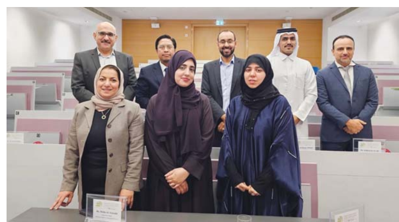
The presentations, according to QU, serve as a spotlight on the substantial research endeavours undertaken by 10 candidates pursuing a Master of Science in Biomedical Sciences.