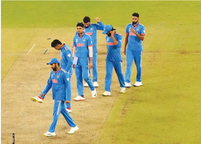
India players look dejected after losing the ICC Cricket World Cup final against Australia in Ahmedabad on Sunday.

The former captain said that "there's not one particular reason you can pin it down to," adding