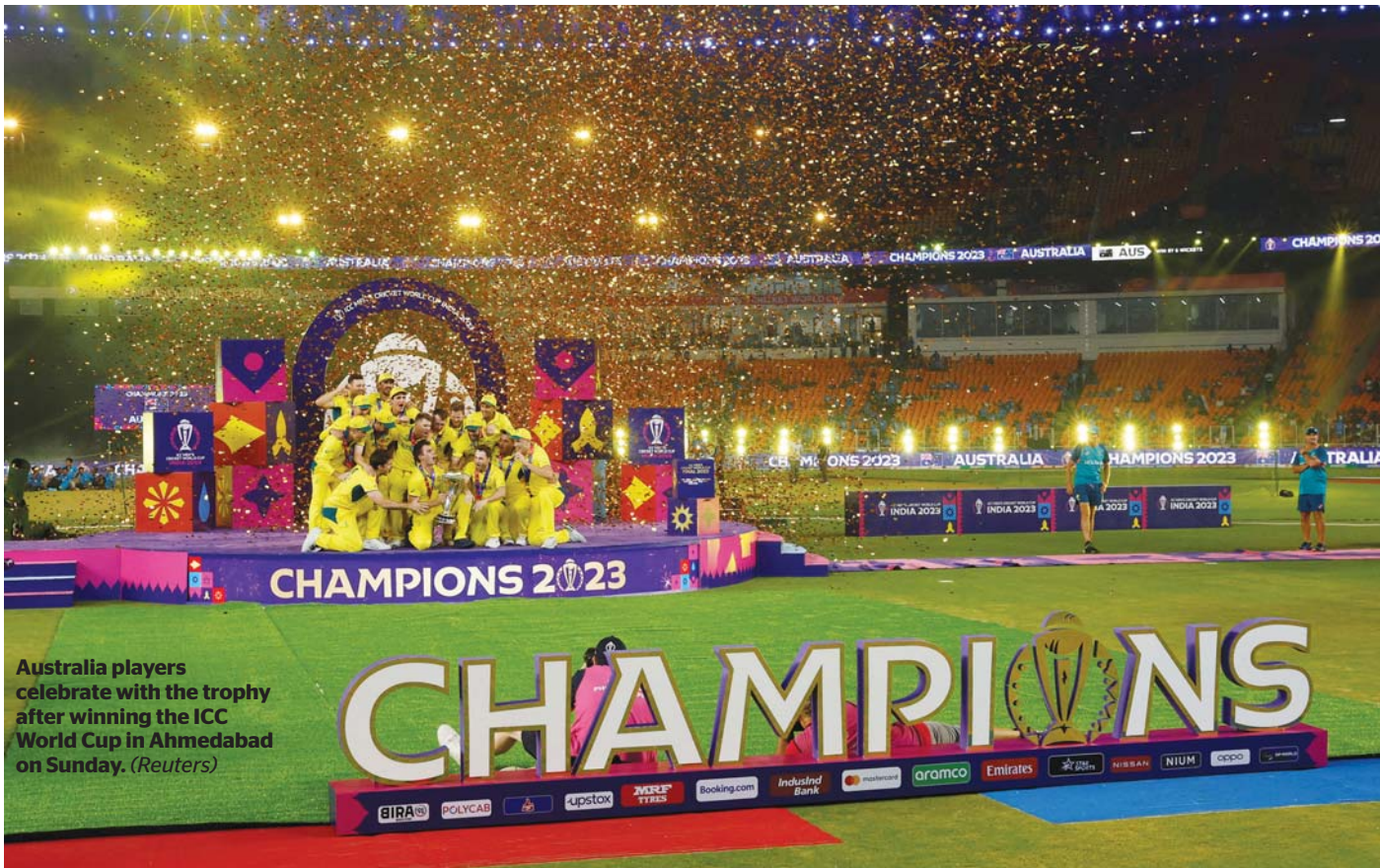
Australia players celebrate with the trophy after winning the ICC World Cup in Ahmedabad on Sunday.

Pat Cummins also captained his team to WTC trophy win in June