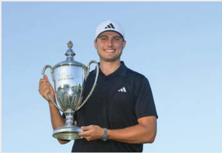
Ludvig Aberg of Sweden poses for a photo with the trophy after winning The RSM Classic on the Seaside Course at Sea Island Resort in St Simons Island, Georgia.