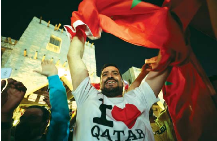
Morocco fans celebrate in Souq Waqif after unfancied Morocco qualified for the knockout stages.

The World Cup featured 64 matches over a month, with the region embracing football as its common language. These matches took place in eight newly built stadiums: Khalifa International Stadium, Al Janoub Stadium, Education City Stadium, Al Rayyan Stadium, Al Thumama Stadium, 974 Stadium, Al Bayt Stadium and Lusail Stadium. These architectural masterpieces showcased Qatar's engineering creativity, evolving from concept models in 2009 to reality, and received worldwide acclaim. Their designs, which topped international press coverage,