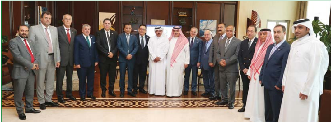
The meeting in Doha is hosted by Mowasalat.