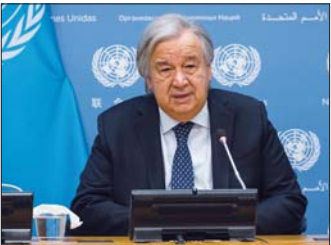
UN Secretary-General Antonio Guterres speaks at the UN headquarters in New York.

A UN protectorate in Gaza would not solve the conflict there, the body’s secretary-general said yesterday, calling instead for a “transition period” involving Arab nations and the US and leading to a two-state solution. Antonio Guterres said it was “important to be able to transform this tragedy into an opportunity” — which, for him, meant moving “in a determined and irreversible way to a two-state solution.” This means, after the current war between Israel and Hamas fighters in Gaza ends, “a strengthened Palestinian Authority, assuming responsibilities in Gaza,” he said. But the Palestinian Authority cannot go into Gaza backed by Israeli tanks, he added — meaning the “international community needs to look into a transition period.” “I do not think that a UN protectorate in Gaza is a solution,” however, Guterres said.