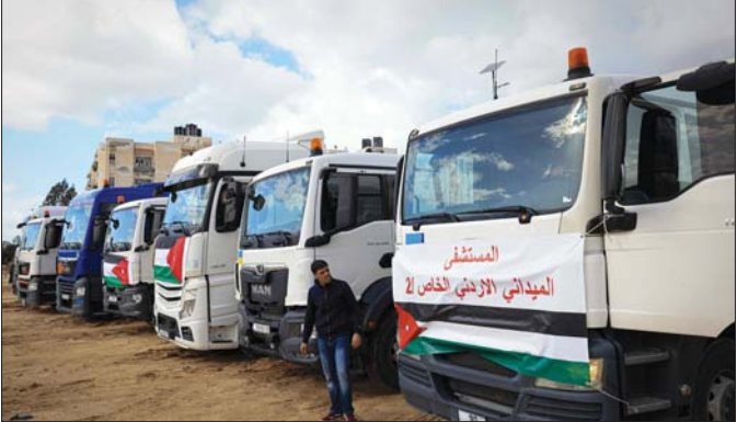
An aid convoy transporting a Jordanian field hospital is seen parked upon arrival in Khan Yunis in the southern Gaza Strip, yesterday, after crossing through the Rafah border crossing with Egypt.