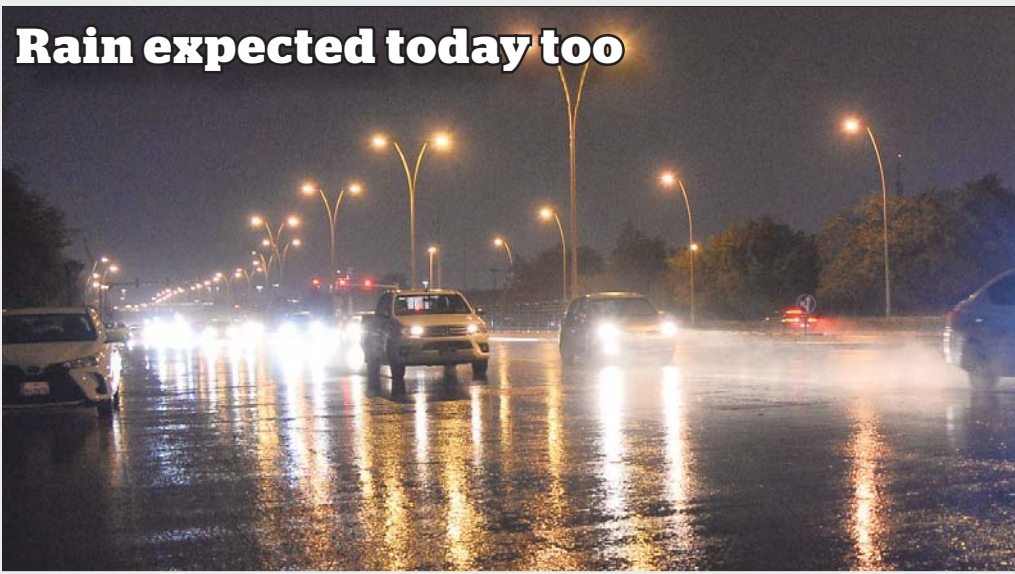
Scattered rain was observed at some areas in Qatar and offshore yesterday (Monday), the Met office said. The forecast for today (Tuesday) is thundery rain associated with strong wind and poor horizontal visibility, both inshore and offshore. High seas are also expected offshore.