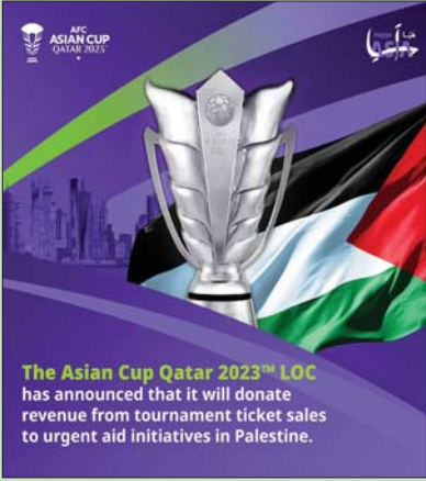
The Asian Cup Qatar 2023™ LOC has announced that it will donate revenue from tournament ticket sales to urgent aid initiatives in Palestine.