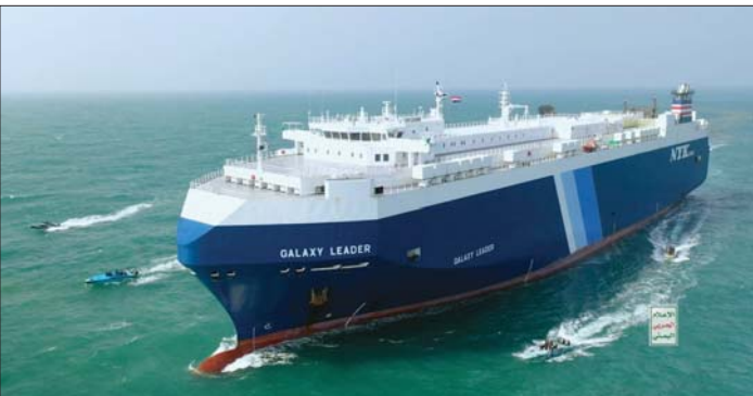
The Galaxy Leader cargo ship is escorted by Houthi boats in the Red Sea in this photo released yesterday.