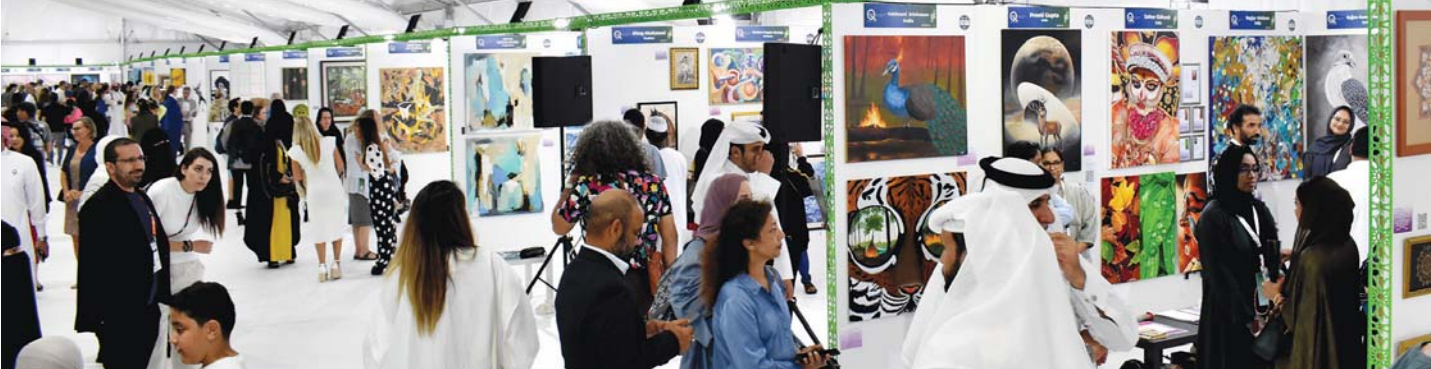
The fifth edition of the Qatar International Art Festival runs until November 25 at the Cultural Zone of Expo 2023 Doha.