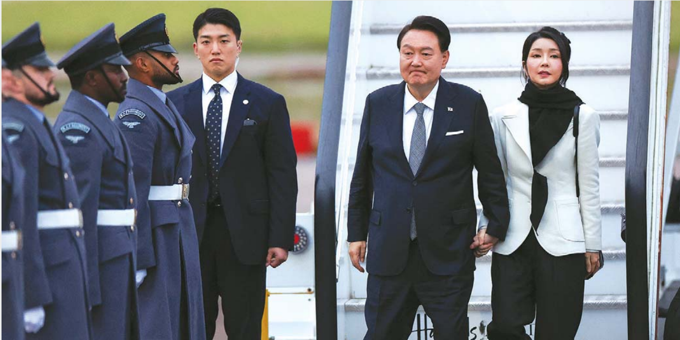
Members of the Royal Air Force (RAF) welcome South Korean President Yoon Suk-yeol and his wife Kim Keon-hee, as they arrive at Stansted Airport, near London, Britain, yesterday. The South Korean president is hoping to boost economic ties and security partnerships with Britain.