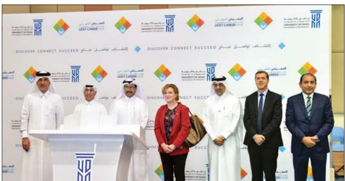
Dignitaries at the career fair opening yesterday.