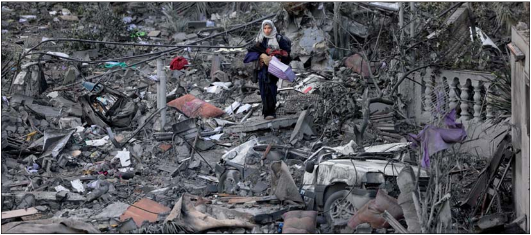
A Palestinian woman walks on building rubble following an Israeli strike in Rafah in the southern Gaza Strip, yesterday.