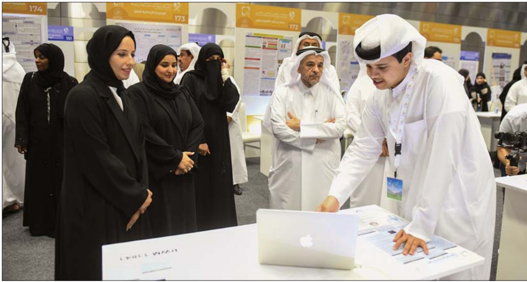
HE the Minister of Education and Higher Education Buthaina bint Ali al-Jabr al-Nuaimi takes a look at the exhibits displayed at National Science Research and Innovation Week.