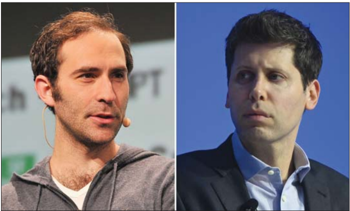
This combination of file pictures shows Sam Altman (right) and founder and the then-CEO of Twitch Emmett Shear.

— suffocated the local economy, infiltrated public institutions and terrorised its people for decades. Informants — a relatively rare phenomenon within the 'Ndrangheta due to blood ties between members — recounted how weapons were hidden in cemetery chapels and ambulances used to transport drugs, and municipal water supplies diverted to marijuana crops. Those who opposed the mafia found dead puppies, dolphins or goat heads dumped on their doorsteps, sledgehammers taken to store fronts or cars torched. Less lucky were those beaten or fired at — or those whose bodies were never found. Hundreds of lawyers and a few dozen members of the media attended the sentencing in the heavily secured courtroom bunker in the Calabrian city of Lamezia Terme.