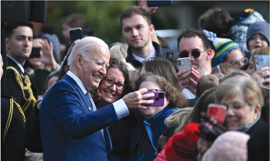
US President Joe Biden takes part in the annual Thanksgiving Turkey Pardon on the South Lawn of the White House in Washington, DC yesterday. Each year, the president pardons one or two lucky gobblers for unspecified offences, sparing them from the Thanksgiving dinner table.

Joe Biden joked about his age as he celebrated his 81st birthday yesterday, but the issue is no laughing matter for many voters as he seeks re-election next year. His birthday renews the focus on the fact that the Democrat is the oldest president in American history — and that if he wins a second term next year he will be 86 by the time he leaves. While his aides regularly lash out at those who cast doubt on whether he is too old to be commander-in-chief, Biden likes to suggest that age brings wisdom, or simply takes a light hearted approach. "It's difficult turning 60," the president said with a chuckle at the annual Thanksgiving turkey pardoning ceremony at the White House yesterday, the same day as his birthday. "This is the 76th anniversary of this event — and I want you to know I wasn't there for the first one," he quipped. But a moment in which he mixed up US singers Taylor Swift and Britney Spears is likely to reinforce impressions among voters who have been concerned by a