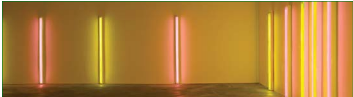
A large-scale installation by Flavin, Alternating pink and 'gold' , 1976.

Qatar Museums (QM) has opened the first in-depth presentation worldwide in nearly two decades of the work of the closely linked artists Dan Flavin (1933-1996) and Donald Judd (1928-1994). The exhibition is also the first major presentation of Flavin and Judd's works in the Mena (Middle East and North Africa) region. Flavin and Judd were considered two of the founders of minimalism, the widely influential art movement that broke free from traditional notions of painting and sculpture to focus on experiencing real space and materials. Flavin and Judd met in 1962 in New York, and quickly became central figures among a cohort of artists including Lee Bontecou, John Chamberlain, Yayoi Kusama, Sol Lewitt, Claes Oldenburg, and Frank Stella, who were charting the new terrain between painting and sculpture.