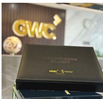
GWC has published Delivering Glory .

& Legacy, FIFA, host country institutions, commercial affiliates, fans, participating teams, the me-