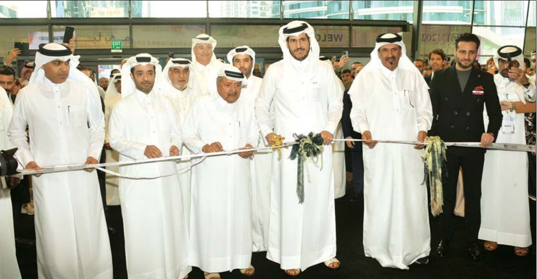
Dignitaries at the ribbon-cutting ceremony marking the opening of QTM 2023 yesterday.