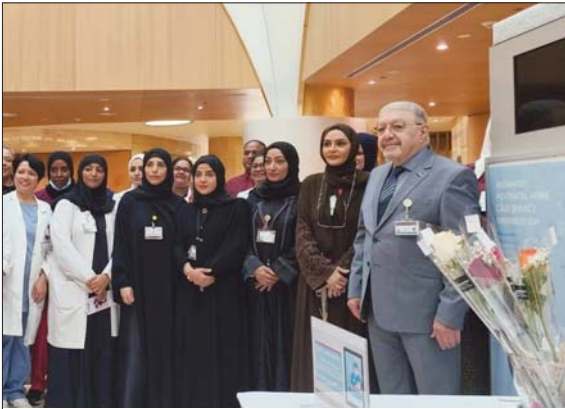
WWRC administration staff.

The aim of the service is to deliver safe, appropriate and timely midwifery postnatal care service to all C-Section women who