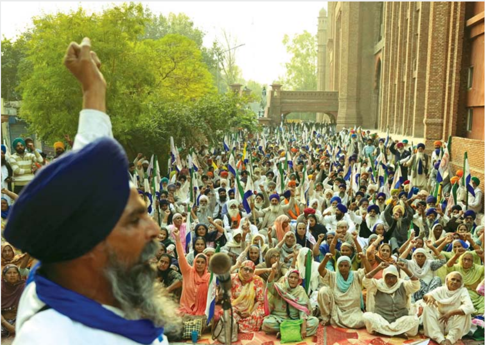
Farmers shout slogans as they demonstrate against the state and central governments, in Amritsar, India, yesterday demanding the withdrawal of registered FIRs (First Information Report) against farmers for burning crop residues.

Beijing warned Canberra against making "reckless and irresponsible accusations against China" after Australia said sonar pulses emitted by a Chinese warship "likely" injured its navy divers. "We urge the Australian side to respect the facts, stop making reckless and irresponsible accusations against China," a defence ministry spokesman said, adding China "did not engage in any activities that may have affected the Australian divers". Canberra accused Beijing of "unsafe and unprofessional" conduct at sea around the HMAS Toowoomba, a long-range frigate that had been supporting United Nations sanctions enforcement efforts within Japan's exclusive economic zone. Australian Defence Minister Richard Marles said divers were clearing fishing nets from the ship's propeller when the vessel was approached by a Chinese destroyer that "likely" injured a number of servicemen with its hull-mounted sonar.