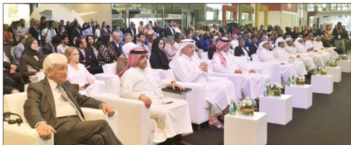
Some of the dignitaries at the conference of QTM 2023.