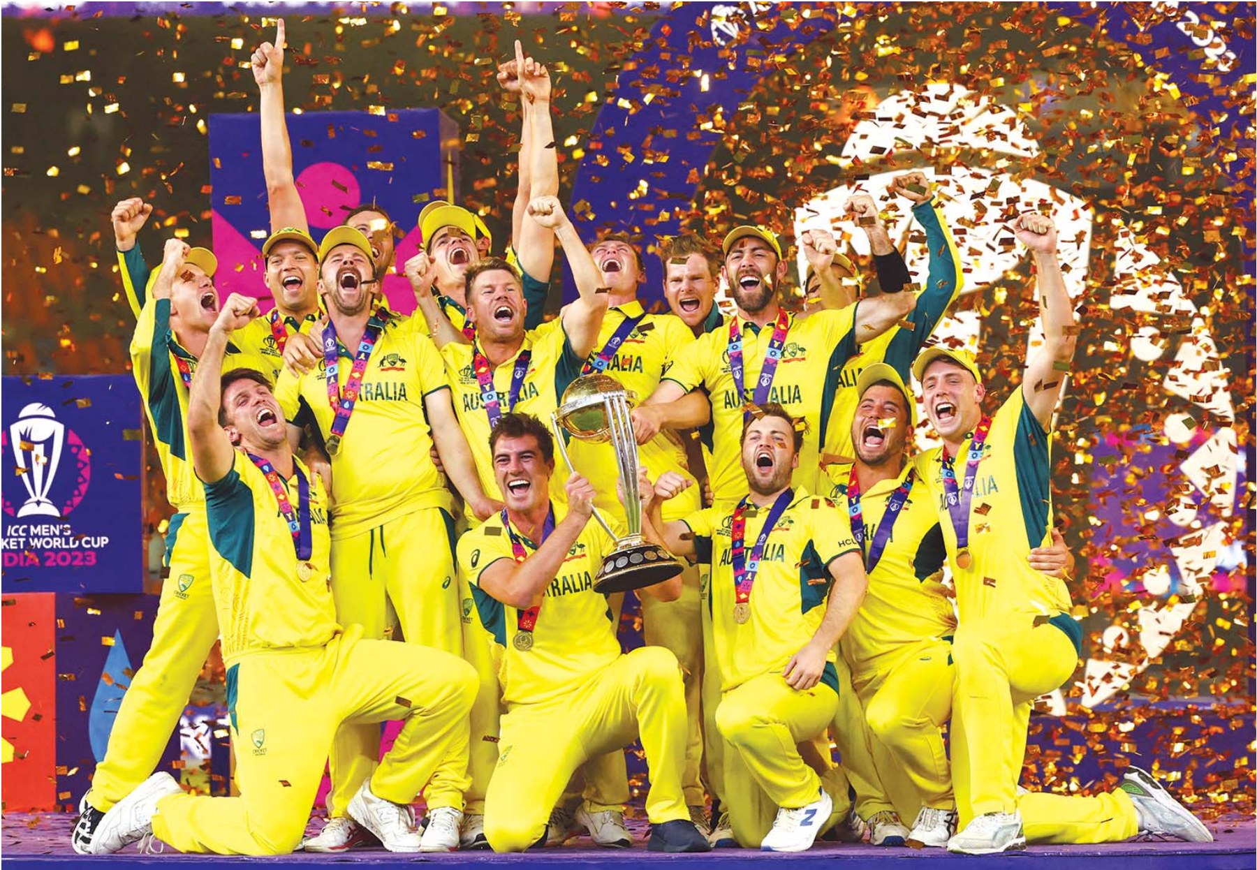
Australia players celebrate with the trophy after winning the ICC World Cup in Ahmedabad yesterday.

Kohli and Rahul (66) then combined in a dour rebuilding job even