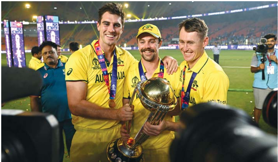
Australia's captain Pat Cummins (left), Travis Head (centre) and Marnus Labuschagne pose with the trophy after winning the ICC World Cup final.

an outstanding bowler with 239 wickets in 55 Tests at 22.94 apiece and 141 in 88 one-day internationals at 28.66, a soft touch.