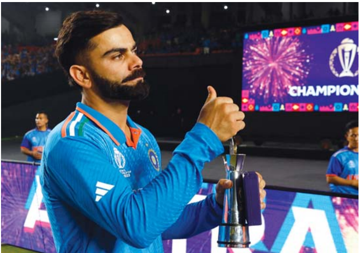
India's Virat Kohli acknowledges fans after the presentation ceremony. Kohli was named Player of the Tournament.