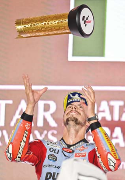
Italian rider Fabio Di Giannantonio of Gresini Racing celebrates after winning the Grand Prix.

Di Giannantonio is being replaced by six-time world champion Marc Marquez at Gresini and does not have a ride for next season, with few saddles still available.