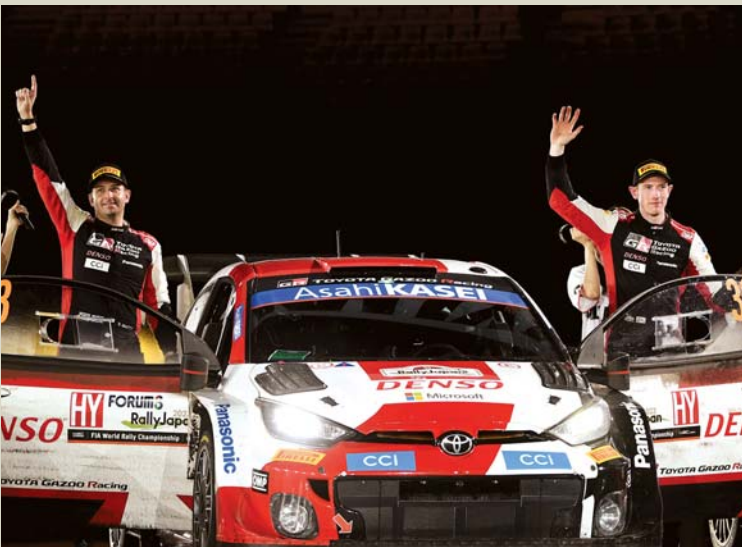
Elfyn Evans and his co-driver Scott Martin of Great Britain wave on the podium following their victory in Rally Japan, the 13th round of the FIA World Rally Championship, at Toyota stadium in Toyota city, Aichi prefecture, yesterday.

1. Kalle Rovanpera (FIN/Toyota) 250 points, 2. Elfyn Evans (GBR/Toyota) 216, 3. Thierry Neuville (BEL/Hyundai) 189, 4. Ott Tanak (EST/Ford) 174, 5. Sebastien Ogier (FRA/Toyota) 133, 6. Esapekka Lappi (FIN/Hyundai) 113, 7. Takamoto Katsuta (JPN/Toyota) 101, 8. Dani Sordo (ESP/Hyundai) 63, 9. Teemu Suninen (FIN/Hyundai) 42, 10. Oliver Solberg (SWE/Skoda) 33.