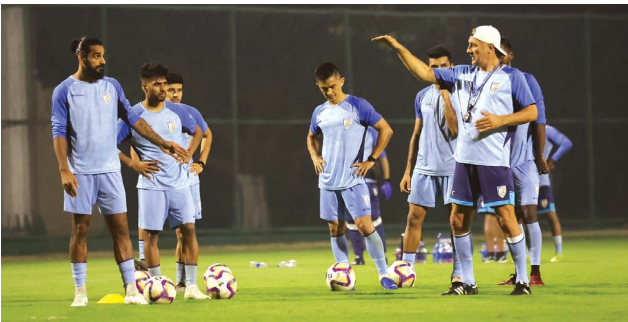
India's coach Igor Stimac talks to his players during a training session in Bhubaneswar yesterday.

Stimac agreed that India are now perfectly capable of pulling off a surprise or two, but is not ready to lower his guard. "We have analysed Qatar from every angle and position and know very well what they are capable of in terms of speed and strength. Their defensive and offensive positions are immaculate, which they demonstrated against Afghanistan by