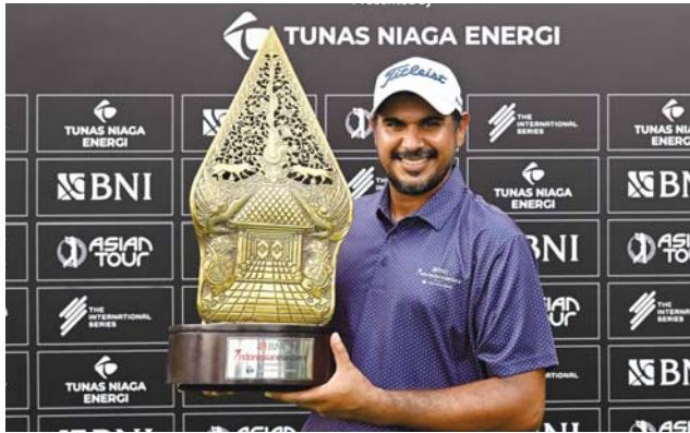
India's Gaganjeet Bhullar celebrates with the winner's trophy after clinching the BNI Indonesia Masters held at the Royale Jakarta Golf Club in Jakarta yesterday.

The American has booked his place on the LIV Golf circuit for next year as a result. Bhullar's win lifted him from 46th place to eighth on the final International Series order of merit.