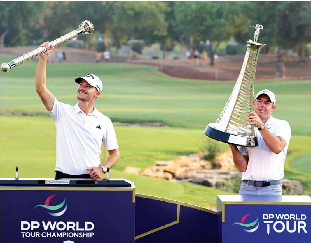
Denmark's Nicolai Hojgaard (left) lifts the winner's trophy as Northern Ireland's Rory McIlroy lifts the world championship trophy on the last day of the DP World Tour Championship European Tour golf tournament 2023 at Jumeirah Golf Estates in Dubai yesterday.

After that, it was Hojgaard who clawed back the deficit and hit the front with five consecutive birdies, but the 22-year-old was left to