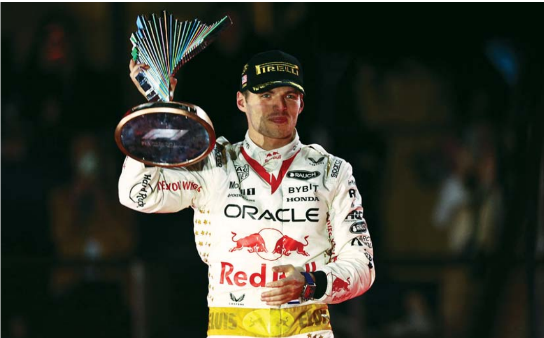
Race winner Max Verstappen of the Netherlands and Oracle Red Bull Racing celebrates on the podium during the F1 Grand Prix of Las Vegas at Las Vegas Strip Circuit.

Perez at least had the consolation of securing second in a championship won long ago by his teammate - another first for Red Bull who have never previously