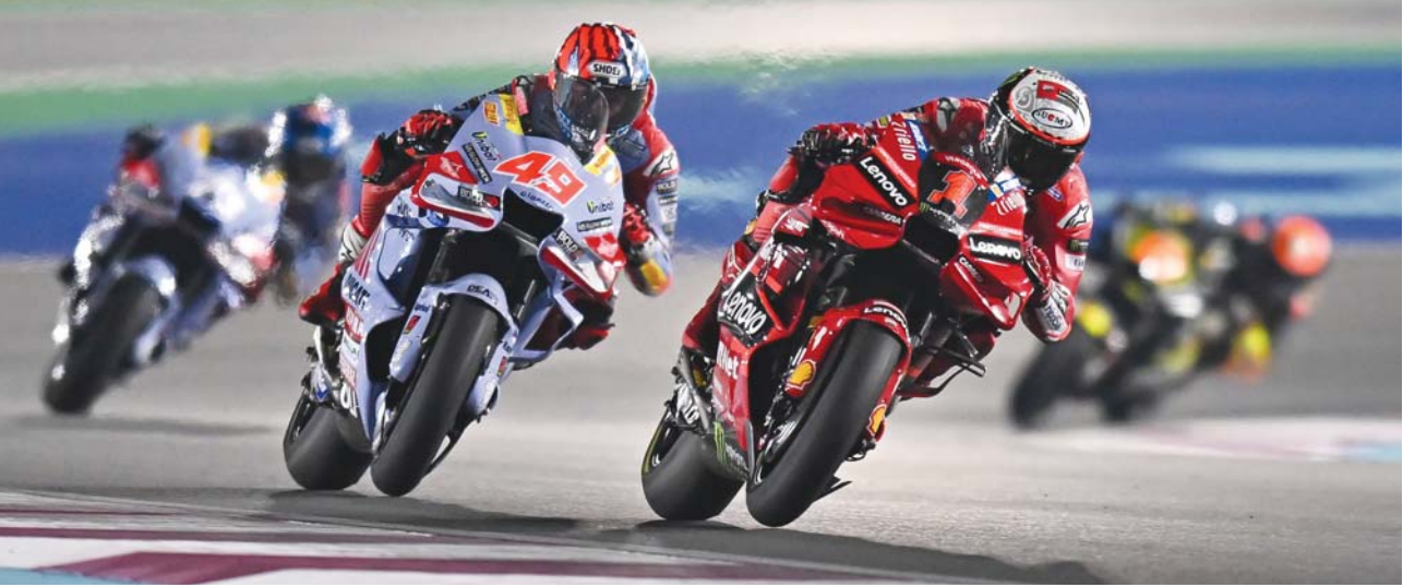
Ducati Lenovo Team’s Francesco Bagnaia (right) and Gresini Racing’s Fabio Di Giannantonio battle for the lead.

MARTIN POINTS BLAME AT ‘BAD TYRE’ Martin has pointed the finger firmly at a ‘bad tyre’ for leaving his title hopes on the ropes. The Pramac rider weaved hopelessly