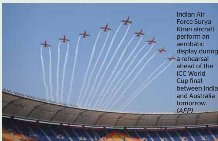
Indian Air Force Surya Kiran aircraft perform an aerobatic display during a rehearsal ahead of the ICC World Cup final between India and Australia tomorrow.

- Opening exchanges - India captain Rohit Sharma has instilled an aggressive attitude in his team, with the opener leading from the front. Virat Kohli and Shreyas Iyer took the batting plaudits with two fine hundreds in a 70-run semi-final win over New Zealand as India piled up a huge 397-4 in Mumbai. But it was Rohit who first demoralised New Zealand pacemen Trent Boult and Tim Southee with a rapid 29-ball 47 that ensured India were in command from the start. It has been a similar story in the field. Even if opposition opening batsmen can survive against India's new-ball duo of Jasprit Bumrah and Mohamed Siraj, they then have to face Mohamed Shami. The seamer is the tournament's leading bowler with 23 wickets from just six matches, with his devastating 7-57 against New Zealand the best bowling figures in any World Cup semi-final. Australia's opening bowlers and batsmen, however, appear to be coming into form at just the right time. Josh Hazlewood and Mitchell Starc reduced a powerful South Africa top-order to 24-4 in Thursday's second semi-final. And in a tense, low-scoring, affair