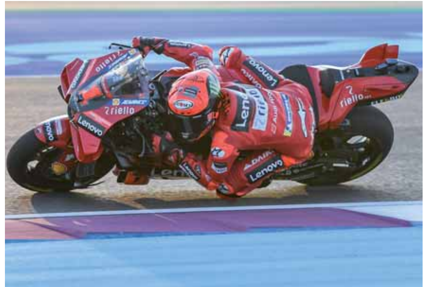
Francesco Bagnaia and Jorge Martin (below) made it through to Q2 for today's qualifying despite a scrappy session yesterday.

Miller will be joined by the Alex Marquez (Gresini Racing) as well as Franco Morbidelli (Monster Energy Yamaha), Pol Espargaro (GASGAS Factory Racing Tech3), Marco Bezzecchi (Mooney VR46 Racing Team), and Johann Zarco (Prima Pramac Racing). The action has only just started at the Lusail International Circuit. The title fight is on with MotoGP enjoying some of the closest racing in its history.