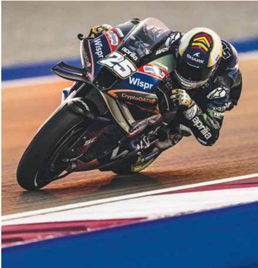
RNF Aprilia's Raul Fernandez in action during the second practice session of the MotoGP Grand Prix of Qatar at the Lusail International Circuit yesterday.

It was looking like a disaster for Martin as he found himself outside of Q2 contention until the Spaniard pulled together a flyer to put himself in P6 and bag a spot in Q2. Bagnaia was one of the riders who had a lap cancelled as he dropped down the order from P4. The Champion responded however as he set another flyer to slot himself just behind Martin.