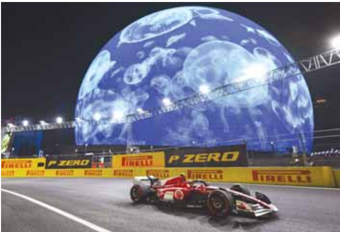
Ferrari's Spanish driver Carlos Sainz Jr. races during the second practice session for the Las Vegas Grand Prix in Nevada.

ognising "highly unusual external circumstances," Formula One stewards said Sainz would still incur a 10 place grid penalty for today's race.