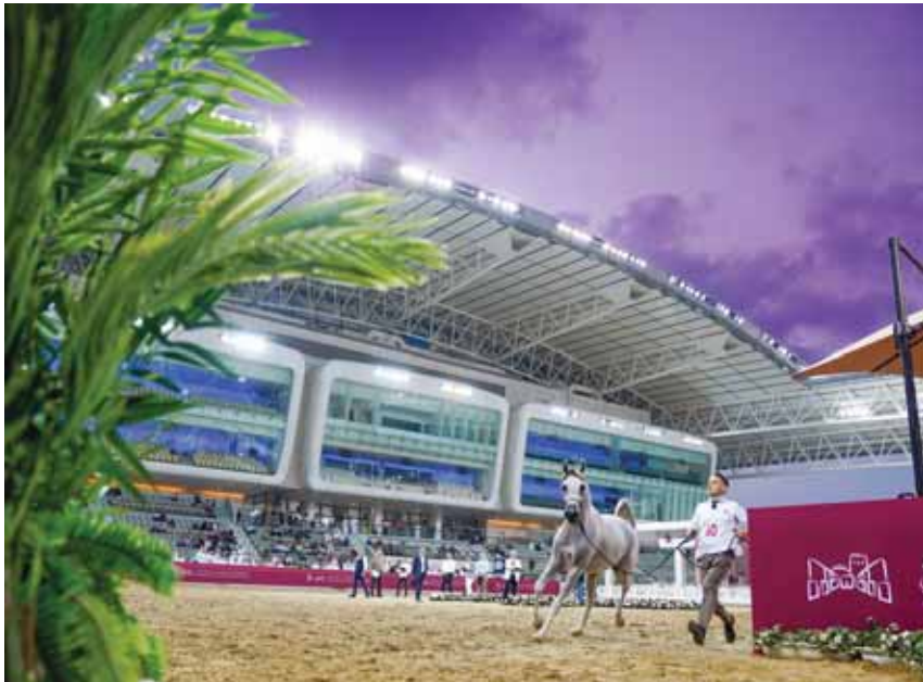
The Al Shaqab International Arabian Horse Show has attracted a total of 272 horses amid greater participation of horse owners from Qatar and beyond.