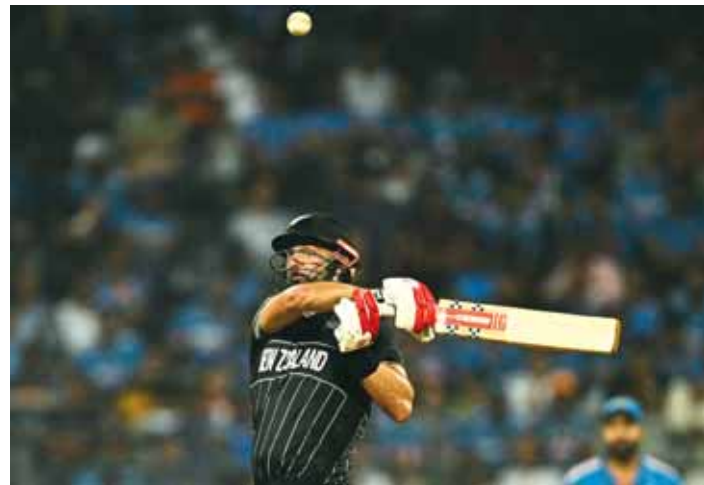
New Zealand's Daryl Mitchell plays a pull shot during the ICC World Cup semi-final against India at the Wankhede Stadium in Mumbai on Wednesday. India won by 90 runs.

"If you look at the stats overall, South Africa will walk away and say they ticked all the boxes they wanted to, but they just didn't get over the line," he told CricInfo . "There will be some question-