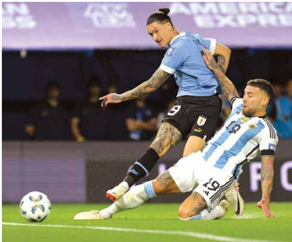
Uruguay's forward Darwin Nunez (left) and Argentina's defender Nicolas Otamendi vie for the ball during the 2026 FIFA World Cup South American qualification match at La Bombonera stadium in Buenos Aires on Thursday night.

A disappointing result for Brazil was com-