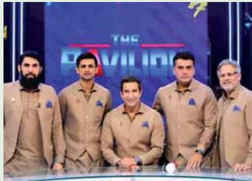
Retired Pakistan cricketers Misbah-ul-Haq (left), Shoaib Malik (second left), Wasim Akram (centre), and Moin Khan (right) join host Fakhr-e-Alam for a group photograph.

The two nuclear-armed nations have fought three wars since the subcontinent's partition in 1947. "If it's black, we say black, and if it's white, we say white," presenter and Pakistan legend Wasim Akram told AFP.