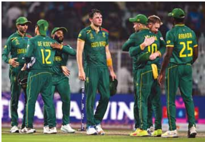
South Africa's cricket players react after losing the ICC World Cup semi-final against Australia at the Eden Gardens in Kolkata on Thursday. Australia won by three wickets.

"We've seen young guys at the end of the tournament with less than 15 games to their name stand up and really dominate in cer-