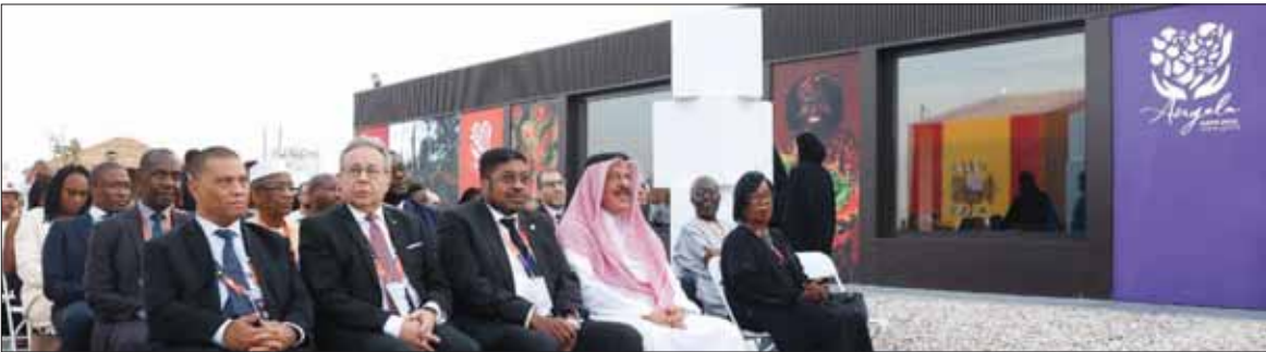
Snapshots from the inauguration ceremony yesterday.