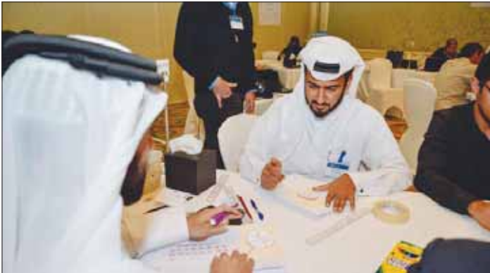
The Qatar University ExxonMobil Teachers Academy in Doha was established in 2012 with QU's National Centre for Educational Development (NCED) and the support of the Ministry of Education and Higher Education.

Over the span of a week, science and math teachers will be presented with new and effective teaching strategies that will help encourage their students to develop a passion for these subjects. They will have access to resources that will upgrade their skills and keep them informed of the latest teaching methods and assistive technologies that will allow them to provide their students with a high-quality