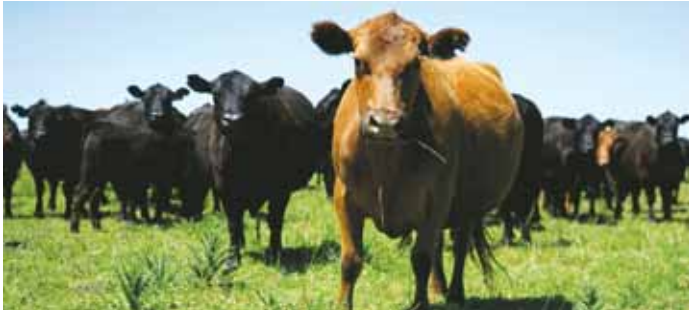
Cattle is seen at a farm in Saladillo, Buenos Aires Province, Argentina. The countryside, the source of Argentina's wealth though with little political influence, goes to the presidential ballot uncomfortable.

Nationally, Massa scored the most votes, despite overseeing annual inflation of 143%, and the runoff is expected to be tight.