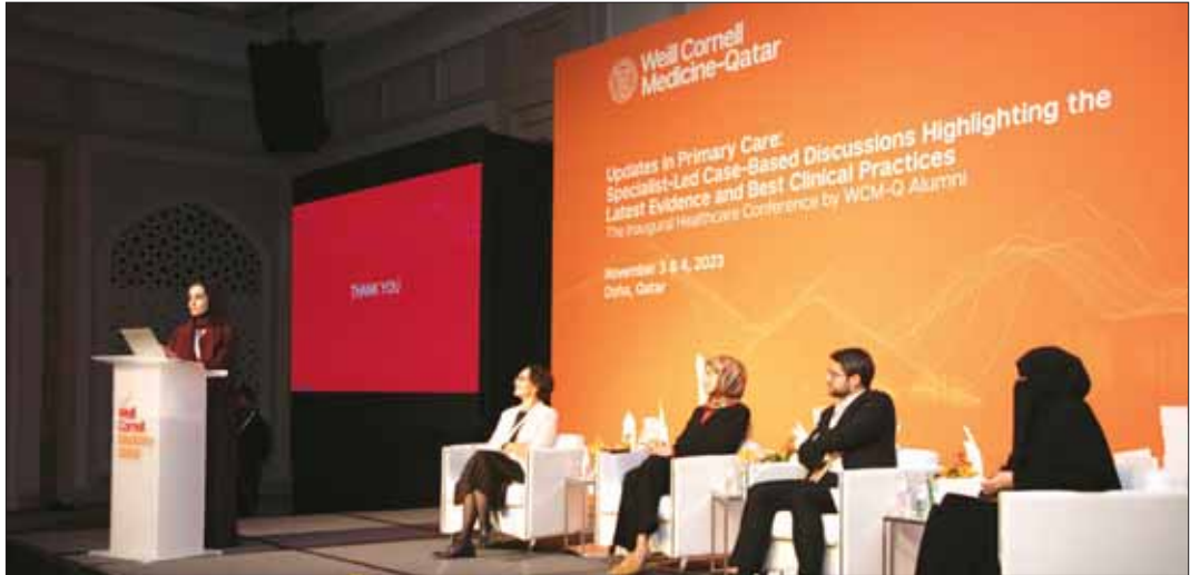
The conference represented a major milestone in WCM-Q's mission to ensure its alumni make valuable contributions to Qatar's thriving healthcare sector.