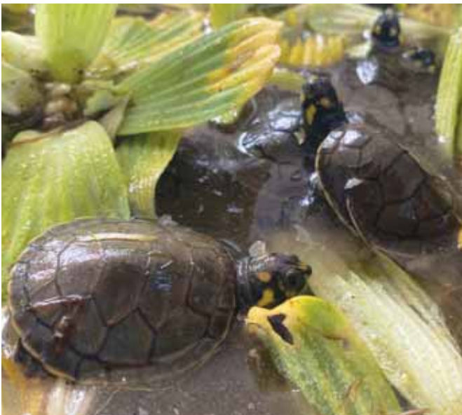
River turtles are seen in a plastic basin before being released into a river in the Peruvian Amazon, in San Jose de Lupuna, Peru.

Gaza and Ukraine, on which their countries have found themselves backing opposing sides. However, Xi also had tough words for Biden after the talks, particularly on the subject of Taiwan. “The US side should ... stop arming Taiwan, and support China’s peaceful reunification,” Xi told Biden, according to a readout from China’s foreign ministry. “China will realise reunification, and this is unstoppable.” Xi nevertheless insisted in a later speech to business leaders that Beijing did not want confrontation with anyone. “China does not seek spheres of influence, and will not fight a cold or hot war with any country,” he said. “The great rejuvenation of the Chinese nation cannot be achieved without a peaceful and stable international environment.” Russia, a partner of China in what Washington sees as a growing authoritarian alliance, welcomed the meeting, with the Kremlin calling the talks “important for everyone”.