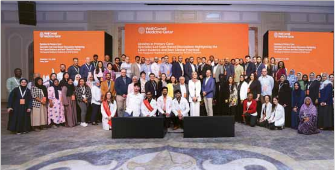
Participants of the WCM-Q event.