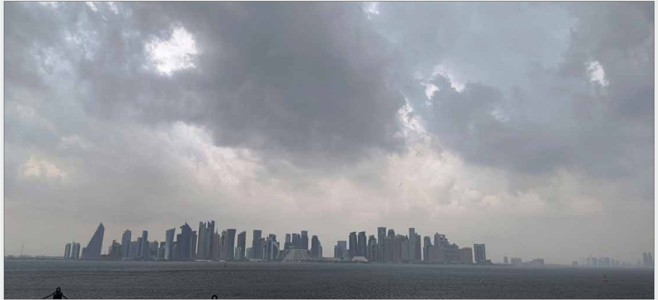
Rain clouds hover above Doha's West Bay skyline as seen from Old Doha Port's Mina District yesterday morning.