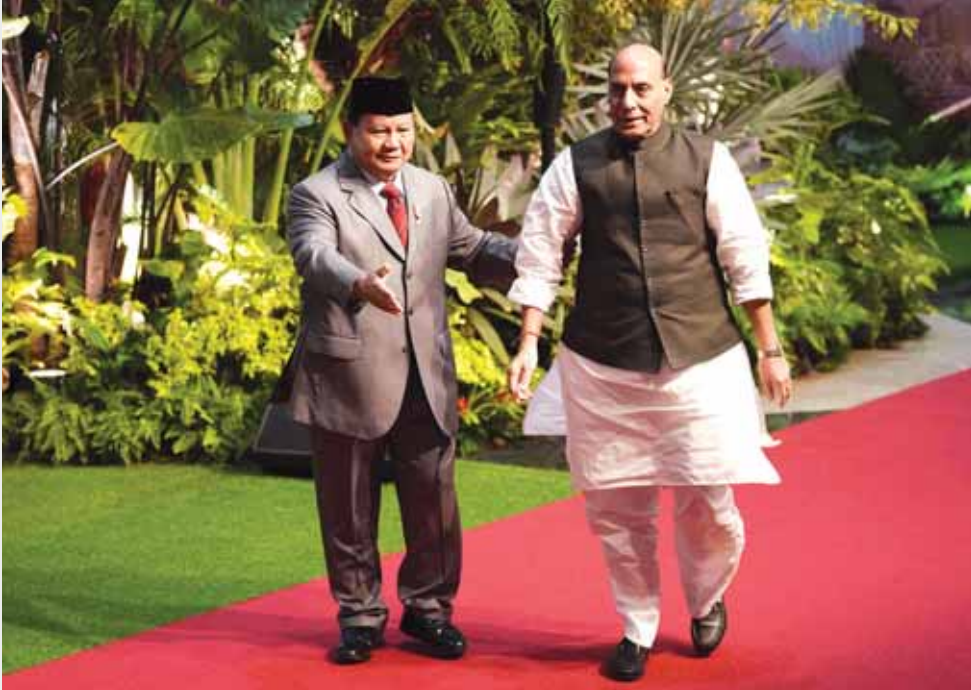
Indonesia’s Defence Minister Prabowo Subianto (left) greets India’s Defence Minister Rajnath Singh upon the latter’s arrival for the 10th Association of Southeast Asian Nations Defence Ministers’ Meeting (ADMM) in Jakarta yesterday.

Britain has authorised a gene therapy that aims to cure sickle-cell disease and another type of inherited blood disorder for patients aged 12 and over, the country’s medical regulator said, becoming the first in the world to do so. Casgevy is the first medicine to be licensed that uses the gene-editing tool CRISPR, which won its inventors the Nobel Prize in 2020, Britain’s Medicines and Healthcare products Regulatory Agency said. Sickle cell disease and -thalassaemia are genetic conditions caused by errors in the genes for haemoglobin, which is used by red blood cells to carry oxygen around the body. “Both sickle cell disease and -thalassaemia are painful, life-long conditions that in some cases can be fatal,” MHRA said. In clinical trials Casgevy has been found to restore healthy haemoglobin production in the majority of participants with sickle-cell disease and transfusion-dependent -thalassaemia, relieving the symptoms of disease.