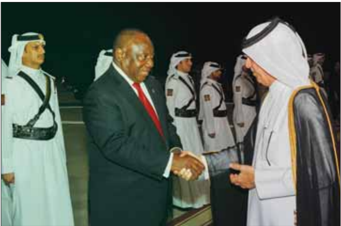
South African President Cyril Ramaphosa is seen off at airport after his visit to Qatar earlier this week.

omic relations, citing a strong foundation established between the two governments. The South African president highlighted the presence of South African companies in Qatar, with major companies like Sasol investing strongly in Qatar, along with medium-sized companies such as Nando's and Ocean Basket, among others. President Ramaphosa considered Qatar an excellent investment destination for South African businessmen, while South Africa is seen as a very fertile investment place for Qatari companies, especially in renewable energy. He confirmed Qatar's readiness to consider infrastructure projects and various other sectors. (QNA)