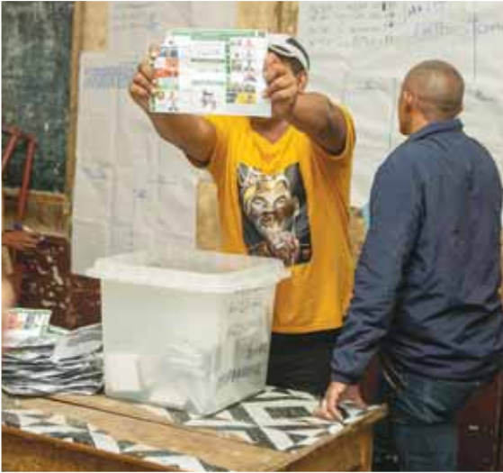
An electoral official holds up a ballot paper as votes are counted at a polling station in Antananarivo.