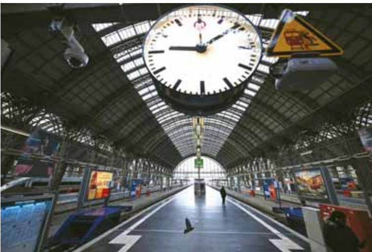
A near-empty platform is pictured yesterday at the main station of Frankfurt am Main, western Germany.