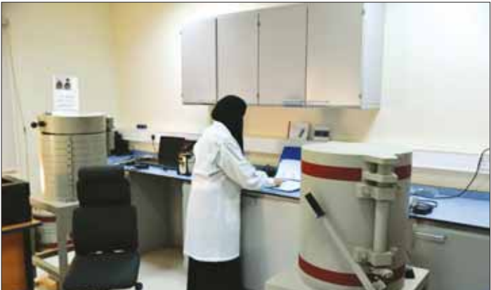
The official visits by high-level IAEA delegations praised Qatar's great development in the fields of radiation medicine and food safety.