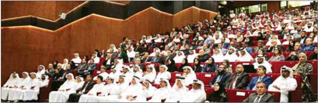
Dignitaries and other guests in the audience.

On the second day, there were two more panel discussion and the announcement of the Internal Grant Award Cycle 7.