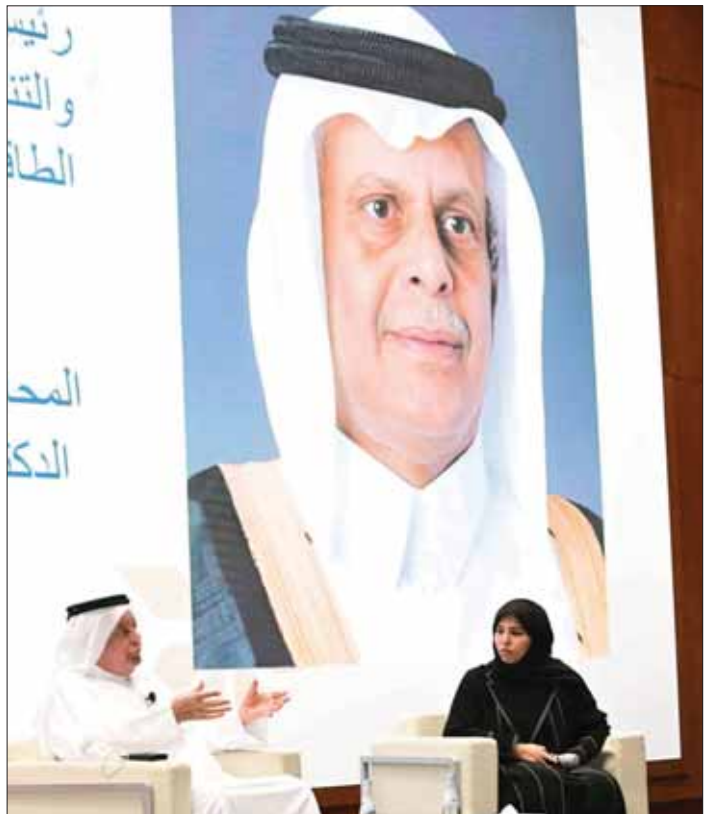
The opening ceremony was attended by HE Abdullah bin Hamad al-Attiyah, who took part in a leadership dialogue.