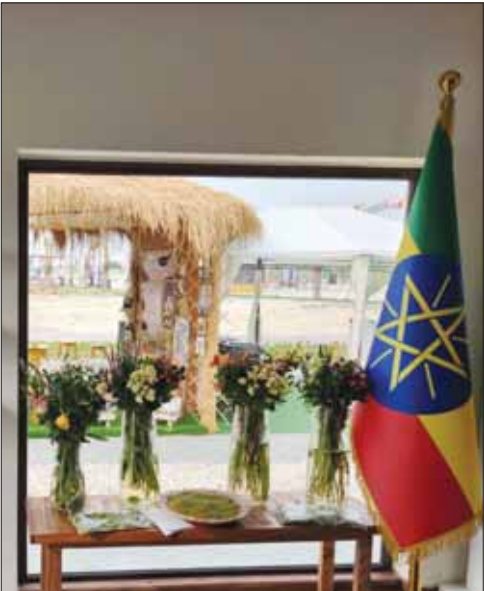
Ethiopia's pavilion at Expo 2023 Doha.