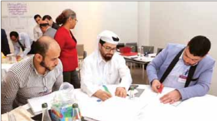
The Qatar University ExxonMobil Teachers Academy in Doha is modelled after the successful ExxonMobil Teachers Academy in the US and the only edition of the original programme held internationally.

ing collaboration with ExxonMobil Qatar on the academy and other education projects that aim to change the way students think and work towards a sustainable future through quality teaching and learning," she added.