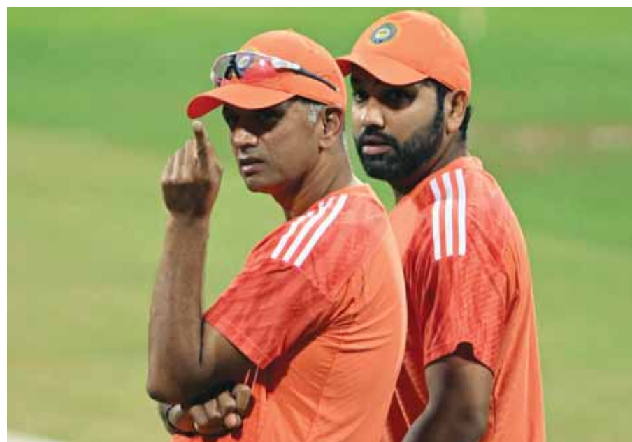
India's Rohit Sharma (right) speaks with coach Rahul Dravid during a practice session at the Wankhede Cricket Stadium in Mumbai ahead of their ICC World Cup semi-final against New Zealand. Right: India's Virat Kohli bats at the nets at the Wankhede Cricket Stadium yesterday.

The build-up to today's game has seen much speculation about whether Rohit's men can join those celebrated teams as World Cup champions of whether New Zealand, who gave India a run for their money before going down