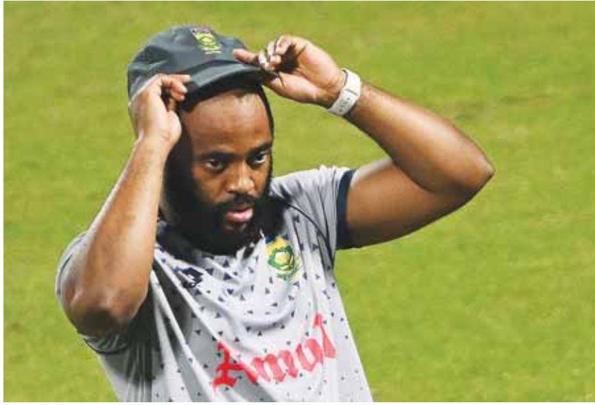
South Africa's captain Temba Bhavuma adjusts his cap during a practice session at the Eden Gardens in Kolkata ahead of their ICC World Cup semi-final against Australia. Right: Australia's Pat Cummins during practice in Kolkata, India, yesterday.

They have looked more comfortable setting targets than chasing one though, and they will expect more penetration from their bowlers against a resurgent Australia. Regardless of how their group stage campaign ebbed and