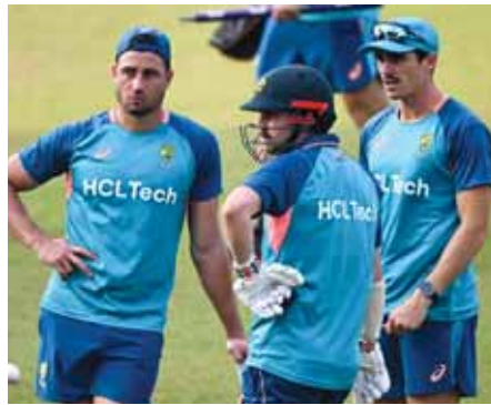
Australia's Marcus Stoinis (left), Travis Head (centre) and Sean Abbott attend a practice session ahead of their ICC World Cup semi-final against South Africa at the Eden Gardens in Kolkata.