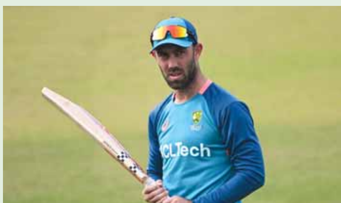
Australia's Glenn Maxwell looks on during a practice session ahead of their ICC World Cup semi-final against South Africa.

Having battled a full body cramp when batting against Afghanistan, Maxwell guided Australia to victory