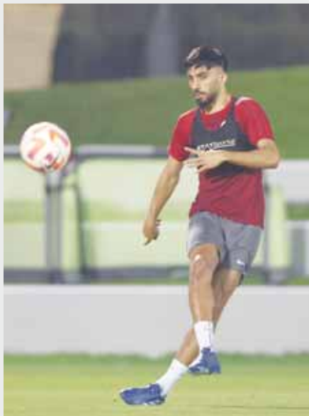
Qatar players attend a training session ahead of their FIFA World Cup 2026 and AFC Asian Cup Saudi Arabia 2027 Joint Qualification game against Afghanistan to be played at Khalifa International Stadium tomorrow. Qatar, coached by Carlos Quieroz, have been training at Aspire Academy since last Thursday to prepare for the two qualifying matches including a game against India on November 21 in Bhubaneswar.