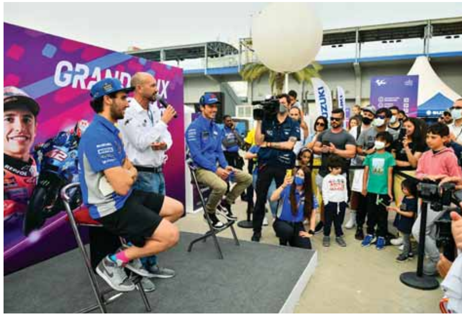
Young MotoGP fans attend a press conference at the Lusail International Circuit (LIC) in this photo. Below: A young fan enjoys a bike ride at the Fanzone.

Before entering the circuit, all attendees are required to undergo a security check to ensure the safety of everyone attending. It is essential