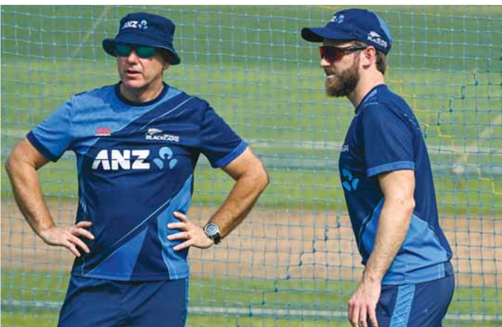
New Zealand's Kane Williamson (right) interacts with coach Gary Stead during a practice session at the Wankhede Cricket Stadium yesterday. Below: Tim Southee of New Zealand during nets.

"Not many people get that opportunity, cricket in India, playing against India in a World Cup semi-final, is special and some-