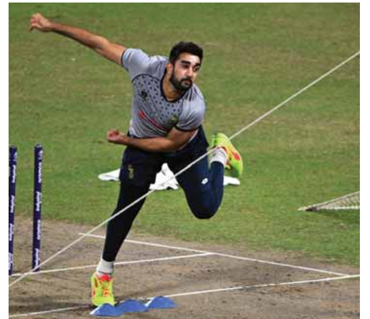
South Africa's Tabraiz Shamsi bowls during a practice session at the Eden Gardens in Kolkata yesterday.

"You've got to give up something. So it's kind of 'what do you want to give up?' and the good thing is it's whatever way you go I don't think there's any wrong answer."