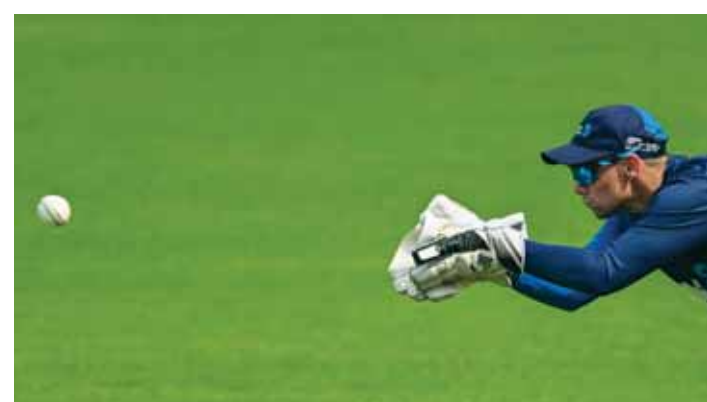
New Zealand's Tom Latham prepares to take a catch during a practice session at the Wankhede Cricket Stadium yesterday.