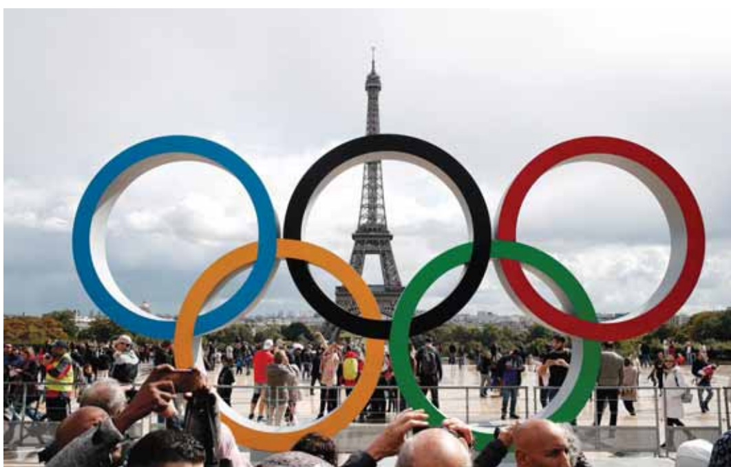
Olympic rings to celebrate the IOC official announcement that Paris won the 2024 Olympic bid are seen in front of the Eiffel Tower in Paris, France, in this September 16, 2017 file photo.

Eugene next year for Olympic qualifying, said she was honoured