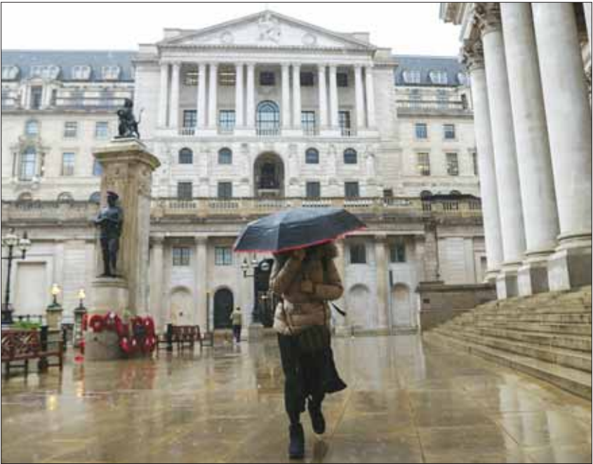
A pedestrian walks past the Bank of England in the City of London. Bets that the BoE is getting closer to lowering UK interest rates are misguided, according to bullish pound traders, who say a key inflation reading next week could spur a rally in the currency.