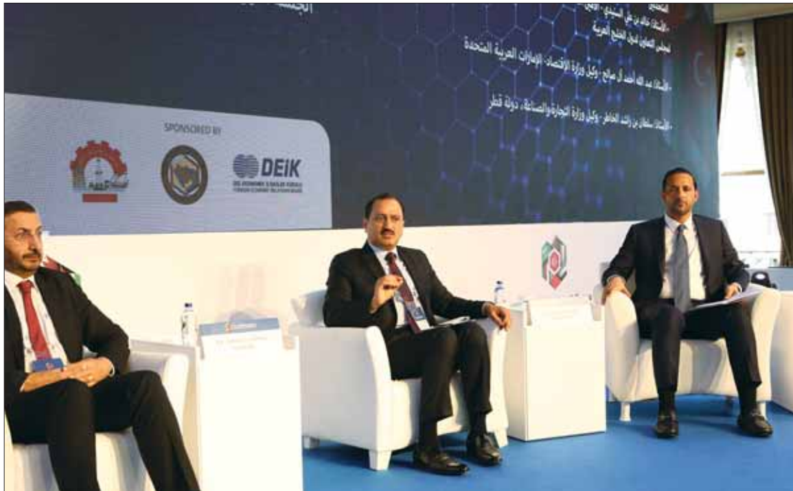
Sultan bin Rashid al-Khater, Undersecretary of the MoCI, outlines the strong relations between Qatar and Türkiye at the recently held GCC-Turkiye Economic Forum in Istanbul.

Trade volumes in the main market soared 39% to 170.26n shares, value by 74% to QR468.96mn and deals by 92% to 16,160. The venture market witnessed a 9% jump in trade volumes to 0.94mn equities, 40% jump in value to QR1.34mn and 81% in transactions at 107.