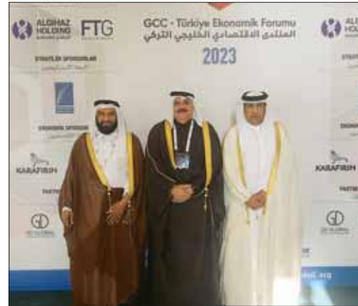
Members of Qatar Chamber's delegation participating in the forum.

The forum, which was co-organised by the Gulf Research Centre and the International Co-operation Platform (ICP), is supported and endorsed by the ministers of commerce of GCC countries as an ideal