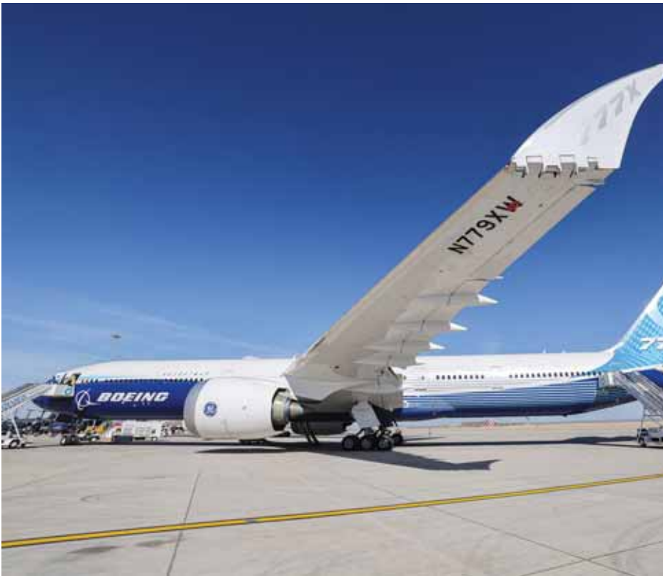
A Boeing 777-9 jetliner aircraft is pictured on the tarmac during the 2023 Dubai Airshow at Dubai World Central-Al-Maktoum International Airport in Dubai on Monday.

Dubai carriers threw down the gauntlet to emerging regional rivals with more than $50bn of Boeing jet orders on Monday, as competition intensifies to secure dwindling supplies of long-haul jets and anticipate growth in international travel. Government-owned Emirates and sister airline flyDubai secured 125 Boeing widebody jets at the opening of the Dubai Airshow, but left Europe's Airbus waiting for an order for broadly similar jets Monday's 777X orders include 55 of the future 400-seat version known as 777-9 and 35 of the smaller 777-8. Emirates also signed up for five extra 787 Dreamliners while flyDubai ordered 30 of the same type in its first order for long-haul aircraft. "Together these orders represent significant investments that reflect Dubai's commitment to the future of aviation," said Emirates and flyDubai Chairman Sheikh Ahmed bin Saeed al-Maktoum. The aviation and tourism industries are crucial to Dubai's economy, which lacks the oil wealth of many neighbouring states. The government aims to double the size of the economy over the next decade. Industry officials said the orders raised the stakes in airline competition as Saudi Arabia expands its fleet and