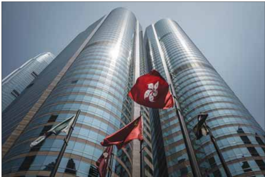
An external view of the stock exchange building in Hong Kong. The Hang Seng Index closed up 1.3% to 17,426.21 points yesterday.

“The forthcoming CPI report holds the potential to reintroduce the possibility of a rate hike,” said Stephen