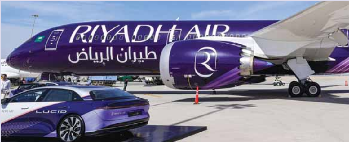
A Riyadh Air Boeing 787-9 jetliner aircraft is pictured on the tarmac during the 2023 Dubai Airshow on Monday. The airline, owned by the kingdom's sovereign wealth fund, said last week it had concluded its narrowbody campaign and was expected to announce the order soon, although no specific timeframe has so far been given.