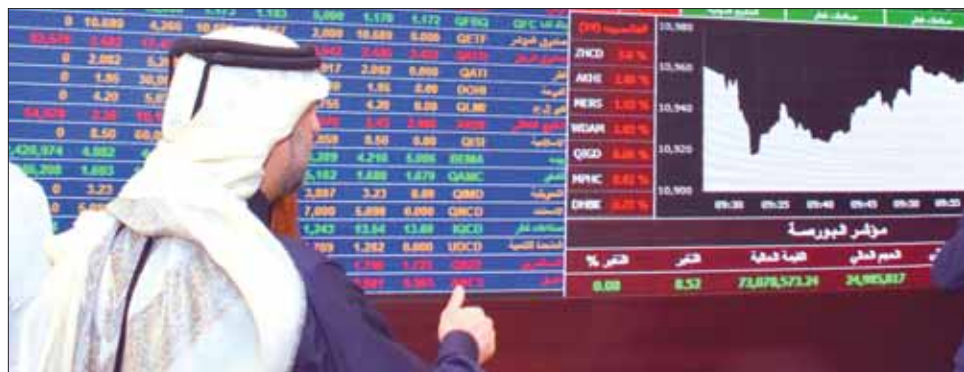
The domestic institutions turned net buyers as the 20-stock Qatar Index rose 0.28% to 10,035.05 points, even as the Gulf bourses evoked mixed response, ahead of this week's US inflation data.

Additionally, the forum aims to promote exchange between entrepreneurs from the Gulf and Türkiye, creating an environment for the development of investment initiatives that align with the interests of both sides.