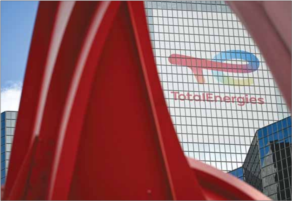
TotalEnergies has pursued gas plants to complement its growing fleet of wind and solar farms that provide more sporadic generation

TotalEnergies SE agreed to buy three natural gas-fired power plants in Texas from TexGen Power LLC for $635mn as it looks to expand in the US market. The three plants will serve the "fast-growing energy demand" of Dallas and Houston, offsetting the intermittency of renewable power production, the French energy giant said in a statement Monday, confirming an earlier Bloomberg News report. They have a joint capacity of 1.5 gigawatts. TotalEnergies has pursued gas plants to complement its growing fleet of wind and solar farms that provide more sporadic generation. Chief executive officer Patrick Pouyanne said last month that the company might make such an acquisition in Texas. In the Lone Star State, the French oil major currently has 2 gigawatts of gross installed renewable capacity, another 2 gigawatts under construction and more than 3 gigawatts under development. "These plants will enable us to complement our renewable assets, intermittent by nature, provide our customers with firm power, and take advantage of the volatility of electricity prices," said Stephane Michel, president of gas renewables & power at TotalEnergies, said in the statement. Gas plants have become more valuable in the last couple of years amid supply issues, the rise of intermittent wind and solar generation and higher power prices in key markets like Texas.