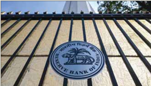
The Reserve Bank of India has kept interest rates unchanged for four straight meetings now, although it's stuck with a relatively hawkish policy stance to keep price pressures in check

India's inflation slowed for a third straight month in October, providing some reprieve to policymakers as concerns over vegetable and oil prices continue to mount. The consumer price index rose 4.87% from a year earlier, statistics ministry data showed Monday, down from 5.02% in September and higher than the 4.8% estimated by economists. The Reserve Bank of India has kept interest rates unchanged for four straight meetings now, although it's stuck with a relatively hawkish policy stance to keep price pressures in check. Governor Shaktikanta Das said last week India remains vulnerable to food price shocks, suggesting policymakers will remain vigilant about the outlook, especially with the rupee at a record low. With the latest reading, inflation has inched closer to the central bank's target. The RBI targets the midpoint of a 2%-6% inflation band, and is focusing on achieving that goal on a sustained basis.