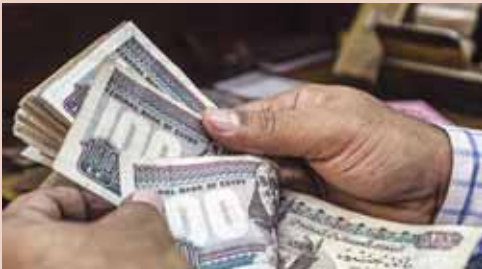
A man counts Egyptian pound banknotes at a currency exchange shop in downtown Cairo (file). Inflation has been bearing the effects of three devaluations of the pound since early 2022, and bouts of weakness in the parallel currency market may continue to feed into consumer prices.

Egyptian inflation eased from a record high to its lowest level in four months ahead of December's presidential elections. Price growth in urban parts of Egypt slowed to an annual 35.8% in October, from 38% the month before, according to figures released Saturday by the state-run statistics agency. It's the lowest rate since June, according to Bloomberg calculations. On a monthly basis, inflation slowed to 1% from 2% in September. Inflation has been bearing the effects of three devaluations of the pound since early 2022, and bouts of weakness in the parallel currency market may continue to feed into consumer prices. The upshot is that interest rates will likely soon have to rise further, according to Goldman Sachs Group Inc, after a pause at the central bank's last two meetings. "The weakening of the pound in the parallel market suggests broader upward pressure on domestic prices going forward," Goldman analysts including Kevin Daly said in a report. "This is likely to keep real interest rates deep in negative territory in the months to come and, in our view, create further distortions in domestic savings and investment pattern." The pound has been trading at local banks close to 31 per dollar for months, far below the rate of 46 at which it changed hands in recent days on the local black market. The cash-strapped country needs to allow further