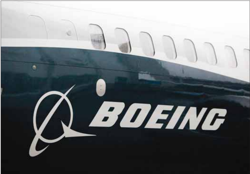
The Boeing logo is seen on the 737 Max 9 airplane at the Boeing factory in Renton, Washington (file). Boeing may finally see a sales breakthrough for its 737 Max aircraft in China when Presidents Joe Biden and Xi Jinping meet this week, ending a long commercial freeze in a critical overseas market for the US planemaker.

Boeing Co may finally see a sales breakthrough for its 737 Max aircraft in China when Presidents Joe Biden and Xi Jinping meet this week, ending a long commercial freeze in a critical overseas market for the US planemaker. The Chinese government is considering unveiling a commitment for Boeing's 737 jetliner during the Apec Summit in San Francisco, as a signal of a recent thaw between the two nations, said people familiar with the matter who aren't authorised to speak publicly. Terms of a potential agreement are still under discussion, and could change or fall apart before the heads of state meet on Wednesday, they cautioned. Boeing shares jumped nearly 4% in premarket trading on Monday on rising prospects for a deal with China, along with confirmation of a major wide-body sale to Gulf carrier Emirates. Spirit AeroSystems Holdings Inc, the planemaker's top supplier, gained more than 5%. While the White House has made resuming military communications with China a top priority at the summit, the rare meeting between the two global leaders also provides an opportunity to reset trade on aerospace. A 737 Max agreement would mark an important breakthrough for Boeing, after it lost its market lead in China to arch-rival Airbus SE. The US manufacturer hasn't made any significant sales of its best-selling narrowbody jets in China since at least 2018, before two crashes led to a global grounding of the