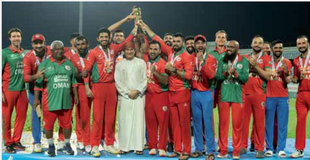
Oman players and officials celebrate winning the inaugural Gulf T20I Cricket Championship which concluded in Doha on Saturday night. In the final, Oman defeated UAE by five wickets with four balls to spare. Chasing a victory target of 164 after restricting UAE to 163/5, Oman rode on Ilyas' knock of 67 and an unbeaten 53 from Ayaan to reach the target.