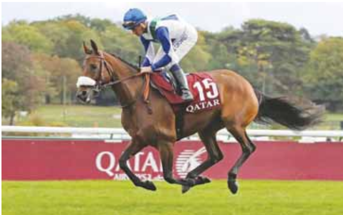
Khalifa bin Sheail al-Kuwari-owned Lady Princess