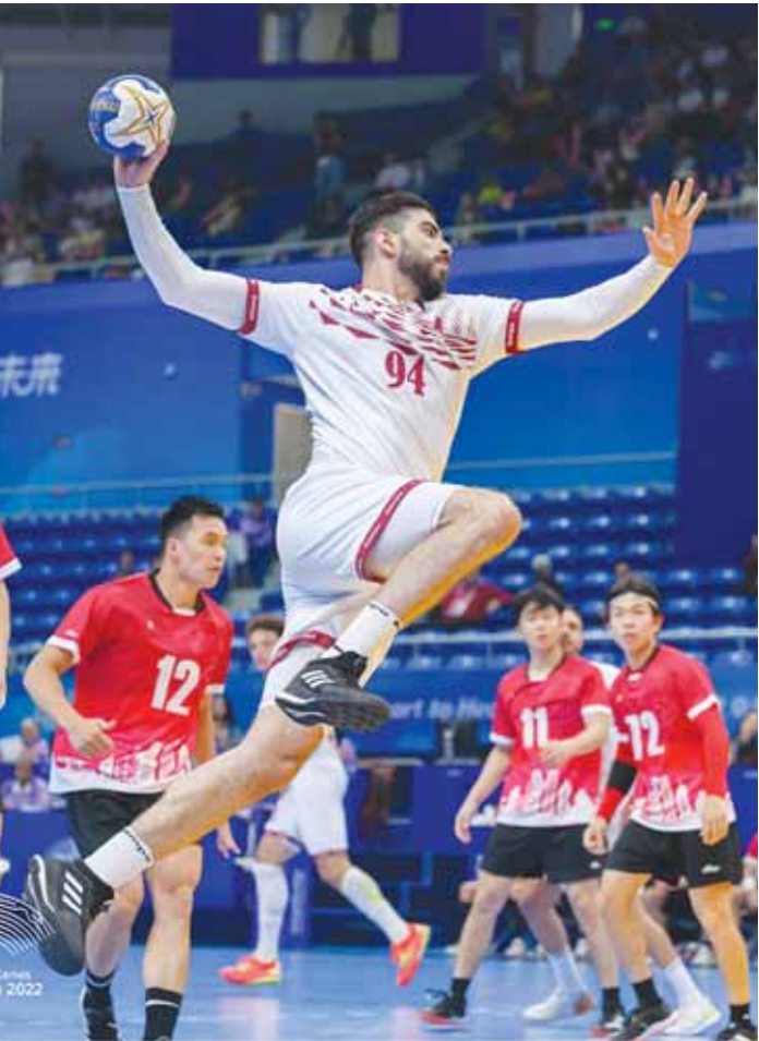
Action from Qatar-Hong Kong handball Group 'B' match yesterday.

Qatar is participating in the tournament with a delegation of 185 male and female athletes competing in 27 sports.