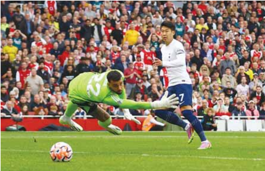
Tottenham Hotspur's Son Heung-min scores their second goal past Arsenal's David Raya during their Premier League match at Emirates Stadium, London, yesterday. Right: Newcastle United players celebrate in front of their fans after the PL League match against Sheffield United at Bramall Lane in Sheffield, England yesterday. Newcastle won 8-0.

"We conceded an unlucky own goal, then a VAR penalty, so it's not like everything was falling in our favour," Postecoglou, whose side remain unbeaten after six league