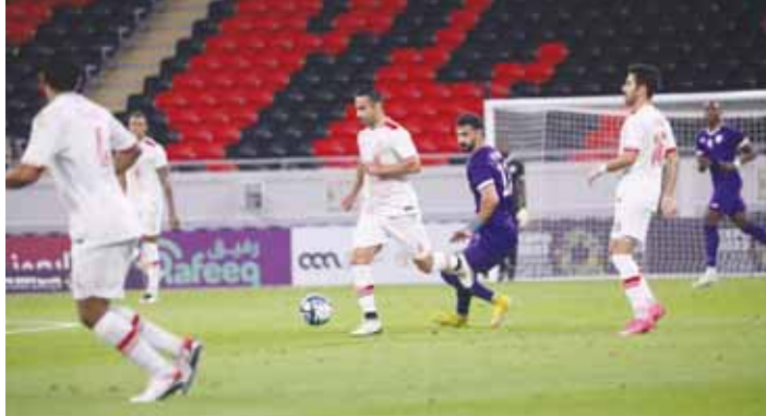
Action from Al Shamal's Expo Stars League clash against Muaither yesterday.