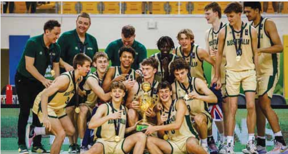
Australian players celebrate winning the FIBA U16 Basketball Championship title at Al Gharafa Hall yesterday. Australia beat New Zealand in the final 79-76. Right: The best players with their trophies at the prize distribution ceremony following the final.