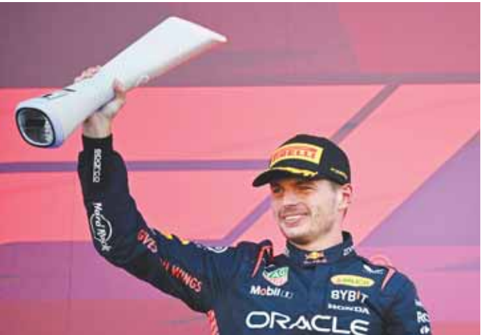
Red Bull Racing's Dutch driver Max Verstappen celebrates on the podium after winning the Formula One Japanese Grand Prix at the Suzuka circuit, Mie prefecture, yesterday.

"Max is on another level at the moment - another incredible performance."