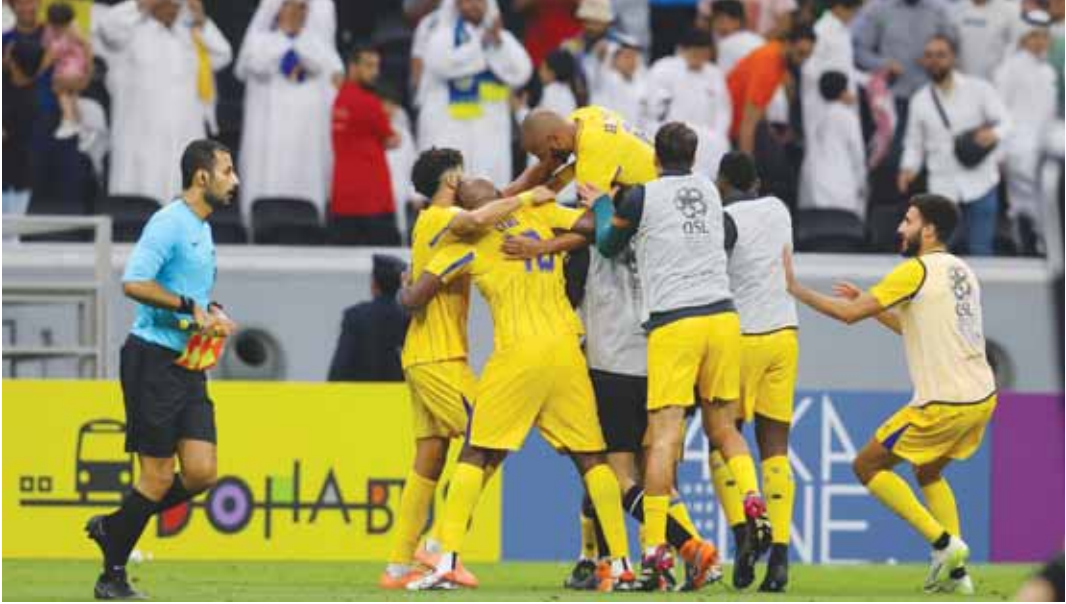
Al Gharafa players celebrate their win over Al Duhail in Round 4 of the Expo Stars League at Al Bayt Stadium yesterday.

and threatened Al Duhail's goal several times in the first half hour.