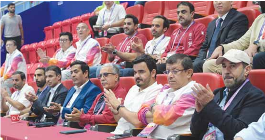
Qatar Olympic Committee President HE Sheikh Joaan bin Hamad al-Thani attended Qatar handball team's match against Hong Kong at the Asian Games in Hangzhou yesterday.

In the men's volleyball, Qatar qualified for the semi-finals beating Pakistan 3-1 (26-24, 25-19, 23-25, 25-18) in an hour and 50 minutes at the China Textile City