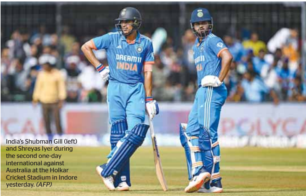
India's Shubman Gill (left) and Shreyas Iyer during the second one-day international against Australia at the Holkar Cricket Stadium in Indore yesterday.

The 24-year-old Gill, who hit 74 off 63 balls at Mohali in the first game, raced to his sixth ODI century and fifth this year with a single off Sean Abbott.