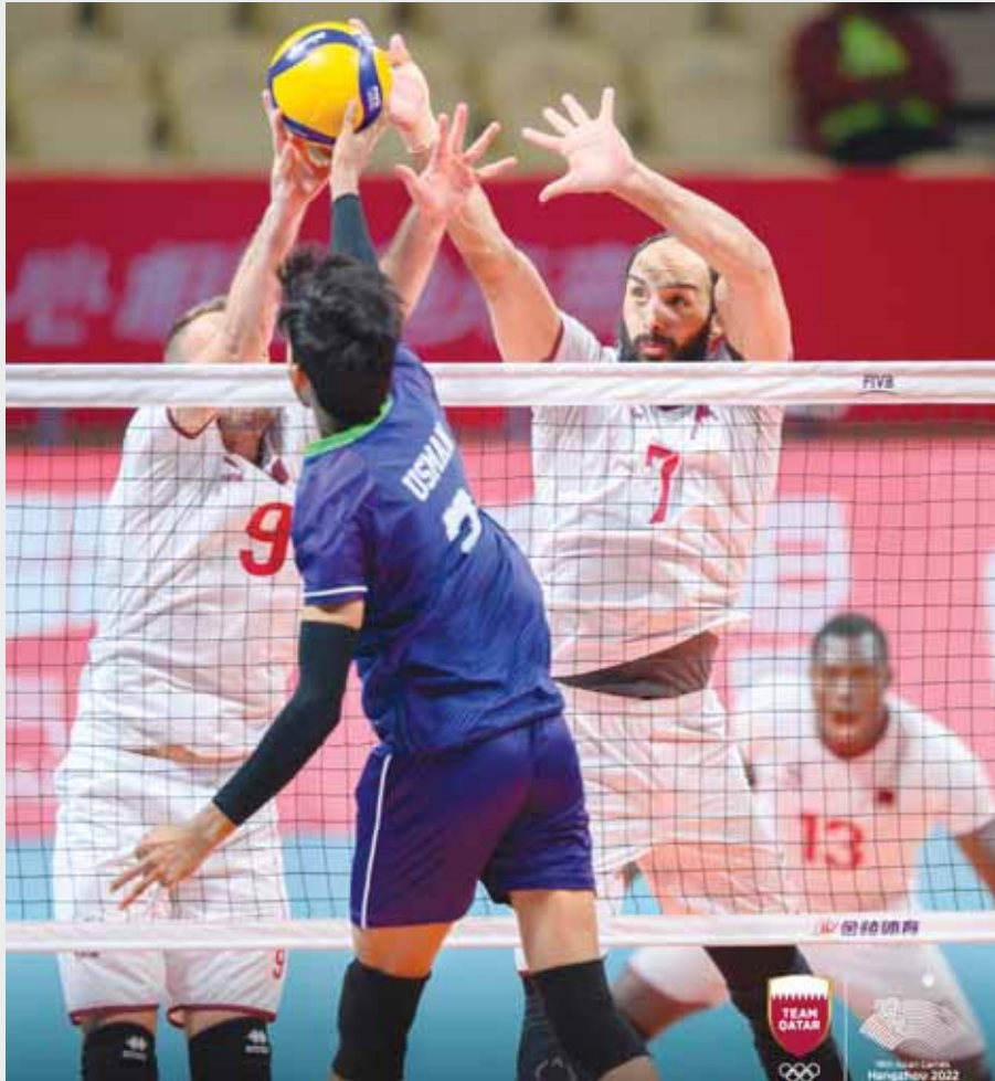
Qatar volleyball players blocked a shot from Pakistan players during the Asian Games match yesterday in Hangzhou, China. Qatar won 3-1 (26-24, 25-19, 23-25, 25-18) to enter semi-finals.