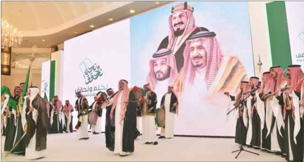
A music and dance performance on the occasion.

"I express my aspiration, as always, for Qatar, its dear leadership and its hospitable people, for other chapters of success as we approach the opening of the Doha International Horticultural Expo next