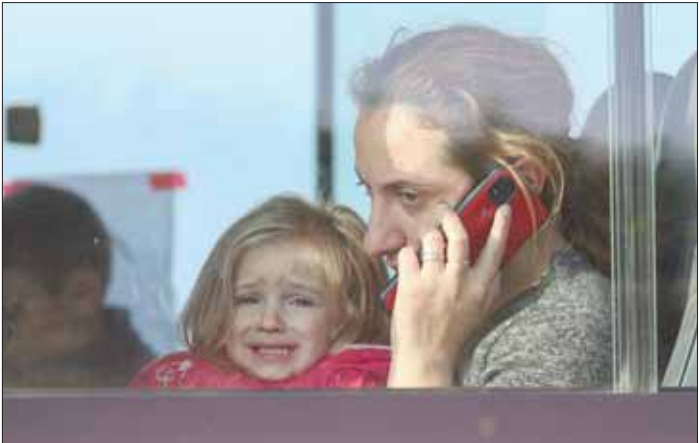
Refugees from Nagorno-Karabakh region sit in a bus upon their arrival at a checkpoint in the village of Kornidzor, Armenia, yesterday.

Separatist leaders have said they are negotiating the fate of some 120,000 ethnic Armenians from Nagorno-Karabakh in talks with Azerbaijani officials mediated by