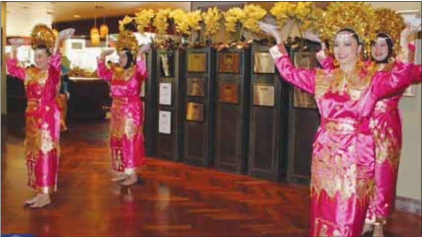
ACD showcases Asean culture and traditions at the celebration.