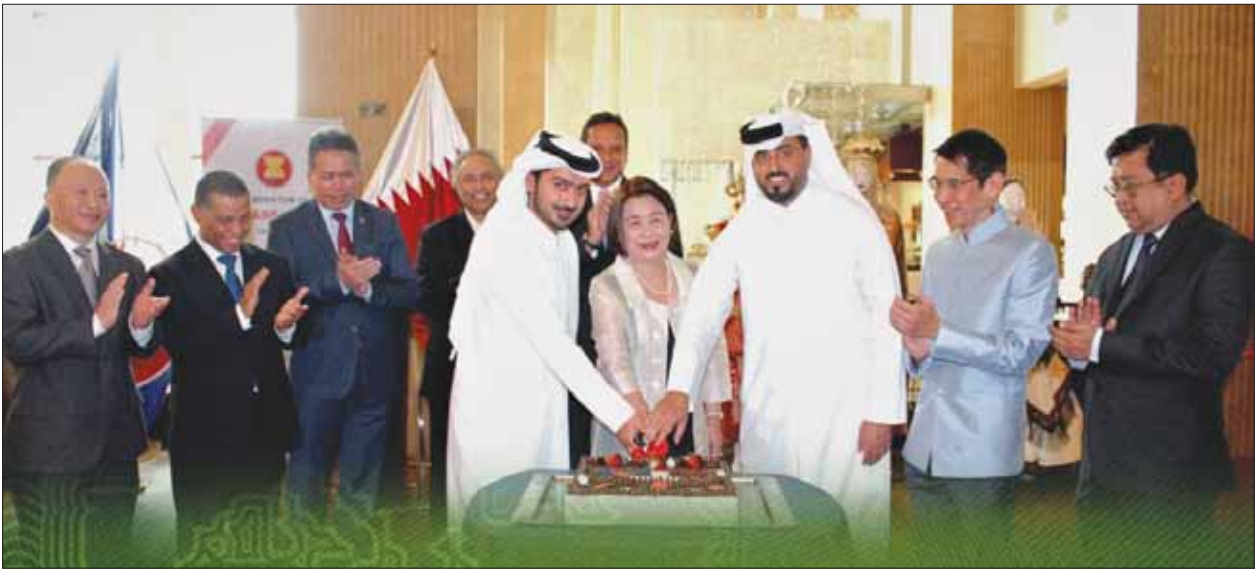
Asean ambassadors and guests at the event.