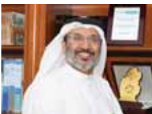
Dr Yousuf al-Maslamani

convenient access to healthcare services following the launch of many virtual and telemedicine services across PHCC and HMC. They include: The National Mental Health Helpline – providing professional mental health care and support; HMC’s Urgent Consultation Service – offering telephone consultations for urgent conditions without prior appointment; Telemedicine consultations – for various specialities at HMC and PHCC; and Medication home delivery – convenient delivery service for medications from HMC and PHCC.