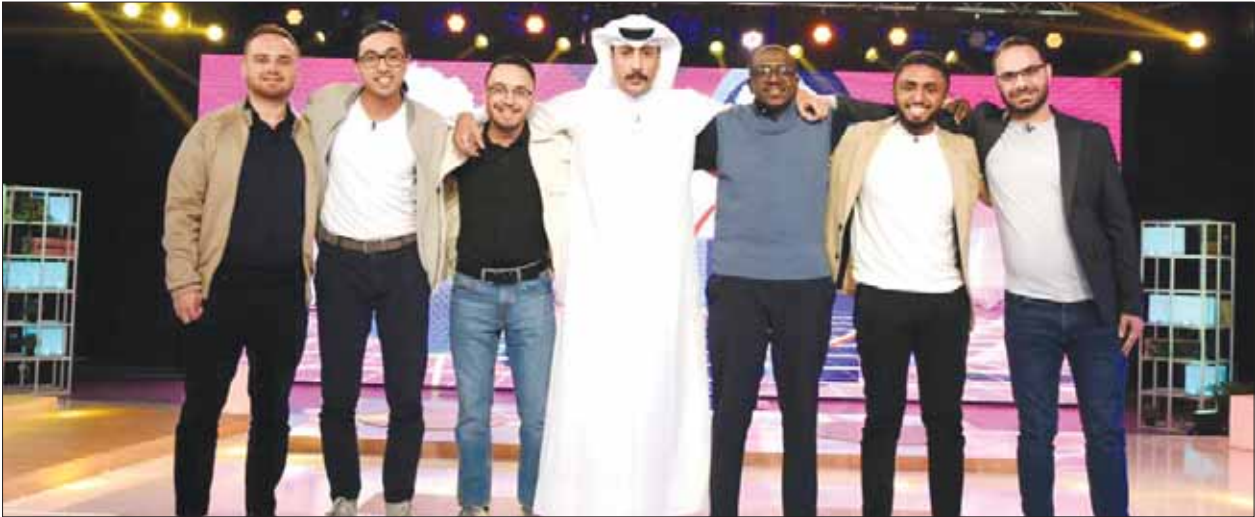
The seven contestants who have advanced to the next stage.

After three rounds of casting, the seven remaining participants vying to win season 15’s Stars of Science have advanced to the next stage, also known as the ‘Proof of Concept’.