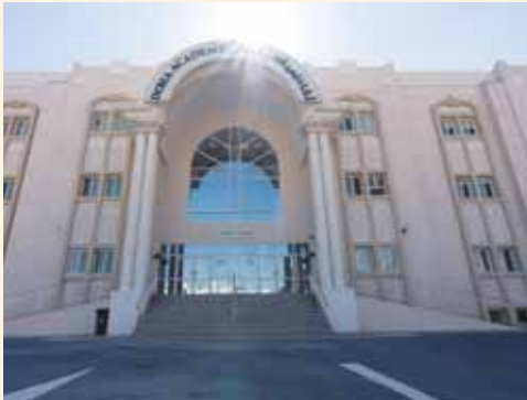
Doha Academy building.