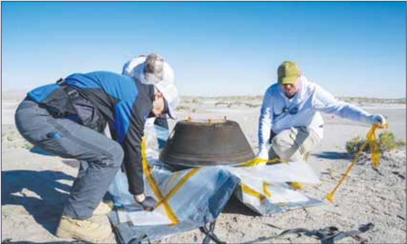
The return capsule containing a sample collected from the asteroid Bennu in October 2020 by Nasa’s Osiris-Rex spacecraft is seen shortly after touching down in the desert at the Department of Defense’s Utah Test and Training Range in Dugway, Utah, yesterday.

A seven-year space voyage came to its climactic end yesterday when a Nasa capsule landed in the desert in the US state of Utah, carrying to Earth the largest asteroid samples ever collected. Scientists have high hopes for the sample, saying it will provide a better understanding of the formation of our solar system and how Earth became habitable. “Touchdown of the Osiris-Rex sample return capsule!” a commentator said on Nasa’s live video webcast of the landing, as engineers and team members applauded at a nearby mission control centre. Completing a 3.86-bn-mile (6.21bn-km) journey, it marked the United States’ first sample return mission of its kind, the US space agency said in a post on X. Nasa chief Bill Nelson hailed the mission and said the asteroid dust “will give scientists an extraordinary glimpse into the beginnings of our solar system.” The Osiris-Rex probe’s final, fiery descent through Earth’s atmosphere was perilous, but Nasa managed to engineer a soft landing at 8:52am local time (1452 GMT), in the military’s Utah Test and Training Range. Four years after its 2016 launch, the probe had landed on the asteroid Bennu and collected what Nasa estimated is roughly nine ounces (250 grams) of dust from its rocky surface. Even that small amount, Nasa says, should “help us better understand the