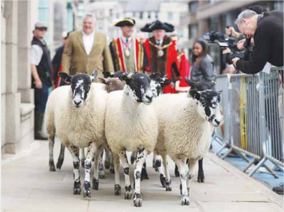
People herd sheep during the annual London Sheep Drive, in London, Britain, yesterday.

A UK government minister yesterday said it would be “irresponsible” to keep ploughing money into a new high-speed train line if there has been a change to the country’s “fiscal picture”. Defence Secretary Grant Shapps was speaking after a string of reports said Prime Minister Rishi Sunak was considering scrapping the colossal HS2 rail project which has seen costs spiral. The UK is currently in the grip of a cost of living crisis that has seen housing and food costs hiked, prompting a wave of crippling strikes across the economy from doctors to train drivers. The country’s defence budget is also under pressure faced with a range of new challenges including the war in Ukraine. “There are various different estimates and I think that’s one of the things that the government wants to check, particularly on the costs now post the inflationary picture out of the war in Ukraine,” Shapps told BBC television.