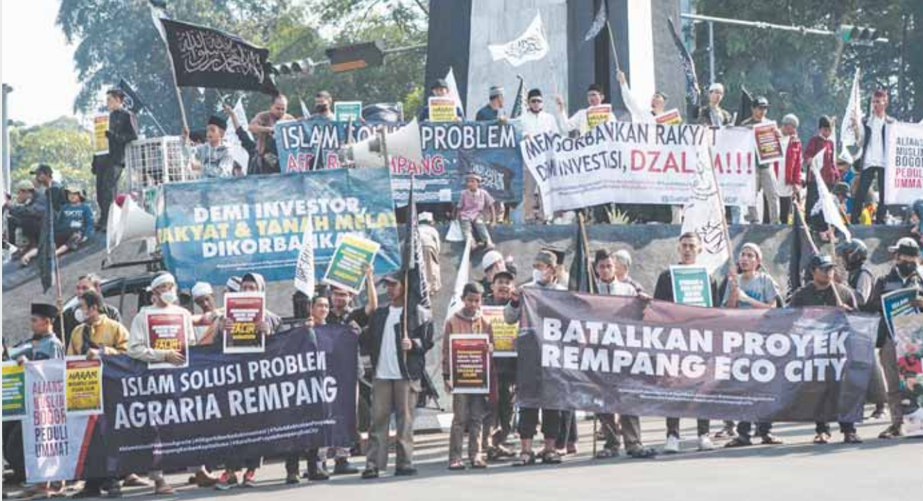
Members of the Muslim community protest against a government plan to develop the Rempang Island into a Chinese-funded economic zone that would displace around 7,500 people, near the Presidential Palace in Bogor, Indonesia, yesterday.