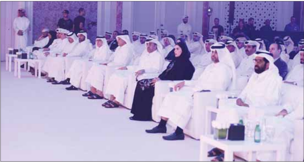
Ministers and other dignitaries at the launch of the "Istamer" platform yesterday.

The inauguration ceremony was attended by HE the Minister of Labour Dr Ali bin Smaikh al-Marri, HE the Minister of Communications and Information Technology Mohamed bin Ali al-Mannai, HE the Minister of Social Development and Family Maryam bint Ali bin Nasser al-Misnad, HE the President of Planning and Statistics