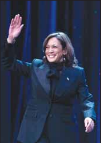
US Vice-President Kamala Harris waves as she walks onstage to speak during the Congressional Black Caucus Foundation 2023 Phoenix awards dinner at the Washington Convention Center in Washington, DC.

In a recent, much-discussed piece, Washington Post columnist David Ignatius called not only on Biden, but also on Harris, not to run again. “Harris has many laudable qualities, but the simple fact is that she has failed to gain traction in the country or even within her own party,” he wrote. Republican White House hopeful Nikki Haley, also a woman of South Asian descent, has trained her sharpest attacks on the vice-president. A former ambassador to the United Nations under then-president Donald Trump, Haley regularly insists that because of Biden’s age, it is the vice-president — who would succeed him if he died or was incapacitated — who must be beaten. The idea of a President Harris “should send a chill up every American spine,” said Haley.