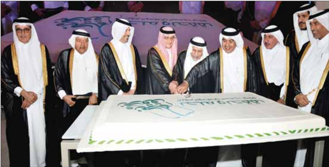
Saudi Arabia's ambassador is joined by Qatari dignitaries in cutting a ceremonial cake on the occasion yesterday.