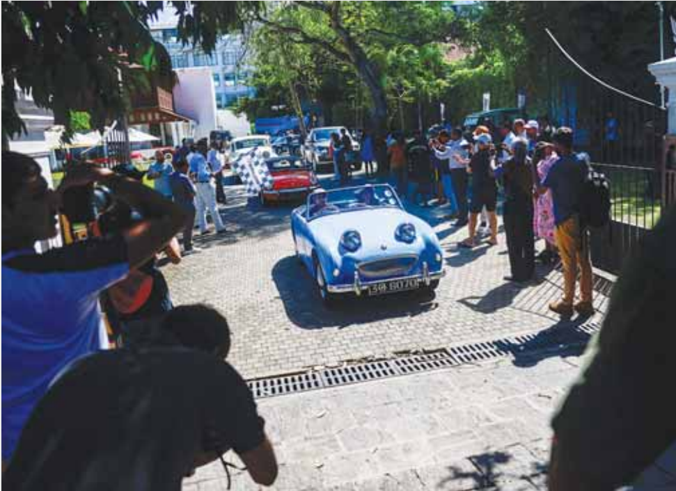
An Austin-Healey Sprite 1958 model car is seen during the British Car Day rally in Colombo, Sri Lanka, yesterday.