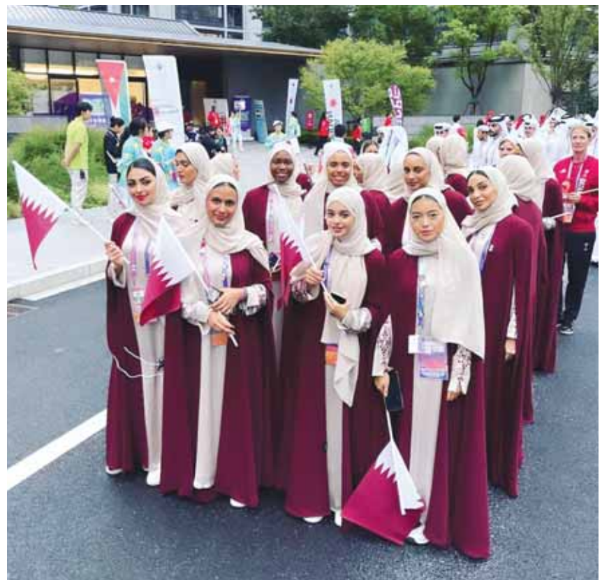
Qatar's women athletes dressed in traditional abaya before opening ceremony.