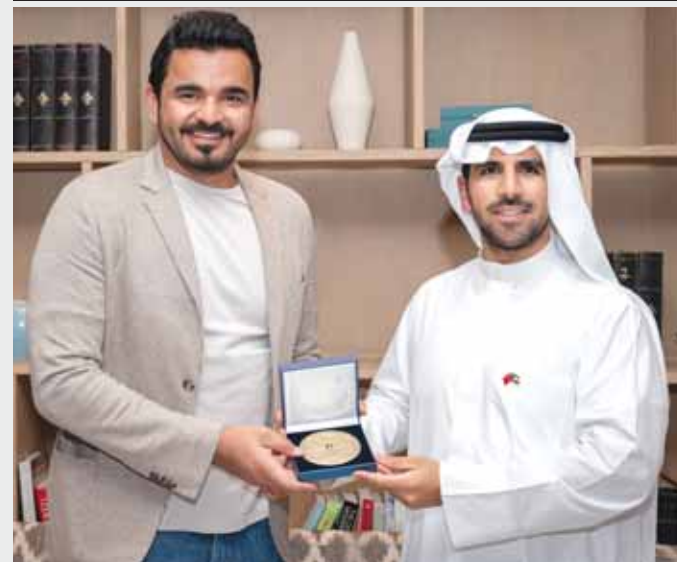
Qatar Olympic Committee (QOC) President HE Sheikh Joaan bin Hamad al-Thani met Kuwait Olympic Committee chief Sheikh Fahad Nasser al-Sabah on the sidelines of the Hangzhou Asian Games yesterday. The meeting reviewed aspects of sports co-operation between two countries and ways to support and develop them.