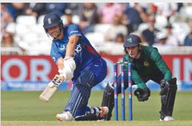
England's Will Jacks plays a shot during the second ODI against Ireland at Trent Bridge in Nottingham yesterday. England cantered to a 48-run victory thanks to 94 from Jacks and 89 from Sam Hain, before Rehan Ahmed took four for 54.