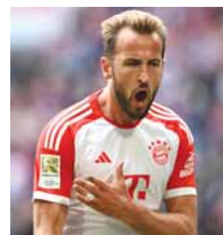
Bayern Munich's Harry Kane celebrates after scoring during Bundesliga match against VfL Bochum in Munich yesterday.

Harry Kane yesterday bettered a record first set by legendary German striker Gerd Mueller when he hit a hat-trick in Bayern Munich's 7-0 rout of Bochum which took the champions back to the top of the Bundesliga. Kane fired in Bayern's second just 13 minutes in, before scoring a penalty in the second half. He added a third with two minutes remaining when he tapped in a low cross from Leroy Sane.