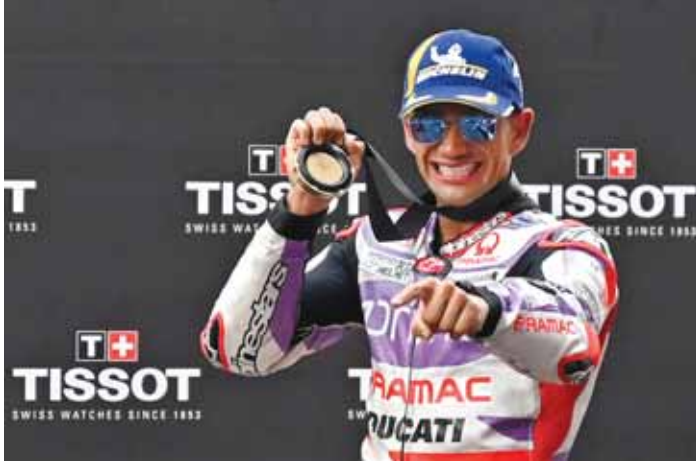
Prima Pramac Racing's Spanish rider Jorge Martin celebrates after winning the sprint race of the Indian MotoGP Grand Prix at the Buddh International Circuit in Greater Noida, New Delhi, yesterday.

Bezzecchi, who scorched the track in the second qualifying