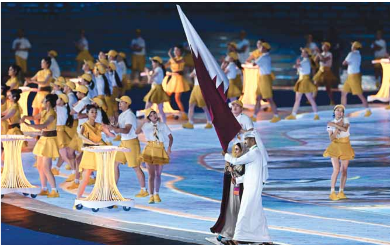
Qatar's flag bearers Tamim Jamal al-Kuwari and dressage rider Maryam al-Buainain walk into the Hangzhou Olympic stadium, during the opening ceremony of the Asian Games in Zhejiang, China, yesterday.

Led by flag bearers al-Kuwari and al-Buainain, Qatar's contingent walked out at opening ceremony