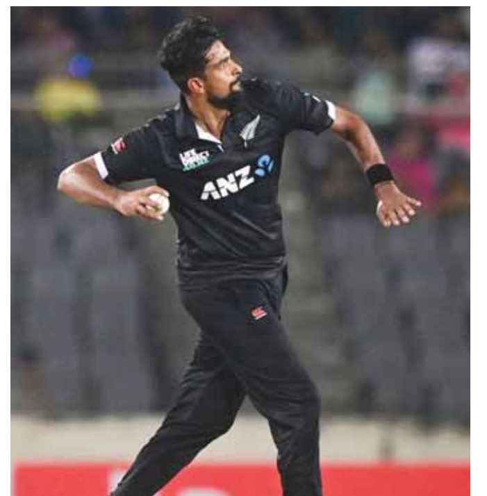
New Zealand's Ish Sodhi celebrates after taking the wicket of Bangladesh's Soumya Sarkar during the 2nd ODI at Sher-e-Bangla National Cricket Stadium in Dhaka yesterday.

BRIEF SCORES: New Zealand 254 (Blundell 68, Nicholls 49, Sodhi 35, Mahedi 3-45, Khaled 3-60) beat Bangladesh 168 (Mahmudullah 49, Tamim 44, Sodhi 6-39) by 86 runs.