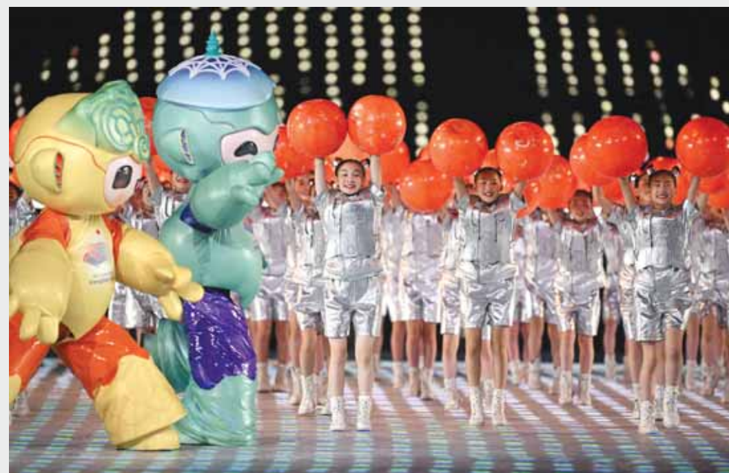
The 19th Asian Games began in a colourful ceremony in Hangzhou yesterday. The theme of the ceremony was water and it also celebrated Hangzhou's ancient history and landscape, while giving a nod to the city's reputation as the unofficial home of China's tech industry. A "digital torch bearer" strode into the stadium and was projected onto a large screen behind the Games cauldron at the climax.