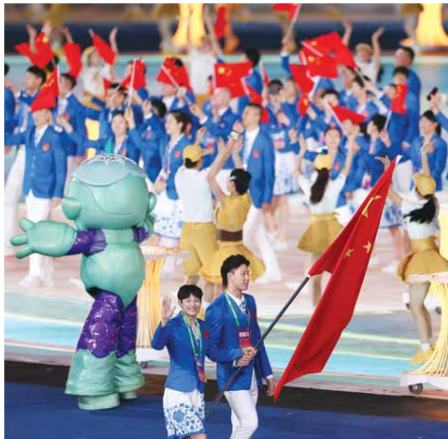
China's flag bearers Qin Haiyang (right) and Yang Liwei during the opening ceremony of the 19th Asian Games in Hangzhou, China, yesterday.

Hong Kong's Siobhan Haughey is a double Olympic freestyle silver medalist and in red-hot form heading into the Asian Games.