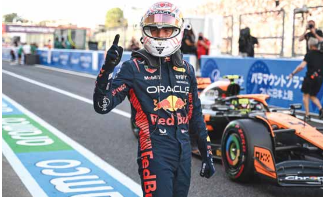
Red Bull Racing's Dutch driver Max Verstappen celebrates after taking pole position in the qualifying session for the Formula One Japanese Grand Prix at the Suzuka circuit, Mie prefecture, yesterday.

"These high-speed corners are really well-balanced and you can