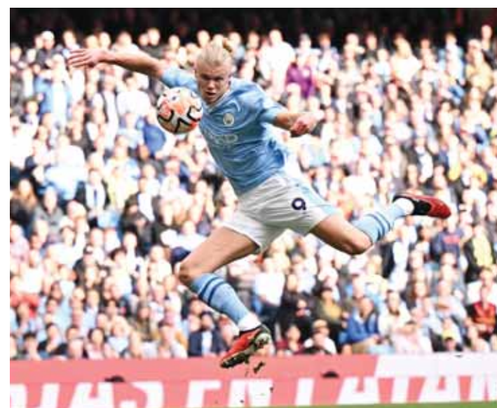
Manchester City's Erling Haaland in action during the Premier League match against Nottingham Forest in Manchester yesterday.

through Abdoulaye Doucoure's sixth minute strike. Mathias Jensen equalised for Brentford against the run of play after 28 minutes, but James Tarkowski restored Everton's advantage with a header from Dwight McNeil's corner in the 67th minute. Substitute Dominic Calvert-Lewin wrapped up Everton's long-awaited three points with a cool finish four minutes later. Luton picked up their first ever Premier League point but let a huge opportunity slip in a 1-1 draw at home to Wolves. The visitors at Kenilworth Road were reduced to 10 men when Jean-Ricner Bellegarde saw red on 39 minutes. Pedro Neto still fired Wolves in front early in the second-half, but Carlton Morris' penalty salvaged a point for Luton. Crystal Palace and Fulham remain in the top half after a 0-0 draw at Selhurst Park.