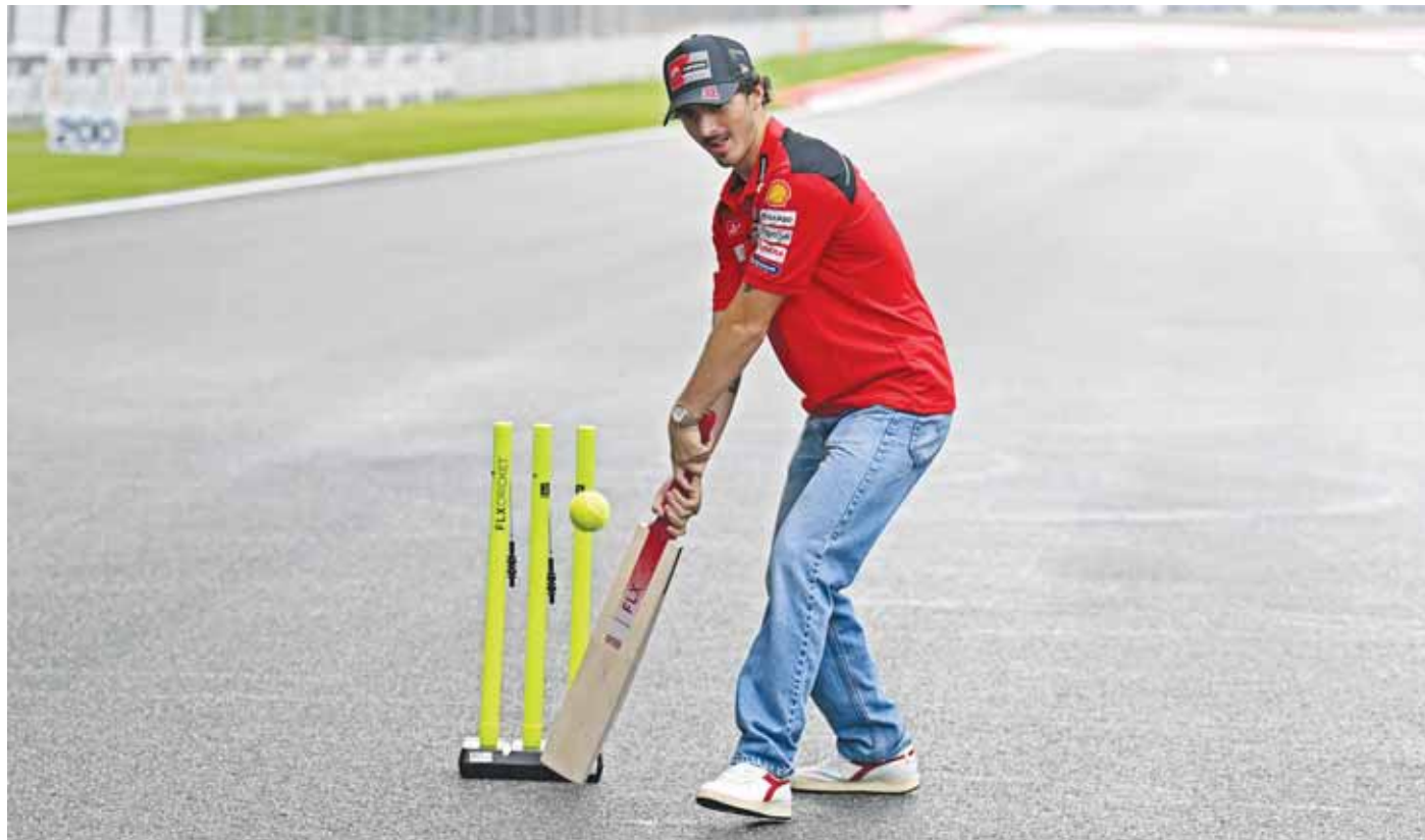
Ducati Lenovo Team's Italian rider Francesco Bagnaia plays cricket on the track ahead of the Indian MotoGP Grand Prix at the Buddh International Circuit in Greater Noida on the outskirts of New Delhi yesterday.

Buddh International Circuit set for first MotoGP spectacle in India