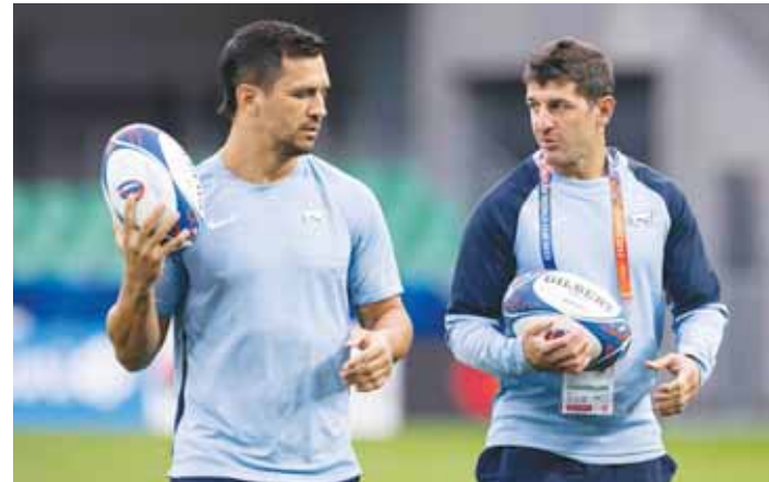
Argentina's centre Matias Moroni (left) and scrum-half Tomas Cubelli speak while holding a ball during the captain's run training session at Stade Geoffroy-Guichard in Saint-Etienne, France, yesterday.

England are already virtually assured of a place in the quarter-finals after their two wins against the strongest sides in the group but victory tomorrow would confirm it before they sign off against Samoa. They would then have a Marseille quarter-final against Wales, Fiji or Australia.