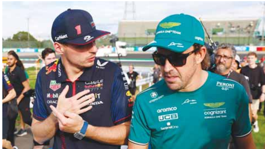
Red Bull's Max Verstappen and Aston Martin's Fernando Alonso ahead of the Japanese Grand Prix at the Suzuka Circuit, Japan, yesterday.

"I still think that from now onwards we can