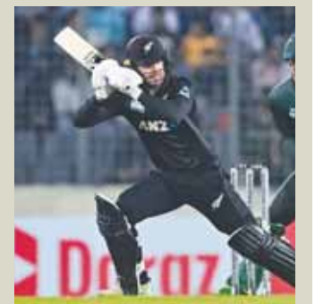
New Zealand's Tom Blundell plays a shot during the first ODI against Bangladesh in Dhaka yesterday.

Left-arm spinner Nasum Ahmed soon removed Young and Rachin Ravindra to halt New Zealand's progress. The second and third ODIs will be played at the same ground on September 23 and 26.