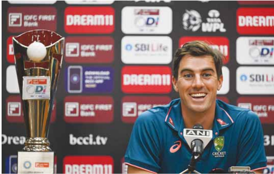
Australia captain Pat Cummins addresses a media briefing at the Punjab Cricket Association Stadium in Mohali yesterday.

"It gives us flexibility to pick four genuine bowlers or maybe three bowlers and bat an all-rounder at No. 8. Hopefully Maxi (Maxwell) comes back later in the series, but the other three guys have been bowling fantastically."