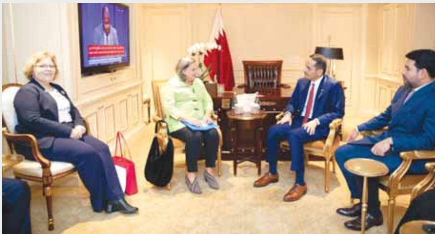
HE the Prime Minister and Minister of Foreign Affairs Sheikh Mohamed bin Abdulrahman bin Jassim al-Thani met separately with United States' Deputy Secretary of State for Political Affairs Victoria Nuland, United States' Assistant Secretary of State for Near Eastern Affairs Barbara Leaf, and Special Representative of US President for Afghanistan Thomas West, on the sidelines of the 78th United Nations General Assembly (UNGA), held in New York. The meetings discussed Qatar-US bilateral relations and ways to strengthen them as well as regional and international issues of common concern in addition to the latest developments in Afghanistan.