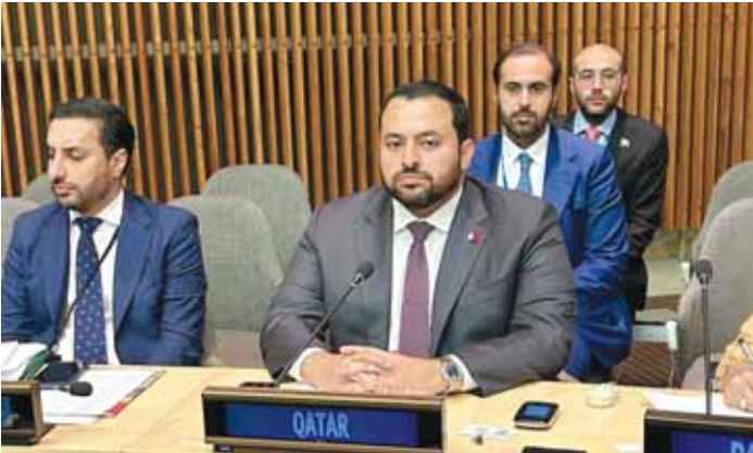
HE Dr Mohamed bin Abdulaziz al-Khulaifi

On another note, the Minister of State at the Ministry of Foreign Affairs addressed the continued escalation of violence and violations by the Israeli occupation authorities and settlers against Palestinians in the occupied land. He mentioned the ongoing systematic Judaisation campaign in Jerusalem, where Islamic and Christian holy sites, especially the Al Aqsa Mosque, are being dangerously targeted. He affirmed that these actions not only constitute a clear violation of international law and legitimate international decisions but also provoke the feelings of millions of Muslims around the world, especially the Islamic world.