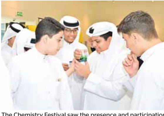
The Chemistry Festival saw the presence and participation of a number of middle and high schools.