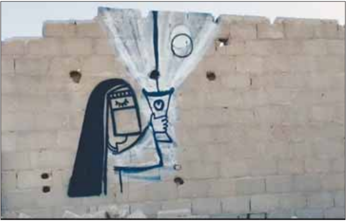
Mubarak al-Malik's works goes beyond the four corners of the galleries.