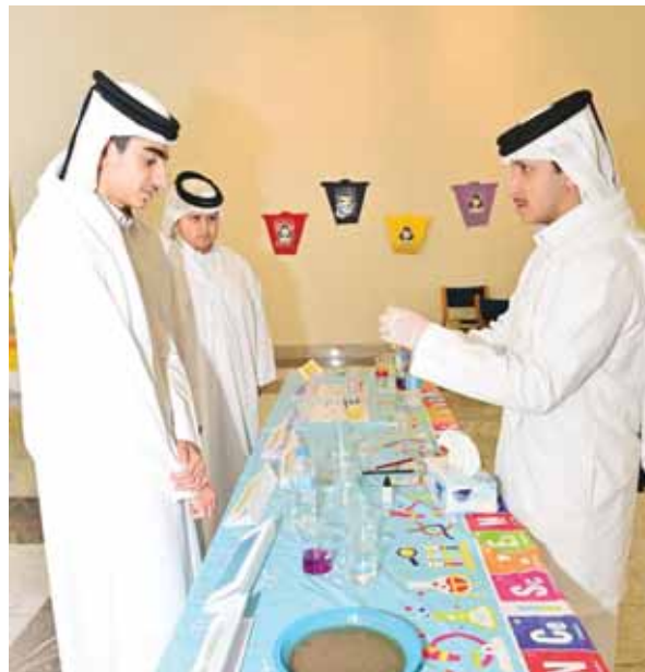
The event aimed to encourage students' interest in the field of chemistry.

fessor of Organic Chemistry, College of Arts and Sciences (CAS) said: "The Chemistry Festival is a significant event where professionals, professors, teachers and students gather and participate in activities aimed at demonstrating and emphasising