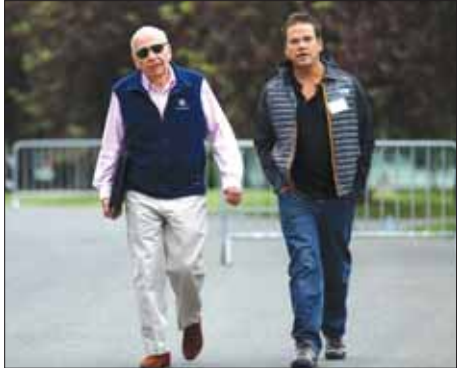
Rupert Murdoch (left) and his son Lachlan attend the first day of the annual Allen and Co. media conference in Sun Valley, Idaho in this July 8, 2015 file photo.

had “open contempt” for outsiders. “Most of the media is in cahoots with those elites, peddling political narratives rather than pursuing the truth,” he said. The tycoon leaves behind a trail of media scandals. In 2011, the company suddenly shuttered the News of the World , a popular British weekly tabloid following public revulsion over its journalists’ practice of hacking the phones of celebrities and crime victims to get scoops. Then in 2016, Rupert Murdoch ousted powerful news chief Roger Ailes following a sexual harassment scandal later dramatised in the Oscar-winning 2019 movie Blockbuster . But every controversy paled in comparison to fallout from the Murdoch empire’s relationship with Trump, peaking in coverage of the Republican populist’s campaign to persuade tens of millions of people that he was cheated in the 2020 election. In April, Fox News agreed to pay a $787.5mn settlement in a defamation case brought by voting machine maker Dominion. It alleged