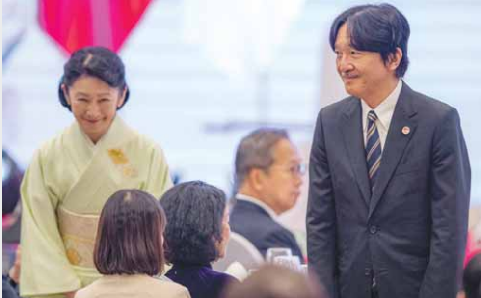
Japan’s Crown Prince Akishino and Crown Princess Kiko take part in a event to mark 50 years of diplomatic relations between Vietnam and Japan at the International Conference Center in Hanoi yesterday. Japan’s Crown Prince and Princess have arrived in Hanoi for their first visit to Vietnam since 1999 to mark the two country’s 50th anniversary of diplomatic ties.