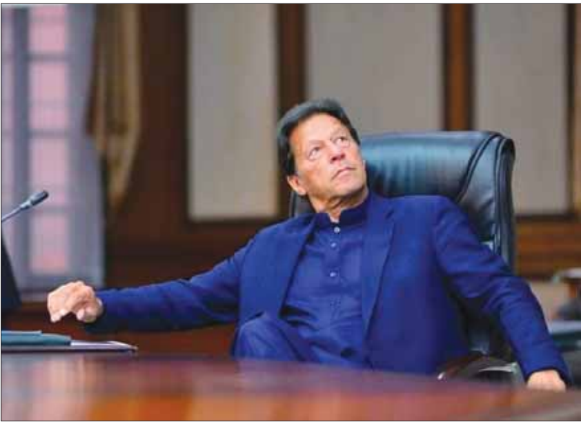
UNDER A CLOUD: Former PM Imran Khan and his party Pakistan Tehreek-e-Insaf are currently out of favour with the powerful military despite riding a popular wave.

With the odds heavily stacked against the defiant former premier Khan, the country's most popular political leader by