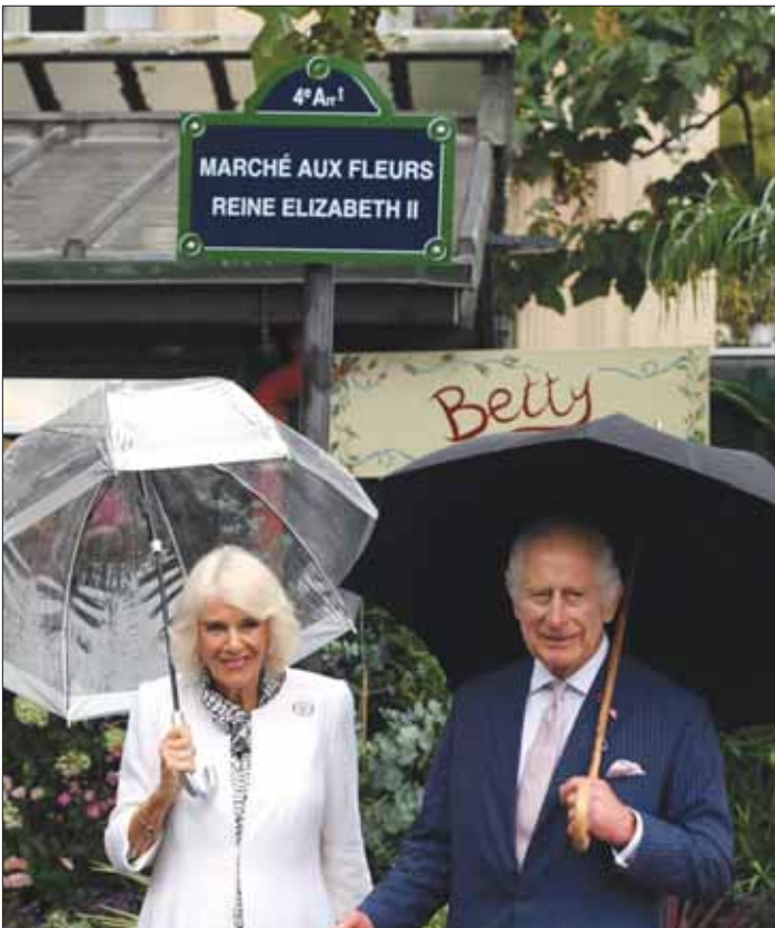
Britain's King Charles III and his wife Queen Camilla pose as they arrive to visit the central Paris Flower Market, named after her late Majesty Queen Elizabeth during her state visit in 2014, in Paris yesterday.

Later on the Ile de la Cite on the river Seine, Charles — a keen gardener who once admitted he talked to his plants — toured a flower market named after Queen Elizabeth II on her last state visit in 2014.