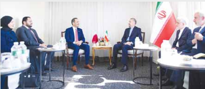
HE the Prime Minister and the Minister of Foreign Affairs Sheikh Mohamed bin Abdulrahman bin Jassim al-Thani met yesterday with Minister of Foreign Affairs of the Islamic Republic of Iran Dr Hossein Amir-Abdollahian, on the margin of the 78th Session of the United Nations General Assembly (UNGA 78) in New York. During the meeting, they discussed co-operation between the two countries and ways to support and enhance them, as well as efforts related to negotiations to return to the joint action plan. The Iranian foreign minister also thanked Qatar for its role in mediating the US-Iranian agreement on the exchange of the detainees.