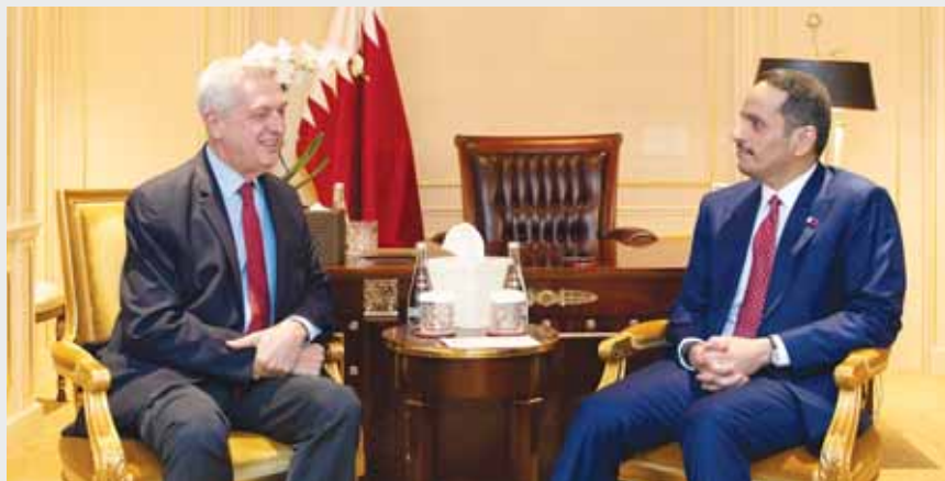
HE the Prime Minister and Minister of Foreign Affairs Sheikh Mohamed bin Abdulrahman bin Jassim al-Thani met with United Nations High Commissioner for Refugees (UNHCR) Filippo Grandi, on the margins of the 78th UN General Assembly (UNGA) in New York. During the meeting, they discussed aspects of co-operation between Qatar and the UNHCR.