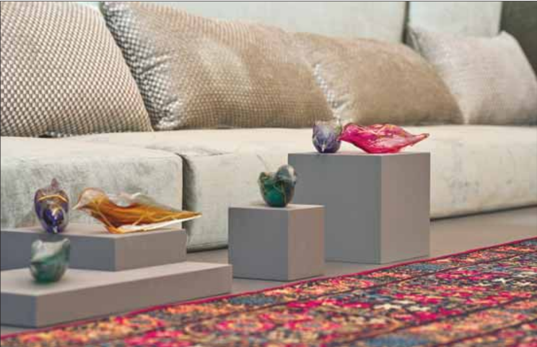
Shattered, 2023 by Felekan Onar, 1966. Damascus Room, Gallery 12, Museum of Islamic Art. September 20 to May 7, 2024.

tion by 2030, QT continues to collaborate with its valued partners to build experiences and attractions across the country.