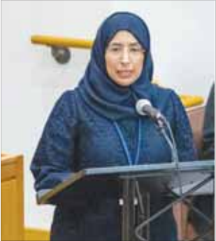
HE Dr Hanan Mohamed al-Kuwari addressing the conference.

HE al-Kuwari stressed the need to strengthen the global