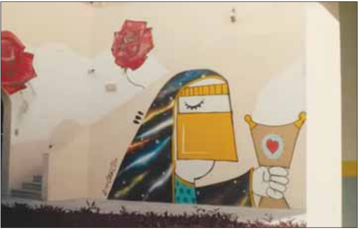
The battoulah is central to the artist's creations.