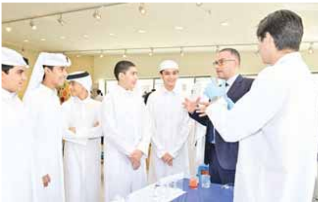
QU holds Chemistry Festival in its 5th edition.