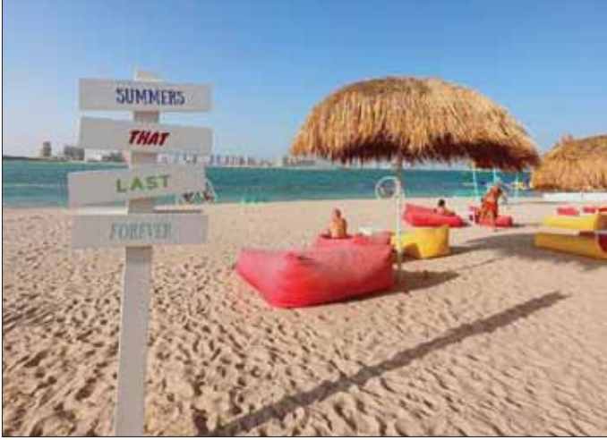
QT's extensive West Bay Beach project covers 40,000sq m of premium beachfront. It includes Doha Sands, B12 and WBB, each of which offers a distinctly different experience.

QT's extensive West Bay Beach project, which covers 40,000sq m of premium beachfront, includes Doha Sands, B12