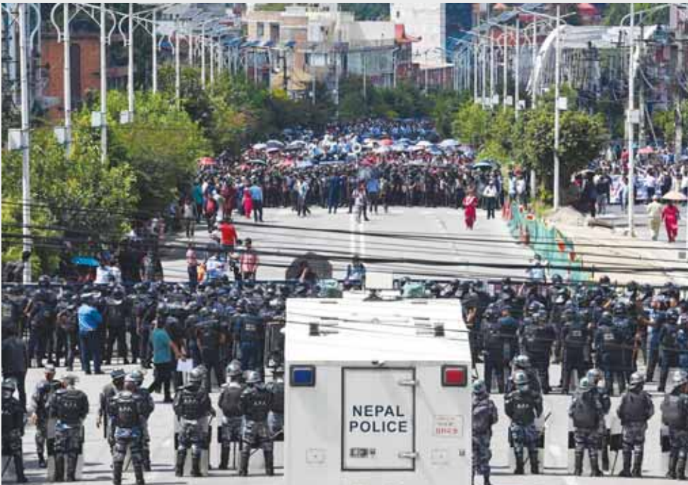
Police stand guard as the Nepal Teachers Association protests near the parliament in Kathmandu yesterday, against a new school bill which will empower the local authorities to define the teachers’ terms of service instead of the federal government.

British minister Michael Gove said the government had been forced to intervene in the day-to-day running of Birmingham, which earlier this month effectively declared bankruptcy. Gove said he would appoint commissioners to take over the running of Birmingham City Council – the largest local authority in Europe – having determined that the council had failed to comply with its duties. “I’m proposing the transfer to the commissioners of the exercise of all functions associated with the council’s governance and scrutiny of strategic decision making, all functions associated with its financial governance,” Gove, Secretary of State for Levelling Up, Housing and Communities, told parliament. On September 5, Birmingham issued a ‘Section 114 notice’, effectively declaring itself in financial distress and no longer solvent as it faced spiralling liabilities relating to historic equal pay claims.