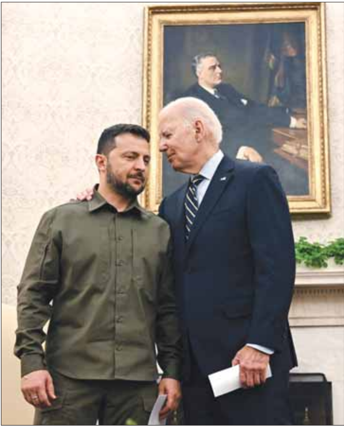
US President Joe Biden meets with Ukrainian President Volodymyr Zelensky in the Oval Office of the White House in Washington, DC, yesterday.

Speaker of the House of Representatives, Kevin McCarthy, who is having trouble keeping a lid on internal party squabbling over US spending in Ukraine. Some Republicans say the money could be better spent on US border security, while there are also concerns about the pace of Kyiv’s counteroffensive and that corruption in Ukraine means the money will go to waste. The doubts are being fuelled by messaging from former president and likely 2024 candidate Donald Trump, who has opposed more funding and frequently expressed admiration for Russia’s Vladimir Putin. It’s a trend that has also reached parts of the generally more pro-Ukraine Republicans in the Senate, where Senator Roger Marshall said Congress should not be “sending another blank check to Zelensky.” A group of six senators led by Republican JD Vance issued a joint letter declaring that “enough is enough” and vowing to block all future funding requests. Earlier this week, Zelensky attended the UN General Assembly