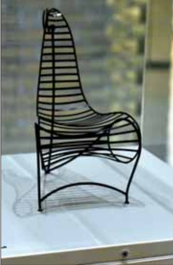
The expo displays 100 Classical Seats in precise 1:6 miniature replicas.

The ‘Miniatures Exhibition’ by Al Mana Maples opened yesterday at Doha Design District at Msheireb, featuring 100 meticulously crafted 1:6 scale tiny reproductions of classical seats. The unique show, running until October 16, offers a chance for design enthusiasts and aficionados to explore the complex interplay between design and industrial production, in addition to providing all visitors with an engaging and educational experience. “Through these miniatures, you’ll have a unique opportunity to delve into the world of design and gain insights into the intricate processes of industrial production. It’s a chance to see how design evolves from concept to creation,” Msheireb Properties’ Interior Design senior manager Shaikha al-Sulaiti told attendees, adding that the show serves as a satellite exhibition to Vitra’s Masterpieces of Furniture Design (on display until December 9). She was joined by Al Mana Maples general manager Emad al-Shoubaki who presented detailed