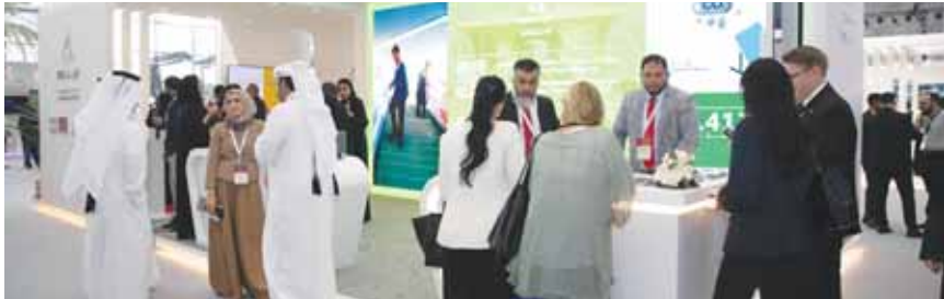
Qatar Rail's booth at the conference.