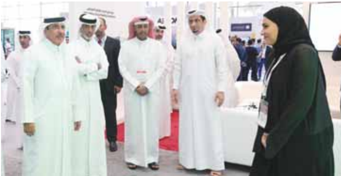
HE the Minister of Transport Jassim bin Saif al-Sulaiti visits Qatar Rail booth.

He emphasised how this integration is realised through cooperative efforts involving key stakeholders and transportation sector partners, enabling a seamless transportation experience.