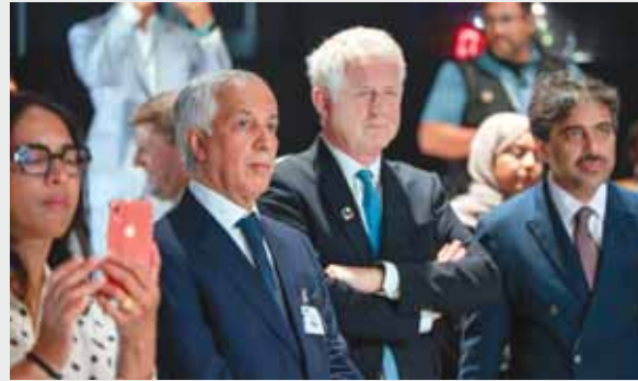
HE the Minister of State for Foreign Affairs Sultan bin Saad al-Muraikhi and UN Deputy Secretary-General Amina Mohamed participated yesterday in the official opening ceremony of the Sustainable Development Goals Pavilion funded by Qatar in partnership with the Education Above All Foundation, on the sidelines of the 78th session of the UN General Assembly in New York. The pavilion highlights the promotion of development and peace internationally to achieve sustainable development goals. (QNA)