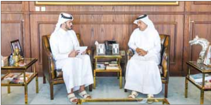
The United Nations anti-corruption lawyer during the interview.

He stressed that Qatar’s interest in actively participating in