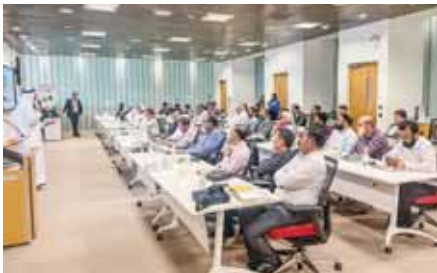
Attendees at one of the workshops.