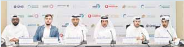
Officials announce Future Tech Forum 2023.