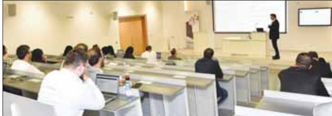
Among the goals of the lecture was to understand the research landscape at RCSI.

During the lecture, valuable insights were shared regarding research topics and research teams at RCSI, with its distinguished heritage spanning several centuries. It is globally recognised as an institution dedicated to surgical and medical education, training, and research, continually contributing to healthcare delivery, making it a prestigious partner for academic and research co-operation. The objective of Prof O’Connor’s presentation was to facilitate the