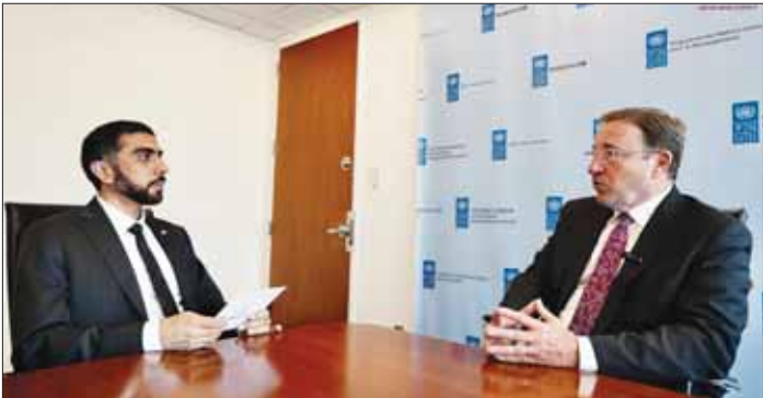
The administrator of the United Nations Development Programme during the interview.

He added that for the UNDP, the UN House in Doha is “both a