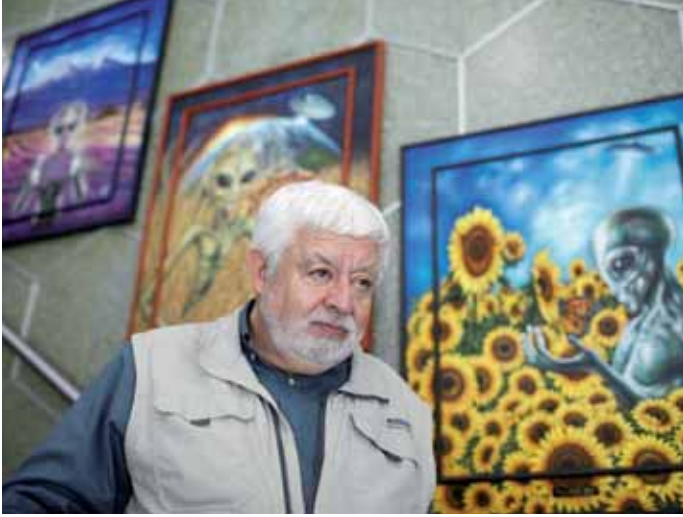
Mexican journalist and ufologist Jaime Maussan.

For Jaime Maussan, a Mexican journalist and long-time UFO enthusiast, they are one of the most important discoveries in the history of humankind. But for many scientists these two tiny mummified bodies with elongated heads and three fingers on each hand, images of which were beamed around the world this week when they were presented to Mexico’s Congress, are an already-debunked – perhaps criminal – stunt. At Maussan’s office, in the Mexico City business district of Santa Fe, staff members carefully carry the two closed boxes with glass lids containing the bodies into a green-screened studio, where Reuters had exclusive access on Friday. Everyone huddles around to get a better look. The bodies appear ancient and share characteristics with humans: two eyes, a mouth, two arms, two legs. Maussan claims they were found around 2017 in Peru, near the pre-Columbian Nazca Lines. He says he can prove they are unlike anything known on Earth. On social media and in the hearing, he shared scientific analysis and study results he argues proves the bodies are about 1,000 years old and not related to any known Earthly species. One of them, described by Maussan as a female, was discovered to have eggs inside, he said. “It is the most important thing that has happened to humanity,” Maussan, 70, said of