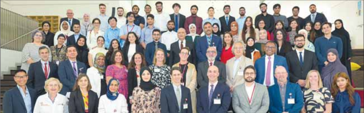
Residency programme directors from leading US medical colleges visit WCM-Q.