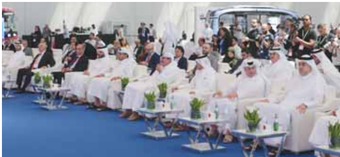
HE the Minister of Transport Jassim bin Saif al-Sulaiti along with other dignitaries at the wrap-up of the conference yesterday.

HE the Minister of Transport Jassim bin Saif al-Sulaiti honoured the sponsors of the “Sustainable Transportation and Legacy for Generations” conference and exhibition by the Ministry of Transport (MoT), which wrapped up yesterday.