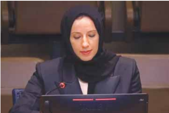
HE the Minister of Education and Higher Education Buthaina bint Ali al-Jabr al-Nuaimi

The session is part of endeavours to strengthen global efforts to accelerate achieving the fourth SDG