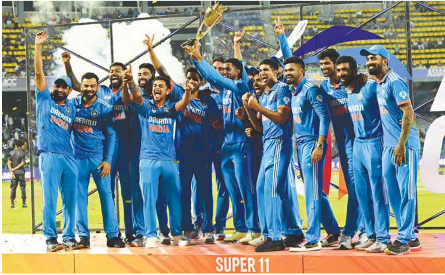
India's players celebrate with the trophy after winning the Asia Cup 2023 final in Colombo yesterday.

Siraj got his fifth with the wicket of Sri Lanka captain Dasun