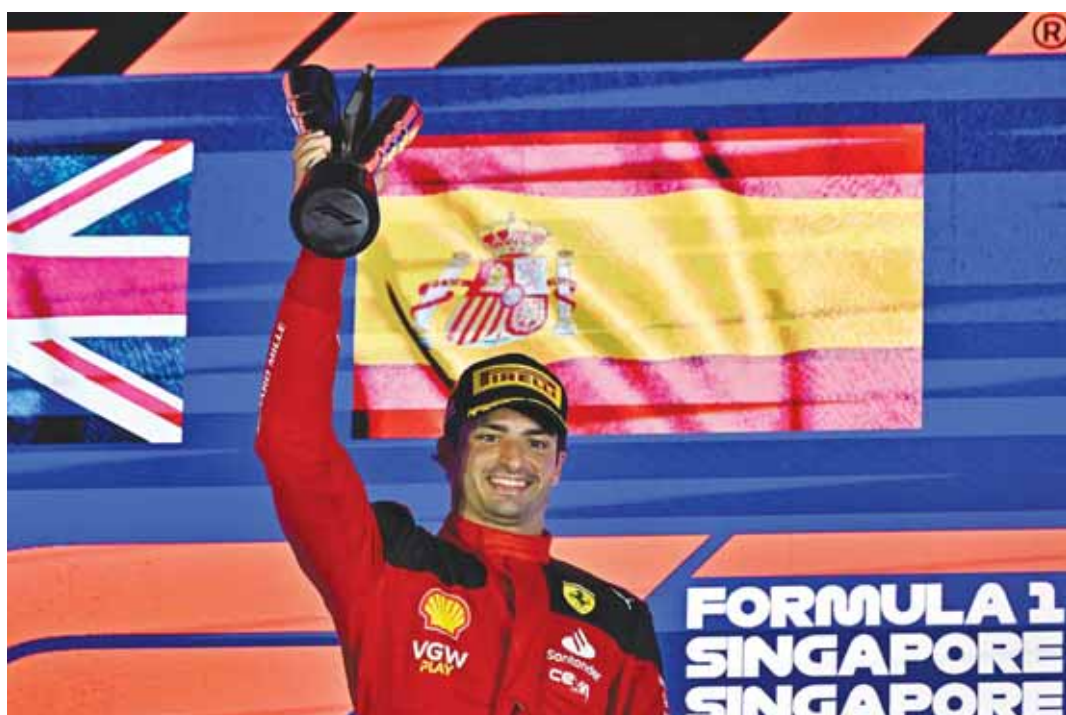
Ferrari's Spanish driver Carlos Sainz Jr celebrates on the podium after winning the Singapore Formula One Grand Prix night race at the Marina Bay Street Circuit in Singapore yesterday.