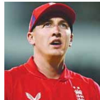
derlined by the performances in the series win against a very good New Zealand team.