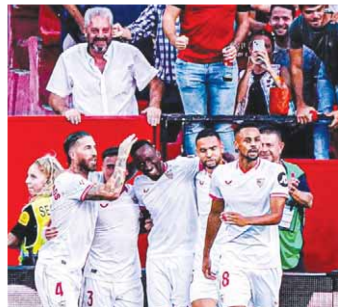
Sergio Ramos (left) and his teammates celebrate a goal against Las Palmas at Ramon Sanchez Pizjuan Stadium yesterday.

"I speak only in sporting terms - the fans are very excited, the truth is I think it's very positive for Getafe and for Spanish football, I have no doubt," he added.