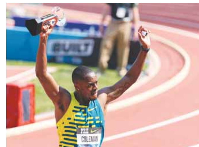
Christian Coleman of the US holds up the Diamond League Final trophy after winning the men's 100m at Hayward Field in Eugene, Oregon.