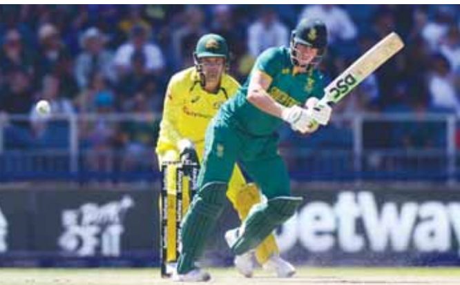
South Africa's David Miller in action during their fifth ODI against Australia at the Wanderers Stadium, Johannesburg, South Africa, yesterday.

But South Africa set about the bowling as Aiden Markram and David Miller put on 109 runs in 107 balls for the fifth wicket before