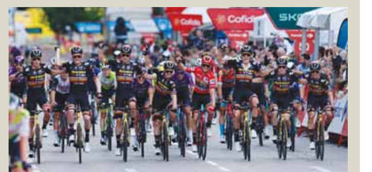
Overall leader Team Jumbo-Visma's US rider Sepp Kuss (in red) celebrates with teammates winning while crossing the finish line of the 21st and last stage of the 2023 La Vuelta cycling tour of Spain yesterday.

The complications soon faded and attention turned to the race itself, with Kuss taking the red jersey from stage eight and holding it until the end.