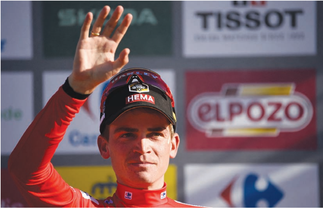
Team Jumbo-Visma’s US rider Sepp Kuss wearing the overall leader’s red jersey celebrates on the podium after stage 18 of the 2023 La Vuelta cycling tour of Spain, a 178.9km race between Pola de Allande and Puerto de La Cruz de Linares, yesterday.

“It’s getting closer and today was another important day,” Kuss said. “I knew I had to be really concentrated and put in a good performance to stay in the jersey.” Evenepoel’s hopes of fighting