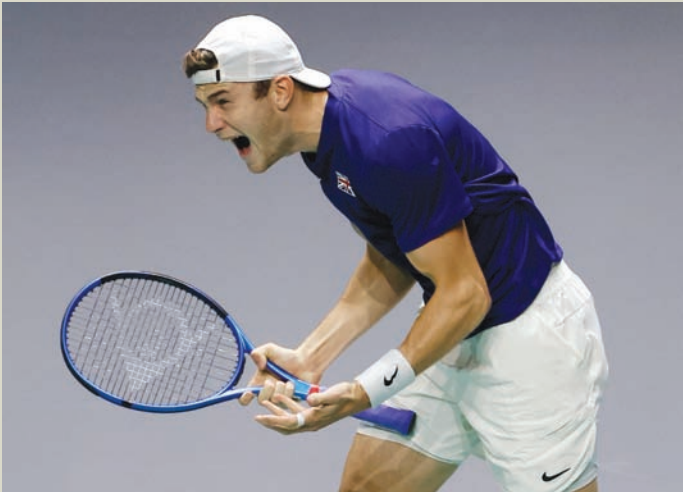
Britain’s Jack Draper celebrates winning his match against Australia’s Thanasi Kokkinakis on Wednesday.

took the doubles to leave the home side 2-1 winners, with the 2015 champions second to France, who beat Switzerland 24 hours earlier, in Group B. Draper was buzzing from his first taste of Davis Cup competition. “There’s nothing better. It was a real battle, massive crowd in here,” he said on court yesterday. The United States had to dig deep in Split to overcome hosts Croatia 2-1. Mackenzie McDonald got the record 32-time winners off to a positive start with a 6-4, 6-2 win over 18-year-old Dino Prizmic. Borna Gojo then levelled the tie by topping US Open quarter-finalist Frances Tiafoe (USA) 6-4, 7-6 (8/6).