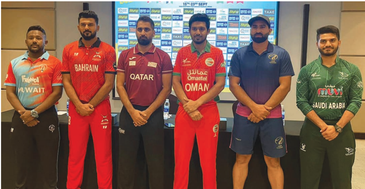
Captains of the six countries pose for a picture after a press conference yesterday, on the eve of the T20I Gulf Cricket Championship.

The inaugural tournament will be played in round robin format