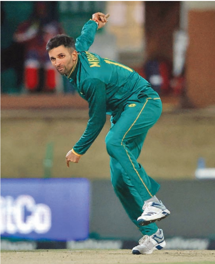
South Africa's Keshav Maharaj delivers a ball during the third match against Australia at Senwes Park in Potchefstroom.

The fourth ODI will be played in Pretoria today.