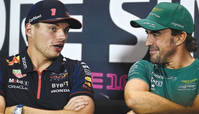
Aston Martin’s driver Fernando Alonso (right) chats with Red Bull Racing’s driver Max Verstappen as they take part in a press conference ahead of the Singapore Formula One Grand Prix night at the Marina Bay Street Circuit in Singapore yesterday.

Verstappen’s Red Bull teammate Sergio Perez won in wild conditions a year ago, when the race start was delayed by more than an hour because