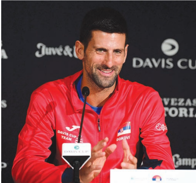
Serbia’s Novak Djokovic holds a press conference during the finals group stage of the 2023 Davis Cup at the Fuente San Luis Sports Hall in Valencia yesterday.

“There’s not much time to recover, I have to maintain the intensity and do everything I can to adapt my body to the new time zone, new conditions and be able to contribute to my country with a point.”