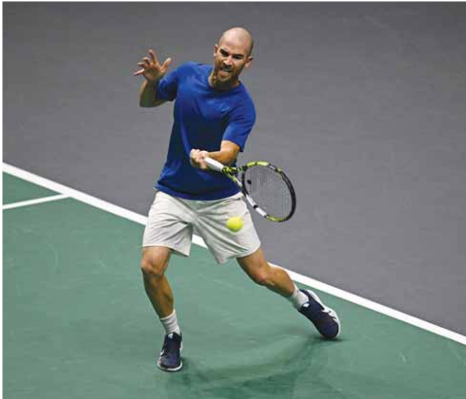
France's Adrian Mannarino reacts as he plays against Switzerland's Dominic Stricker during their Davis Cup finals Group B match at the AO Arena in Manchester yesterday.

The French wrapped up their 3-0 win in the doubles with Nicolas Mahut and Davis Cup