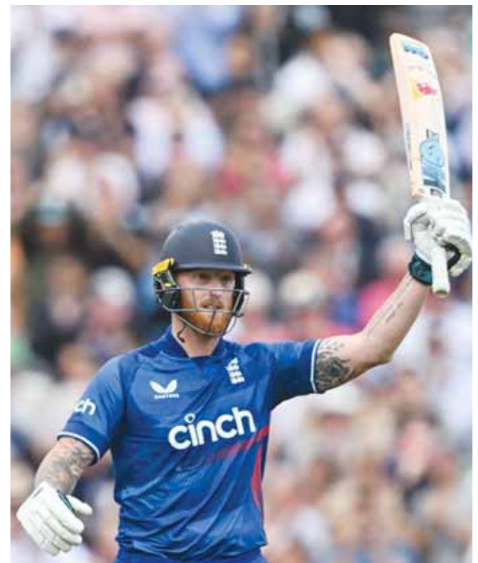
England's captain Ben Stokes celebrates his century during the third ODI against New Zealand at The Oval in London yesterday.

BRIEF SCORES England 368 all out, 48.1 overs (B Stokes 182, D Malan 96; T Boult 5-51, B Lister 3-69) bt New Zealand 187 all out, 39 overs (G Phillips 72; Livingstone 3-16, C Woakes 3-31) Result: England won by 181 runs Series: England lead four-match series 2-1