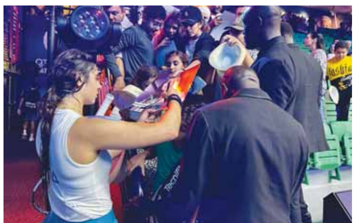
Nour El Sherbini of Egypt signs autographs after beating Belgium's Nele Gillis yesterday. Right: Tinne Gillis of Belgium in action against Salma Hany of Egypt yesterday.