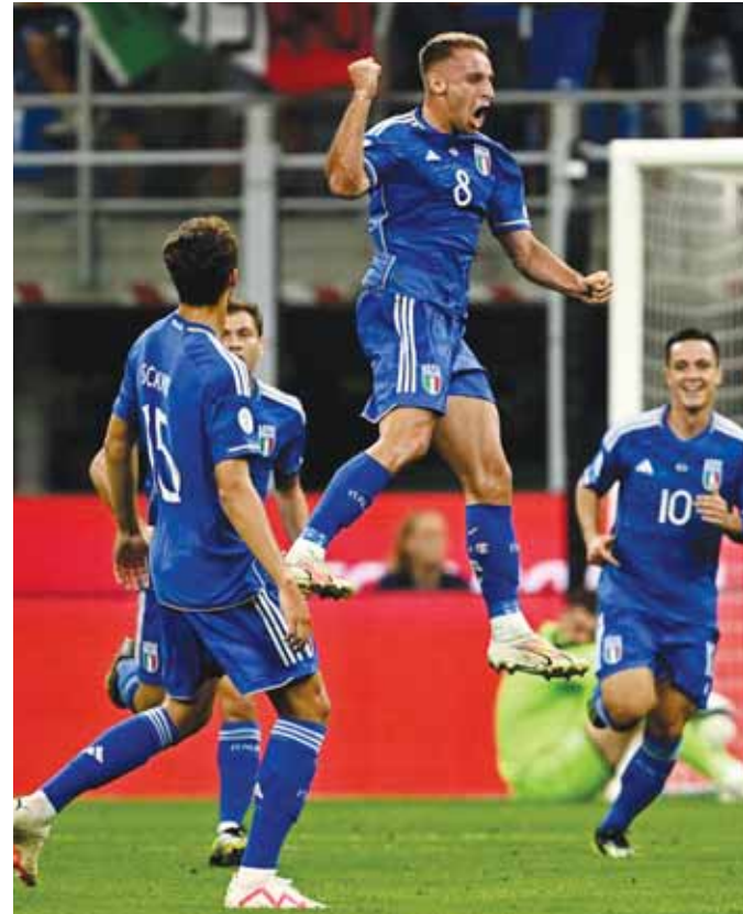
Italy's midfielder Davide Frattesi (centre) celebrates after scoring against Ukraine during the Euro 2024 Group C qualifying match at Stadio San Siro in Milan on Tuesday.

Israel left it later, Gabi Kanielchowsky scoring the only goal as they beat Belarus 1-0 in Tel Aviv in the third minute of added time to keep Israel a point behind Romania.