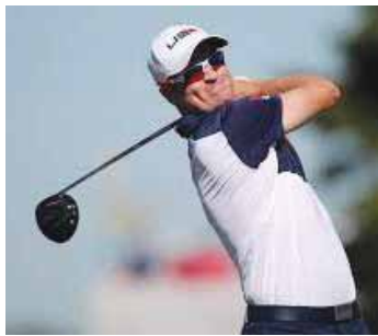
I'm at peace with whatever comes my way."