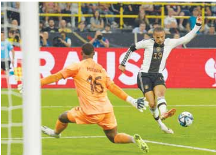
Germany's Leroy Sane (right) scores past France's goalkeeper Mike Maignan during a friendly in Dortmund, western Germany.