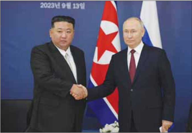
Russian President Vladimir Putin (right) and North Korea's leader Kim Jong-un shaking hands during their meeting at the Vostochny Cosmodrome in Amur region yesterday.

"I firmly believe that the heroic Russian army and people will brilliantly inherit their victories and traditions and vigorously demonstrate their noble dignity and honour on the two fronts of military operations and building a powerful nation," Kim told