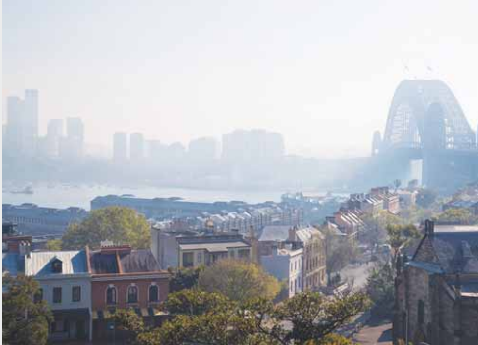
The Sydney Harbour Bridge is shrouded by smoke yesterday after a ring of controlled blazes burned on the city's fringes in preparation for the looming bushfire season.