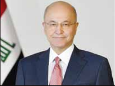
Iraq's former president Barham Salih.

A long-term Kurdish Iraqi politician, who served as the eighth president of Iraq between 2018 and 2022, he has a profound, personal understanding of the complexities involved in Iraq's multi-ethnic, multi-religious socio-political landscape. His participation is a significant