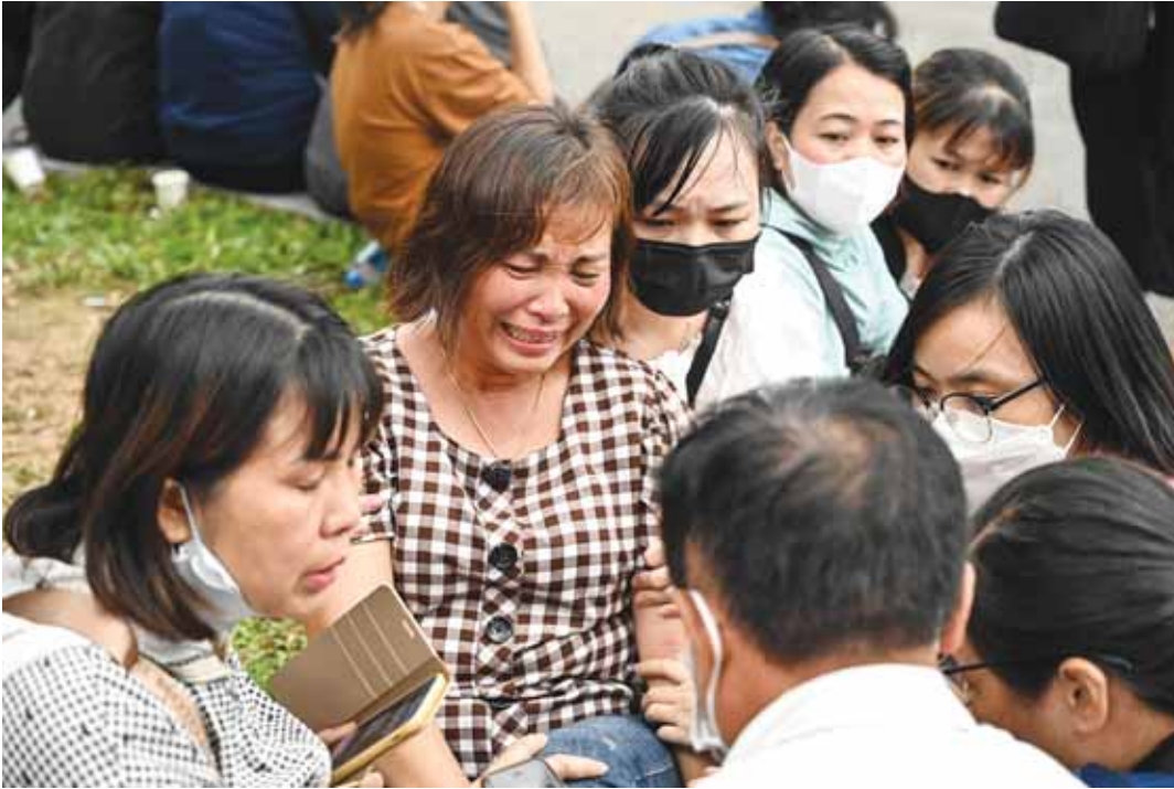
A relative cries while waiting outside a funeral house during the identification of victims of the major fire at an apartment block in Hanoi yesterday. Dozens of people have been killed after a huge fire at an apartment block in the Vietnamese capital Hanoi, state media said yesterday.