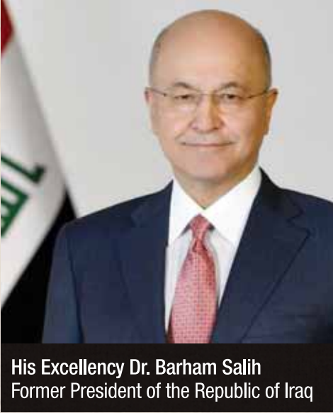
His Excellency Dr. Barham Salih Former President of the Republic of Iraq

Twenty years on, the geopolitical legacy of the US-led invasion of Iraq endures. Join us as scholars and experts analyze the profound impact of this pivotal event on regional security, international relations, and the emerging global order.