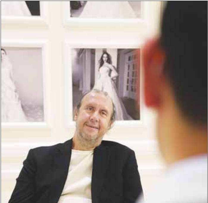
Tony Ward, a Lebanese-Italian fashion designer, has transformed his family's couture house into an international brand known for innovation and masterful craftsmanship.