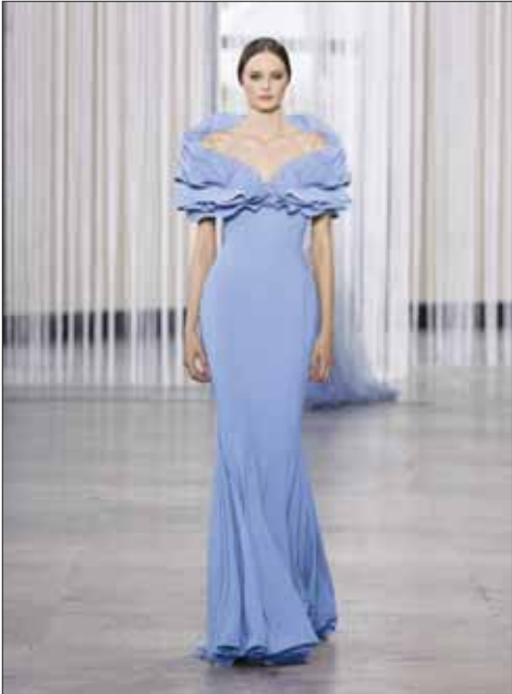
As part of the trunk show, held at Fifty One East, Tony Ward displayed the latest Fall Winter 2023/24 Couture Collection, which marked an important moment for the designer, as sustainability claimed a prominent role.

commercial interests and environmental responsibility. He said that being truly beneficial means accepting reduced profits in the short term.