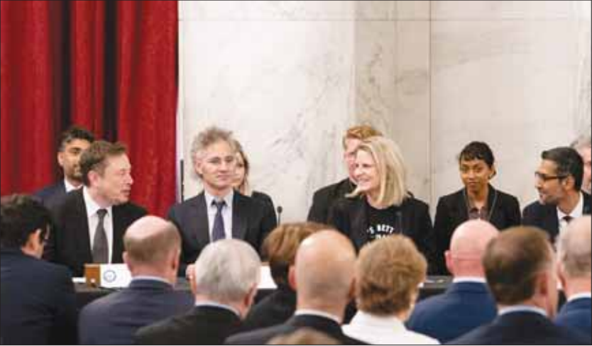
(L to R) SpaceX, Twitter and electric car maker Tesla CEO Elon Musk, Palantir CEO Alex Karp, AFL-CIO President Elizabeth Shuler and Google CEO Sundar Pichai attend a bipartisan AI insight forum at the Russell Senate Office Building on Capitol Hill in Washington, DC yesterday.

AI policy that Congress can pass," US Senate Majority Leader Chuck Schumer, a Democrat, said in opening remarks. "Congress must play a role, because without Congress we will neither maximise AI's benefits, nor minimise its risks." Other attendees included Nvidia CEO Jensen Huang, Microsoft CEO Satya Nadella, IBM CEO Arvind Krishna, former Microsoft CEO Bill Gates, and AFL-CIO labour federation President Liz Shuler. Schumer, who discussed AI with Musk in April, said attendees would talk "about why Congress must act, what questions to ask, and how to build a consensus for safe innovation."