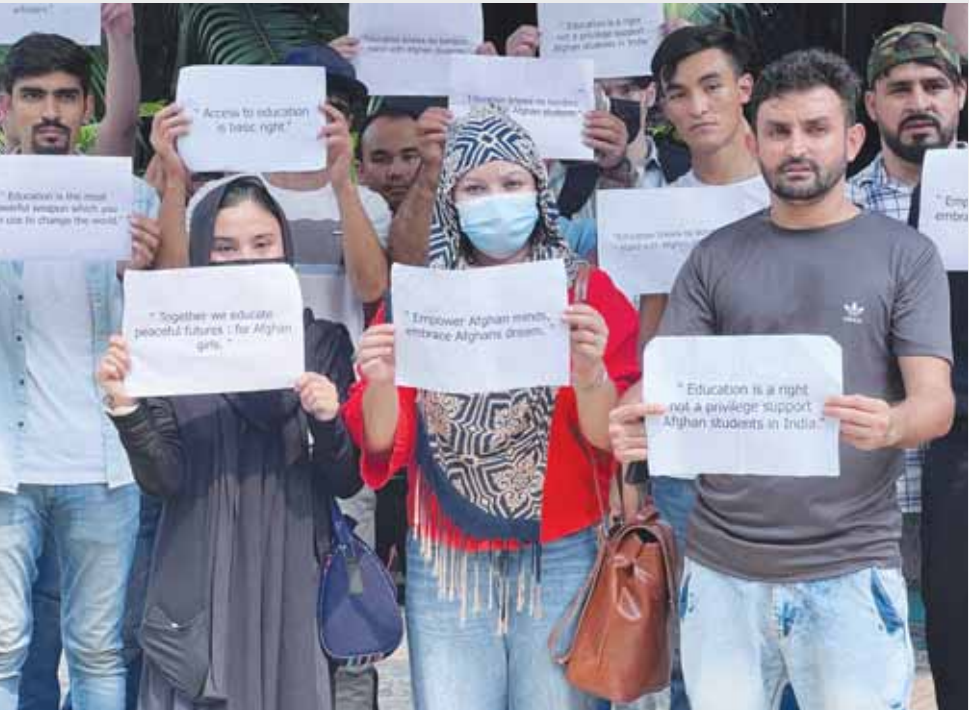
Hundreds of Afghan college students living in India despite the expiry of their student visas staged a protest in New Delhi yesterday to urge the Indian government to extend their stay and allow them to resume their studies. India has in the past offered scholarships to thousands of overseas students from countries such as Afghanistan to pursue undergraduate and post-graduate degrees.