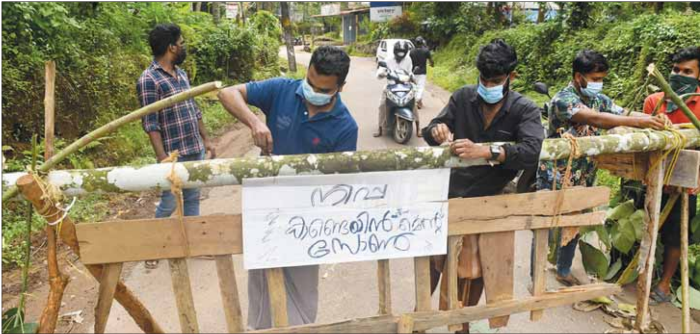
Residents fix a sign reading "Nipah containment zone" on a barricade, put up to block a road after the authorities declared the area a containment zone, to prevent the spread of Nipah virus in Ayanchery village in Kozhikode district, Kerala, India, yesterday.

Last month Ambani said in a speech that "several marquee global strategic and financial investors have shown strong interest" in his company, but gave no names.