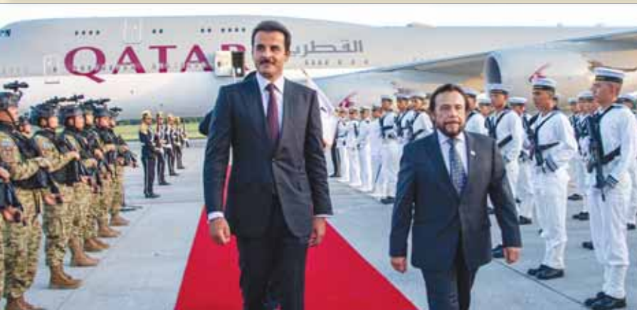
His Highness the Amir Sheikh Tamim bin Hamad al-Thani and the accompanying delegation were received upon arrival at the El Salvador international airport among others by Vice-President Felix Augusto Antonio Ulloa Garay.