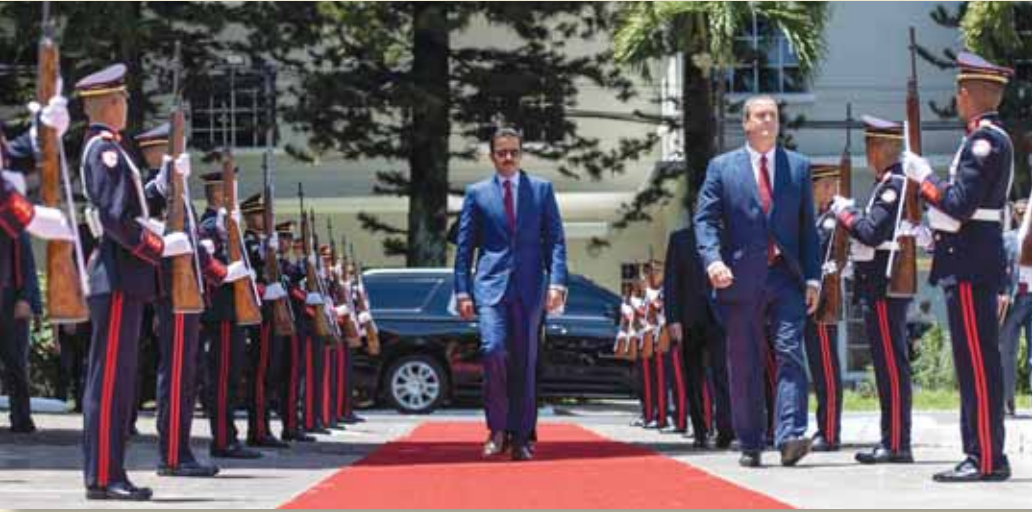
An official reception ceremony was held for His Highness the Amir Sheikh Tamim bin Hamad al-Thani upon his arrival at the presidential palace in San Salvador.