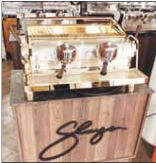
A 24-karat, gold-plated coffee machine at Partners&Partners pegged at QR270,000.

Different coffee events and activities are scheduled to take place in Doha in