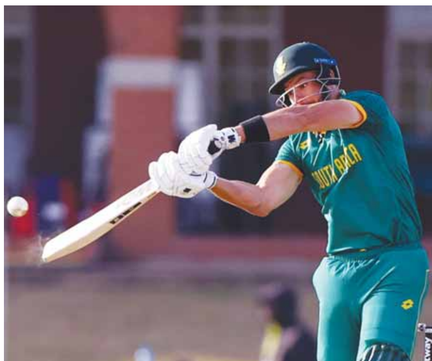
South Africa's Aiden Markram plays through the off side during the third ODI against Australia in Potchefstroom, South Africa, yesterday.

"There were errors with bat and ball on which we could have improved. We go to