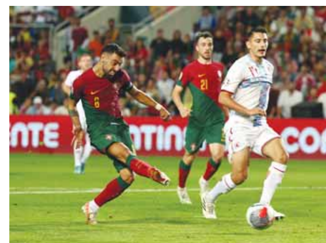
Portugal's Bruno Fernandes (left) scores against Luxembourg during the Euro 2024 Qualifier in Alcantara, Portugal.

Martinez's side can qualify for Euro 2024 on October 13 if they beat Slovakia and Luxembourg fail to beat Iceland.