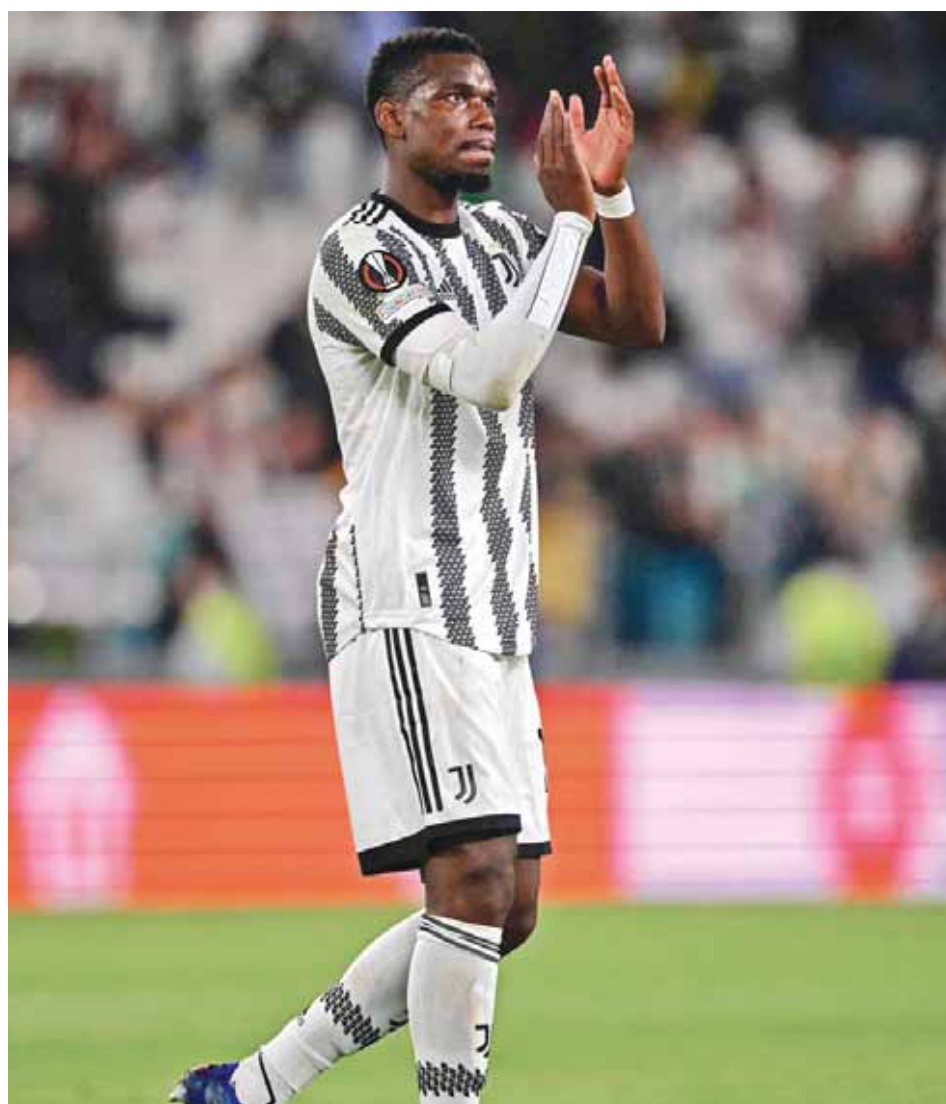
Paul Pogba re-joined Italian giants Juventus on a free transfer in July 2022 after his contract expired at Manchester United.

From being on top of the world Pogba has slowly slipped down to the depths, ravaged by injuries and a difficult personal life which he admits has been adversely affected by the vast sums of money earned by football's top players. "Money changes people. It can break up a family. It can create a war," he said. "Sometimes I was just by myself thinking, 'I don't want to have money anymore. I just don't want to play anymore. I just want to be with normal people,