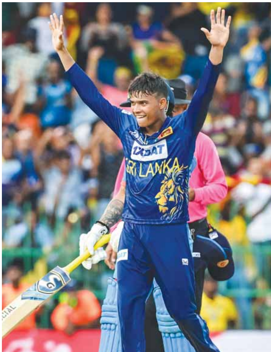
Sri Lanka's Dunith Wellalage celebrates after taking the wicket of India's KL Rahul during the Asia Cup Super Four ODI match in Colombo yesterday.

Ishan Kishan, who made 33, and previous-match centurion KL Rahul attempted to rebuild the innings with a stand of 63. Wellalage ended that partnership when he