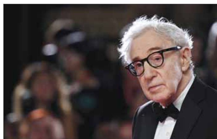
US director Woody Allen pose on the red carpet of the movie Coup de Chance presented out of competition at the 80th Venice Film Festival yesterday at Venice Lido.

In a separate interview to Variety on the sidelines of the film festival, Allen said he supported the