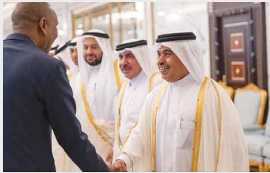
HE the Prime Minister and Minister of Foreign Affairs Sheikh Mohamed bin Abdulrahman bin Jassim al-Thani met, at the Amiri Diwan yesterday, with Somali Prime Minister Hamza Abdi Barre. The meeting discussed co-operation relations between the two countries, in addition to discussing the latest developments in Somalia. The meeting was attended by a number of ministers and senior officials. On the Somali side, it was attended by a number of members of the official delegation. (QNA)