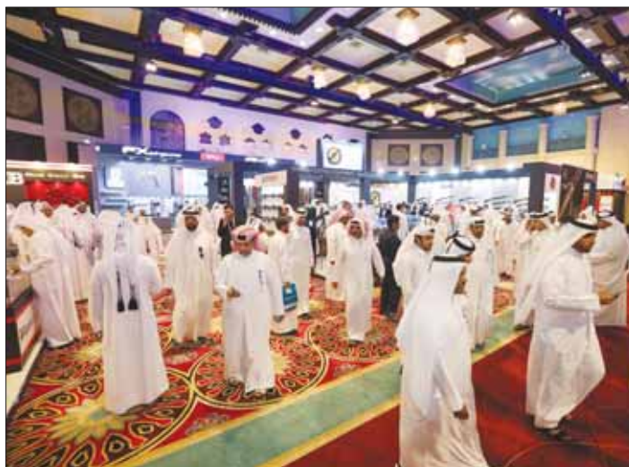
Dignitaries and visitors on the opening day of S'hail 2023. The five-day event that concludes on Saturday, has the participation of 190 major companies from 17 countries.