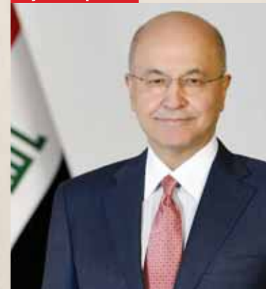
His Excellency Dr. Barham Salih Former President of the Republic of Iraq