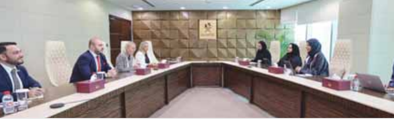
HE the Minister of State for International Co-operation at the Ministry of Foreign Affairs Lolwah bint Rashid AlKhater met yesterday with the visiting Director General for the Middle East and North Africa of the European Union's External Action Service Helene Le Gal. The meeting discussed co-operation relations between Qatar and the EU and ways to support and develop them, especially in energy and climate change, besides discussing developments in Ukraine and Afghanistan. (QNA)