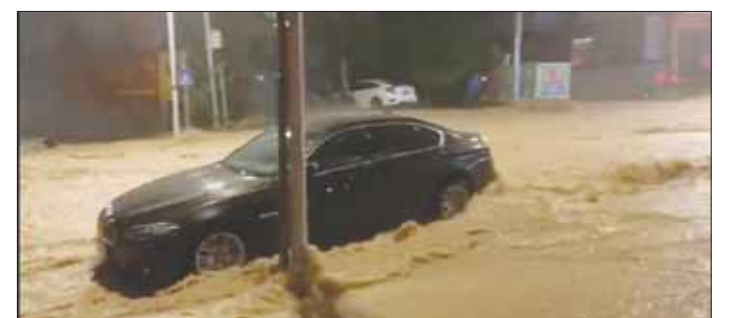
A view shows flooding on the street, following heavy rainfall in Yongtai, Fujian Province, China, in this screen grab from a video released yesterday.

Last month, northern and northeastern China saw heavy flooding caused by Typhoons Doksuri and Khanun which brought the capital Beijing its heaviest recorded rainfall in 140 years.