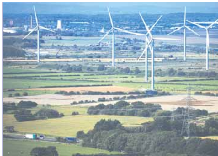
A general view of the Frodsham on shore wind farm in Frodsham.

Under the new regulations, communities can apply to their authority to have onshore wind turbines built which are not part of the so-called development plans. Elected councillors will still take the final decision, but