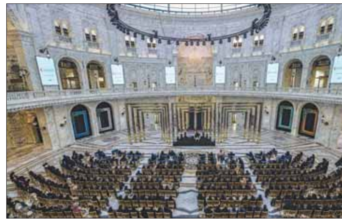
A view of the participants at the event.