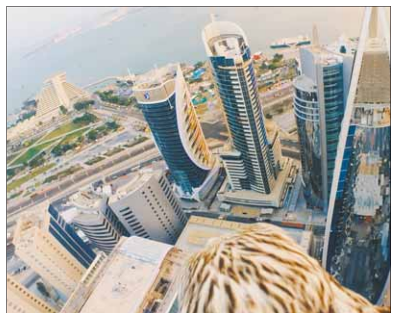
As the falcon effortlessly glides across the skies, viewers are transported through the breathtaking landscapes of Qatar.

Q atar Tourism (QT) has released, "Qatar: Through the Eyes of a Falcon," an innovative production that presents a thrilling perspective of Qatar's beautiful terrains, as seen from the viewpoint of the national bird, the falcon. A first-of-its-kind in Qatar, viewers will see sweeping views of Qatar's diverse landscapes as they