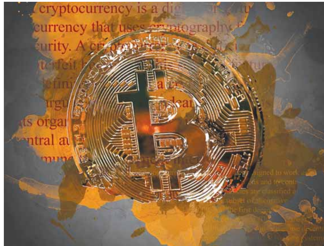
Drug cartels and crime gangs in Latin America have taken up virtual currencies to launder money, receive payments and sell drugs on the darknet because law enforcement authorities are finding it harder to detect the deals.

“It requires really sophisticated computer software programs, and some of the law enforcement agencies don’t really have the in-house expertise that they would need,” she said. — Thomson Reuters Foundation