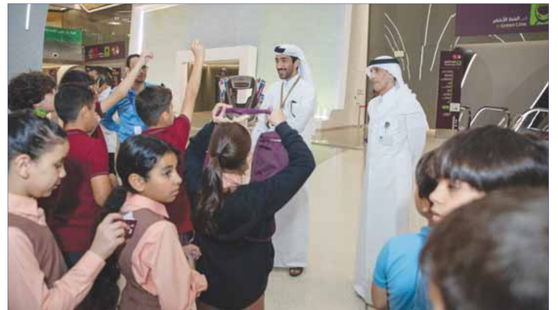
The school visits initiative, which is part of Qatar Rail's corporate social responsibility programme, provides an immersive experience to students and offers an insider's view into the Doha Metro network.

During their tour at Msheireb Station, the heart of the Doha