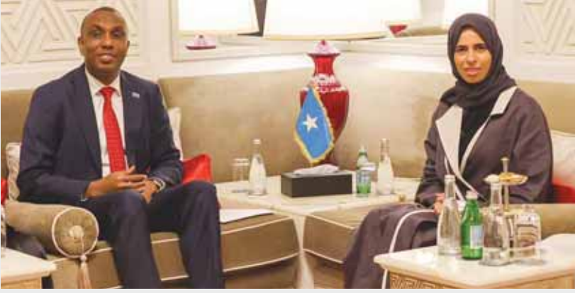
Somali Prime Minister Hamza Abdi Barre met yesterday with HE the Minister of State for International Co-operation at the Ministry of Foreign Affairs Lolwah bint Rashid AlKhater at his residence in Doha. The meeting discussed bilateral relations and Qatar's support for development projects in Somalia. (QNA)