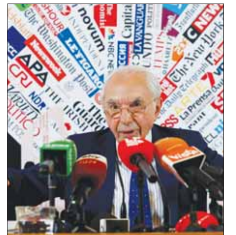
Former Italian prime minister Giuliano Amato gestures during a press conference about the 1980 downing of a passenger plane near the island of Ustica, in Rome yesterday.

He said it would be easier for Macron to respond as he was aged only two at the time of the tragedy and belongs to a different gen-