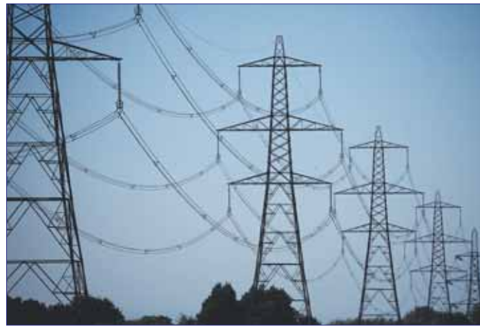
A row of electricity pylons is seen near the Frodsham on shore wind farm in Frodsham, Britain.

Britain has become a global leader in offshore wind energy in recent years but increasingly