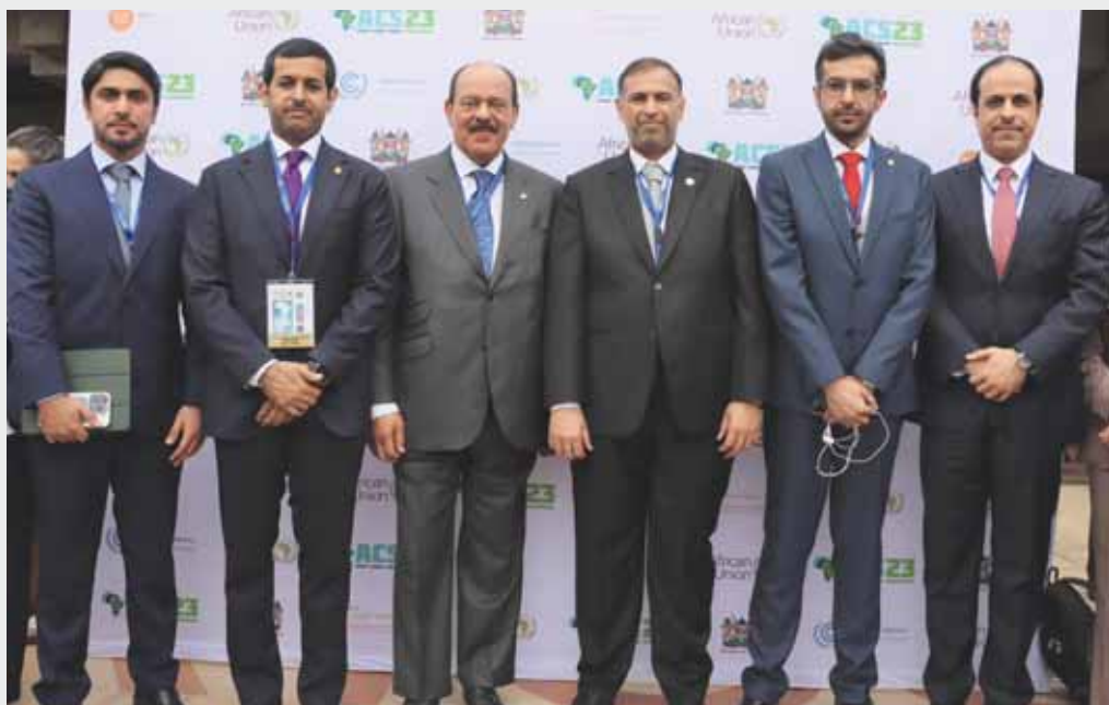
Qatar participated in the Africa Climate Summit (ACS23) in Nairobi, Kenya. HE the Minister of Environment and Climate Change Sheikh Dr Faleh bin Nasser bin Ahmed bin Ali al-Thani chaired Qatar's delegation to the three-day summit, with the participation of Special Envoy of the Minister of Foreign Affairs for Climate Change and Sustainability ambassador Badr bin Omar al-Dafa. (QNA)