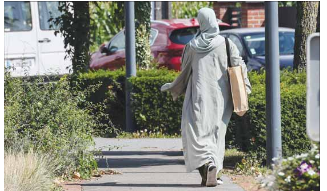
A woman wearing an abaya dress walks through the streets of Lille, northern France. The French government’s decision to ban schoolgirls wearing abayas has opened a fresh debate about the country’s secular laws and the treatment of Muslim minorities.

Uniforms have not been obligatory in French schools since 1968 but have regularly come back on the political agenda, often pushed