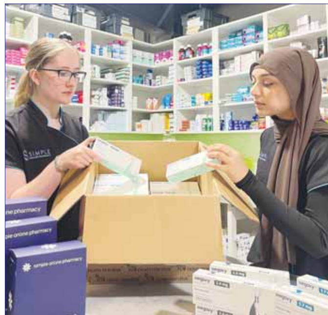
Simple Online Pharmacy weight care providers unpack Wegovy stock, at the Simple Online Pharmacy Headquarters, in Glasgow, Britain.

Some doctors and medical experts warned on Monday that people in Britain who can afford to pay out of their own pocket may get easier access to Wegovy than those seeking treatment in the country's state-run health service.