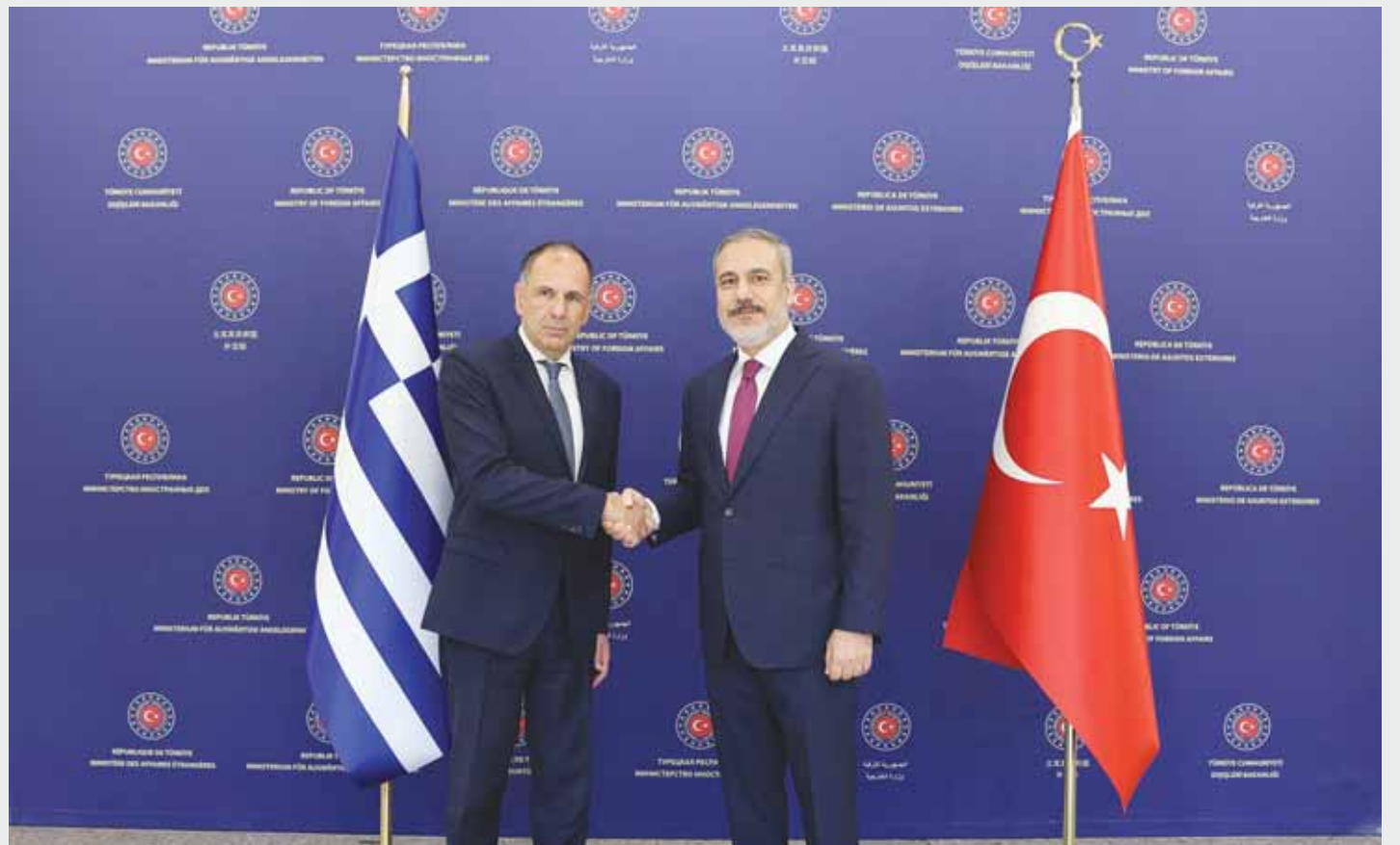
Turkiye's Foreign Minister Hakan Fidan (right) shaking hands with Greece Foreign minister Giorgos Gerapetritis during a meeting in Ankara.