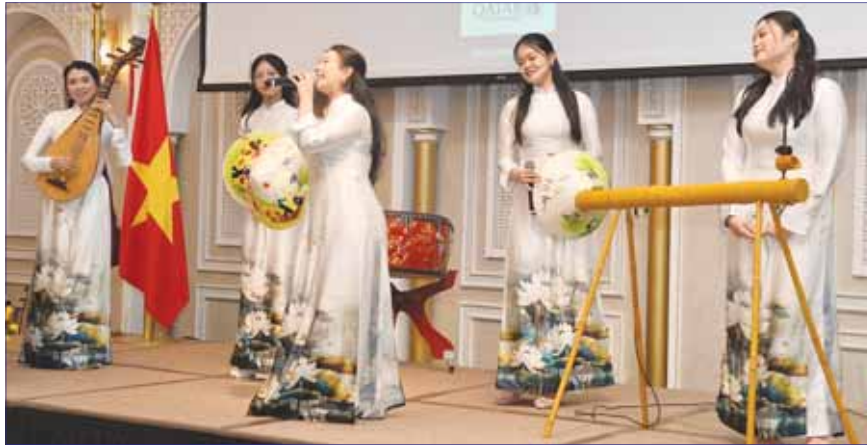
Vietnamese artists perform on the occasion.

The Vietnam envoy said: "As a friend and partner of Qatar, Vietnam is pleased to witness comprehensive local and global development of Qatar over the recent years. Qatar is considered an