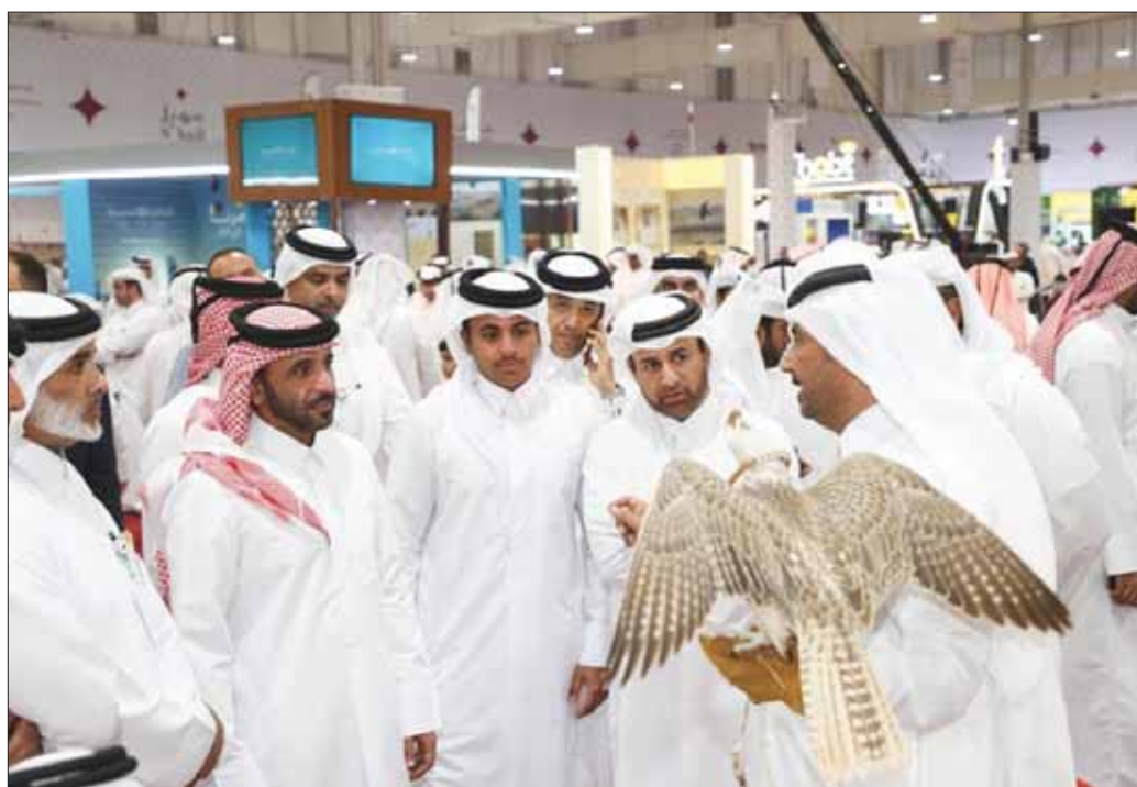
Amidst an impressive turnout of visitors, the seventh edition of the Katara International Hunting and Falconry Exhibition, S'hail 2023, kicked off at Katara - the Cultural Village yesterday (Tuesday). The event that concludes on Saturday, has the participation of 190 major companies from 17 countries. The exhibitors are specialists in hunting firearms, falconry equipment, camping supplies, and off-road vehicles tailored for land and hunting expeditions. Page 3