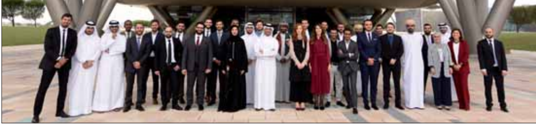
Stars of Science alumni.