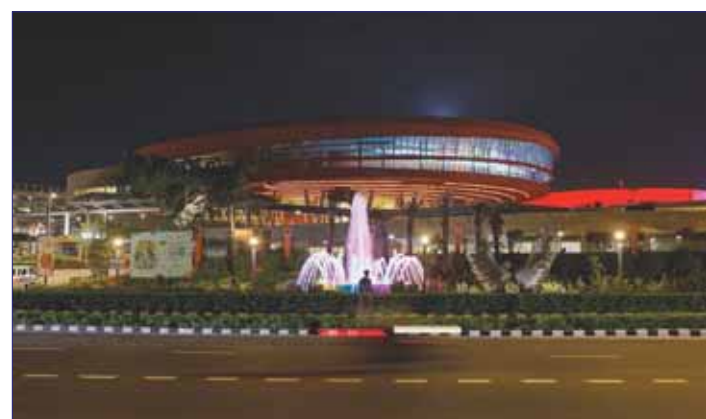
A security personnel stands guard in front of 'Bharat Mandapam', the main venue of the G20 Summit in New Delhi, India.