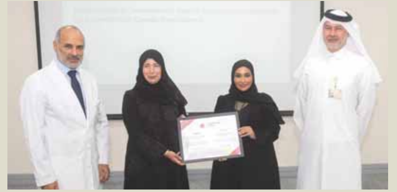
HE the Minister of Public Health Dr Hanan Mohamed al-Kuwari holds the citation along with other HMC officials.