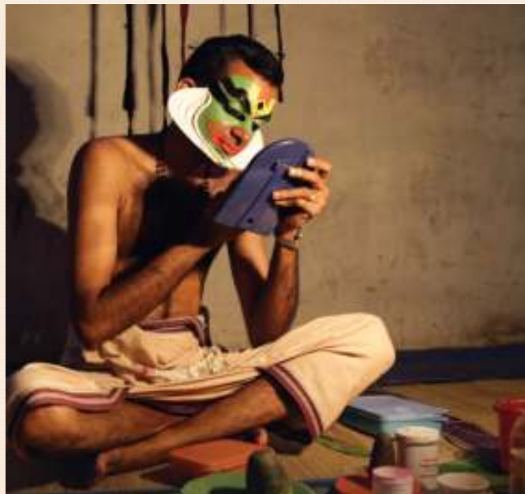
The process of applying make-up for Kathakali is intricate, requiring several hours to complete.

The artists communicate the tale using a rich language of hand gestures, facial expressions, and graceful movements. Kathakali is a timeless treasure that continues to enchant and captivate the hearts of all who witness its grandeur in the magical realm of Kerala.