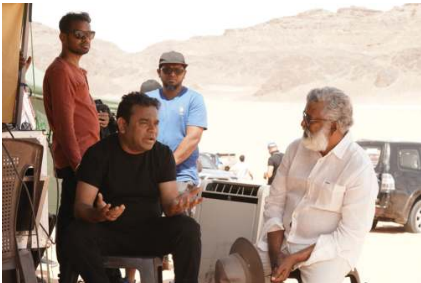
AR Rahman's presence graced the filming location in Jordan for a span of two days, a resounding testament to his unyielding commitment and authentic passion for his artistry.

With the remarkable commitment of Prithviraj, the technical team, and the entire crew, we overcame these hurdles and brought our vision to life. Each team member shared a common objective: reaching the pinnacle of our artistic ambition, regardless of the sacrifices involved. In the end, our persistence paid off, and the fruits of our labour shone through brilliantly.