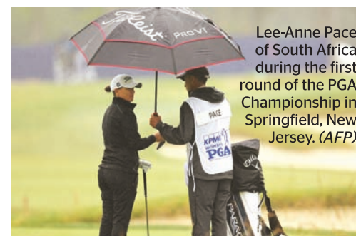
Lee-Anne Pace of South Africa during the first round of the PGA Championship in Springfield, New Jersey.

S outh African veteran Lee-Anne Pace fired four of her five birdies on the back nine at Baltusrol on Thursday to grab a one-shot lead in the Women's PGA Championship. Pace's strong finish on the demanding layout in Springfield, New Jersey, put her one in front of Chinese duo Lin Xiyu and Yin Ruoning and Canadian Brooke Henderson, who shared second place a stroke ahead of Thailand's Wichanee Meechai. "I played very well today," said the 42-year-old Pace, who claimed her lone LPGA tour title in 2014. "Obviously I'm very happy. No bogeys, which is awesome. Puttered really well, very happy with the round," added Pace, whose best finish in a major was a tie for sixth in the Evian Championship in 2015. Pace was concentrating this season on the Ladies European Tour - where she's an 11-time winner - before heading stateside for the ShopRite Classic earlier this month. She took a conservative approach and it paid off on a course where only 16 players broke par. "We kept it pretty simple," she said. "Most of the greens we went for the middle, didn't really attack too many pins. The putter worked, which was awe-