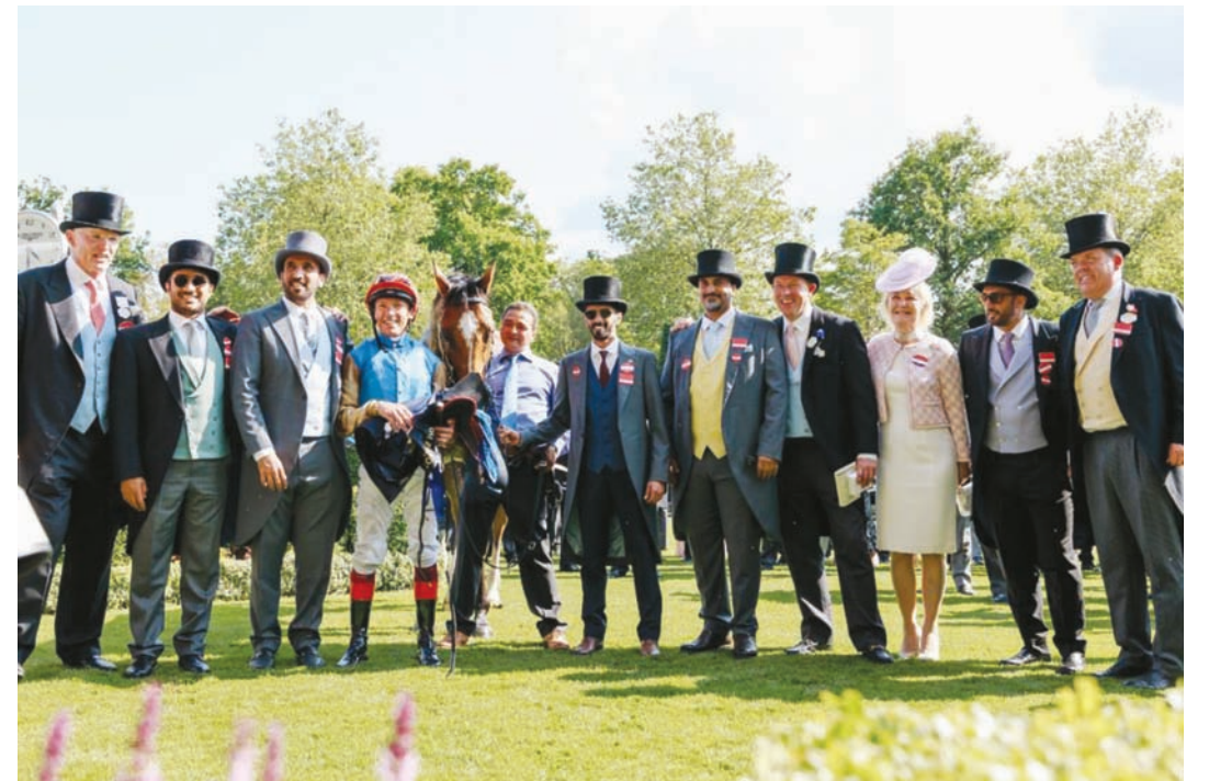
Wathnan Racing representatives and jockey Frankie Dettori celebrate with Britain's King Charles and Queen Camilla after Courage Mon Ami won the Ascot Gold Cup in the United Kingdom.

By Sports Reporter Ascot, United Kingdom