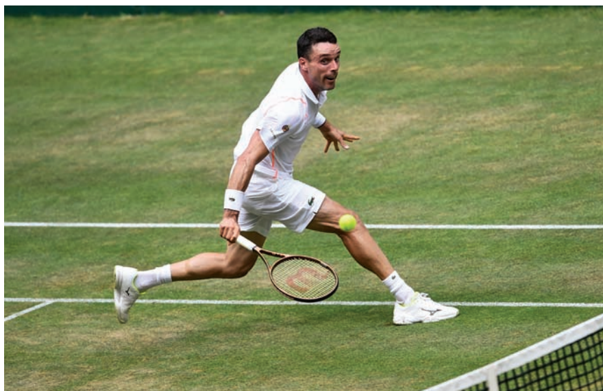
Spain's Roberto Bautista Agut returns the ball to Russia's Daniil Medvedev (not pictured) during the singles quarter-final of the ATP 500 Halle Open.