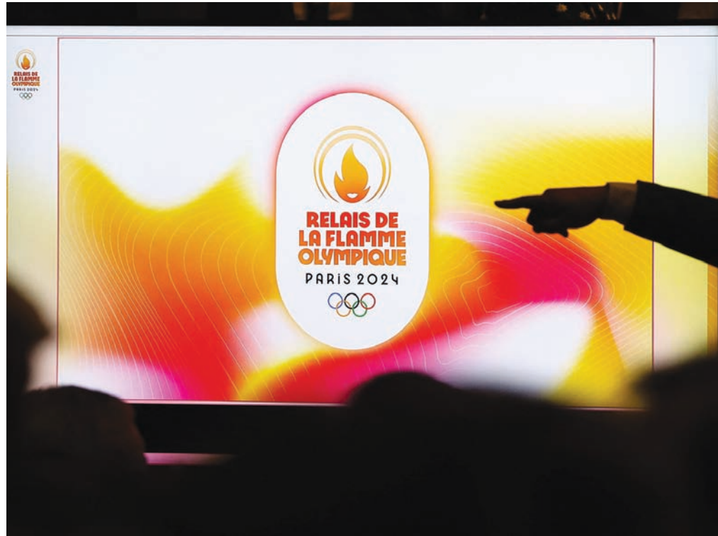
A view of branding at the 2024 Olympic Games torch relay ceremony in Paris yesterday.

most notably during the run-up to Beijing 2008 as demonstrators took China to task over its Tibet policy. Protests started as soon as the flame was lit in ancient Olympia and dogged the relay throughout its journey to China, notably as it passed through London, Paris and San Francisco. In Japan, monks at an ancient Buddhist temple pulled out of hosting a torch ceremony because of the Chinese crackdown in Tibet. No cheering, please: Overseas fans were barred from Tokyo 2020 to limit