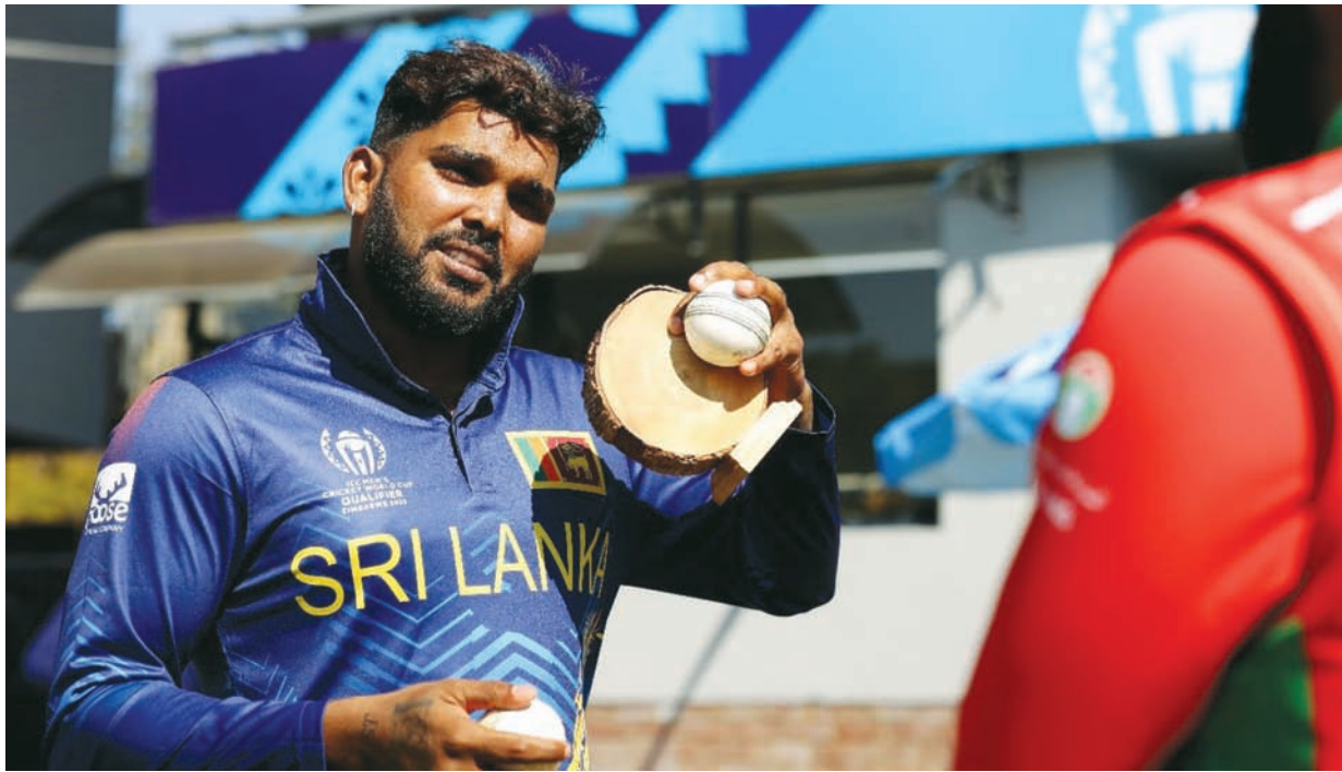
Sri Lanka's Wanindu Hasaranga celebrates after getting the Man of the Match award following his five-wicket haul against Oman in Harare, Zimbabwe, yesterday.

"He's a champion. Whenever I throw him the ball, he delivers for me," Sri Lanka skipper Dasun Shanaka said of Hasaranga. "Very good to see him keep