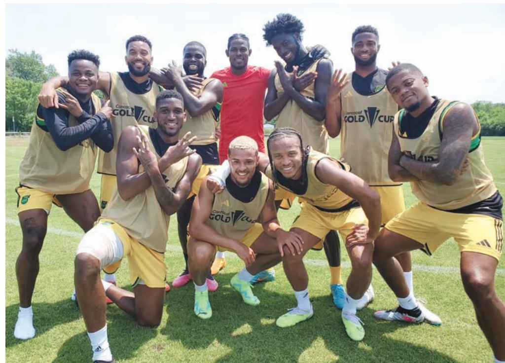
Jamaican players pose during a training session yesterday, ahead of their CONCACAF Gold Cup match in Chicago on Saturday.

Jamaica has a solid record in the Gold Cup but has struggled