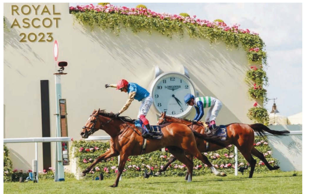
Jockey Frankie Dettori (left) rides Courage Mon Ami to victory over jockey Oisin Murphy on Coltrane in Ascot Gold Cup.