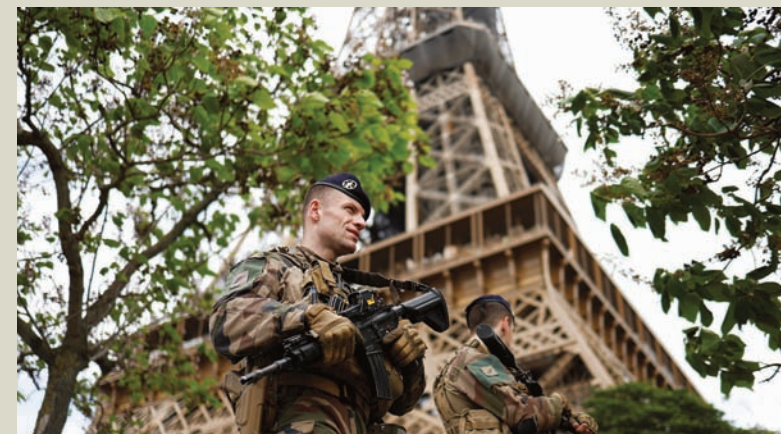
French soldiers patrol near the Eiffel Tower as part of the "Sentinelle" security plan in Paris, France, yesterday.

Paris: Hundreds of thousands of people will be able to watch the opening ceremony of the Paris Olympics for free, organisers stressed yesterday amid ongoing criticism about the price of tickets for next year's event. The final figure for the number of people who will be granted tickets for the vast and ambitious outdoor opening ceremony along the river Seine is still under discussion. "Hundreds of thousands," Interior Minister Gerald Darmanin told a press conference when asked about the number of people yesterday. "It will depend on the weather and the publicity you do for it." Around 100,000 tickets will be sold for exclusive river-side positions, with organisers initially saying another