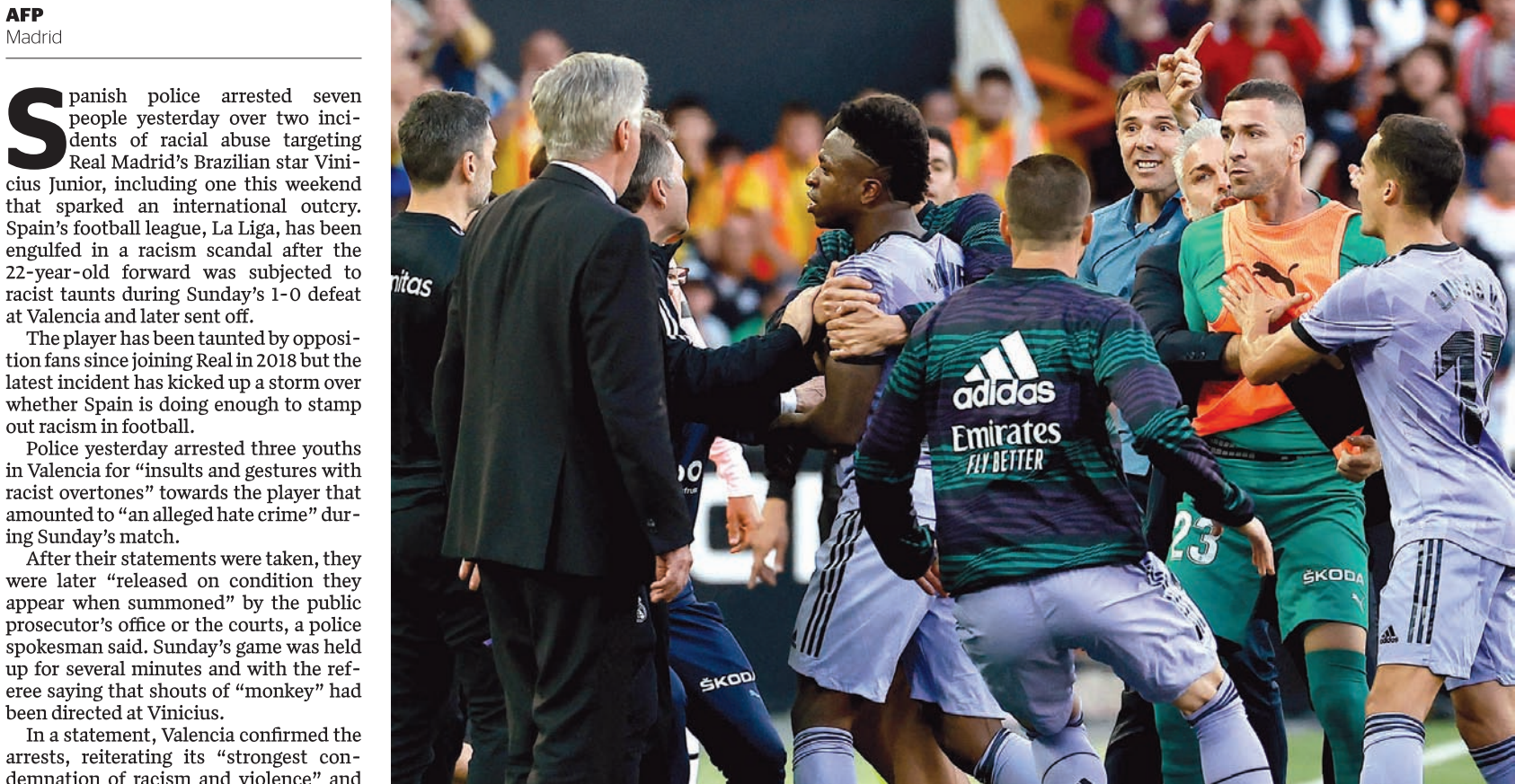
Real Madrid's Brazilian forward Vinicius Junior (centre) confronts Valencia's officials as he leaves after being sent off the pitch by the referee during the La Liga match at the Mestalla stadium in Valencia on Sunday.

Forward was subjected to racist taunts during Sunday's 1-0 defeat at Valencia