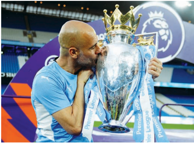
Pep Guardiola has led Manchester City to five league titles in six years.

Midfielder Kevin De Bruyne, who like Gundogan is now a five-time Premier League winner, is confident City can do something "special" at the end of their latest triumphant campaign. "We like to win, and we're never bored of it. We've won a lot in the past but we want to win again and again," De Bruyne said. "We keep on working. We enjoy the games against Brighton and Brentford and prepare for United and Inter and hopefully we can do something special. Everybody wants it. We know we need to win two games, but they are hard games, and we need to prepare ourselves the best as possible and hopefully we can win them."