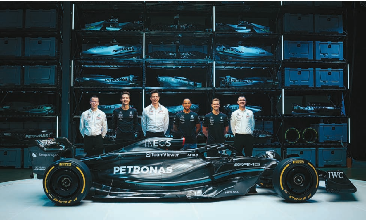
Lewis Hamilton (third right) is seen with his Mercedes boss Toto Wolff (third left) in this team photo released before the start of the 2023 Formula One season.

patience at times wearing thin, has also been linked to Mercedes. Asked in April whether he had any conversations with the former champions, Leclerc replied: "Not yet, not for the moment." A move for Hamilton would be a timely reminder from Ferrari that they are not sitting still, although Sainz would not be impressed. Hamilton needs a winning car to challenge for a record eighth title and the coming races will be crucial in helping him assess whether Mercedes can pro-