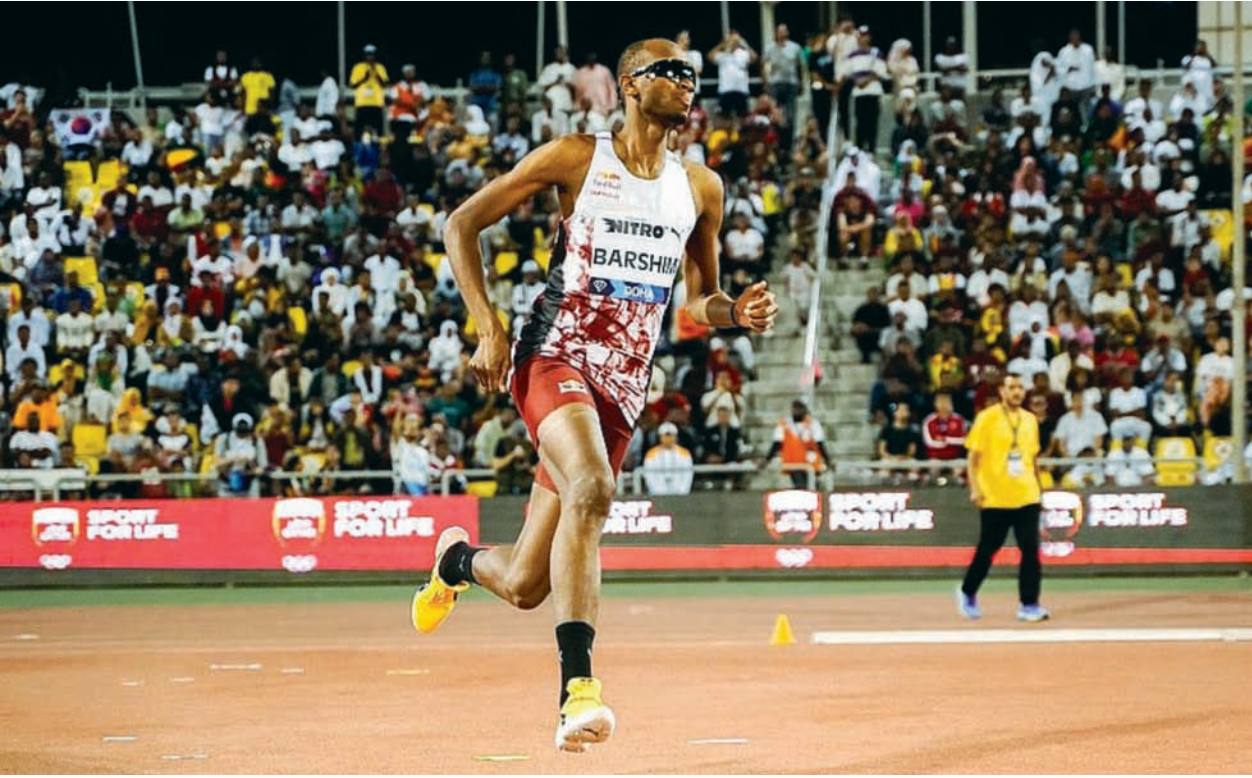
Qatar’s Mutaz Barshim finished a disappointing third at the season opener in Doha.

since I have thrown there, so it will be great to have this competition just a few weeks before the World Athletics Championships. “The Diamond League events always bring a strong competition, so I look forward to being part of a great show with my fellow shot putters. I look forward to seeing all the UK fans in July.” Sawyers won the first continental title of her career in Istanbul earlier this year, setting a new British record in the process. She will return to a hero’s welcome at