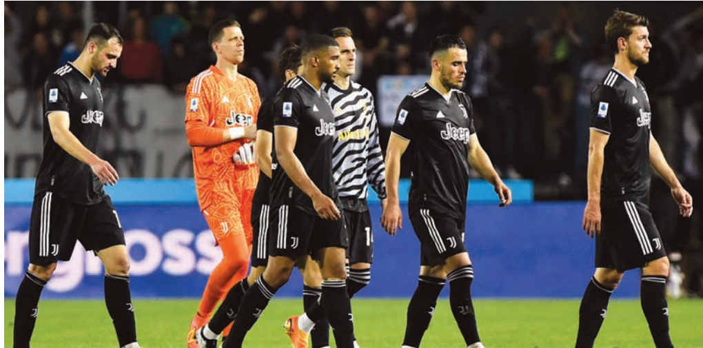
Juventus' players look dejected after their loss to Empoli on Monday.