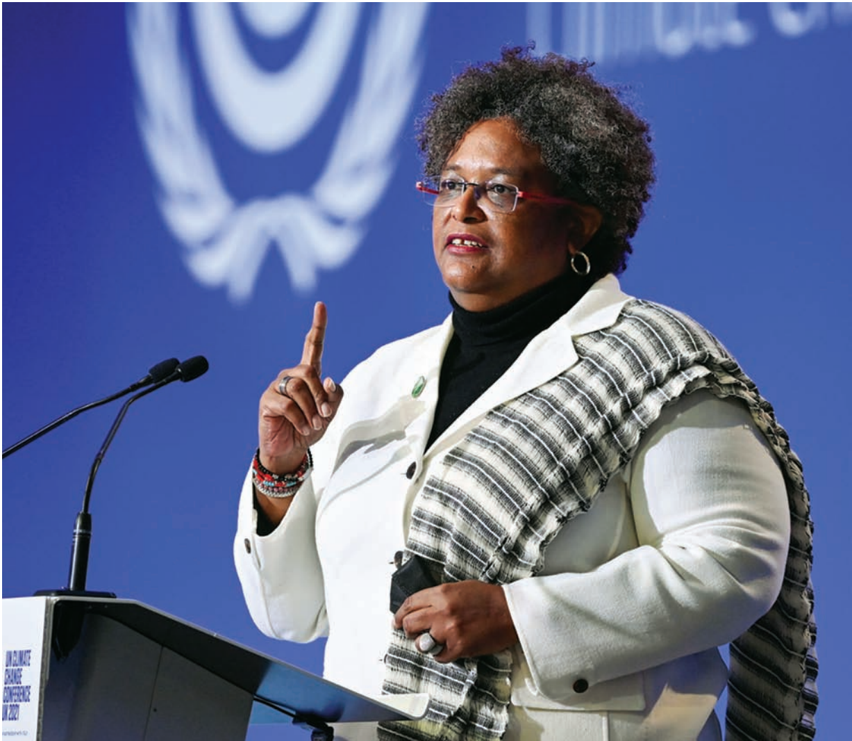
BRIDGETOWN INITIATIVE: Led by Barbadian Prime Minister Mia Mottley, the plan envisions a new issuance of SDR500bn ($650bn) “or other low-interest, long-term instruments” to support the creation of a multilateral agency that would accelerate “private investment in the low-carbon transition, wherever it is most effective.”