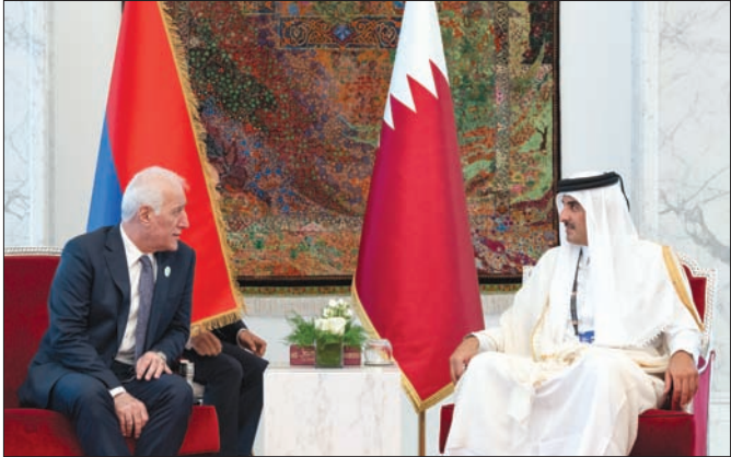
His Highness the Amir Sheikh Tamim bin Hamad al-Thani meets with visiting dignitaries at the opening of Qatar Economic Forum 2023 yesterday.

Also, on the sidelines of QEF, His Highness the Amir met with the founder of Bloomberg LP and Bloomberg Philanth