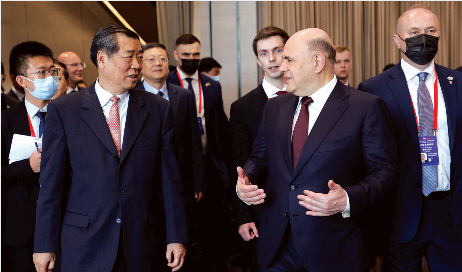
Russian Prime Minister Mikhail Mishustin speaks with China's Vice Premier He Lifeng during a Russian-Chinese Business Forum in Shanghai yesterday. China's Premier Li Qiang said the country is willing to further expand economic and trade exchanges with Russia. Li made the comments in a congratulatory letter to the China-Russia Business Forum, which is being held in Shanghai.