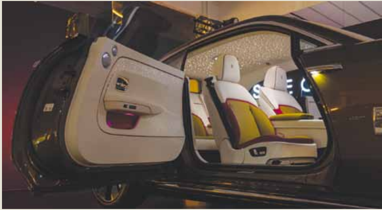
Engulfed in supple and inviting leather, the interior draws inspiration from the timeless mystique of the night sky.

into Spectre, enabling ideal battery placement within the floor plan. The mechanical setup has been honed over countless hours of specialised testing and ensures a truly optimal ride quality. Coupled with the planar suspension, Spectre delivers Rolls-Royce's hallmark 'Magic Carpet Ride' - an unparalleled driving experience that leaves you spellbound. Intuitive, perceptive, and sharp, Spectre is the most connected Rolls-Royce the marque has ever conceived. With 141,200 end-receiver functions, 7km of cabling, and over 25,000 sub-functions, Spectre is able to process complex data and exchange information with unparalleled ease.