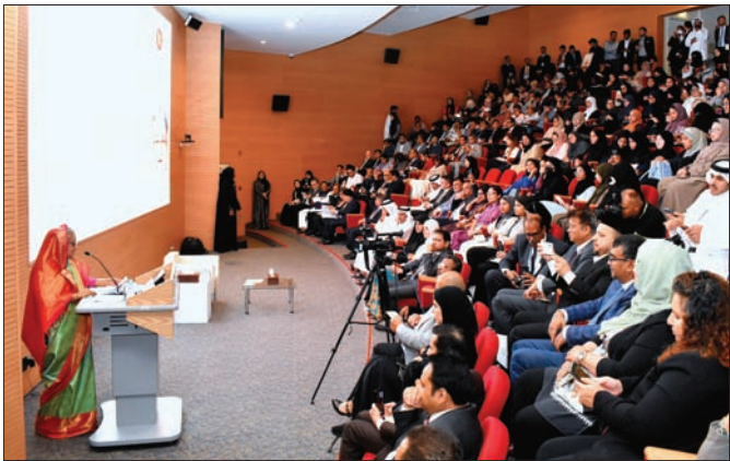
Bangladesh PM Sheikh Hasina addressing the seminar yesterday.

Sheikh Hasina noted that after years of efforts, Bangladesh now