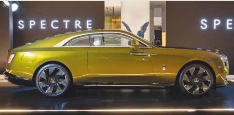
Spectre has been conceived within the philosophy which infuses the marque, embodying the famous words of co-founder Sir Henry Royce: "Strive for perfection in everything you do."

allowing clients to interact with their car remotely, and receive live information curated by the marque's luxury intelligence specialists. The proportional demands of Spectre's scale required Rolls-Royce to embolden its wheel strategy. Spectre is the first production two-door coupé to be equipped with 23-inch wheels in almost one hundred years. Built on Rolls-Royce's Architecture of Luxury, which was conceived from the very start with electric drive in mind, Spectre is the most powerful and most aerodynamic Rolls-Royce ever created, with every line of its body sculpted for ultimate grace and performance. The Architecture of Luxury has been perfectly tailored to integrate Rolls-Royce's electric powertrain