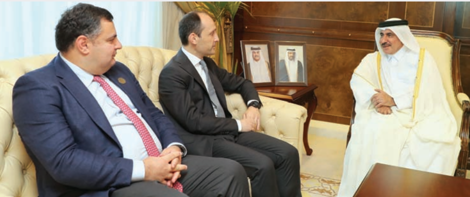
HE the Minister of Transport Jassim bin Saif al-Sulaiti met yesterday with Deputy Prime Minister and Minister of Economy and Sustainable Development of Georgia Levan Davitashvili. The meeting discussed bilateral relations in transportation and ways to enhance and develop economic partnership. (QNA)