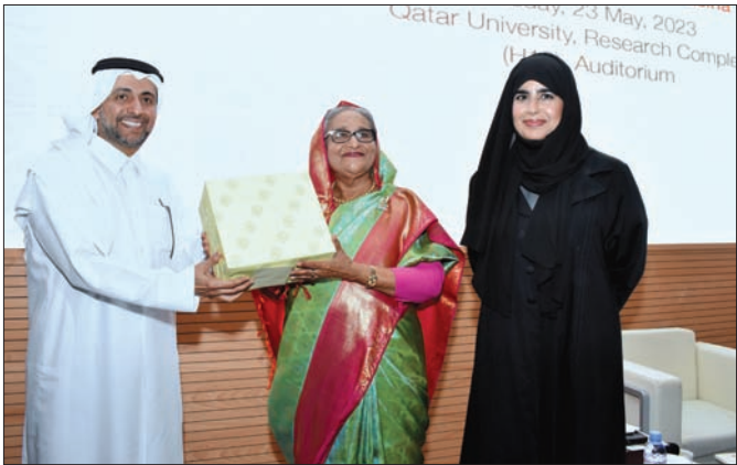
Bangladesh PM Sheikh Hasina being honoured on the occasion.

Further, Sheikh Hasina said Bangladesh has made impressive gains in the areas of food security, free and affordable housing, community healthcare, compulsory primary education, women's empowerment, financial inclusion, digital services, access to