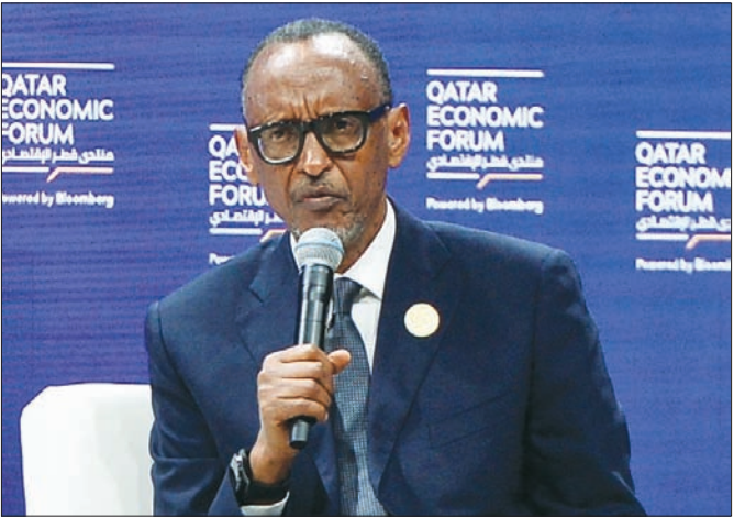
Paul Kagame at Qatar Economic Forum 2023 yesterday.

"We need to be rethinking but also need to finding ways to doing better than we have done in the past. By making progress on the economic front, the basic thing is the needs of people and that is what we are looking at," he added.