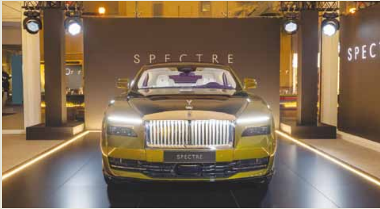
Spectre's uncompromising character is articulated through lines of sculptural purity.