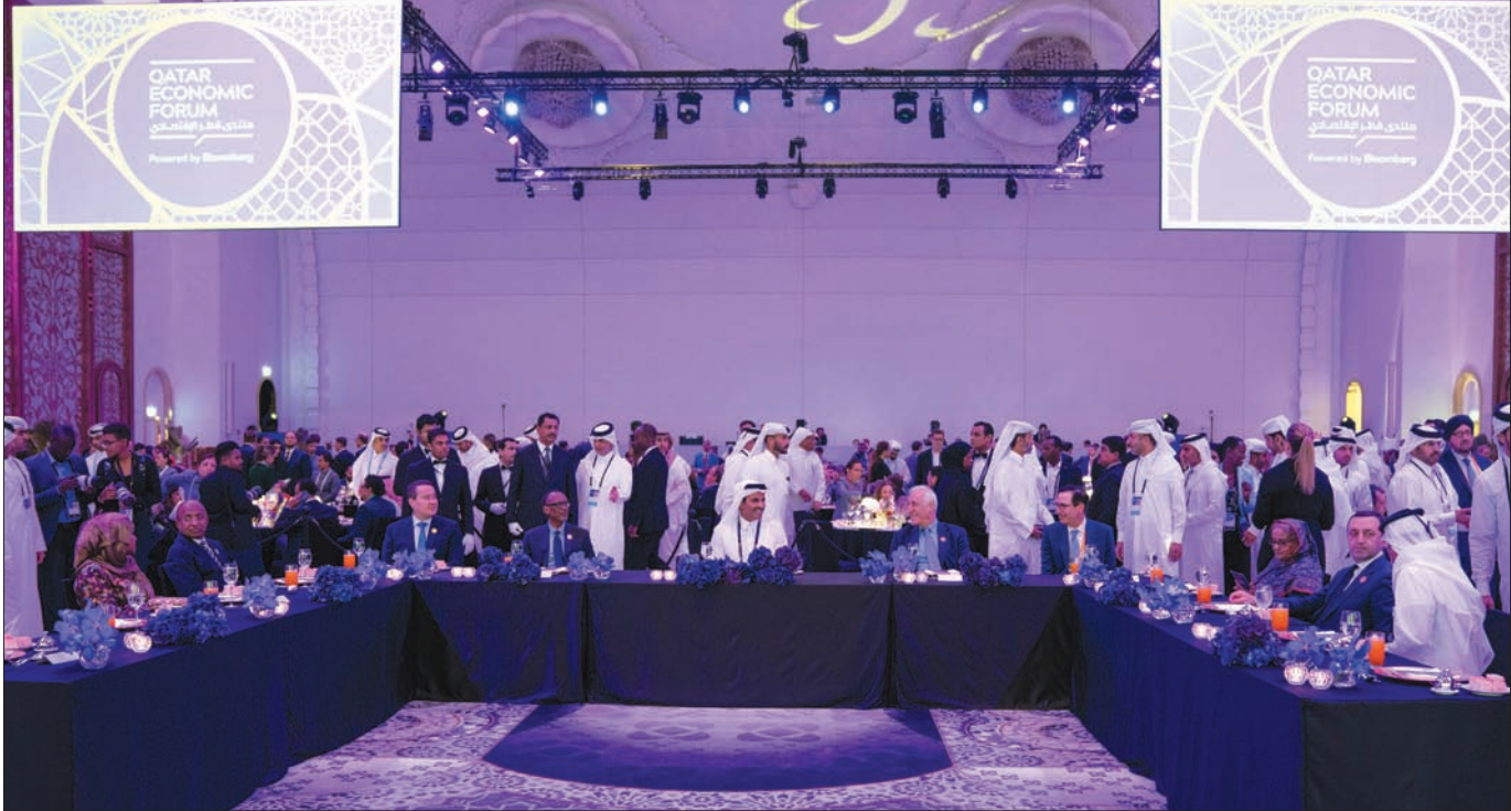
His Highness the Amir Sheikh Tamim bin Hamad al-Thani attended the reception ceremony held on the occasion of Qatar Economic Forum 2023 yesterday evening.