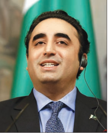
UNHAPPY: Bilawal Bhutto