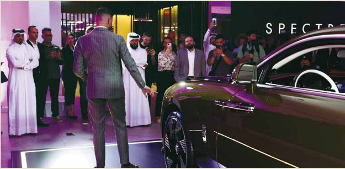
Spectre making its debut at Rolls-Royce Motor Cars Doha.

acknowledges its forebear, the Phantom Coupé, with its generous proportions and split headlight treatment - a contemporary Rolls-Royce design tenet. Spectre's uncompromising character is articulated through lines of sculptural purity. Its straightened form is exciting in every sense, the fender line evokes dynamism, while the waft line sharply tapers at the front creating the illusion of motion even when the car is still. Stepping into Spectre also evokes feelings of wonder. Engulfed in supple and inviting leather, the interior draws inspiration from the timeless mystique of the night sky. With an intricate show of shooting stars, the Starlight Headliner is spellbinding whilst the Illuminated Fascia mesmerises with over 5,500