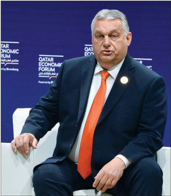
Hungarian Prime Minister Viktor Orban at Qatar Economic Forum 2023 yesterday.

Orban explained that the agreement in natural gas will enhance the energy security of his country and lead to enhanced economic growth and co-operation between both countries. He commended the bilateral relations between Doha and Budapest over the past years, pointing out that Qatar helped Europe with the issue of exports and imports of gas and oil, as well as other arrangements related to information systems and security issues.