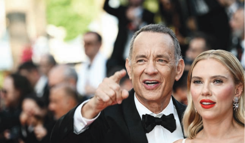
US actor Tom Hanks (left) and US actress Scarlett Johansson arrive for the screening of the film Asteroid City during the 76th edition of the Cannes Film Festival in Cannes yesterday.

A literal bus-load of Hollywood A-listers arrived in Cannes yesterday, including Scarlett Johansson and Tom Hanks, for the premiere of Wes Anderson’s strange blend of sci-fi and 1950s Westerns, Asteroid City . The typically quirky movie is set in a remote desert town where a group of child geniuses gather for a science competition that is interrupted by an alien visitor. It required a full-sized coach to bring the star-packed cast to the red carpet at the Cannes Film Festival, including Hanks, Johansson, Steve Carell and Adrien Brody – to name just a few. The Cannes Film Festival has had a relentless stream of Hollywood A-listers since kicking off last week, including world premieres for the new Indiana Jones and Martin Scorsese’s Killers of the Flower Moon with Leonardo DiCaprio. There was a dose of scandal with a sneak peek at The Idol , the new HBO show starring Lily-Rose Depp and Abel Tesfaye. Due for release in June, it gives a nod to Britney Spears and toxic fame that