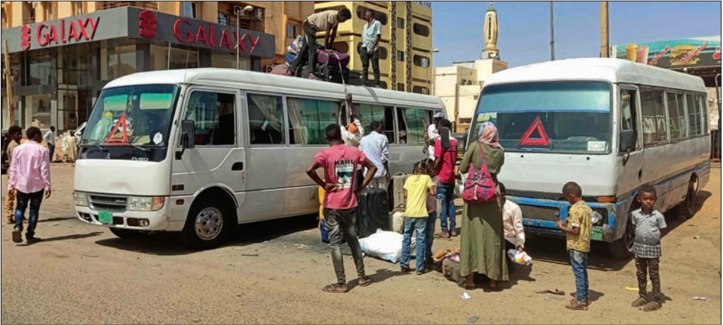
People board a bus as they evacuate southern Khartoum, yesterday after a one-week ceasefire officially went into force.

manitarian worker told AFP on condition of anonymity, due to safety concerns.