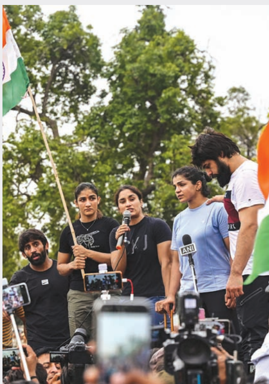
Indian wrestlers take part in a candlelight vigil to protest against the sport's local federation chief over allegations of sexual harassment and intimidation, in New Delhi, India, yesterday.