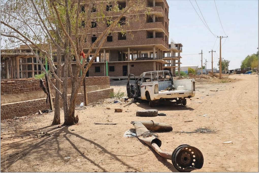
A damaged and looted pick-up truck remains on the roadside in Khartoum, yesterday, after a one-week ceasefire between Sudan’s army and paramilitary Rapid Support Forces officially went into force.

The text of the truce deal says warring parties agreed to secure “unimpeded road access along designated corridors or routes for humanitarian assistance delivery.” Aid workers are waiting impatiently for those promised corridors to materialise. No permits had been authorised as yesterday, one international hu-