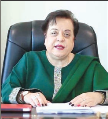
STRESSED OUT: Shireen Mazari

A high-ranking spokeswoman for former Pakistan prime minister Imran Khan quit their party yesterday after days of repeated arrests and release that followed deadly protests over Khan’s detention. Khan was detained two weeks ago on graft charges, sparking days of street violence, before the Supreme Court declared his arrest illegal and freed him. Rights monitors have since accused Islamabad of a crackdown on the former international cricket star’s popular Pakistan Tehreek-e-Insaf (PTI) party as it campaigns for snap polls. PTI senior vice-president Shireen Mazari said she had been subjected to “12 days of arrest, release, abduction and release”. “I have decided that I am leaving active politics. From today onwards I am not a part of PTI or any political party,” she told reporters. “All I can say is that I am not feeling well,” she said, appearing dejected in a brief news conference where she cited health and family issues for her resignation. Mazari was among the most vocal critics of the military-backed establishment and its role in the downfall of Khan, who was ousted in a parliamentary no-confidence vote in April last year. PTI said Mazari