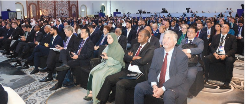
A view of the attendees during a session of the Qatar Economic Forum, Powered by Bloomberg yesterday.