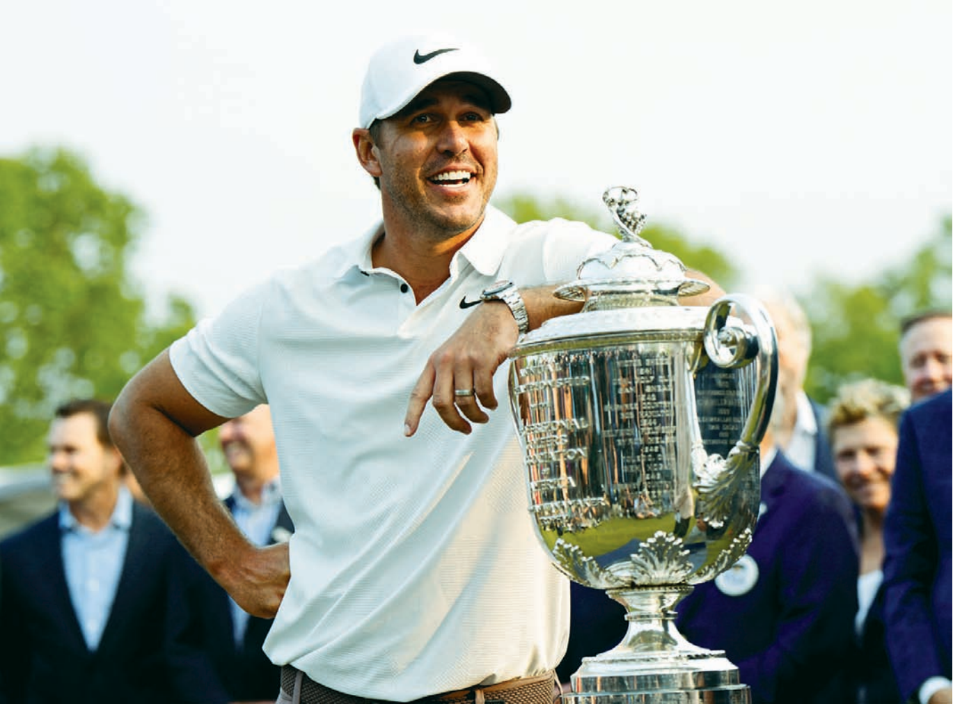
Brooks Koepka celebrates after winning the PGA Championship at Oak Hill Country Club.

Koepka was among the stars who jumped from the PGA Tour