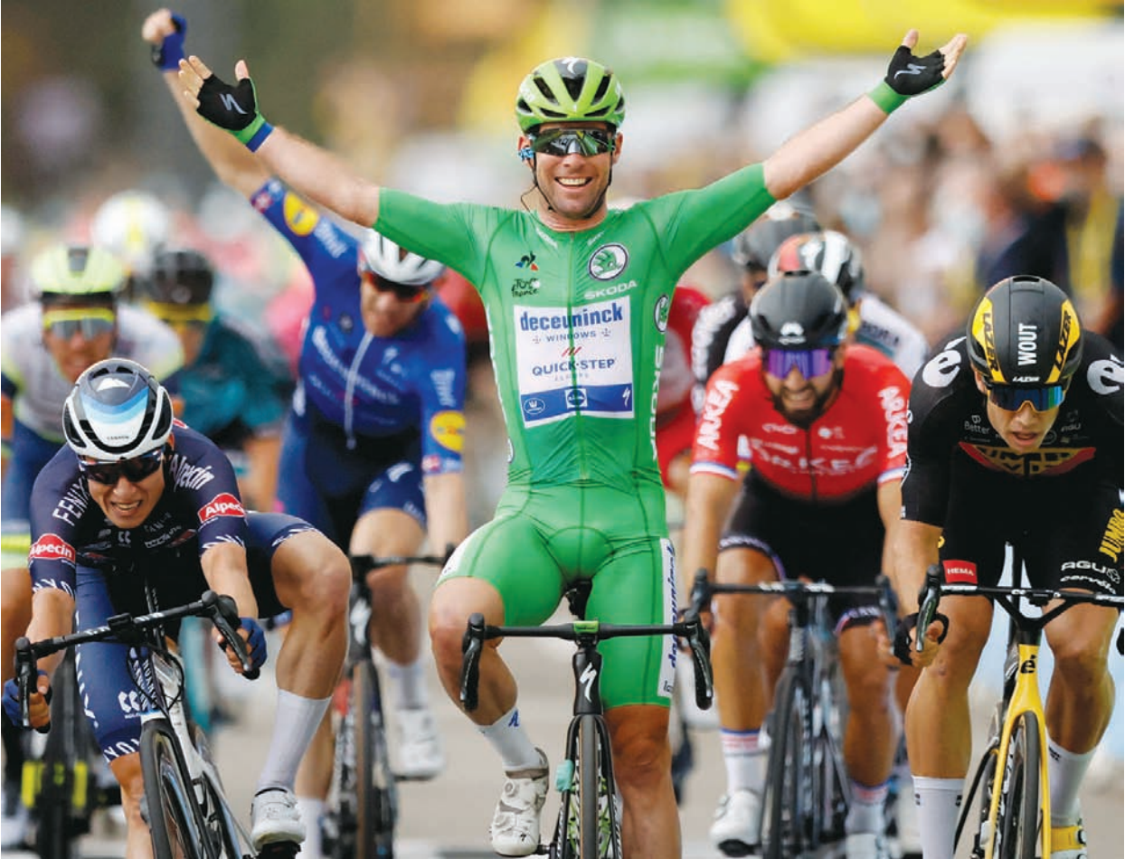
Deceuninck-Quick-Step rider Mark Cavendish of Britain celebrates as he crosses the finish line to win stage 10 of the Tour de France from Albertville to Valence on July 6, 2021.

Born in Douglas, on the Isle of Man, the former junior bank clerk joined a nas-