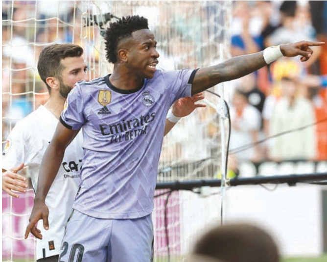
Real Madrid's forward Vinicius Junior pointing at the stands during the La Liga league match against Valencia CF at Mestalla Stadium in Valencia on Sunday.

The body has in similar incidents in the past proposed a one-year stadium ban and fine of 4,000 euros ($4,300) for those found guilty. Top figures from the world of football and beyond rallied around the player, who has frequently been singled out for racial abuse in La Liga. The head of Spain's football fed-