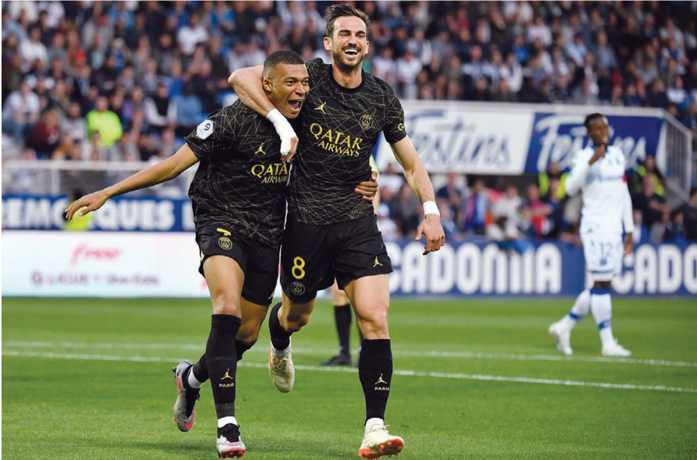
Paris Saint-Germain's forward Kylian Mbappe (left) celebrates after scoring his team's first goal with teammate Fabian Ruiz during the Ligue 1 match against AJ Auxerre in Auxerre, France.

“My players have their hands on the trophy. Now we need to finish on a high in the next two matches and lift the trophy at