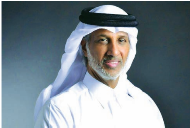
AGCFF president Sheikh Hamad bin Khalifa bin Ahmed al-Thani.