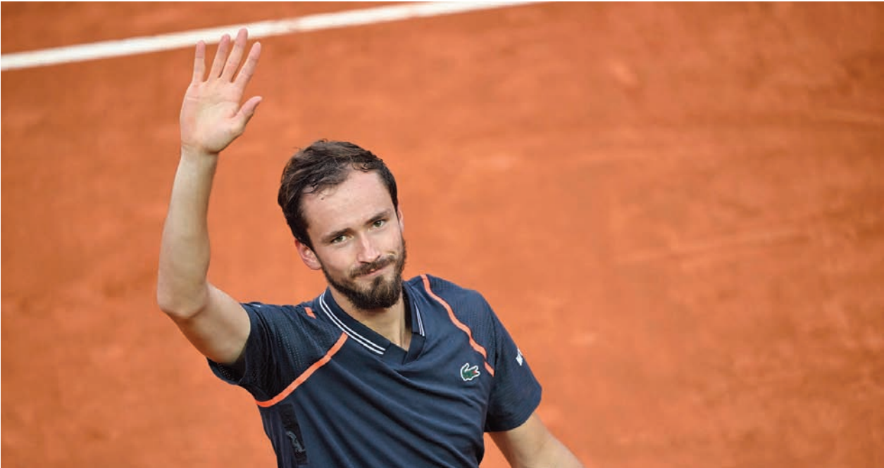
Russia’s Daniil Medvedev acknowledges the crowd after winning the final of the Italian Open against Denmark’s Holger Rune on Sunday. Medvedev beat Rune 7-5, 7-5.

“For sure every time you play a big final, it’s an experience,” said Medvedev. “It’s an experience for the next one. For example, both Miami and here, I felt like the start was so-so, then I managed to get into the match more and more and play better and better. “When I played my first