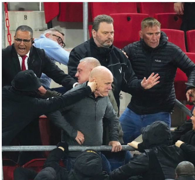
Supporters of AZ Alkmaar and West Ham United clash in the stands after the UEFA Conference League semi-final match.