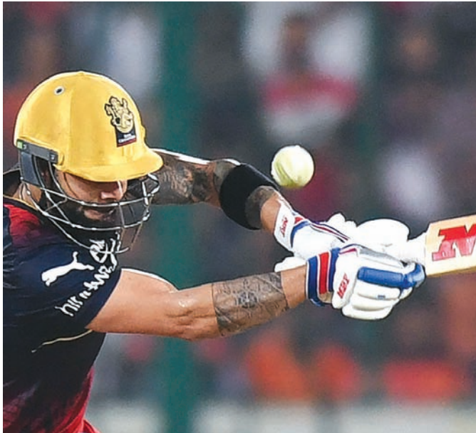
Royal Challengers Bangalore's Virat Kohli plays a shot during the IPL match against Sunrisers Hyderabad in Hyderabad on Thursday.