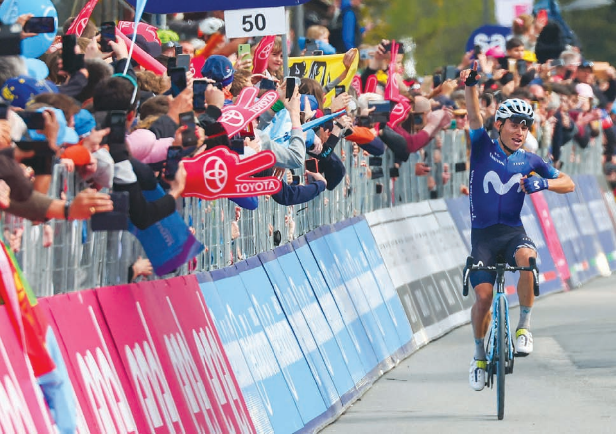
Movistar Team's Colombian rider Einer Rubio celebrates as he arrives to cross the finish line to win the 13th stage of the Giro d'Italia 2023 cycling race yesterday.

Riders made their scheduled departure under heavy rain at Borgofranco d'Ivrea but quickly re-boarded their team buses, before organisers re-routed the start of the stage to Le Chable, at the bottom of the brutal Croix de Couer climb.