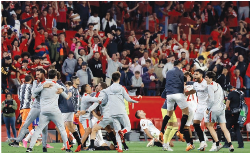
Sevilla players celebrate after their win over Juventus in the Europa League semi-final second leg at the Ramon Sanchez Pizjuan in Seville, Spain.

Defeat is concerning for Juventus, who are second in Serie A but braced for a potential points deduction which could knock them out of the top four. Winning the Europa