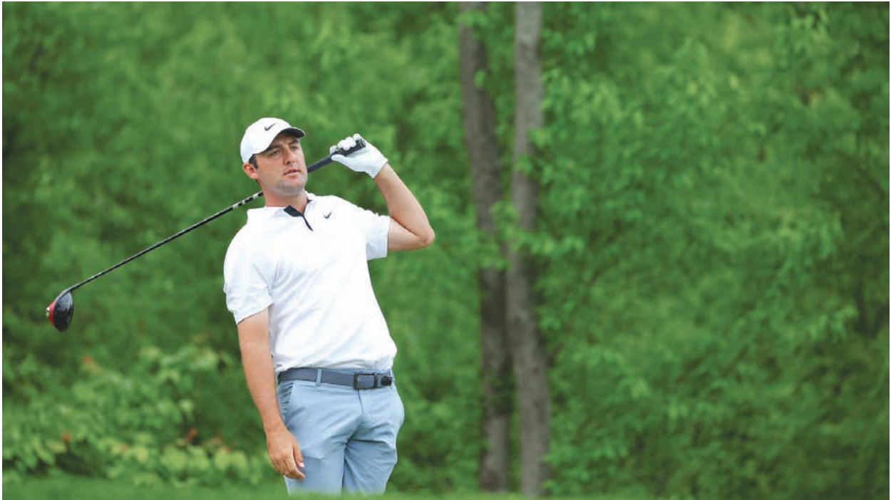
Scottie Scheffler of the US plays his shot from the fourth tee during the second round of the 2023 PGA Championship at Oak Hill Country Club in Rochester, New York, yesterday.

Rose, the 2013 US Open champion, sank a 15-foot birdie putt at the 10th, sank a 26-footer for birdie at the 12th and