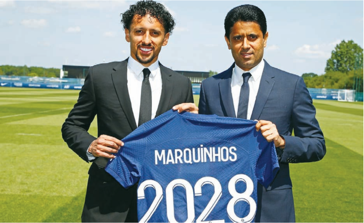
Marquinhos (left) poses with Paris Saint-Germain president Nasser al-Khelaifi and club jersey yesterday.

"Concerning Messi, Mbappe and Neymar, as soon as I took over it was an objective to be able to associate them together," Galtier said. "Unfortunately, with the World Cup, injuries and fatigue, we were not able to take advantage of them throughout the season. "Every time they were on the pitch, PSG were very good. We had a very interesting attacking game. But that's part of a season."