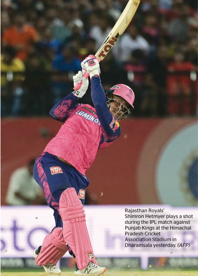
Rajasthan Royals' Shimron Hetmyer plays a shot during the IPL match against Punjab Kings at the Himachal Pradesh Cricket Association Stadium in Dharamsala yesterday.

Rajasthan Royals 189 for 6 (Padikkal 51, Jaiswal 50, Hetmyer 46, Rabada 2-40) beat Punjab Kings 187 for 5 (Curran 49*, Jitesh 44, Saini 3-40) by 4 wickets