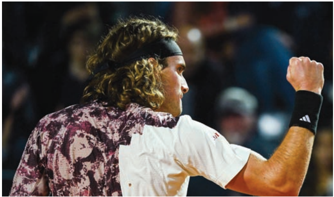
Greece's Stefanos Tsitsipas celebrates winning a point against Croatia's Borna Coric in their quarter-final at the Rome Open.

"I feel like he's playing better than the years before."