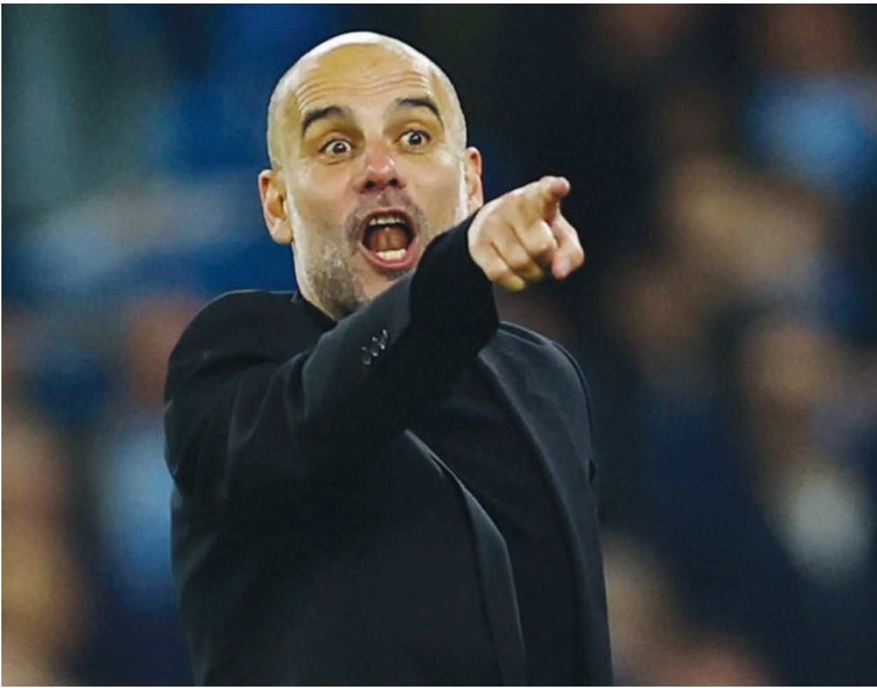
Pep Guardiola’s Manchester City can clinch the league without even kicking a ball if Arsenal lose at Nottingham Forest today and if not they can hoist the trophy by beating Chelsea tomorrow at the Etihad Stadium.

Guardiola was asked about a video that showed midfielder Kevin De Bruyne yelling “Shut up!” at him during Wednesday’s game. The manager walked back to City’s bench seemingly nonplussed after the exchange. “The action with Kevin I love it, we shout at each other. I like it. Sometimes it’s a little bit flat, I like this energy,” Guardiola said. “It’s not the first time, you don’t see, but he shouts at me in training. This is what we need. After that he becomes the best. (Ilkay Gun-