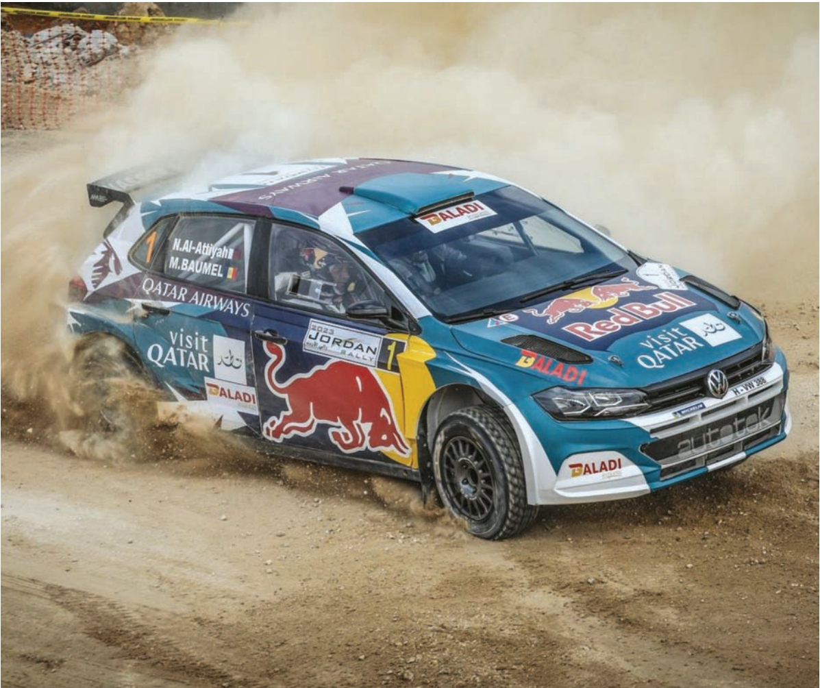
Nasser Saleh al-Attiyah and his co-driver Mathieu Baumel, who suffered a broken right-hand front driveshaft on the start line of the second pass, dropped 2min 39sec and finished the loop of three stages in two-wheel drive.