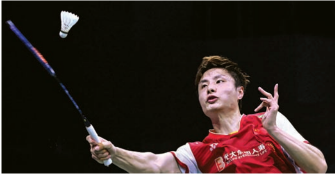
China's Shi Yuqi hits a return against Indonesia's Anthony Sinisuka Ginting during their 2023 Sudirman Cup quarter-final.