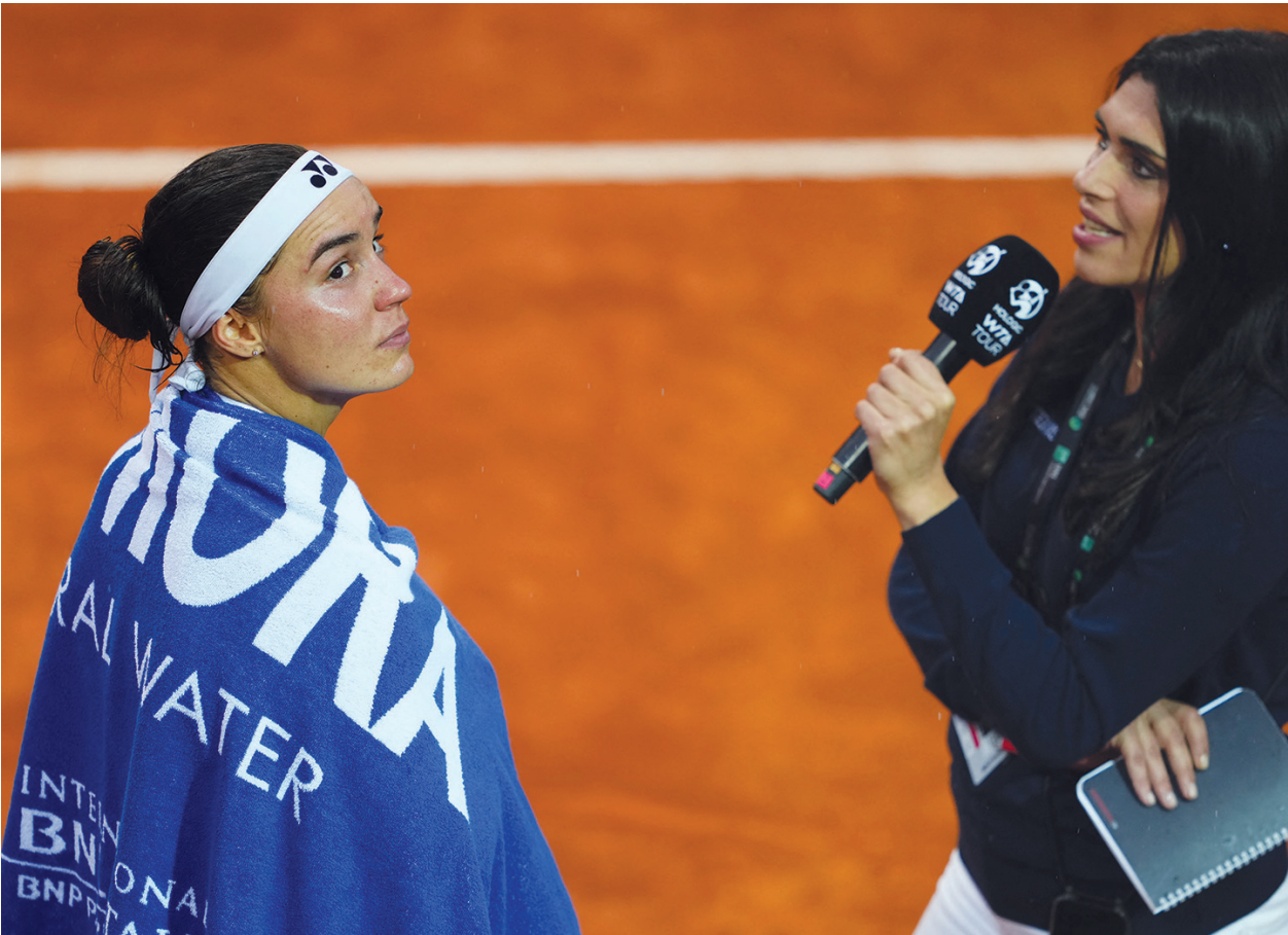
Ukraine's Anhelina Kalinina is interviewed after winning her semi-final against Russia's Veronika Kudermetova at the Rome Open yesterday.

The Ukrainian who lost her only previous WTA final two years ago in Budapest