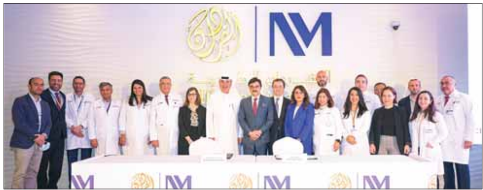
Representatives of AMNM and WCM-Q at the signing ceremony.