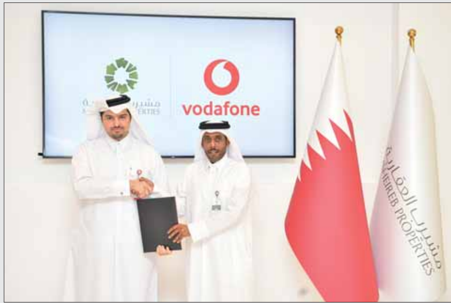
Officials mark the partnership.

He reaffirmed the position of Qatar to work together to mitigate the effects of crises, achieve sustainable development goals and ensure international peace and security.