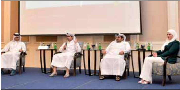
Some of the participants in the seminar.

During the seminar the representatives of the Work Permits Department reviewed the most prominent new services for six new different