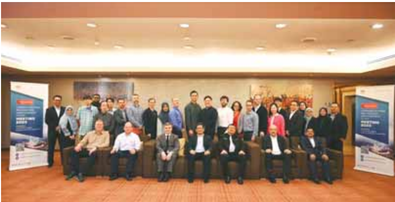
Qatar joined the Common Criteria Recognition Arrangement during the CCRA's first conference for 2023 in Malaysia.

After applying to become an authorising member, Qatar's Common Criteria Scheme (QCCS) under NCSA underwent a conformity assessment by Malaysia's and India's certification authorities to ensure its compliance. After the assessment, the Malaysia's and India's authorities reported to the president of CCRA that the QCCS met all requirements.