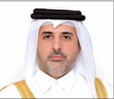
HE Dr Abdullah bin Abdulaziz bin Turki al-Subaie

He noted that the ministry's current strategic plan 2016-2023 is nearing conclusion, and it is about to launch new food security plan 2024-2030 which its new initiatives are being considered in co-operation with a consultancy firm specialised in this field, and that the next few months will highlight the features of this plan that