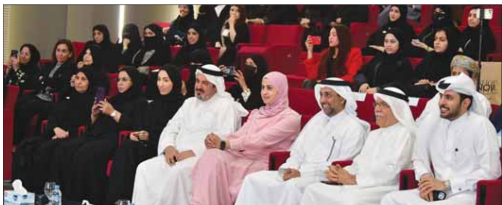
Dignitaries at the event.

During the ceremony, an introductory video about the College of Education, was presented, with an overview of its programmes and centres, and a video entitled