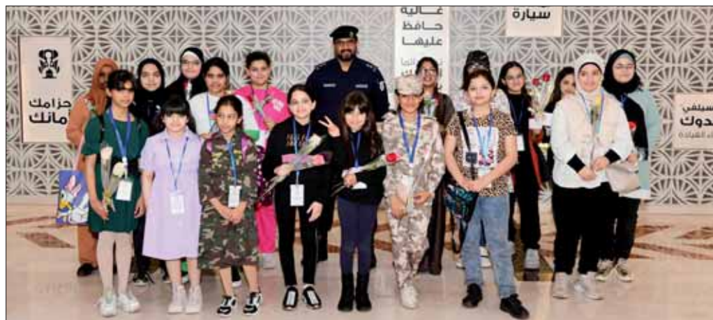
The two programmes included educational, recreational visits and training workshops with the participation of specialised trainers.

Q atar Charity (QC), through its community development centres in Al Rayyan and Al Khor, organised two programmes for girls in the spring break to allow them to learn artistic and manual skills in an entertaining form.