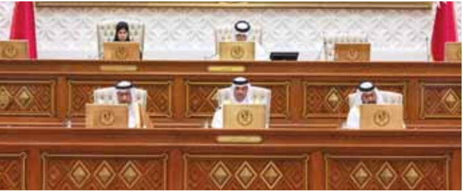
The Shura Council in session.

In turn, the Shura Council members praised the government's plans and policies to address inflation by implementing a package of measures that contributed to reducing the impact of inflation. They stressed the need to carry out periodic reviews of the monetary policies and legislations along with measures of subsidy and work on raising awareness among businesspersons and consumers, given their responsibility in contributing to addressing that issue. The members called on the authorities concerned to protect consumers and monitor the prices by intensifying their campaigns on the market, encouraging free competition and working to prevent monopoly, providing all means of support for the local product and providing it in a bigger scale in the local market, as well as encouraging its export and support it to compete abroad. The council members pointed to