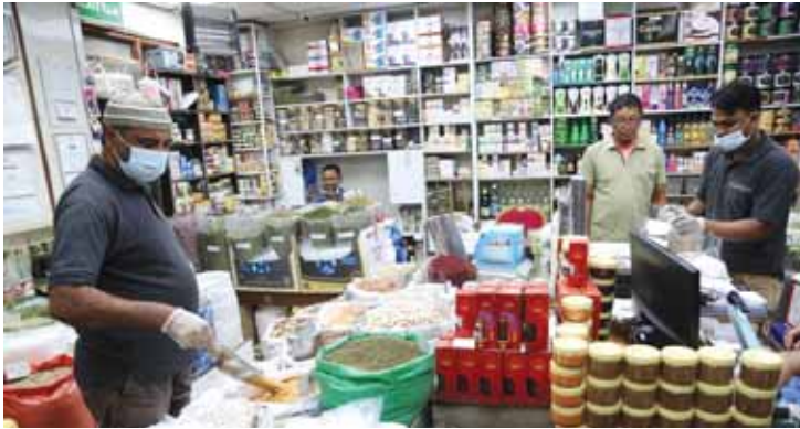
Shopkeepers at Souq Waqif are a busy lot these days.