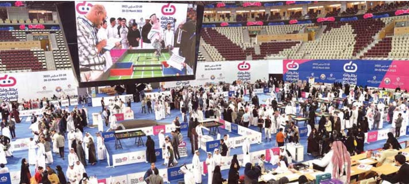
Snapshots from the 15th edition of the Schools' Robotics Championship.

Turkmenistan President Serdar Berdimuhamedov visited the headquarters of the Qatar Foundation for Education, Science and Community Development (QF) yesterday. He and his accompanying delegation listened to a demonstration on the objectives, activities, and work mechanism of the QF within its future vision. During the visit, a summary presentation was displayed, showing the history of the QF, highlighting its general mission and showcasing its achievements and accomplished goals, as well as its educational, developmental, and social role. Berdimuhamedov and his delegation also watched a documentary on the most prominent achievements of the QF in a number of fields related to the system of education, research, and development. - QNA