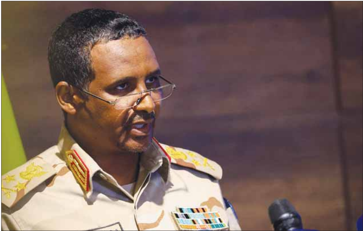
Deputy head of Sudan's sovereign council General Mohamed Hamdan Dagalo speaks during a press conference at Rapid Support Forces head quarter in Khartoum in February.