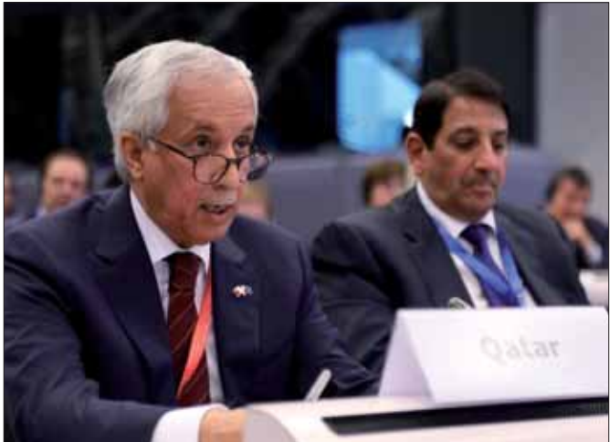
HE the Minister of State for Foreign Affairs Sultan bin Saad al-Muraikhi represented Qatar at the meeting.

He reviewed Qatar's efforts from the first moment of the disaster, as it provided all support and harnessed all capabilities