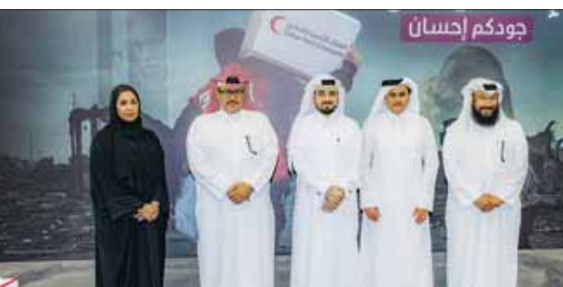
Officials pose for a group photo.