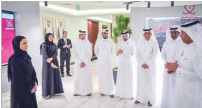
Media graduates who wish to join QNA or media, communication and public relations departments in other institutions, will be coached at QNA's Training Hall.