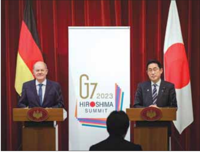
German Chancellor Olaf Scholz and Japan's Prime Minister Fumio Kishida attend a press conference after a summit meeting at the prime minister's official residence in Tokyo yesterday.

Japan and Germany pledged closer defence ties and co-operation on diversifying supply chains as Chancellor Olaf Scholz and Prime Minister Fumio Kishida met in Tokyo yesterday. Scholz is on his second trip to Japan in less than a year, and came with six ministers for government-to-government talks as Berlin works to boost its profile in the Asia-Pacific region, and ahead of the G7 summit being hosted this May by Japan in Hiroshima.