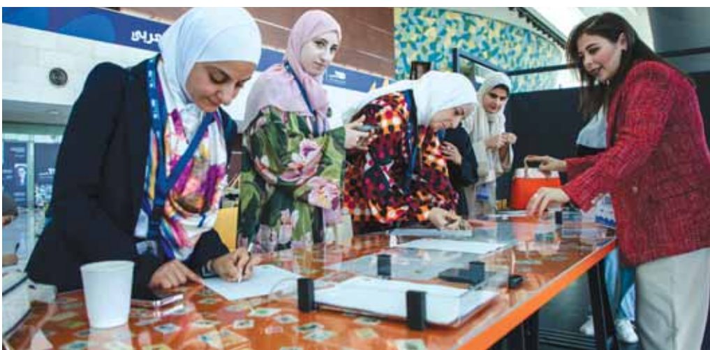
Snapshots from the summit and accompanying activities.