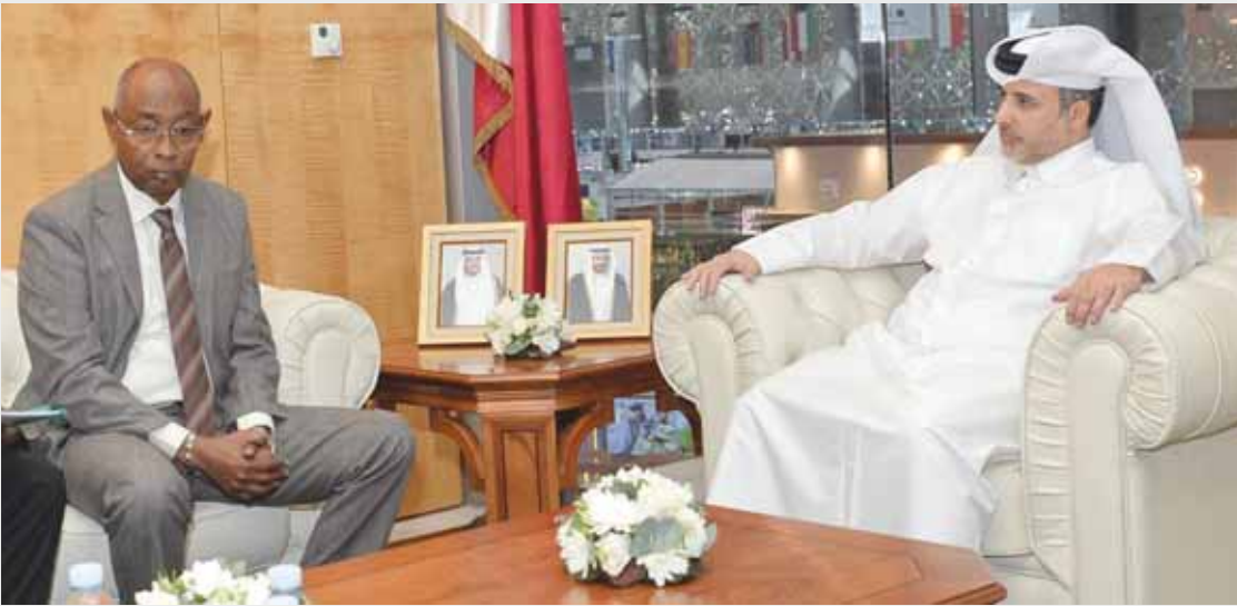
HE the Minister of Municipality Dr Abdullah bin Abdulaziz bin Turki al-Subaie met here yesterday with visiting Minister Delegate In-Charge of Decentralisation in Djibouti Qassim Haroun Ali, who is participating in the 10th Qatar International Agricultural Exhibition. During the meeting, they discussed means to boost bilateral co-operation. (QNA)