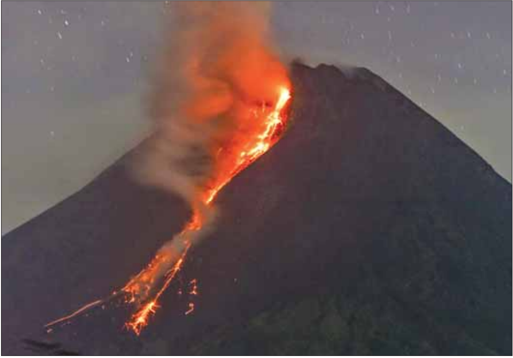
Mount Merapi volcano spews lava from its crater as seen from Sleman in Yogyakarta early yesterday.

Indonesia's Mount Merapi, one of the world's most active volcanoes, erupted late Friday and continued to spew hot ash and other volcanic material yesterday. Footage of flaming lava pouring out of the crater and a tall column of hot cloud rising 1,300 metres into the air was taken by the government-run Merapi Volcano Observatory on Friday night. The volcano continued to spew hot ash and hot lava was visible yesterday. "Residents should anticipate the disruption due to the volcanic ash from Mount Merapi eruption and please be on alert for the danger of volcanic mud-flow, especially when it rains around Merapi," the country's volcanology agency said in a statement yesterday. Merapi also erupted last week, sending volcanic material 9,600 feet (3,000 metres) above the summit. Volcanic ash rain blanketed at least eight villages near the volcano after last week's eruption. Volcanologists said last week