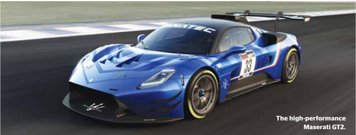
The high-performance Maserati GT2.