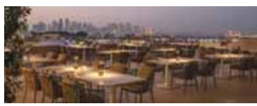
Enjoy Iftar and Suhoor at Jiwan.

“During this coming holy month of Ramadan, each of our restaurants located in the heart of the iconic museums and galleries – the MIA, NMoQ and the Fire Station – offers a unique experience that will make Iftar shared with family and friends, a meaningful one,” said IN-Q director of F&B Op-