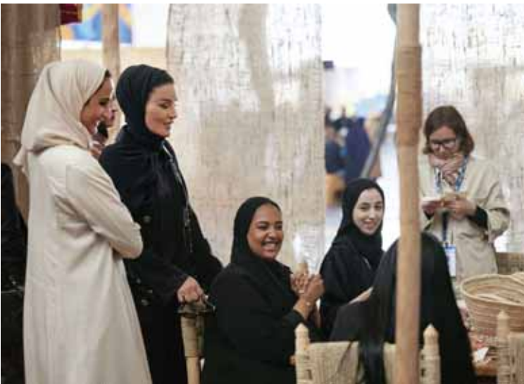
Her Highness Sheikha Moza bint Nasser toured the interactive spaces and Arabic stations at the summit, together with HE Sheikha Hind bint Hamad al-Thani.