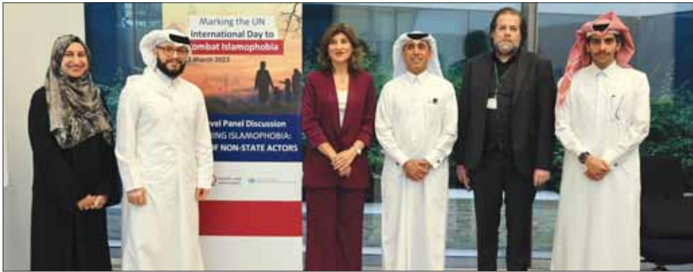
UN officials, academia, experts and those concerned with countering Islamophobia attended.