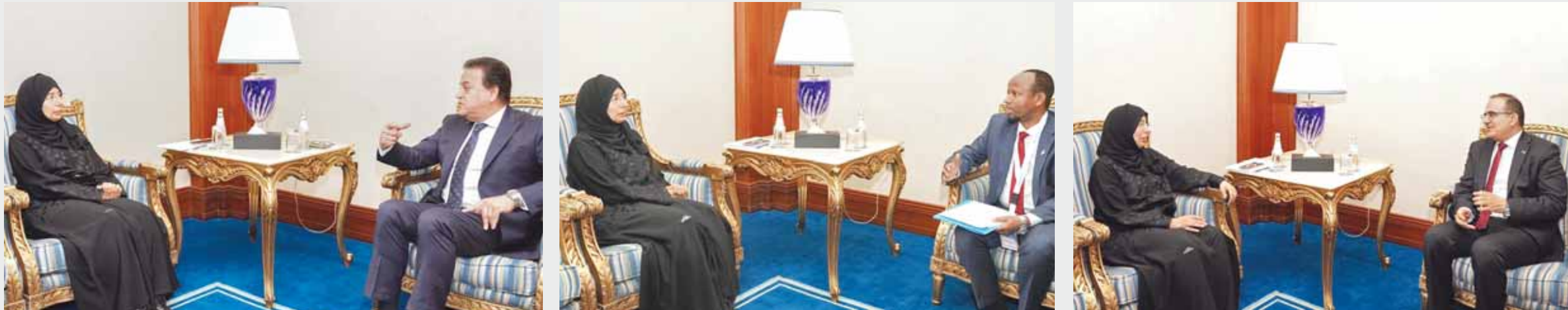
HE the Minister of Public Health Dr Hanan Mohamed al-Kuwari held bilateral meetings with Egypt's Minister of Health Dr Khaled Abdel Ghaffar; Yemen's Minister of Public Health and Population Dr Qassem Mohamed Bahaibah and Somalia's Minister of Health Dr Ali Haji Aden, on the sidelines of the Middle East Forum on Quality and Safety in Healthcare 2023, which is being held in Doha. They discussed relations between Qatar and each of the three countries in different health fields, in addition to the key issues addressed at the Middle East Forum on Quality and Safety in Healthcare.