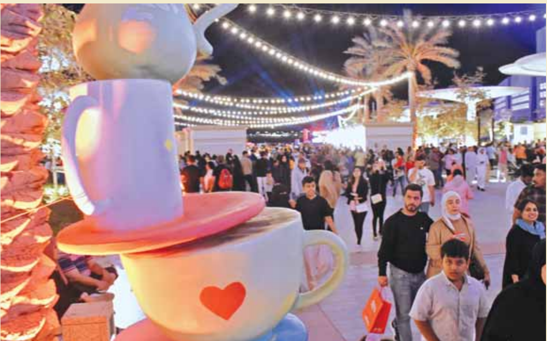
The 12th Qatar International Food Festival continued to attract a large number of people yesterday, thanks to the wide range of delicacies on offer from around the world, fun activities and a dazzling fireworks display, among other attractions. The latest edition of the annual festivity, taking place at Al Sa'ad Plaza in Lusail Boulevard, a modern and iconic venue, features more than 80 culinary vendors and several other activations, entertainment and live cooking demonstrations.