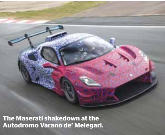
The Maserati shakedown at the Autodromo Varano de' Melegari.