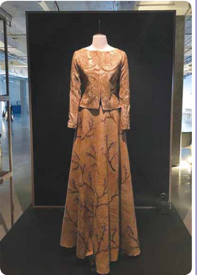
A dress by Mashael al-Naimi.

“There are plenty of natural techniques that can be used to dye natural cloth and make them a labour of love. Sustainability is a local effort that should be supported by each and every one,” al-Naimi concluded.