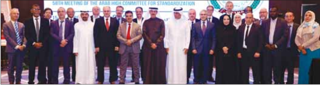
Delegates at Arab standardisation summit in Rabat.