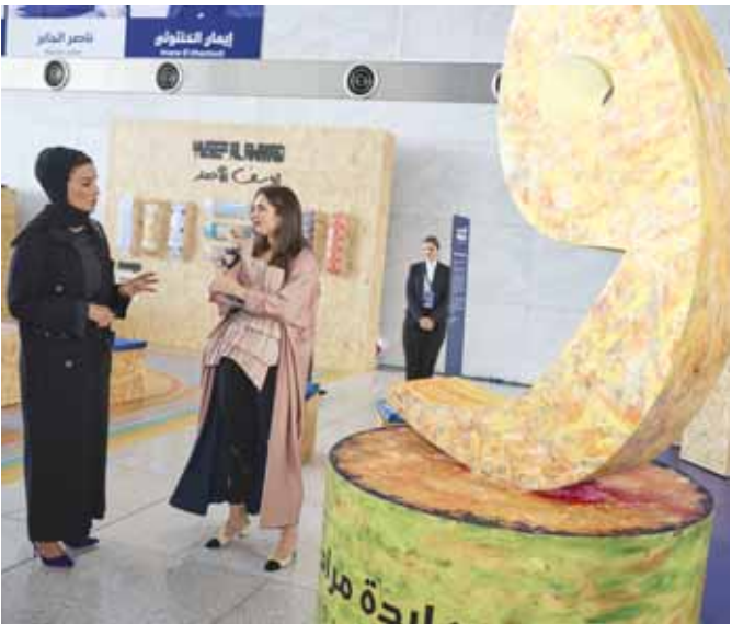
Her Highness Sheikha Moza bint Nasser touring the summit.