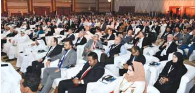
A section of the audience.

“Most crucial aspects of healthcare is to provide high-quality care that is safe. This topic has become even more important in the face of Covid-19 pandemic that has touched all the healthcare systems around the world. Covid-19 has challenged us as never before and it has taken resilience and innovation to overcome the hurdles.”