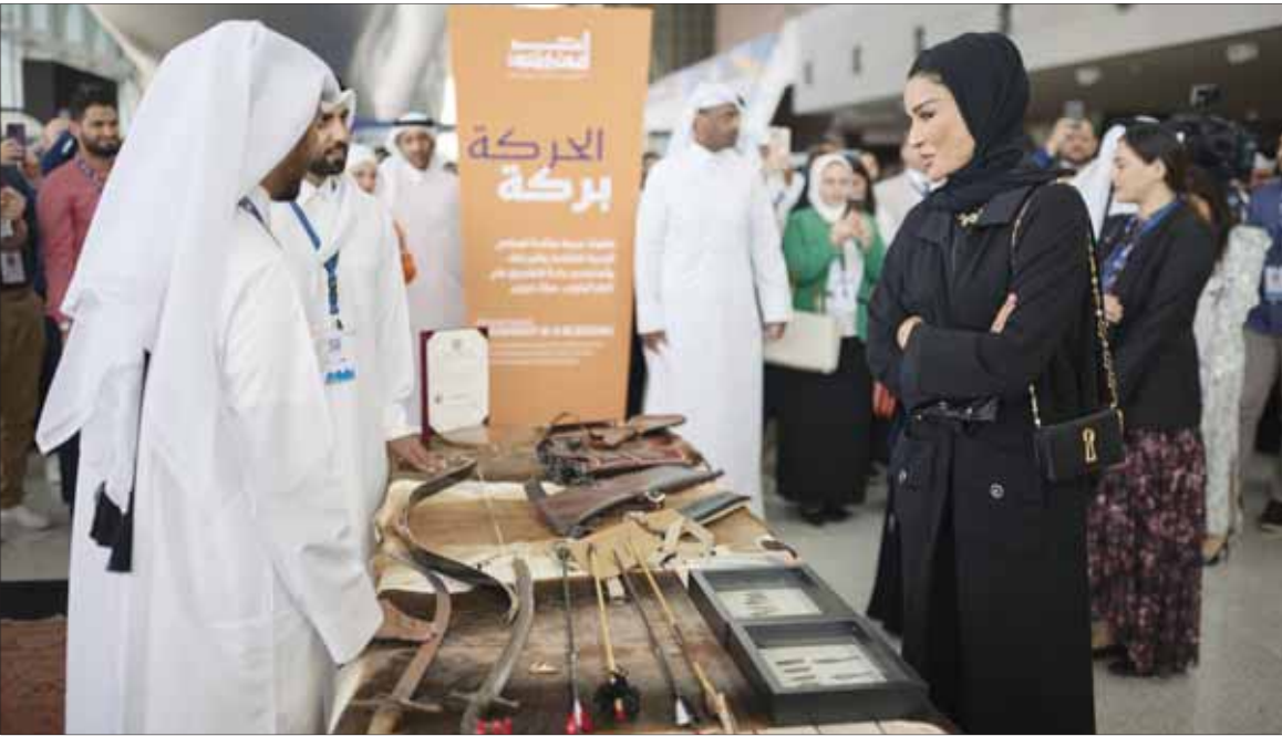
Her Highness Sheikha Moza bint Nasser toured the interactive spaces and Arabic stations at the summit.