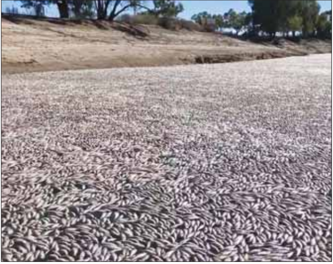
This image grab from a video taken on March 17, 2023 shows dead fish clogging a river near the town of Menindee in New South Wales.

a concern for fish health" in the area. "There is a large number of fish deaths (predominantly Bony Herring) in the Darling River between Lake Wetherell and Menindee township," the agency said on Friday. Hundreds of thousands of dead fish had been found in the river, and state fisheries officers had been sent to the area to assess the issue, the Australian Broadcasting Corp reported yesterday. Footage posted to Twitter by SBS showed a boat navigating through thousands of dead fish blanketing the entire surface of the river. The state planning and environment agency warned river oxygen levels could fall further this weekend as temperatures rise, before cooler conditions return next week.