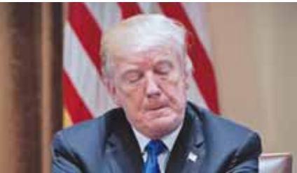
Trump took to his Truth Social platform to say that he would be arrested on Tuesday, and called for protest actions.

In his Truth Social post, written in capital letters, Trump referred to “illegal leaks from a corrupt & highly political Manhattan district attorneys office” and said the investigation was “based on an old & fully