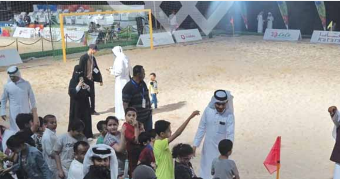
The National Programme for Conservation and Energy Efficiency (Tarsheed) took part in the Qatar Olympic Committee activities for the Beach Games 2023. It presented an awareness lecture on the importance of reducing electricity and water consumption to achieve Tarsheed's goals, and also organised interactive competitions for the attendees.