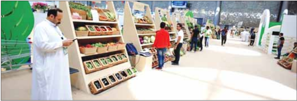
Glimpses from AgriteQ 2023.

ing Expo Doha 2023, witnessed the signing of a memorandum of understanding (MoU) between the organising committee and Hassad Food to sponsor the expo. The committee said that the signing is an important step towards a successful hosting of the event. (QNA)