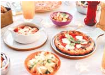
Experience Ramadan with authentic Italian cuisine at Cafe #999.