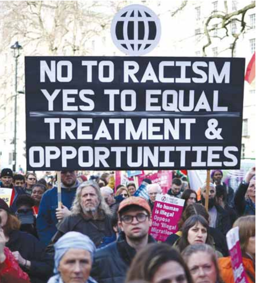
Protesters demonstrate against the government’s anti-refugee bill outside Downing Street in London.

The government, Braverman said, is in compliance with its international law obligations.