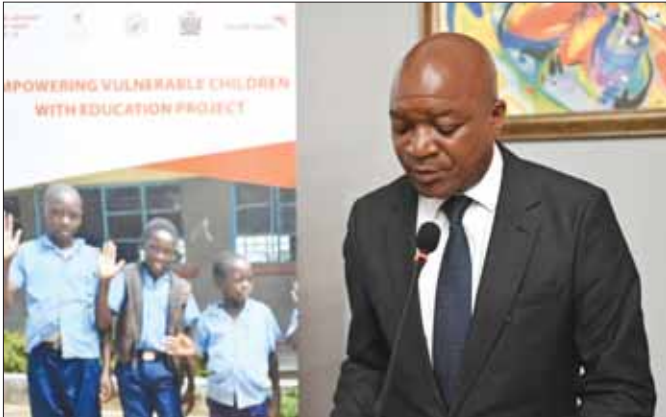
From the launch of the initiative.

The project will support children from vulnerable households who attend primary school but are at high risk of dropping out.