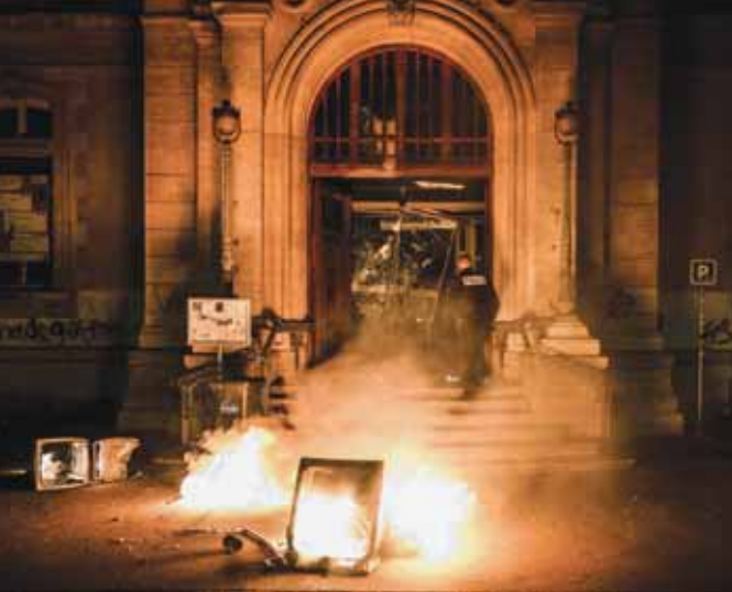
A police officer attempts to extinguish flames at the entrance of the town hall of the 4th arrondissement (district) of Lyon, which was vandalised during riots following a demonstration after the French government pushed a pensions reform using the article 49.3 of the constitution.

In the southeastern city of Lyon, demonstrators tried to break into a town hall and set fire