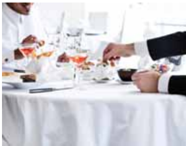
IDAM by Alain Ducasse.

Italian Ramadan Long Table Iftar at Cafe #999 located at the Fire Station. Reminiscent of traditional Italian long table dining, this is a novel experience for Iftar or ghabga, with the last order accepted at 10.30pm.