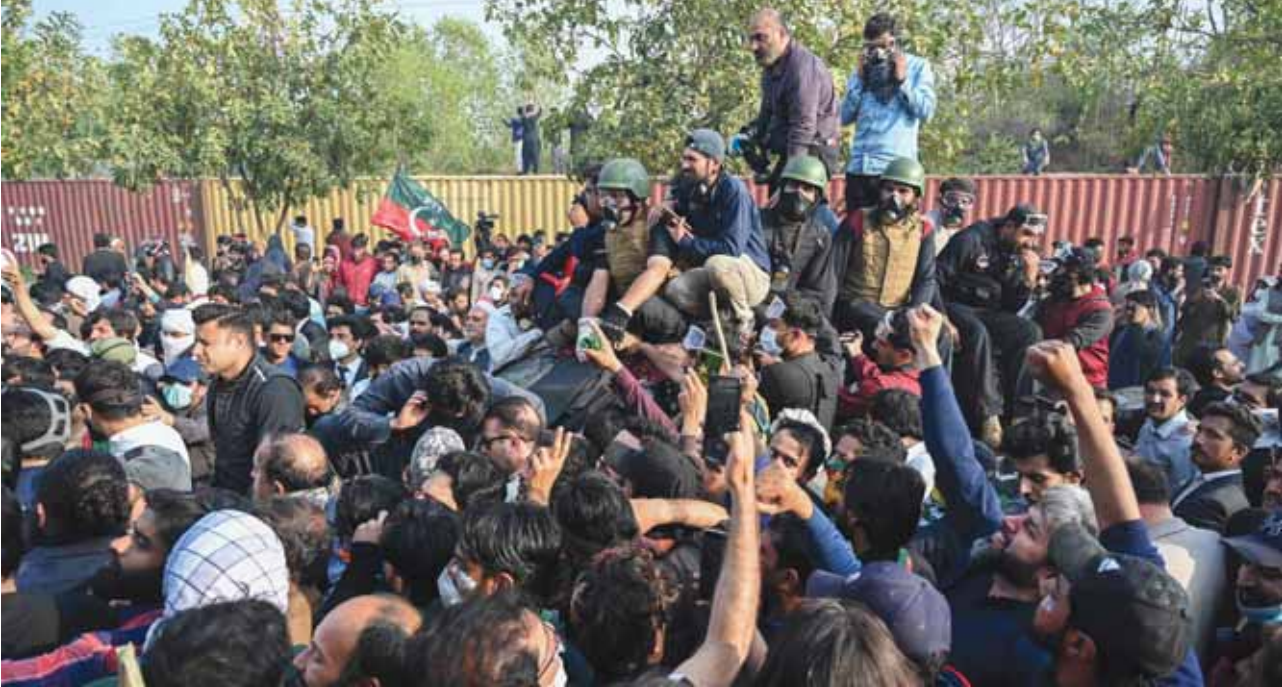
Supporters of former prime minister Imran Khan sit atop his vehicle outside a court in Islamabad.

Twitter to criticise Khan, saying he was using people as human shields and was attempting to intimidate the judiciary.