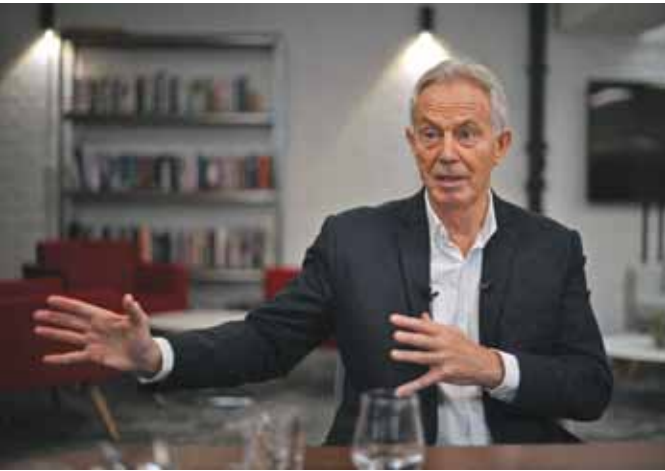
Former British prime minister Tony Blair speaks during an interview in central London.

“Now you can argue about all the consequences and so on,” he continued. “His (Putin’s) intervention in the Middle East (in