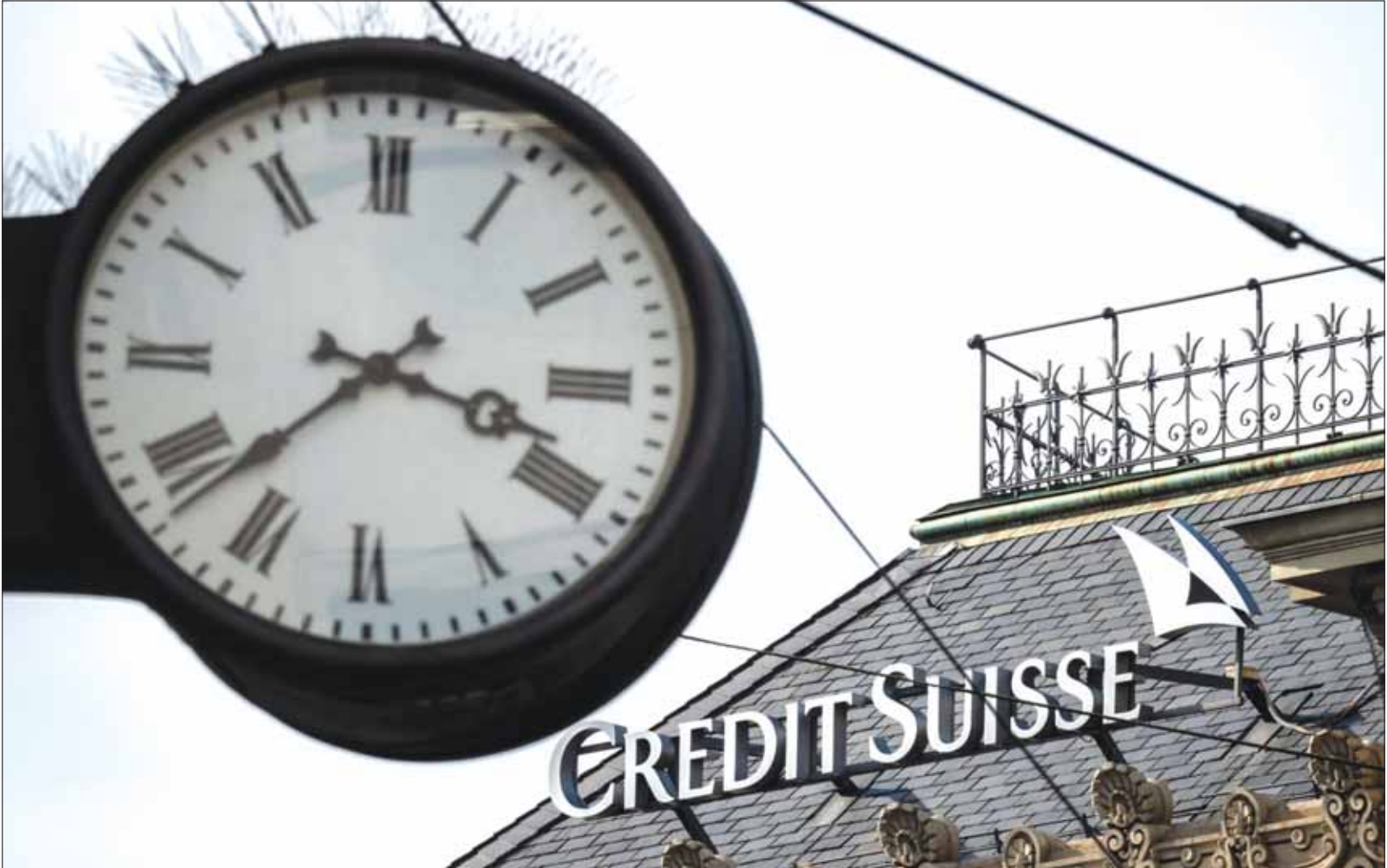
A sign of Credit Suisse is seen behind a clock at the headquarters of Switzerland’s second-biggest bank in Zurich yesterday. Switzerland’s largest bank, UBS, is in talks to buy all or part of Credit Suisse, according to a report by the Financial Times . Credit Suisse came under pressure this week as the failure of two US regional lenders rocked the sector.