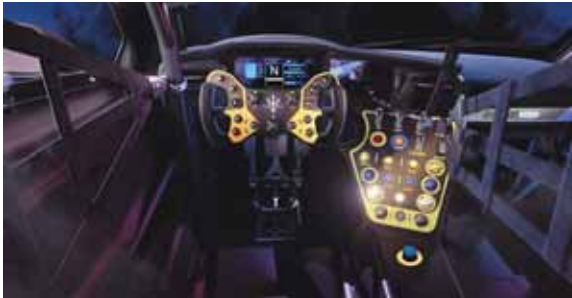
The Maserati GT2 is "speed, elegance, style and innovation incarnate".

Much attention has been given to the development of the correct balance of the aerodynamic load, whereas the bottom has been developed specifically to work best in synergy with the front splitter and rear wing (adjustable) – it has quick-release removable bodywork for optimised component replacement, and the chassis features high