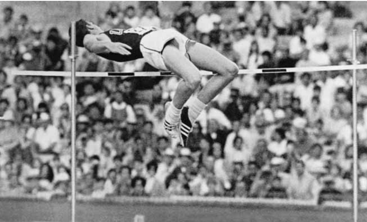
In this file photograph taken on October 20, 1968, US athlete Dick Fosbury competes in the men’s high jump final and wins the gold medal with a brand new style of jumping at the Mexico Olympic Games in Mexico City.