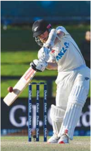
Kane Williamson remained unbeaten on 121, for his 27th Test ton.