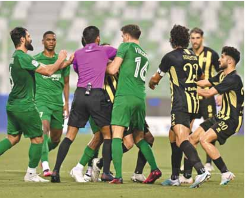
Qatar SC and Al Ahli players scuffle during the QNB Stars League match at the Hamad Bin Khalifa Stadium.

All the quarter-finals, which are falling during the holy month of Ramadan, will kick off at 9:45pm. The QFA yesterday also announced the schedule of the semi-finals which will be played on April 24 and 25 with kick-off time set for 6:45pm. The venue and date of the final is yet to be announced.