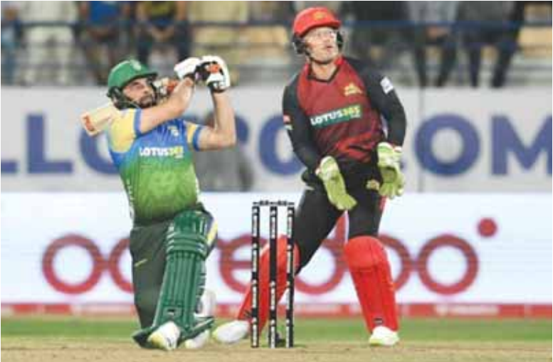
Misbah Ul Haq hit an unbeaten 44 off just 19 balls at Asian Town Stadium.

ons after their win over India Mahara-jas in the tournament opener.