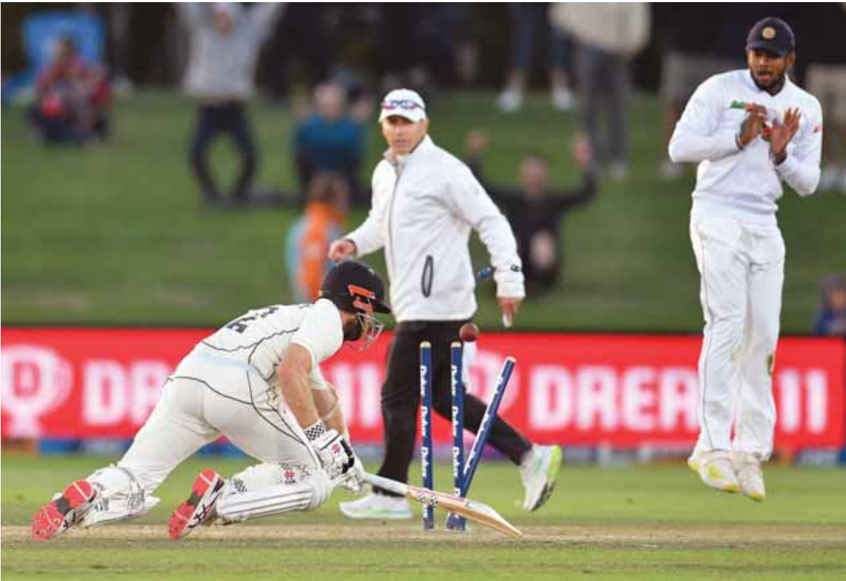
New Zealand’s Kane Williamson (left) completes a successful run to win the first Test against Sri Lanka in Christchurch.

saw the hosts at 90-3, Williamson and Mitchell picked up the pace.