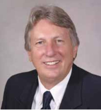
It was not until 1968 however that Fosbury’s new approach gained global attention. Victory at the US college