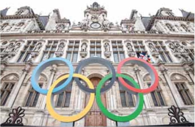
Olympic rings are on display in front of The City Hall in Paris yesterday, ahead of the 2024 Olympic Games.