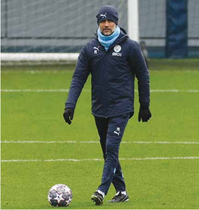
Manchester City manager Pep Guardiola.

Asked if his time at City would be judged solely on his European achievements, Guardiola told reporters: "Yes. It doesn't mean I agree with that but absolutely we