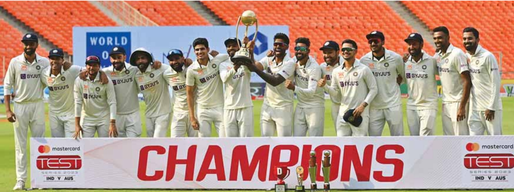
Indian players celebrate after winning the Border-Gavaskar series at the end of the fourth Test against Australia in Ahmedabad yesterday.