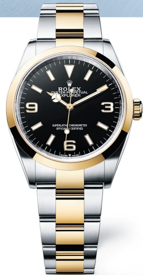
OYSTER PERPETUAL EXPLORER