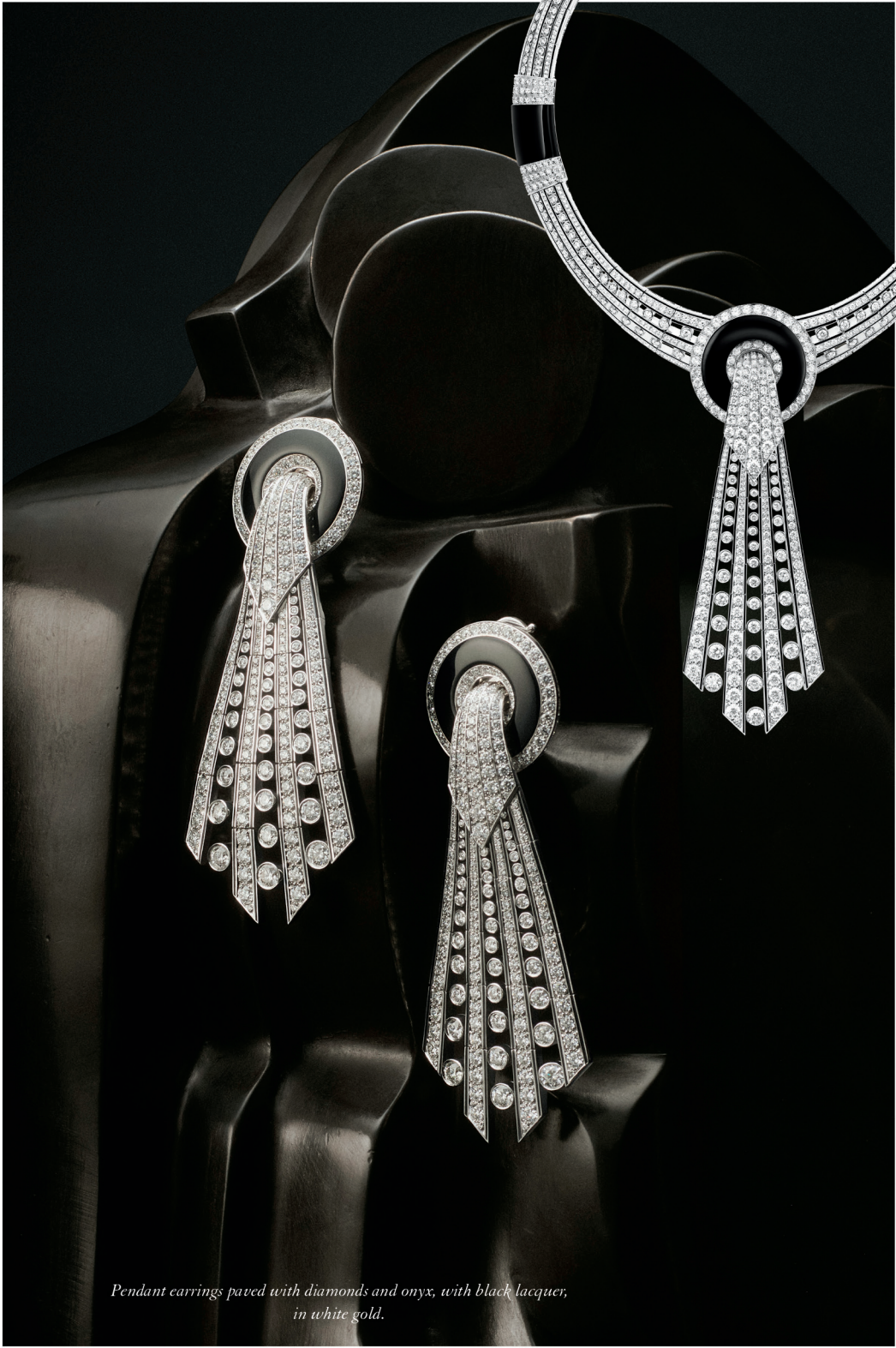
Pendant earrings paved with diamonds and onyx, with black lacquer, in white gold.