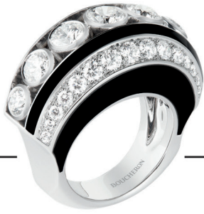
Ring set with a 0.60 ct D VVS2 round diamond, paved with diamonds and onyx, with black lacquer, in white gold.

A necklace like a cravat. Pure and opulent lines dictating style like a fashion detail would dictate a whole look. This diamond, onyx, black lacquer and white gold piece remembers the mythical flapper who would borrow fashion items from the masculine wardrobe and assert a new style. Here is a cravat, depicted in a frozen movement, as a necklace quilted with diamonds and trimmed with three braids of large black lacquer rings. Claire Choisne offers to play with this piece that can be worn in three different ways with or without the cravat piece. As a necklace, a choker, a collar pin accompanied by matching earrings and an onyx, diamonds and black lacquer on white gold ring.