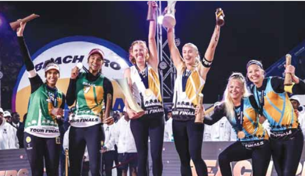
The women's title was won by wild cards Sara Hughes and Kelly Cheng of the US. Reigning world champions Eduarda Santos Lisboa and Ana Patricia Ramos of Brazil settled for silver, while third seeds Katja Stam and Raisa Schoon of the Netherlands came third.