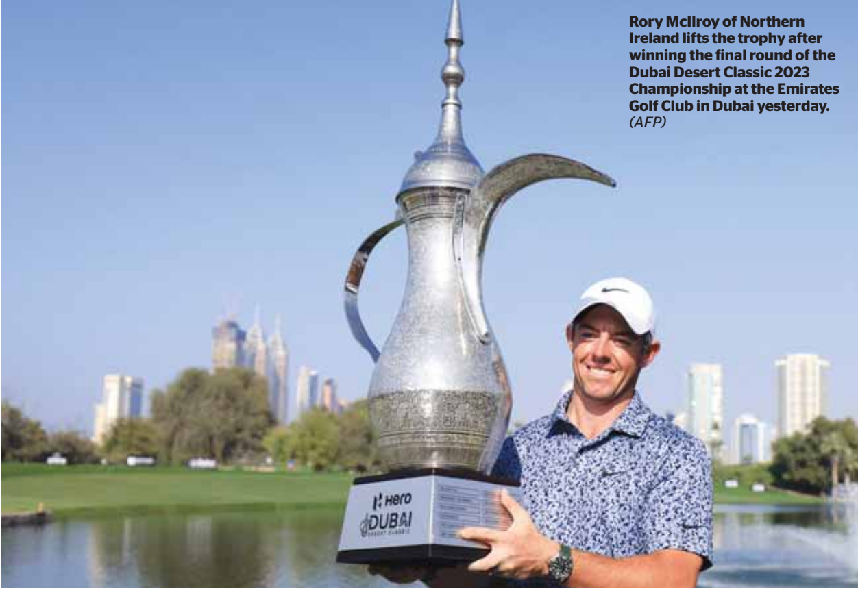
Rory McIlroy of Northern Ireland lifts the trophy after winning the final round of the Dubai Desert Classic 2023 Championship at the Emirates Golf Club in Dubai yesterday.

when he hit his second shot into the water on the final hole - and he almost repeated the scenario with his tee shot on the 18th.