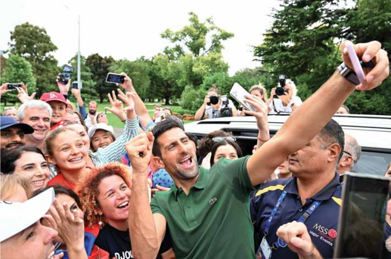
Serbia's Novak Djokovic gets selfies with his supporters outside the Government House in Melbourne after winning the Australian Open final against Greece's Stefanos Tsitsipas.

His coach, Goran Ivanisevic, believes there are a few more