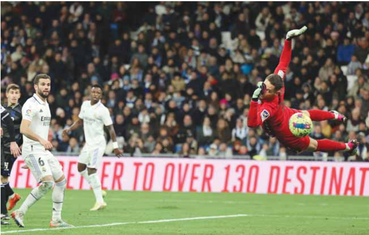
Real Madrid’s Nacho Fernandez (left) looks at Real Sociedad’s goalkeeper Alex Remiro makes a save during the La Liga match at the Santiago Bernabeu stadium in Madrid on Sunday.

Remiro made another smart save from the Brazilian winger early in the second