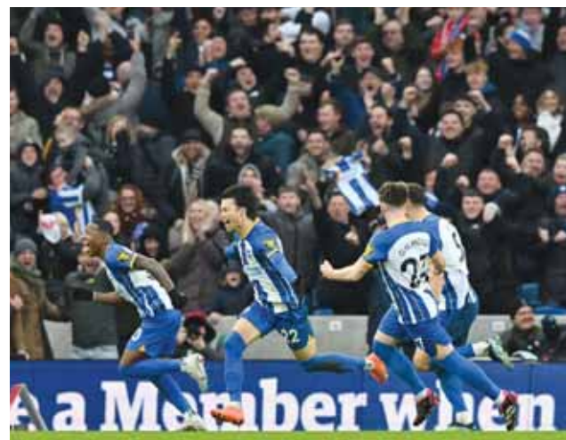
Brighton's Japanese midfielder Kaoru Mitoma (centre) celebrates with teammates after scoring their second goal during the English FA Cup fourth round match against Liverpool in Brighton yesterday.