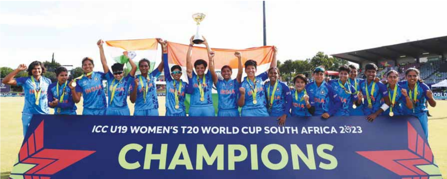
Indian players celebrate winning the inaugural ICC Women’s U-19 World Cup in Potchefstroom, South Africa, yesterday. India beat England by seven wickets in the final.