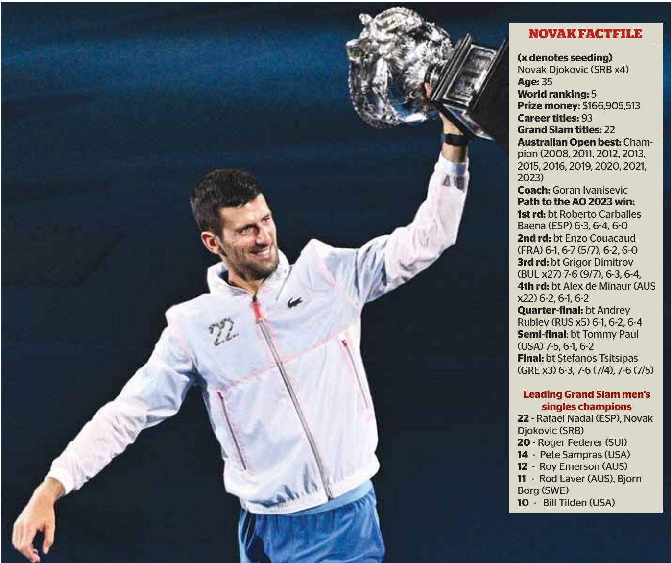
Serbia's Novak Djokovic holds the Norman Brookes Challenge Cup after his victory against Greece's Stefanos Tsitsipas in the final of the Australian Open in Melbourne yesterday.

International before reinforcing his status as an all-time great in Melbourne. His dominant win drew him level with Nadal on a record 22 Slams, two clear of now-retired Roger Federer. The Spanish great made a second-round exit with a hip injury, one of a series of shocks which upended the men's and women's draws during the first major of the year. “I guess we always find the A-game on the Slams,” Djokovic said of equal-