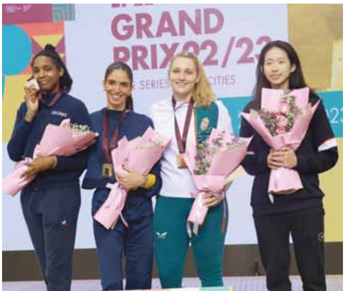
The medal winners in the women’s category are seen at the prize distribution ceremony.