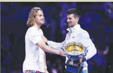
Novak Djokovic (right) with Stefanos Tsitsipas after winning the Australian Open final in Melbourne yesterday.

was dispatched in straight sets in the semi-final but Dominic Thiem gave Djokovic his hardest final since the Nadal epic in 2012. Djokovic eventually fought back from two sets to one down to secure his 17th major. “Obviously at this stage of my career, Grand Slams are the ones I value the most. They are the ones I prioritise,” he said. Stomach for the fight: 2021 - Djokovic looked on his way out when he could barely run because of an abdominal injury in the third round against Taylor Fritz, but somehow survived in five sets. He was unable to train between matches, but grew fitter with every passing round and reached the final. World number four Daniil Medvedev went the way of the Serb's eight previous final opponents as a rampant Djokovic extended his perfect record in finals in Melbourne. More controversy, more glory: 2023 - The fourth seed returned after missing the 2022 edition when he was deported over his Covid stance. There were concerns over how he would be received by the crowd and there was