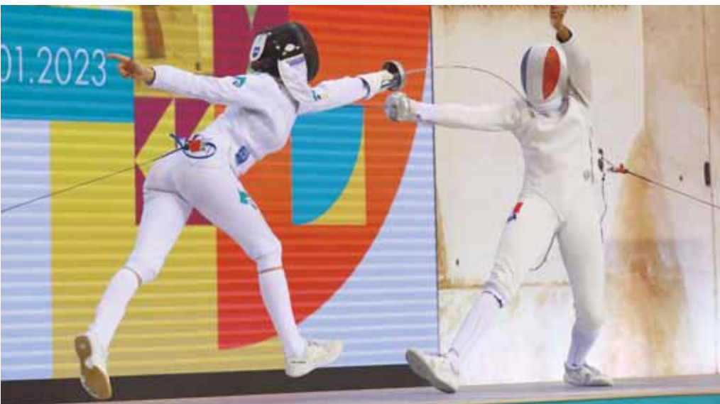
Fencers in action on the concluding day of the Qatar Grand Prix Fencing Championship 2023 at the Aspire Dome yesterday.