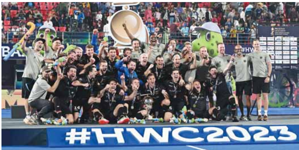
Germany’s players pose with the trophy after winning the FIH men’s Hockey World Cup 2023 at the Kalinga Stadium in Bhubaneswar yesterday.