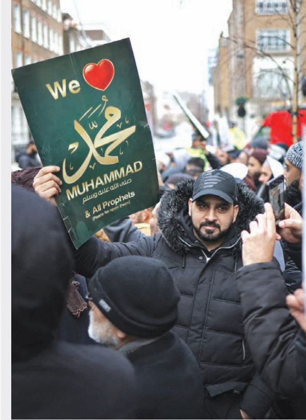
People attend a protest yesterday following the burning of the Qur'an in Stockholm, outside the embassy of Sweden in London.

A chained globe covered in oil rests on a rug at an Extinction Rebellion Scotland protest yesterday outside the Barclays Bank branch in Argyle Street, Glasgow.