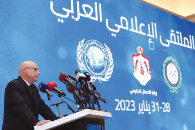
The Arab Media Forum kicked off yesterday in Amman.

Students can apply for top-ranked undergraduate programmes in biological sciences, business administration, and computer science and information systems for studies beginning in August.