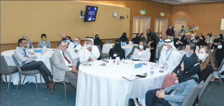
Participants of the awareness programme.

The Hamad Medical Corporation (HMC) continues to raise awareness about lipedema causes, symptoms and the available treatment options to patients and their families.