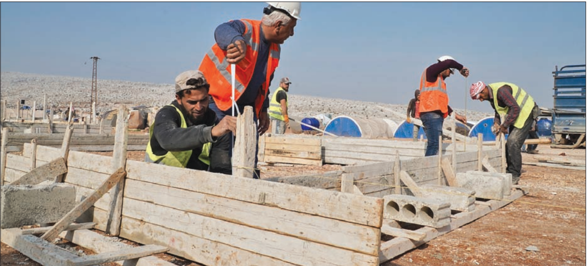
The project aims to preserve the human dignity of the expected beneficiaries by improving their living conditions.

He noted that the people suffer here under the scorching sun and in the blistering winter. Further, seven school tents were provided to replace the old ones, which were about to