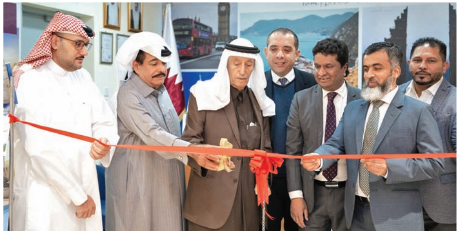
Snapshots from the opening of the new Rayan Travel & Tours outlet at the Yacht Club tram station, Lusail.