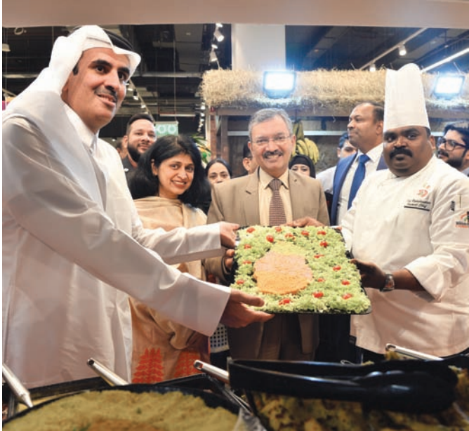
India Utsav 2023 celebrates Indian cuisine.