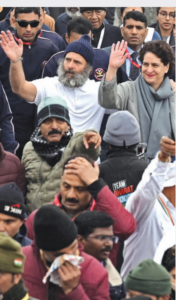
Right: Indian Congress Party leader Rahul Gandhi and his sister Priyanka Gandhi wave yesterday during the 'Bharat Jodo Yatra' march in Anantnag, south Kashmir.