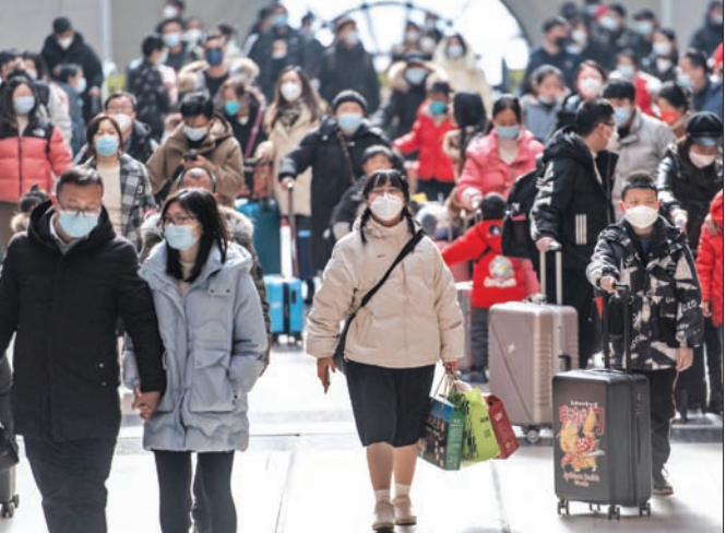
Passengers arriving at Hankou railway station on the last day of the Lunar New Year holidays in Wuhan, in China's central Hubei province.

residents to "stay safe" amid the emergency. "We're not out of this yet. Heavy rain returns tomorrow," the agency wrote on the social media platform. Two men were found dead, New Zealand Police said. A search was under way for a man believed swept away, while another person was unaccounted for after a landslide hit a house in an inner Auckland suburb, police said. More than 2,000 calls for assistance and 70 evacuations had been made around the city, the New Zealand Herald reported. City rainfall records were broken, with Auckland Airport logging 249mm (9.8 inches) in the 24 hours to 9am on Saturday, beating the 1985 high of 161.8mm. Some local flights resumed at Auckland Airport, which had closed domestic and international operations on Friday. Air New Zealand said its domestic flights in and out of Auckland resumed from noon, and advised it was assessing whether international flights would also restart. The airport, on its website, said it was scheduled to open its international terminal for departures from 5pm, while international arrivals would restart at 4:30am today. Air New Zealand said 12 of its international flights due into Auckland had been diverted overnight. On Friday, social media showed firefighters, police and defence force staff rescuing stranded people from flooded homes using ropes and rescue boats. The flooding forced cancellations of British pop star Elton John's concerts in the city, which had been scheduled for Friday and Saturday nights.