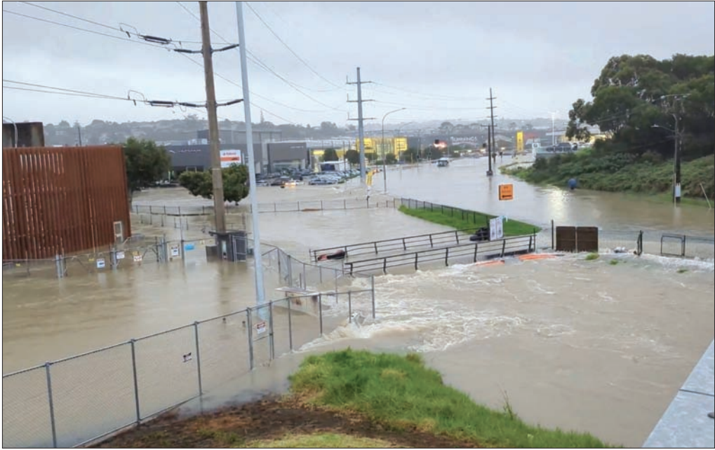
A flooded area in Auckland.