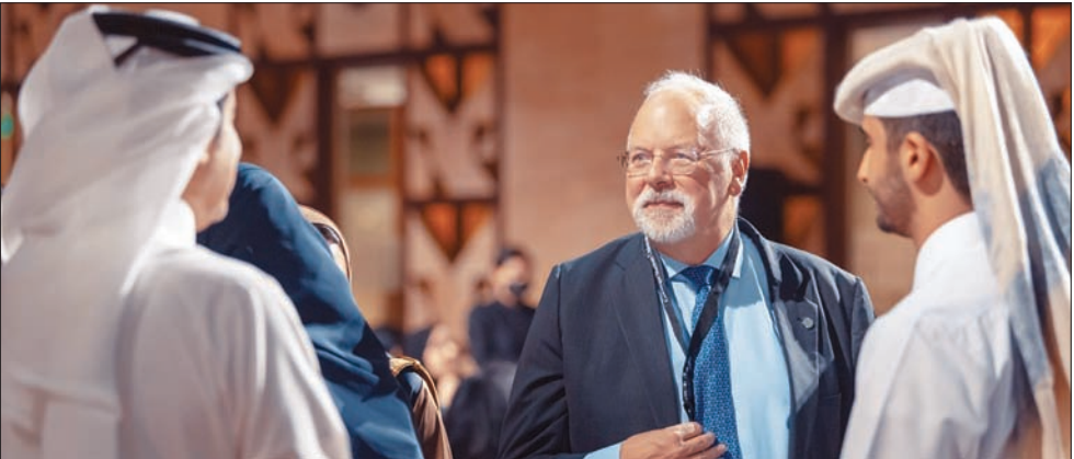
Carnegie Mellon University in Qatar held an event to welcome the first students of the Class of 2027.