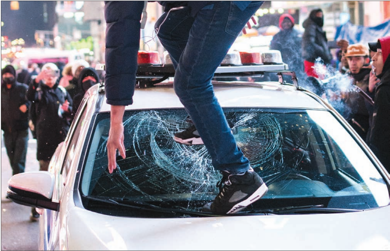
A protestor steps on the windshield of a police vehicle in New York.

Russia’s deputy foreign minister Sergei Ryabkov will hold a meeting with Lynne Tracy, the new US ambassador to Moscow, early next week, the RIA news agency reported yesterday. Tracy arrived in Moscow earlier this week. Russian Foreign Ministry spokeswoman Maria Zakharova said on Friday that the new US ambassador would not improve ties between the two countries because of what she called Washington’s ongoing “hybrid war” against Russia. Relations between Washington and Moscow have been at rock bottom since Russia’s invasion of Ukraine last February. Russia casts the war as confronting what is says is an aggressive and expansionist US-led Nato alliance, while Kyiv and its allies call Russia’s actions an unprovoked land grab. According to Ryabkov, the traditional presentation of copies of credential by Tracy is already agreed upon. “It will take place literally at the beginning of the week. It is expected that the transfer of copies of credentials by Ambassador Tracy will be made to me,” he said.