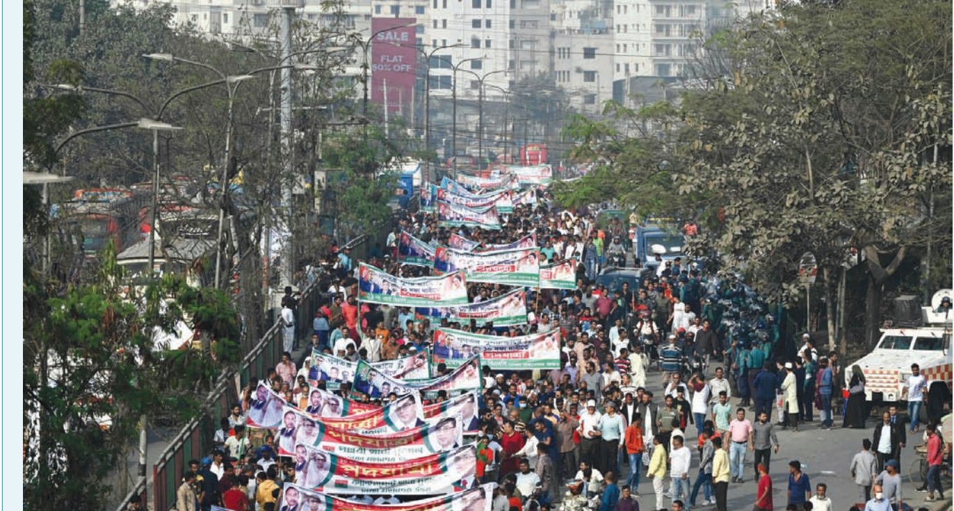
Bangladesh Nationalist Party (BNP) activists take part in a protest march in Dhaka yesterday to press their 10-point demand, including holding the next general election under a non-party caretaker government.