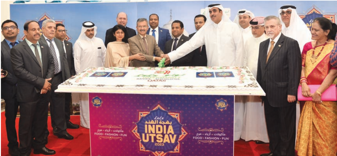
The cake-cutting ceremony at the inauguration.