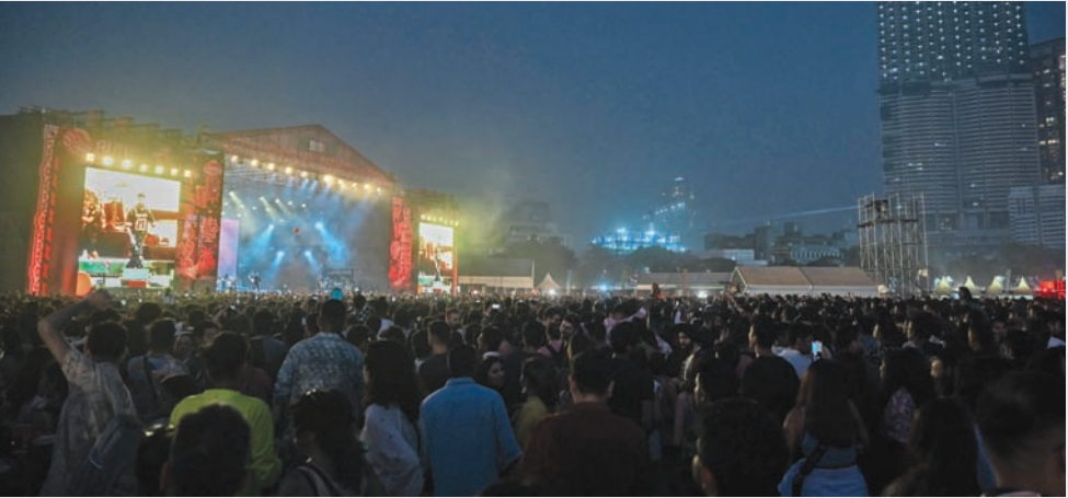
Spectators watch Indian-born Canadian singer A P Dhillon perform during the Lollapalooza India music festival in Mumbai. One of the world's longest-running festivals kicked off in Mumbai yesterday for the Indian financial hub's biggest music extravaganza since the end of the coronavirus pandemic.