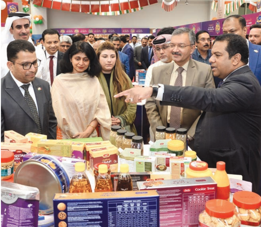
Dignitaries at the event.