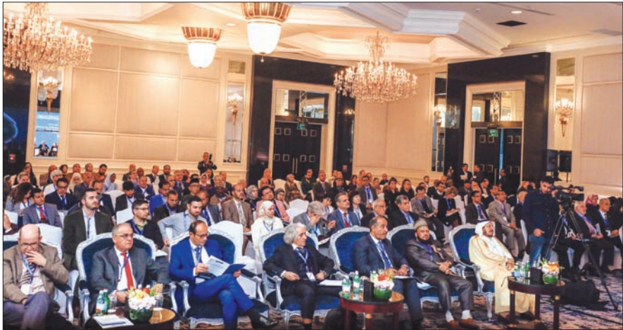
Glimpes from the ninth International Conference on Translation and Problems of Interculturalisation in Doha.