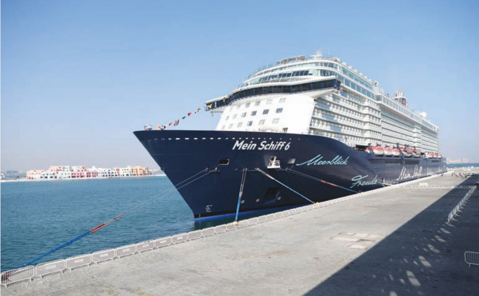
Cruise ship 'Mein Schiff 6' yesterday arrived at Doha Port on its second call in the 2022/23 cruise season with 3,319 passengers and crew members on board, Mwani Qatar said. Operated by German-based cruise line TUI Cruises, 'Mein Schiff 6' sails under the flag of Malta and is one of the largest in the company's fleet, measuring 295m long, 35.8m wide, and 8m draft. It offers space for up to 2,534 passengers and boasts of 17,895sq m of outside decks along a variety of restaurants, cafes and various recreational facilities.