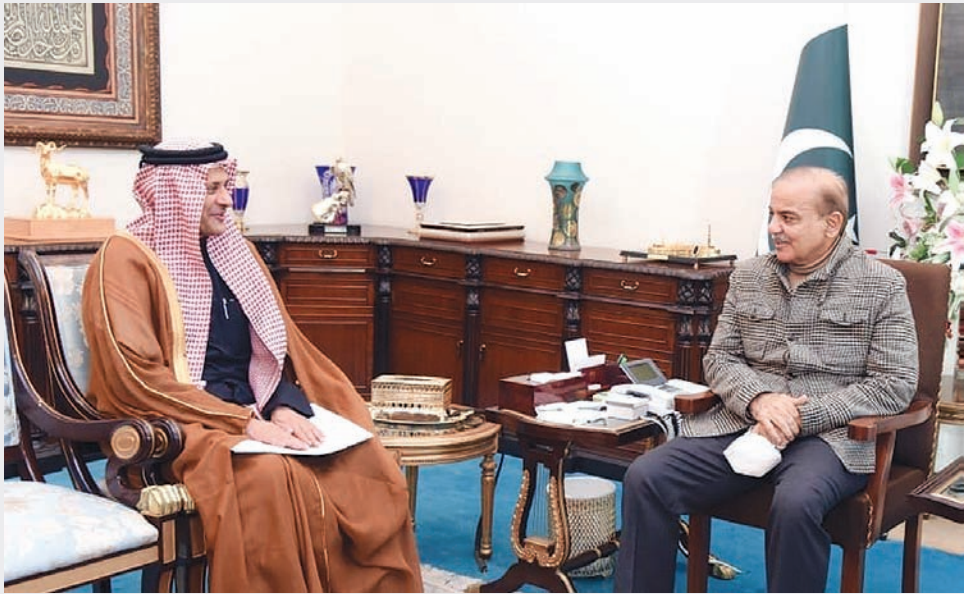
His Highness the Amir Sheikh Tamim bin Hamad al-Thani sent a written message to Pakistan Prime Minister Shehbaz Sharif, pertaining to bilateral relations and ways to support and develop them. The message was handed over by Qatar's ambassador in Islamabad Sheikh Saoud bin Abdulrahman al-Thani during his meeting with the prime minister. (QNA)