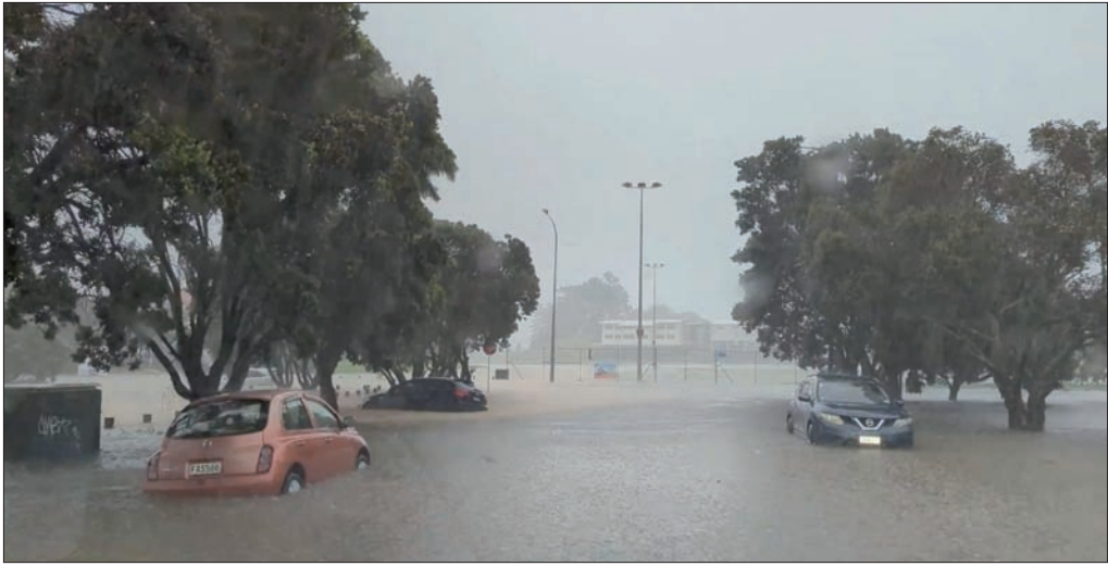
Cars are submerged in a flooded street in Auckland.