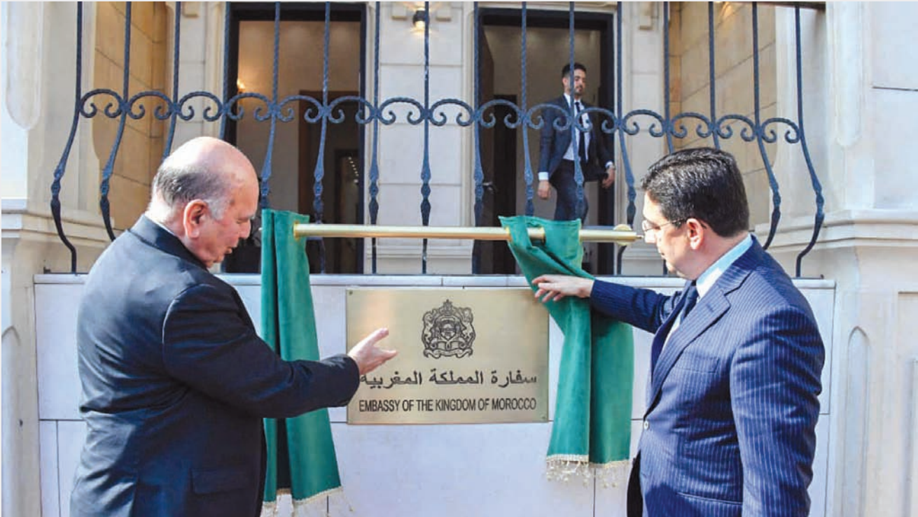
A handout picture released by Iraq's Foreign Ministry yesterday, shows Iraqi Foreign Minister Fuad Hussein (left) and his Moroccan counterpart Nasser Bourita during an inauguration ceremony reopening Rabat's embassy in Baghdad after 18 years of closure.