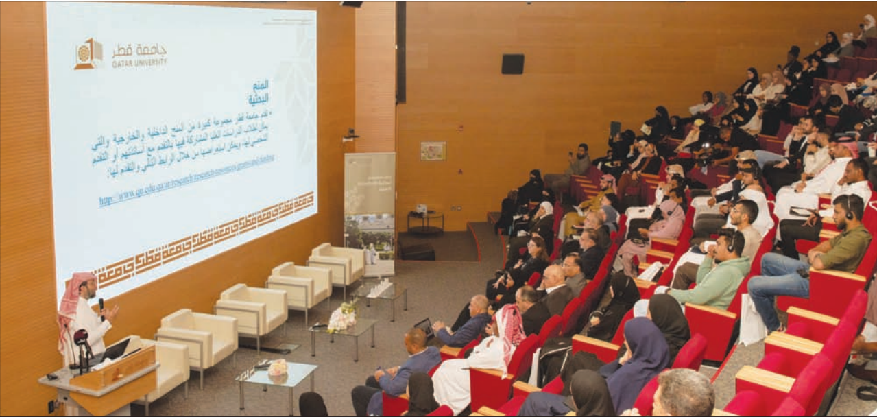
Snapshots from the QU introductory meeting yesterday for postgraduate students (Spring 2023).