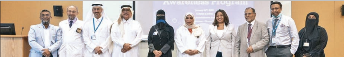
The HMC's lipedema programme leaders.

QatarDebate aims to bring together speakers to debate in Arabic regardless of their mother tongues, promoting dialogue and constructive discussions.