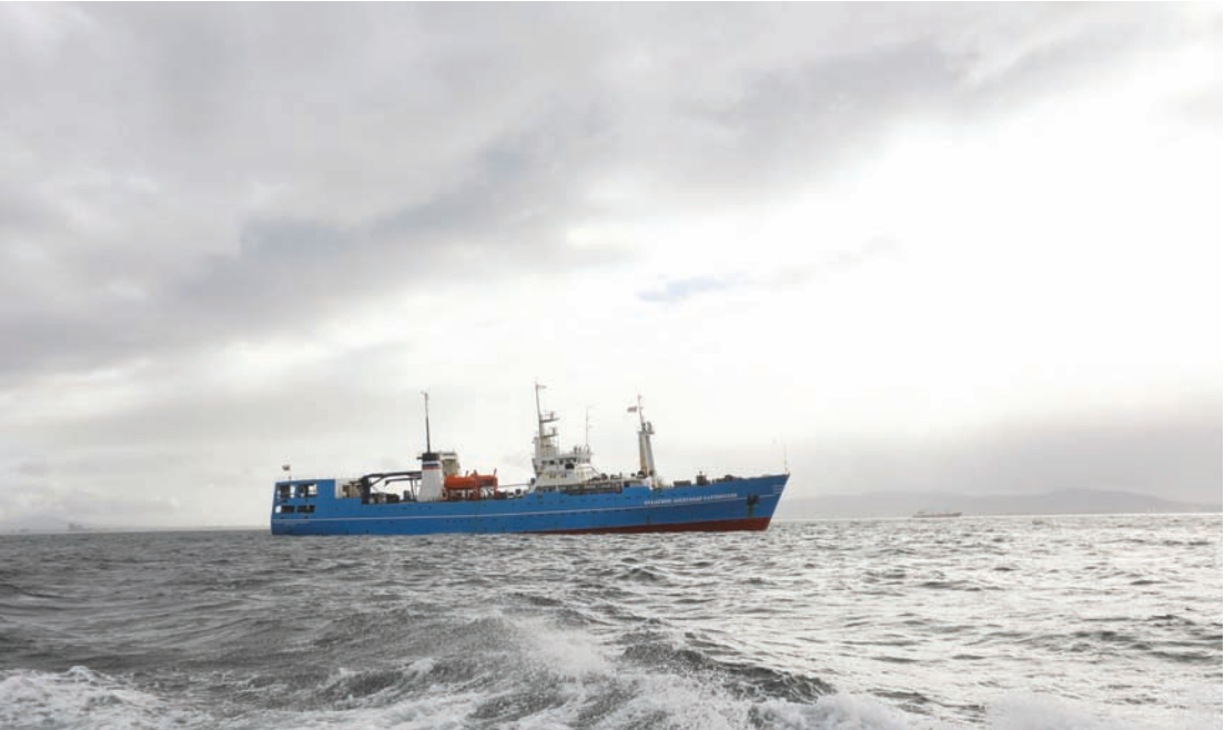
The Akademik Alexander Karpinsky, a Russian polar explorer ship, arrives in Cape Town harbour, South Africa.