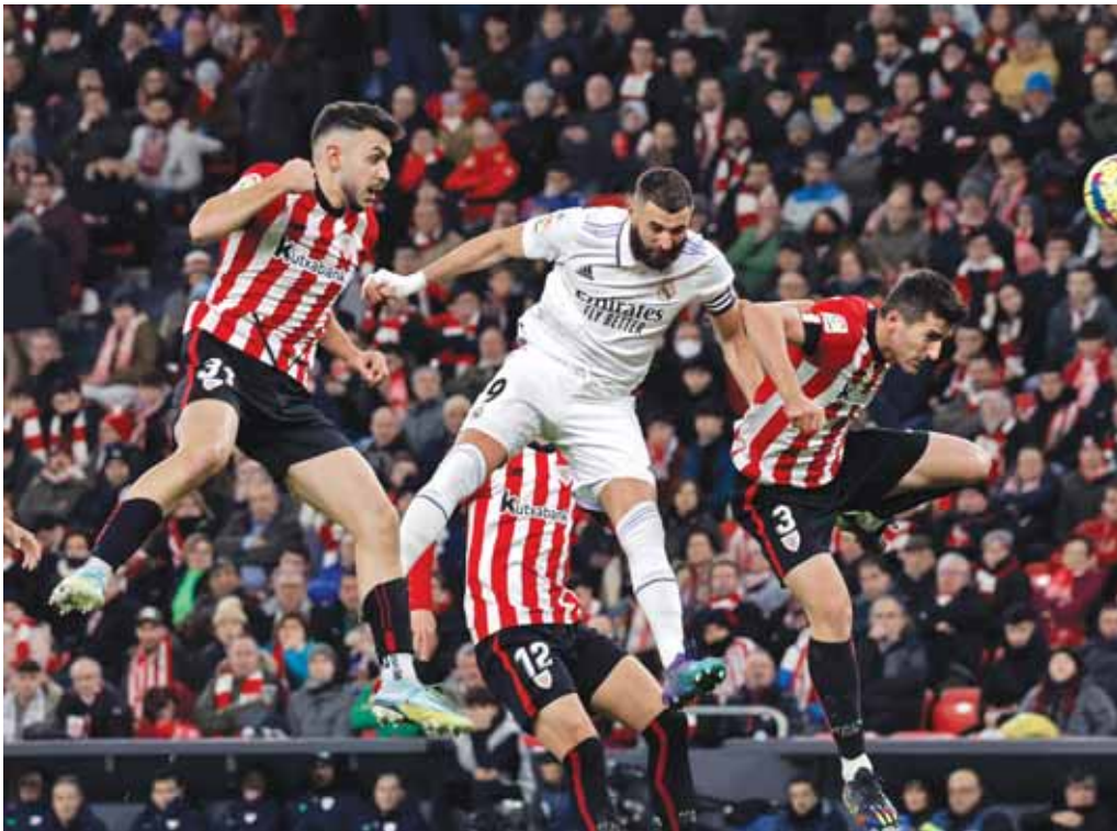
Real Madrid's Karim Benzema (centre) goes for the header with Athletic Bilbao's Dani Vivian (left) and Aitor Paredes during the La Liga match in Bilbao, Spain, on Sunday.

Dani Ceballos, Nacho Fernandez and Marco Asensio also started after their fine performances against Villarreal. Athletic started well but Benzema volleyed Madrid ahead from Asensio's header back in his direction. It was Benzema's 228th La Liga goal, pulling him level with the iconic Raul Gonzalez as Madrid's