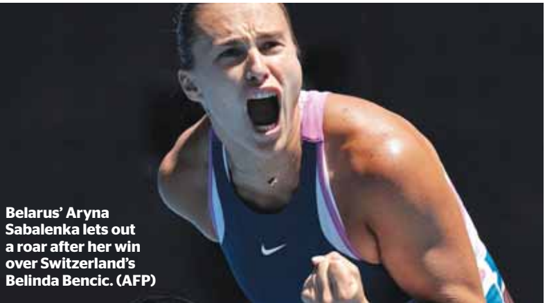
Belarus' Aryna Sabalenka lets out a roar after her win over Switzerland's Belinda Bencic.

Men: Karen Khachanov (RUS x18) v Sebastian Korda (USA x29); Stefanos Tsitsipas (GRE x3) v Jiri Lehecka (CZE); Andrey Rublev (RUS x5) v Novak Djokovic (SRB x4); Ben Shelton (USA) v Tommy Paul (USA) Women: Elena Rybakina (KAZ x22) v Jelena Ostapenko (LAT x17); Jessica Pegula (USA x3) v Victoria Azarenka (BLR x24); Karolina Pliskova (CZE x30) v Magda Linette (POL); Aryna Sabalenka (BLR x5) v Donna Vekic (CRO)