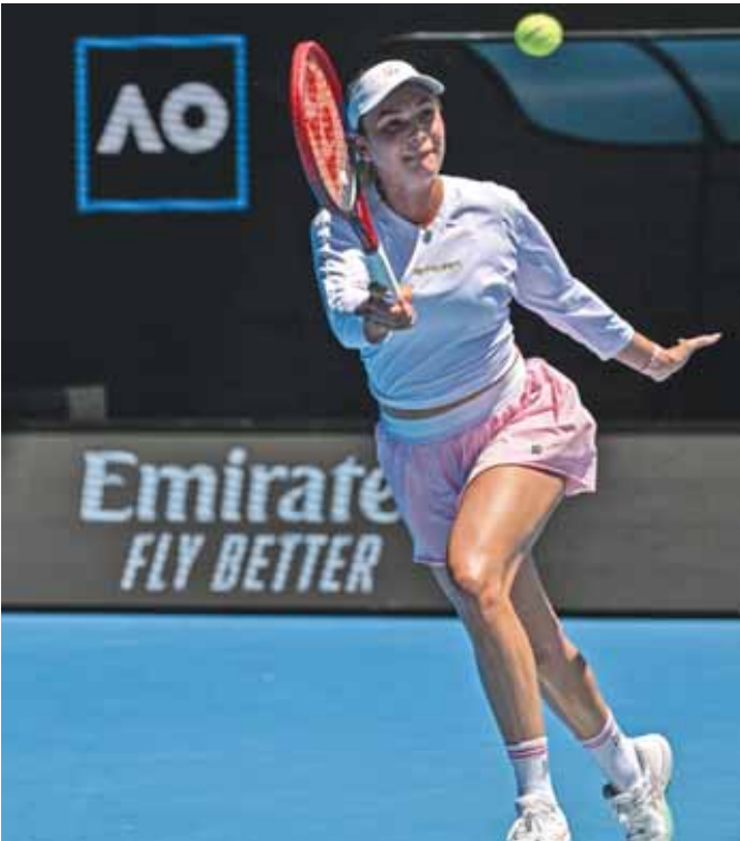
Croatia's Donna Vekic hits a return during her match against Czech Republic's Linda Fruhvirtova at the Australian Open.

The last-16 match was uncharted territory for the Czech Republic's Fruhvirtova, the youngest player left in the draw.