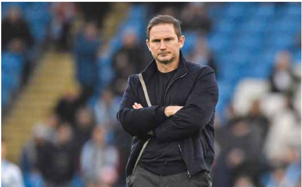
In this file photo taken on December 31, 2022 Everton's English manager Frank Lampard watches his players warm up ahead of the English Premier League match against Manchester City at the Etihad Stadium in Manchester, north west England. Relegation-threatened Everton have sacked Lampard after less than a year in charge at the Goodison Park club, British media reported yesterday.

Lampard took Chelsea into the Champions League during his one full season as manager at Stamford Bridge, but was dismissed in January 2021 with the Blues in ninth place in the Premier League.